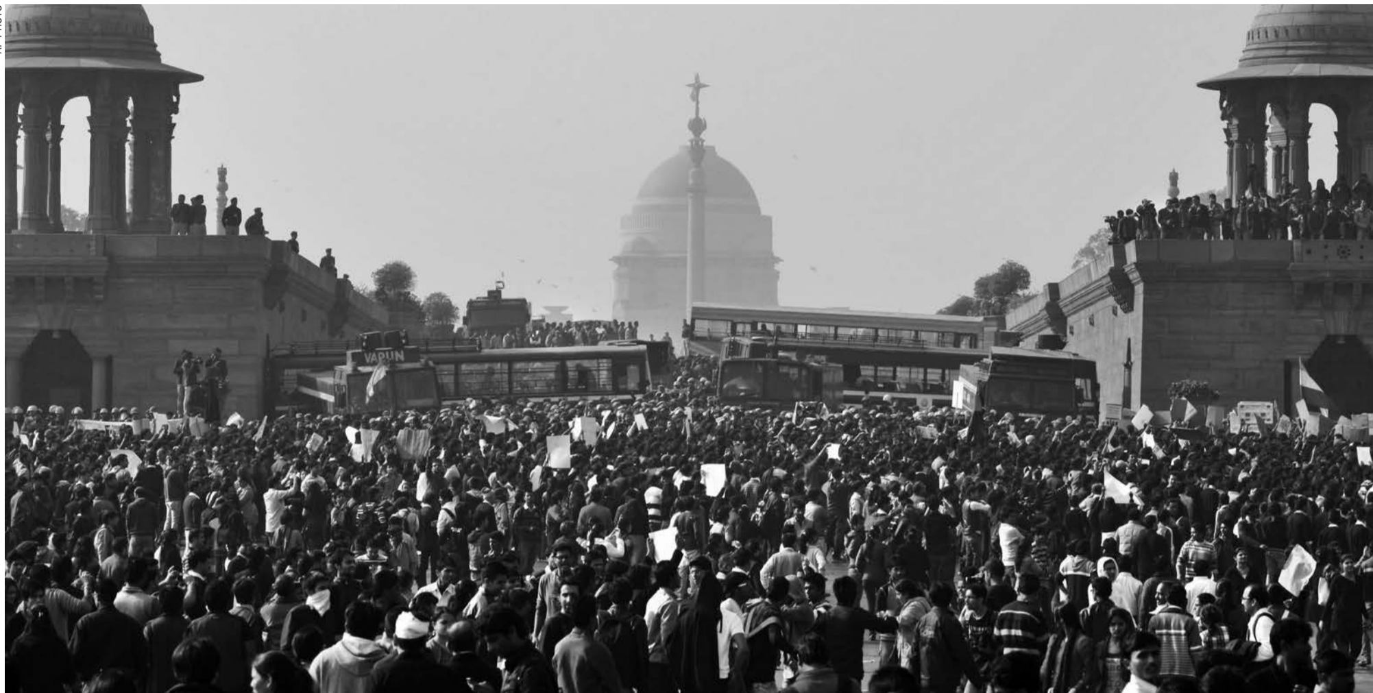
In this Dec. 22, 2012 file photo, protesters gather outside the Indian Presidential Palace during a protest against the brutal gang rape of a 23-year-old woman on a moving bus in New Delhi