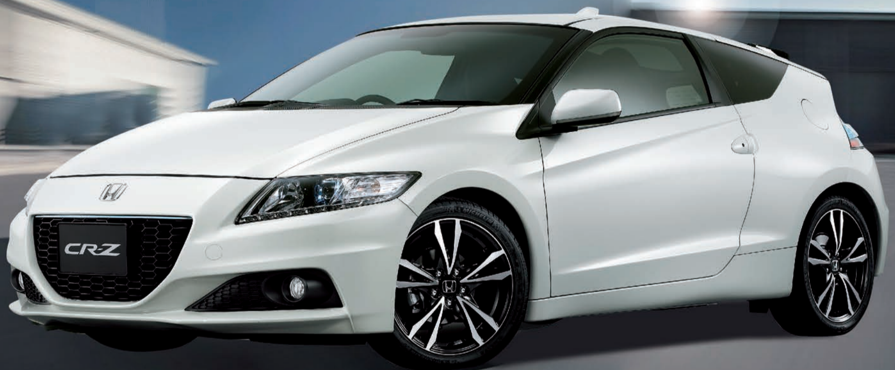
Wide performance xenon Lamphead