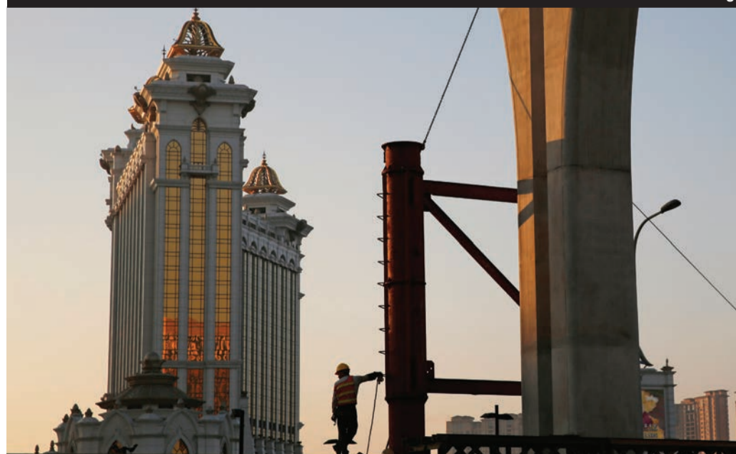
A worker takes rest at the construction site of the Galaxy Macau casino resort