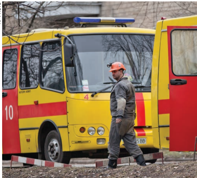
A miner stands outside after an explosion at the Zasyadko coal mine in Donetsk