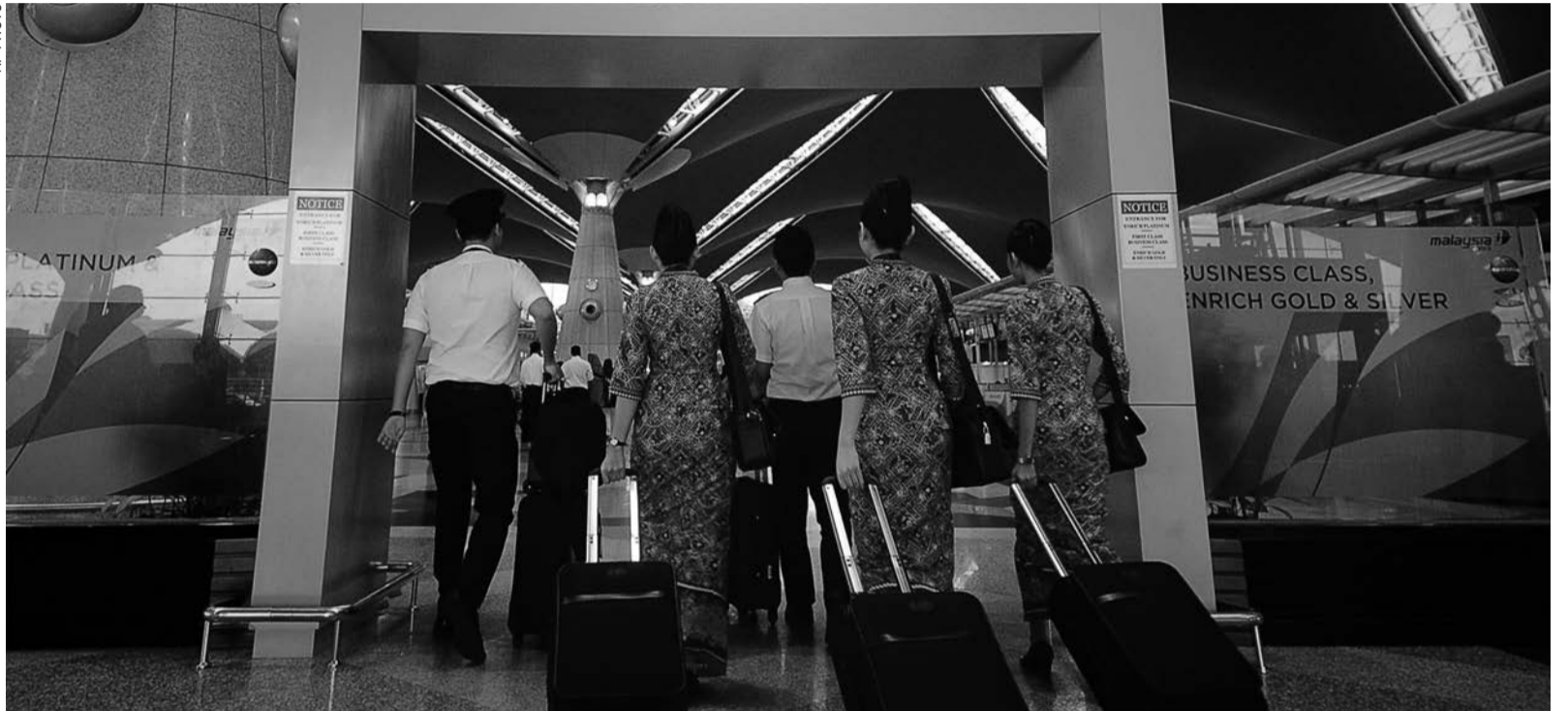
Malaysia Airlines crew walk into a check in area at Kuala Lumpur International Airport in Sepang, Malaysia

mode as he outlined his plans to remorselessly fix Aer Lingus.