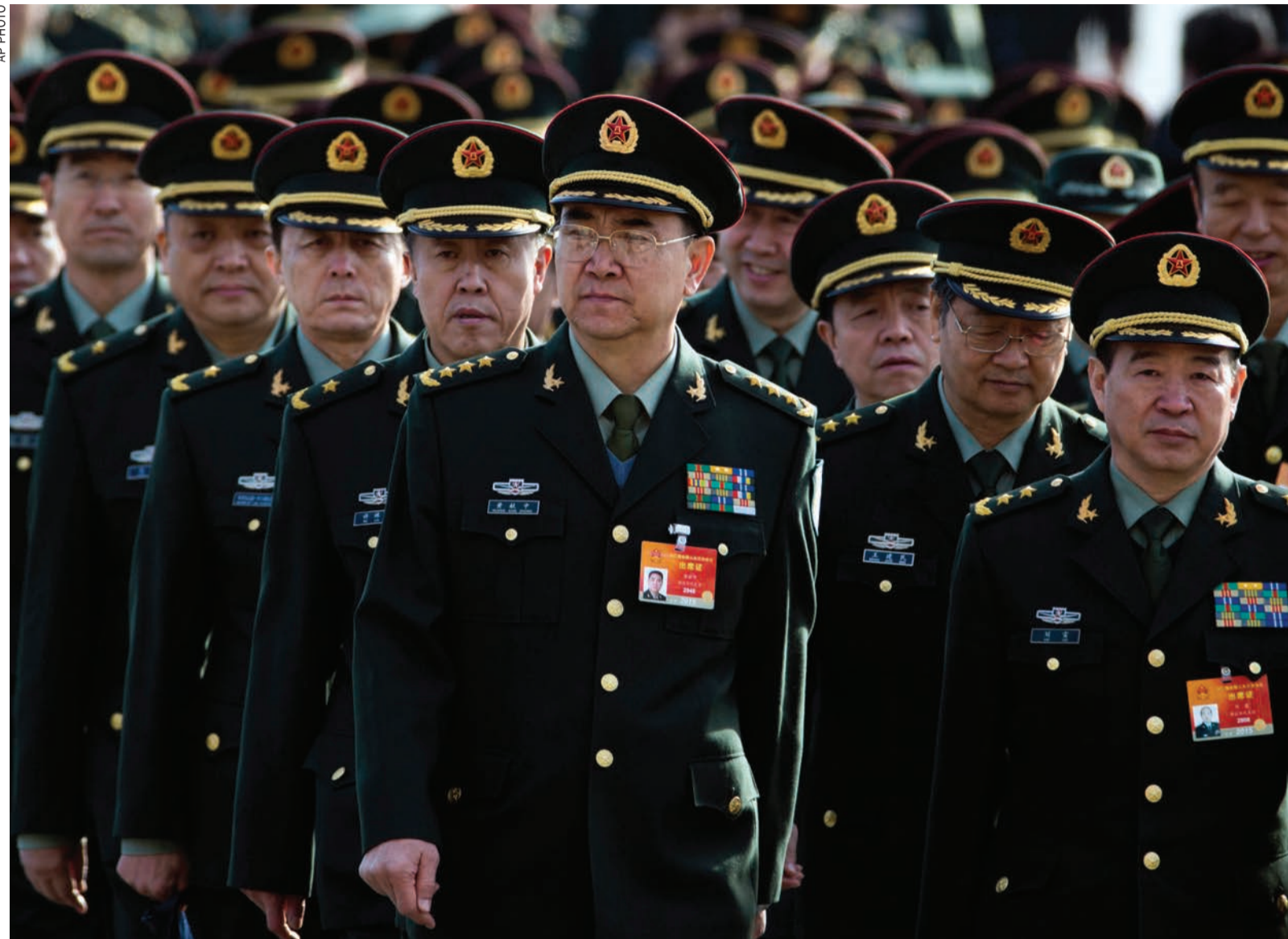
Chinese military officers arrive at the Great Hall of the People in Beijing

with big increases for its navy and air force. New Delhi has expressed concern not only about the disputed land border, but also about the Chinese navy's growing presence in the Indian Ocean.