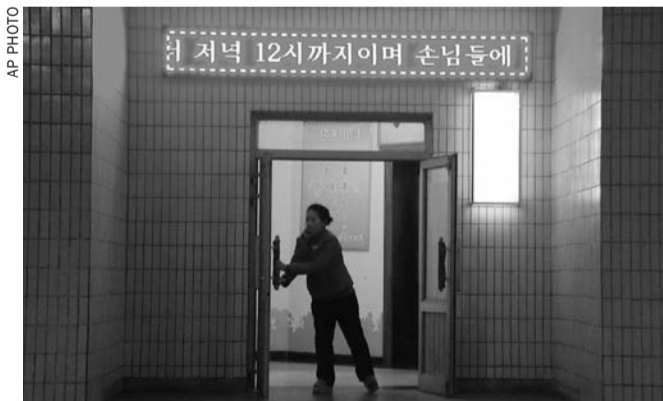
A shop employee opens a door to the Changjon Street branch of the Hwanggumbol shop before 6am, at the start of business in Pyongyang

of state-owned stores is now fine-tuning their business strategy to actually give consumers what they need.