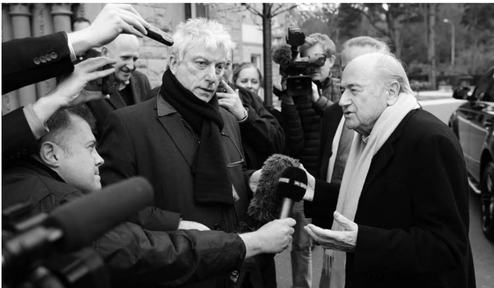
President of FIFA Sepp Blatter speaks to the media