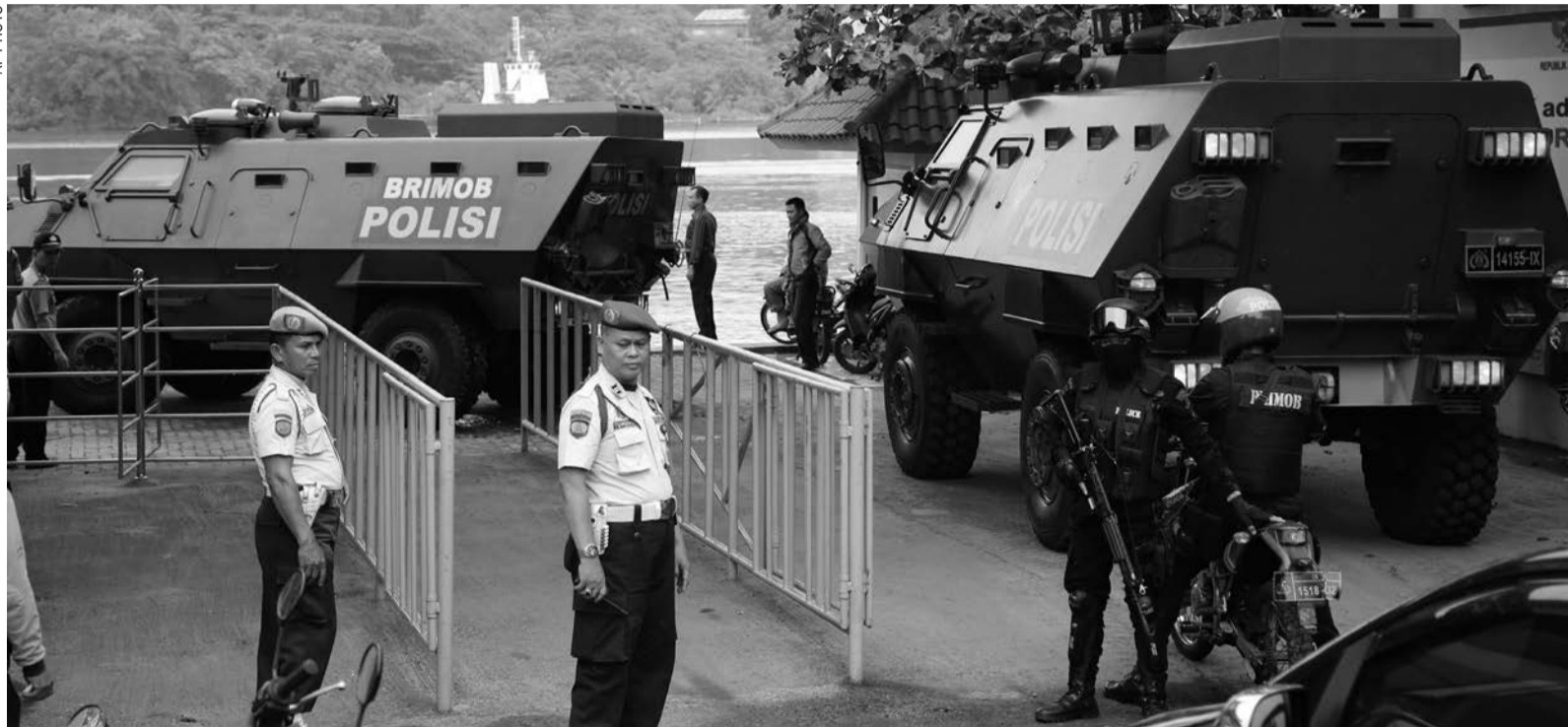
Indonesian police armored vehicles carrying two Australian prisoners arrive at Wijaya Pura port in Cilacap, Central Java