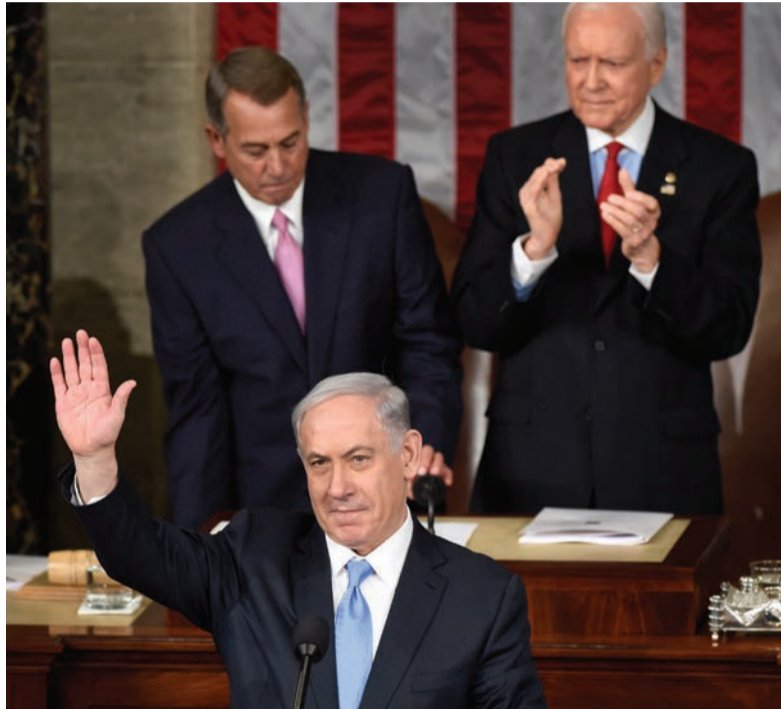
Israeli Prime Minister Benjamin Netanyahu waves as he speaks before a joint meeting of Congress on Capitol Hill in Washington

"There was nothing new" in the speech, Obama said. He said Netanyahu made almost the same speech when he warned against the interim deal reached with Iran, but that the interim deal has resulted in a freeze and rolling back of Iran's nuclear program.