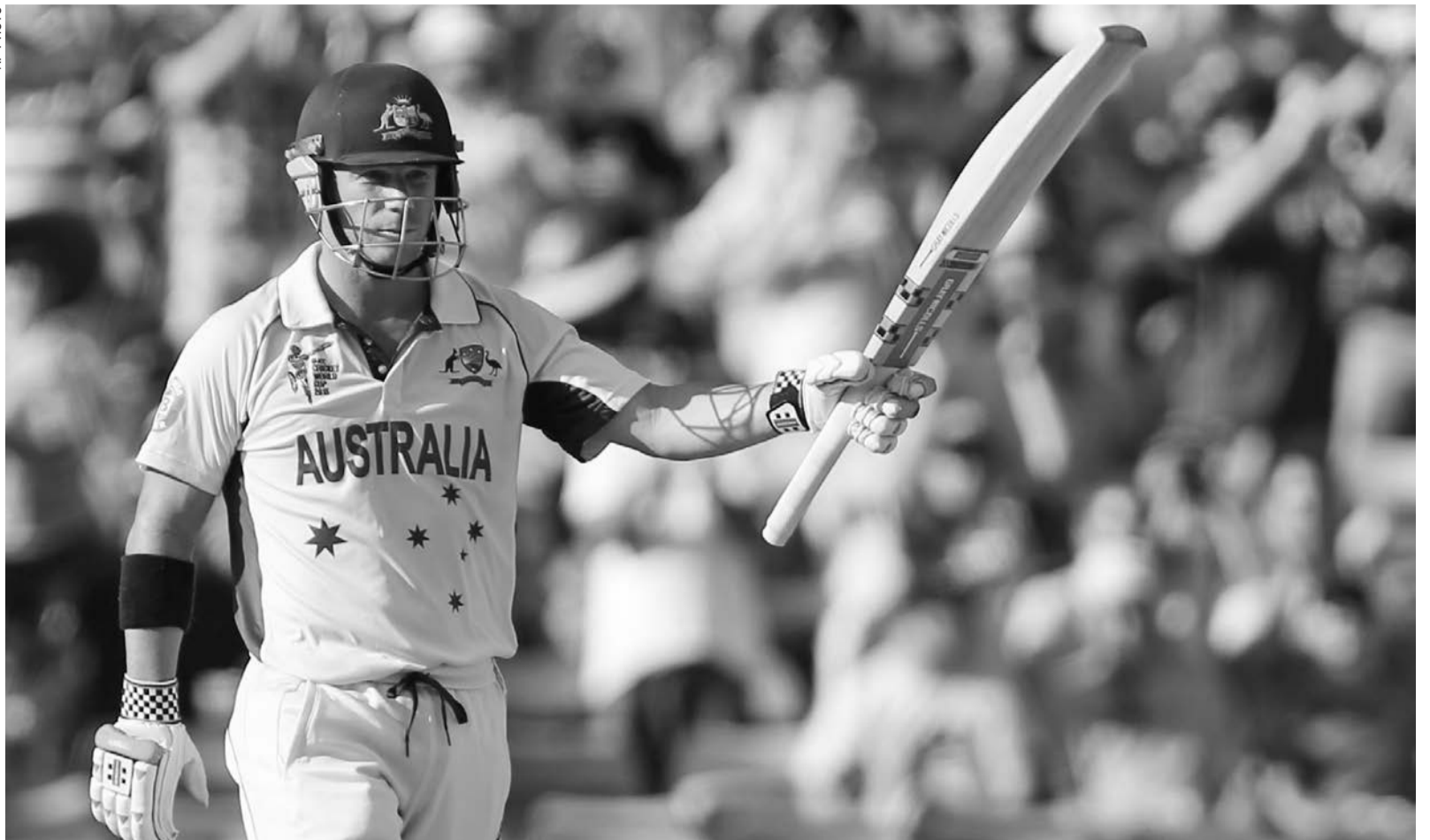
Australia's David Warner celebrates after scoring 150 runs during their Cricket World Cup Pool A match against Afghanistan