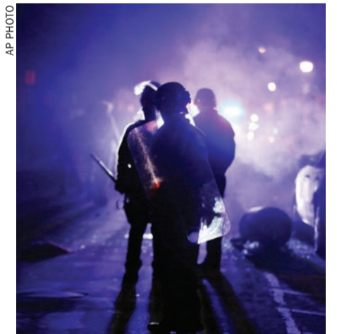
In this Nov. 25, 2014 file photo, police officers watch protesters as smoke fills the streets in Ferguson, Mo. after a grand jury's decision in the fatal shooting of Michael Brown