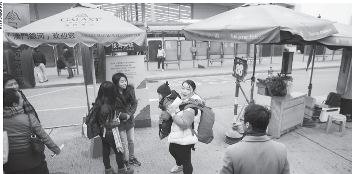
Passengers wait for shuttle buses outside the ferry terminal

Gross gaming revenue in the world's biggest gambling hub fell 49 percent to 19.5 billion patacas (USD2.4 billion) last month, Macau's Gaming Ins-