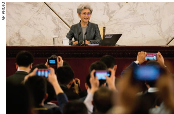
Fu Ying, spokeswoman for the National People's Congress, arrives for a press conference in the Great Hall of the People in Beijing

official said on condition of anonymity because he was not authorized to discuss the matter publicly. It is unusual to have four Cabinet officials weigh in on a China trade issue and underscores the seriousness of the concern in Washington, he said.