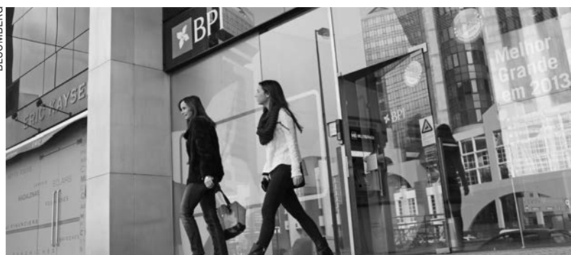
Customers exit a Banco BPI SA bank branch in Lisbon, Portugal

The possibility of an agreement to that effect is considered high, according to the Africa Intelligence Monitor, and the plan is further down the line to merge BFA, in which Santos has had a