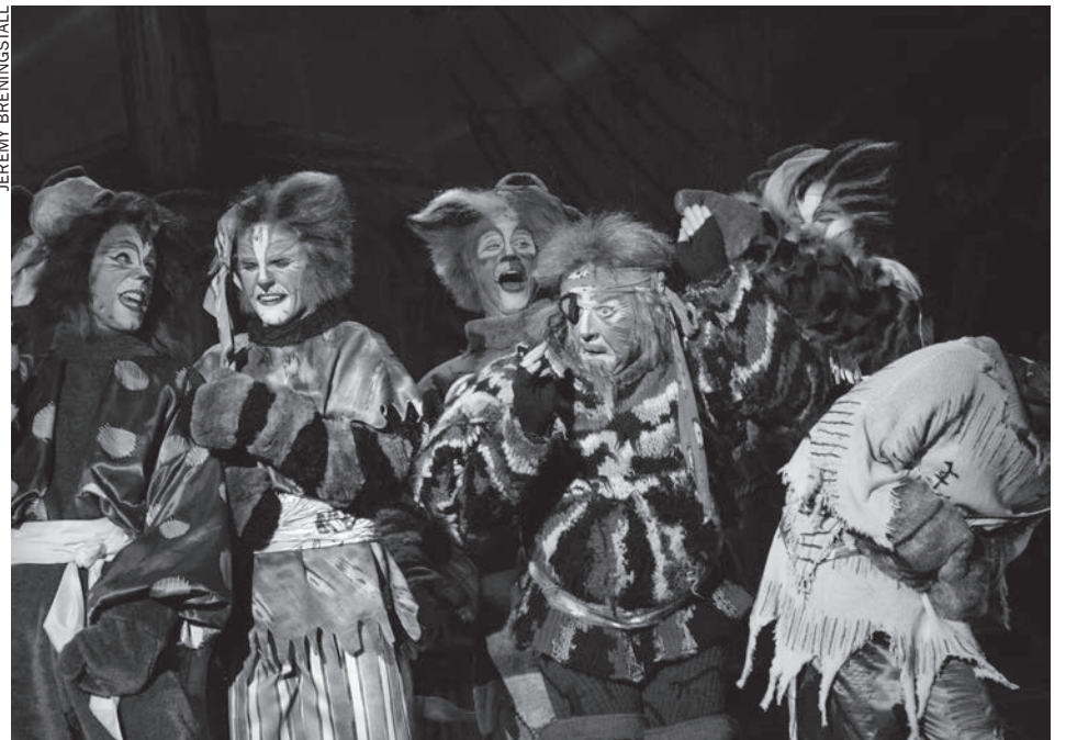
The cast of Cats

mes even performers, to engage with the local community.