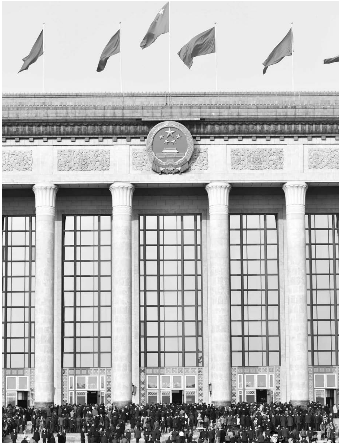
Deputies to the 12th National People's Congress (NPC) arrive at the Great Hall of the People in Beijing

business environment" and look forward to the promised streamlining in regulation.