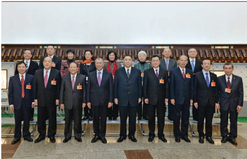
Chui Sai On poses for a group photo with Macau's deputies to the NPC in Beijing yesterday