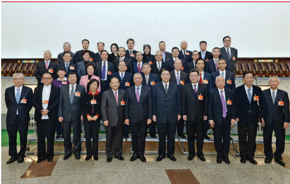
The CE with local members of the National Committee of the CPPCC