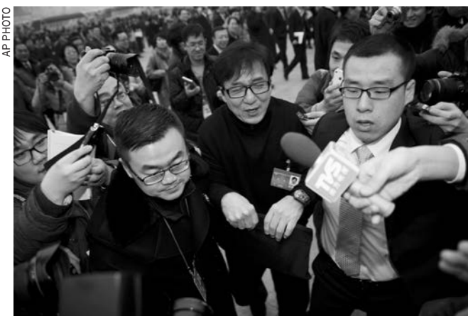
In this March 3, 2014 file photo, Hong Kong movie star Jackie Chan, center, is escorted by officials as he is surrounded by journalists upon arrival at the Great Hall of the People to attend the opening session of the Chinese People's Political Consultative Conference (CPPCC)

to a legislative advisory panel, has been singled out not only because of his celebrity status but for his reputation among many Chinese as someone who has been mercurial in aligning himself