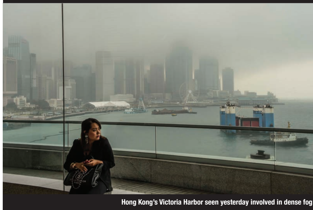
Hong Kong's Victoria Harbor seen yesterday involved in dense fog