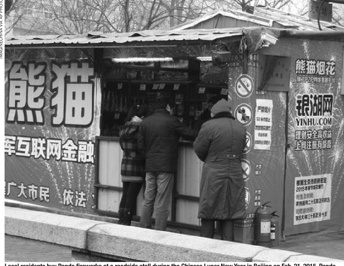
Local residents buy Panda fireworks at a roadside stall during the Chinese Lunar New Year in Beijing on Feb. 21, 2015. Panda plans to sell its fireworks business, it said in an April 1 filing.