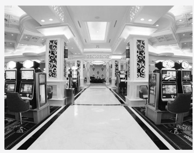
The Ho Tram Resort Casino Vietnam, Asia's only beachfront integrated resort, yester day announced the opening of its cash game poker room tomorrow, in conjunction with

poker operations partners World Gaming Group Limited (WGG).