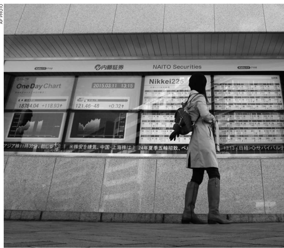
A passerby looks at Japan's Nikkei stock prices displayed on an electronic board in Tokyo