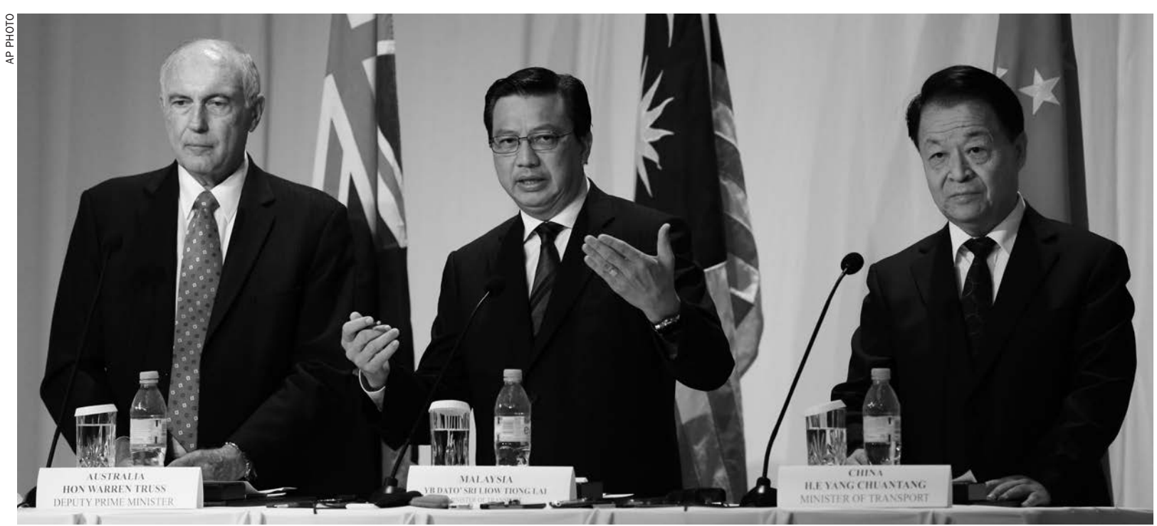
Malaysian Transport Minister Liow Tiong Lai, center, speaks as Australian Deputy Prime Minister Warren Truss, left, and Chinese Minister of Transport Yang Chuantang listen during a press conference following their meeting in Kuala Lumpur