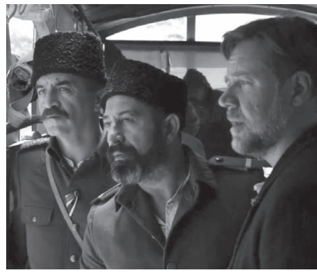
THE WATER DIVINER

гоом 3 2.00, 4.30, 7.30, 9.30 pm Director: Russell Crowe