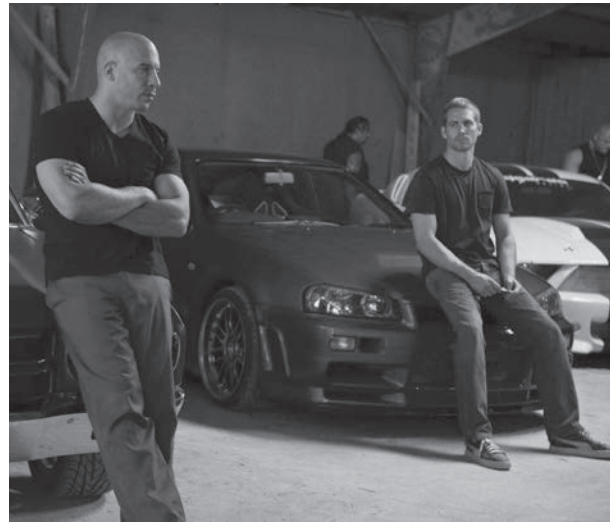
FAST AND FURIOUS 7