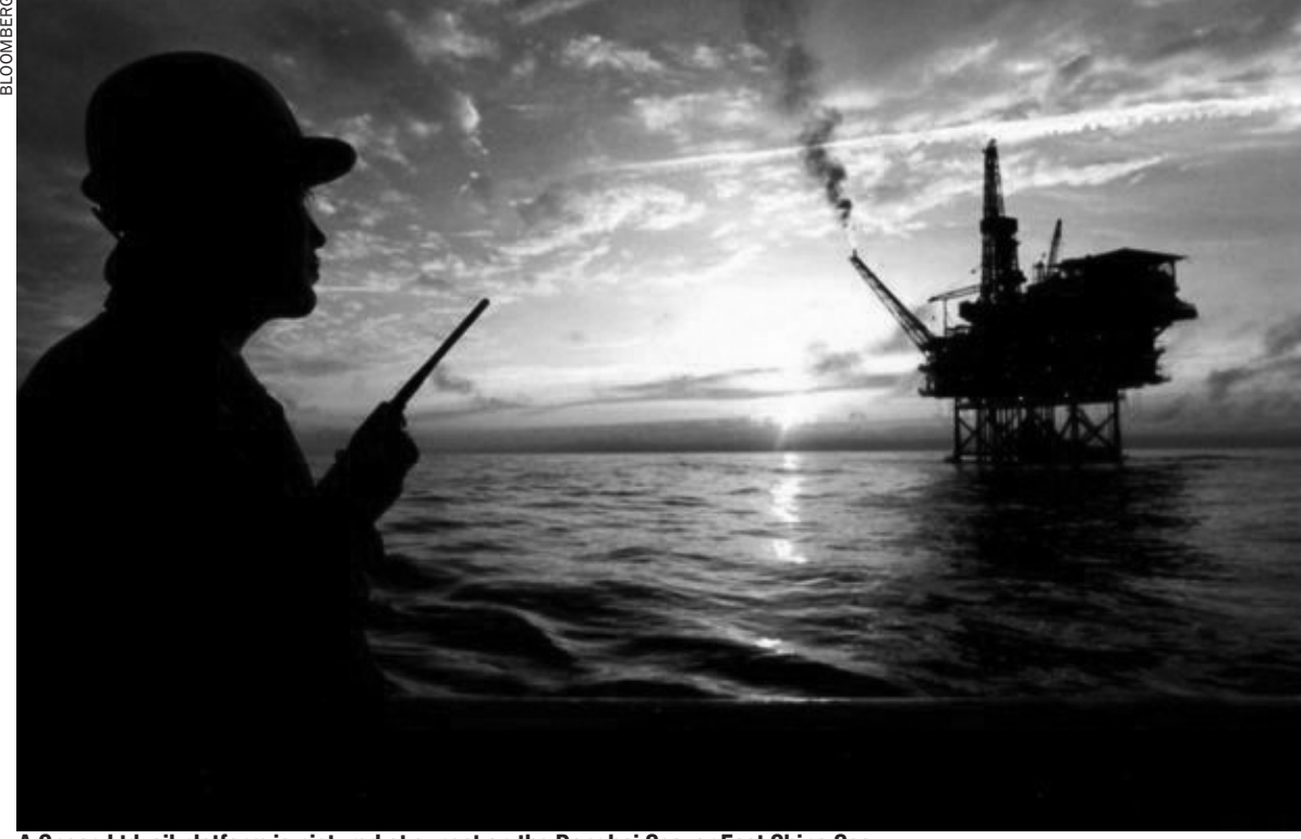
A Cnooc Ltd. oil platform is pictured at sunset on the Donghai Sea, or East China Sea

In the past year, China has conducted massive land reclamation at previously submerged reefs in the South Chi-