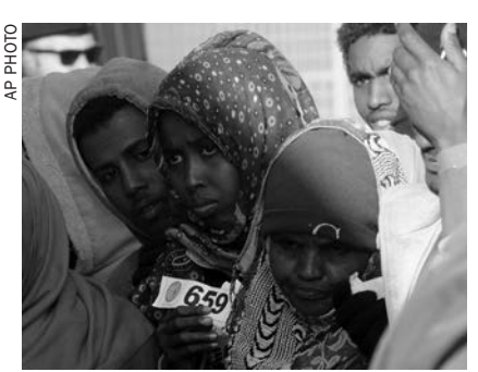
A rescued migrant holds a Forensic Police Regional Cabinet number after disembarking from an Italian Coast Guard ship in Palermo, Sicily

European Union nations are struggling to confront the challenge of the unprecedented numbers of migrants coming across the Mediterranean and have few answers to contain the humanitarian catastrophe highlighted by reports that 400 people drowned this week. Driven chiefly by poverty and conflict, some 10,000 migrants and asylum seekers have sought to sneak into the EU over just the past week and the European nations have no clear response ready. The spring crossing season will inflate those figures over the weeks to come, yet there are no emergency EU meetings planned or proposals ready to be implemented. The EU's top migration official, Dimitris Avramopoulos, warned this week that these tragic scenes are "unfortunately the new norm and we will need to adjust our responses accordingly."