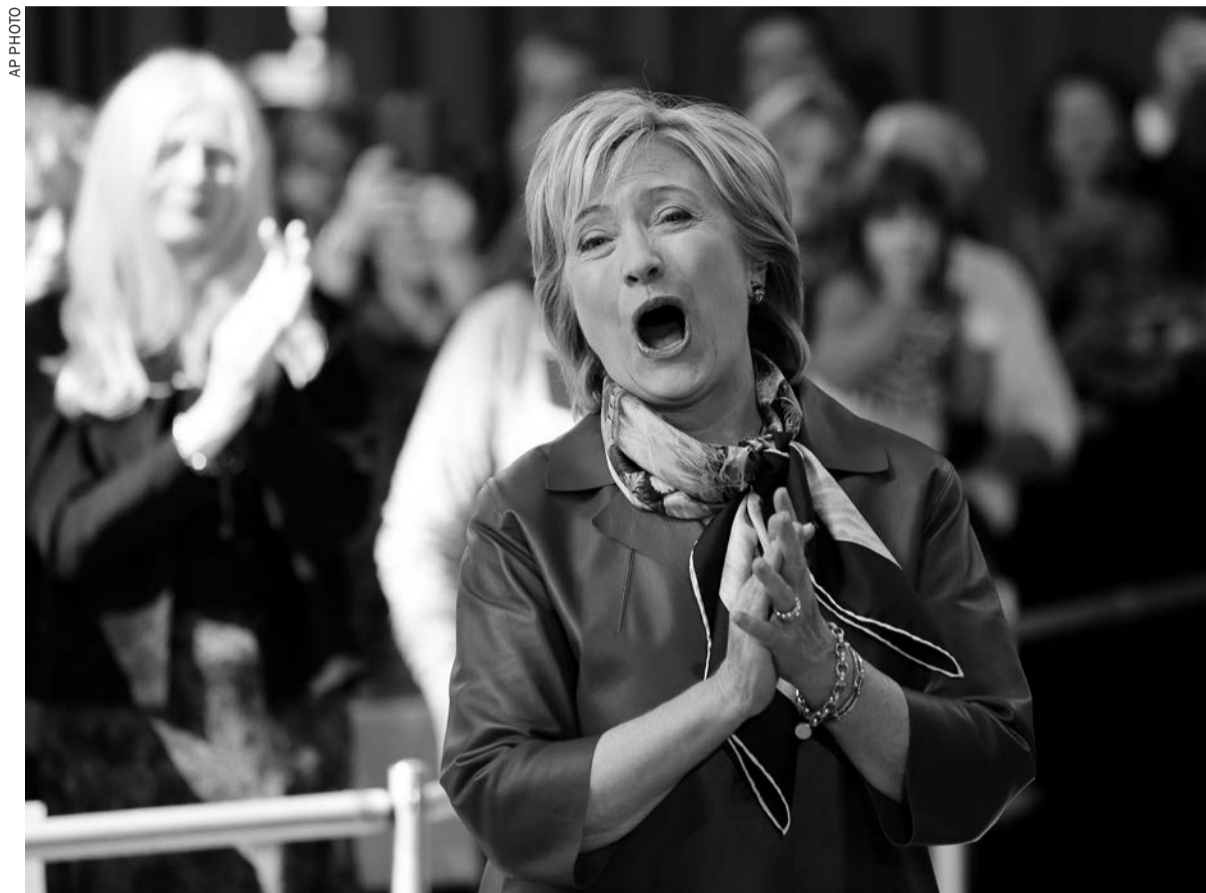
Democratic presidential candidate Hillary Rodham Clinton reacts to a supporter before speaking at a community forum

In the interview, Clinton said the agreement does not meet her standard for creating jobs, raising wages and protecting national security. She raised specific concerns about a potential for currency manipulation by China and provisions