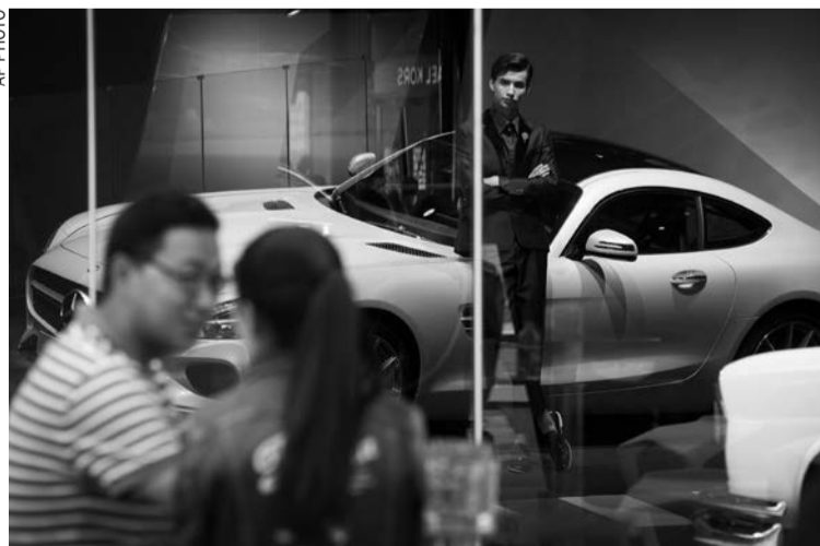
A Chinese couple chat as a model poses next to a Mercedes-Benz AMG GT S model on display during a promotional event at a shopping mall in Beijing

Beijing's shock move to devalue the tightly controlled yuan by more than 2 percent on Aug. 11 roiled global financial markets and fueled bets by currency traders that it