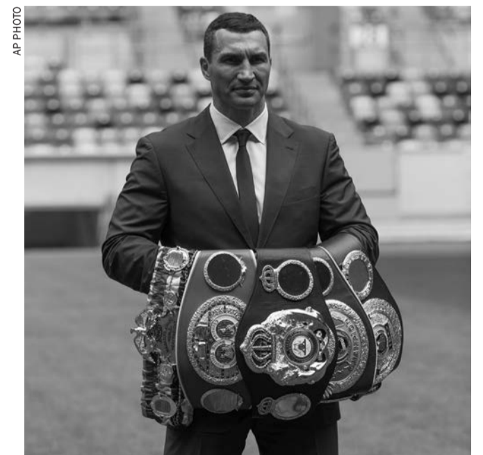
WBO, WBA, IBF and IBO heavyweight champion Wladimir Klitschko presents his championship belts during a news conference in Duesseldorf,

"Now I'm going to be a little bit cocky: It doesn't matter how long Wilder or somebody else, (Alexander) Povetkin, I don't know, who else could possibly hold this title," Klitschko said. "They're not going to be called the heavyweight champion. They need to go through me. I've been around for a long time, and you've got to respect that. I will work on it, and I hope it's