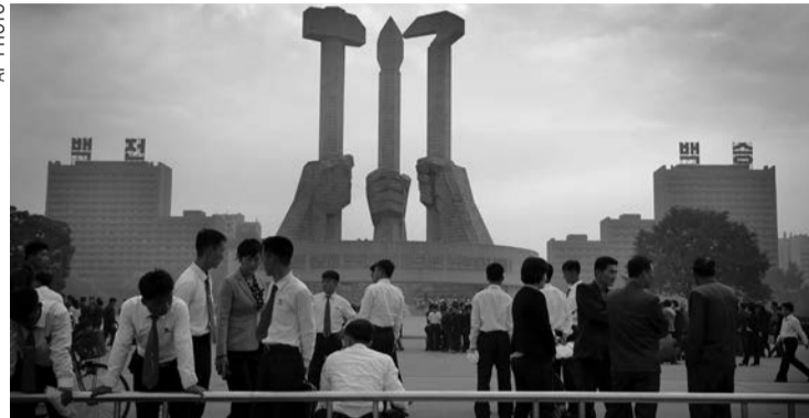
People gather in Pyongyang at a monument built 10 years ago to honor the founding of the Workers' Party of North Korea