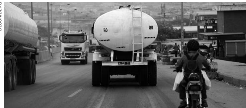
Oil tankers pass along the road towards the capital Luanda

from countries in the region from 475,000 barrels to 552,000 barrels, as did Taiwan. Angola is the main African oil supplier to China with exports of 806 million barrels in 2014.