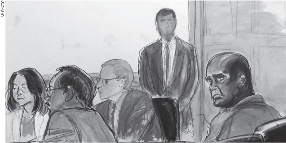
In this courtroom sketch, defendant John Ashe, right, sits in court during his arraignment on bribery charges in New York, Tuesday, Oct. 6