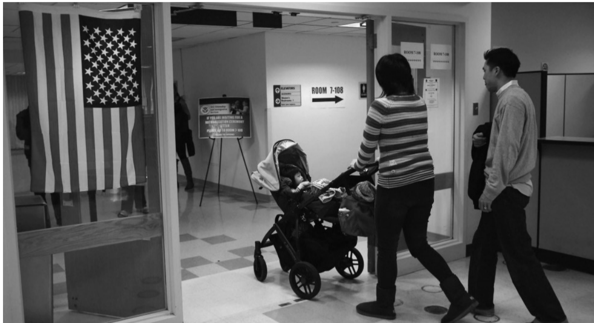
Immigration centre in New York