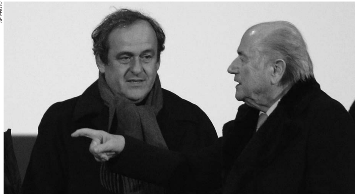
UEFA president Michel Platini (left) and FIFA president Sepp Blatter

The 69-year-old Cameroonian, who has a serious kidney illness that requires regular