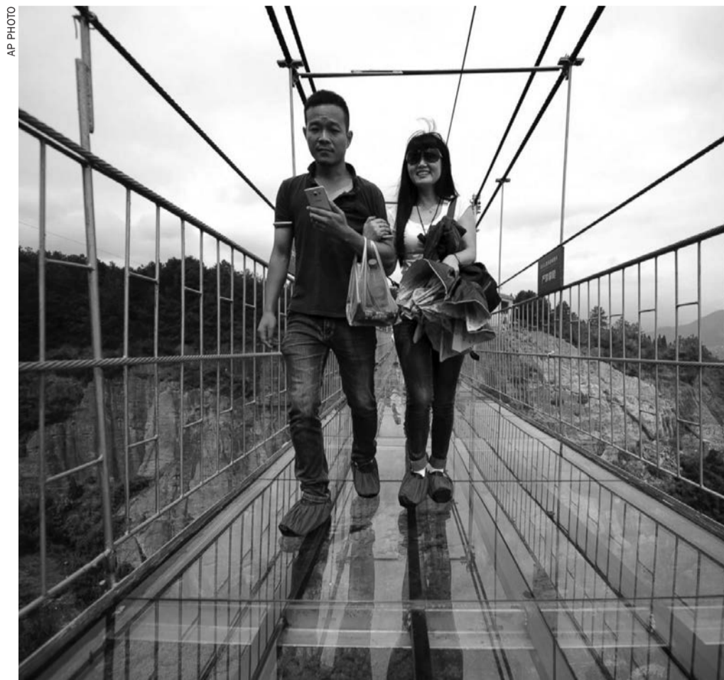
A couple walks across the suspension bridge wearing protective shoe coverings

The structure hugs a cliff side roughly 120 meters above a canyon in the remote mountain areas renowned for its