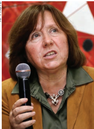
Belarusian journalist Svetlana Alexievich

Belarusian writer Svetlana Alexievich won the Nobel Prize in literature yesterday for works that chronicled the great tragedies of the Soviet Union and those that followed in the wake of its 1991 collapse. Alexievich, the 14th woman to win the literature award since 1901, used her reporting skills to create literature chronicling World War II, the Soviet war in Afghanistan, the 1986 Chernobyl nuclear disaster and social problems like attempted suicides after the Soviet Union disintegrated.