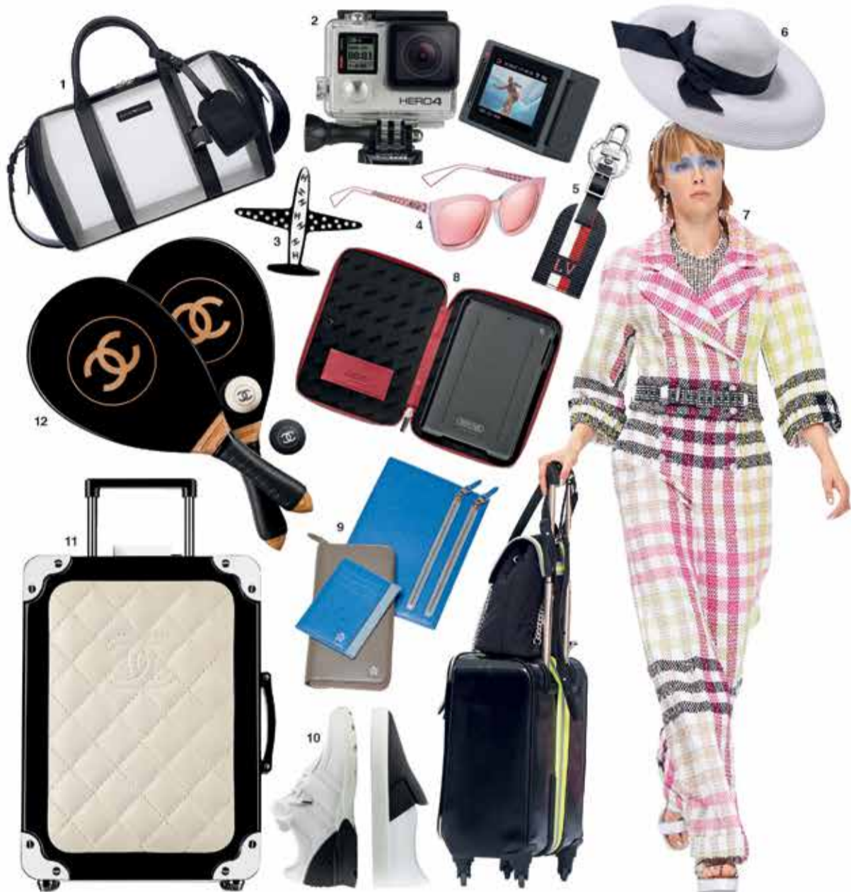
1. Emporio Armani Holdall 2. Image Digital GoPro camera 3. Chanel Brooch 4. Dior Sunglasses 5. Louis Vuitton Luggage tag 6. Club Monaco Sun hat 7. Chanel SS'16 runway look 8. Rimowa iPad case 9. Dunhill Wallets and pouch 10. Chanel Trainers 11. Chanel Luggage 12. Chanel Bats and balls

The holiday season is beckoning, and whether you are preparing for the trip of a lifetime or a serene staycation, Sands Shoppes has everything to make it a vacation to remember. From luxury luggage to designer beach games, Macao's premier duty-free shopping destination has it all and more.