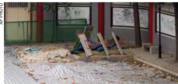
A tarp covers the ground after a running track suspected to be made from toxic material was removed from the Beijing No. 2 Experimental School

S CHOOLS across China have been ordered to remove running tracks made from toxic materials that have been blamed for sickening students, in the latest in a long line of product scandals blamed on corruption and weak oversight.