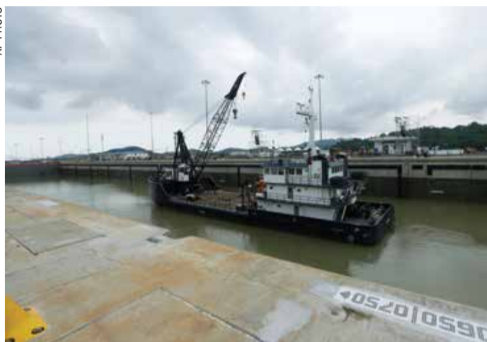
Panama Canal Authority crane ship Oceanus, navigates the Cocoli locks during a test of the newly expanded Panama Canal locks on Pacific side