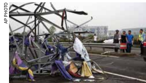
The remains of a steel tower are photographed in Funing County

rienced weeks of torrential rain and storms that have caused widespread flooding and dozens of casualties.