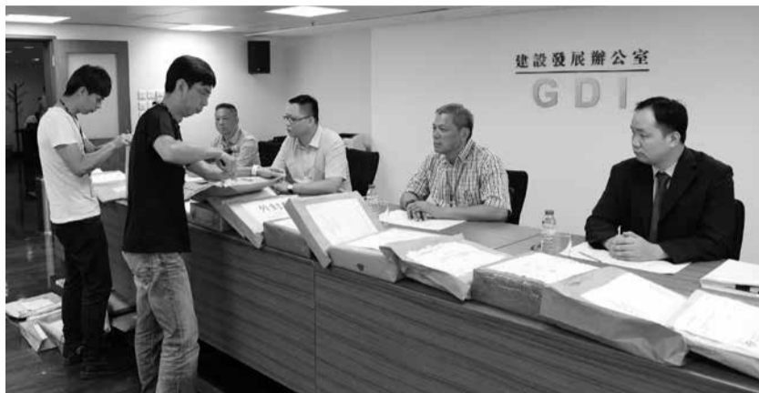
Representatives of the Infrastructure Development Office open tenders for a construction for the Islands District Medical Complex

The criteria for assessing the proposal are price; duration of the construction work; work plan; experience and quality of previous work; and integrity and honesty, which account for 60 percent, 3 percent, 10 percent, 15 percent and 12 percent respectively.