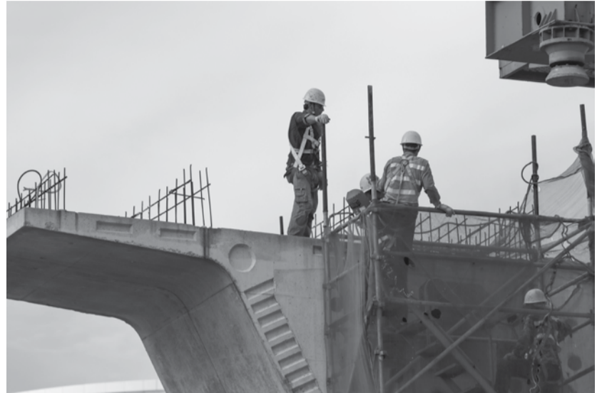
LRT construction works