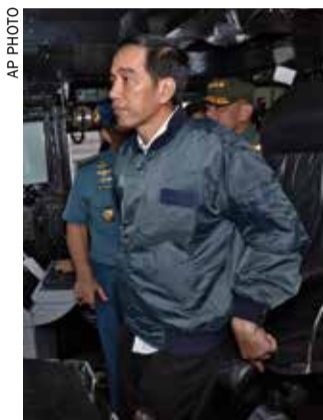
Indonesian President Joko Widodo stands on the bridge of navy warship KRI Imam Bonjol, as it sails on the waters of Natuna Islands

curity minister Luhut Binsar Pandjaitan said the visit would "send a clear message" that Indonesia is very serious about protecting its sovereignty.