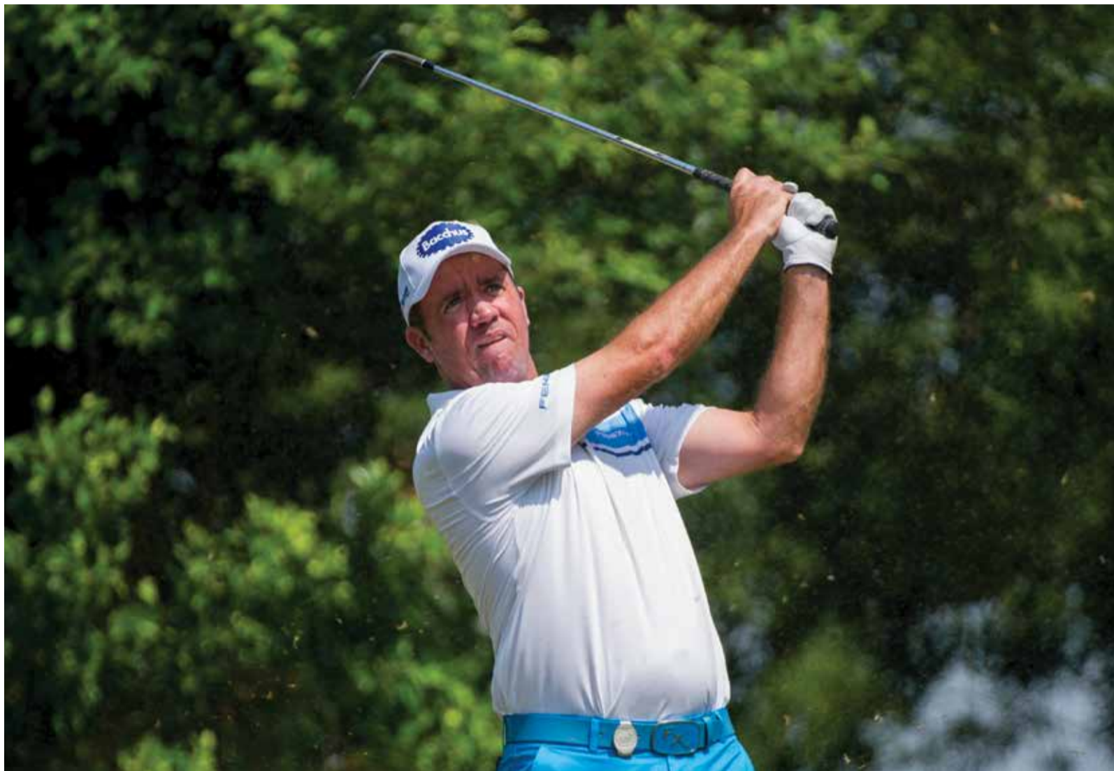
Scott Hend takes a swing during last year's tournament

This year, the 42-year-old golfer has an additional incentive, because his latest win at the Queen's Cup, played on Koh Samui in Thailand last weekend, has increased his chances of qualifying for one of the two available spots to represent Australia at the Summer Olympic Games. Both Adam Scott and Marc Leishman, ranked 8th and 37th respectively, have stepped-down, leaving Hend (currently 74th in the world) in place to join world number one Jason Day in the return of the sport to the games, which will take place in Rio de Janeiro,