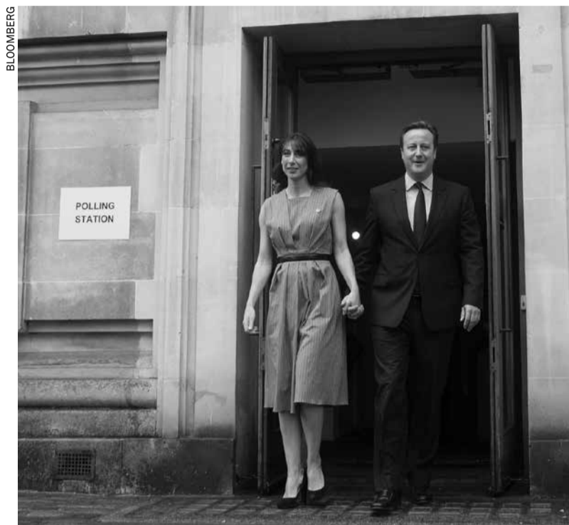
David Cameron votes in referendum

"Leave" campaigners claim that only a British exit can restore power to Parliament and control immigration. The "remain" campaign led by Prime Minister David Cameron argues that Britain is safer and richer inside the 28-nation EU.