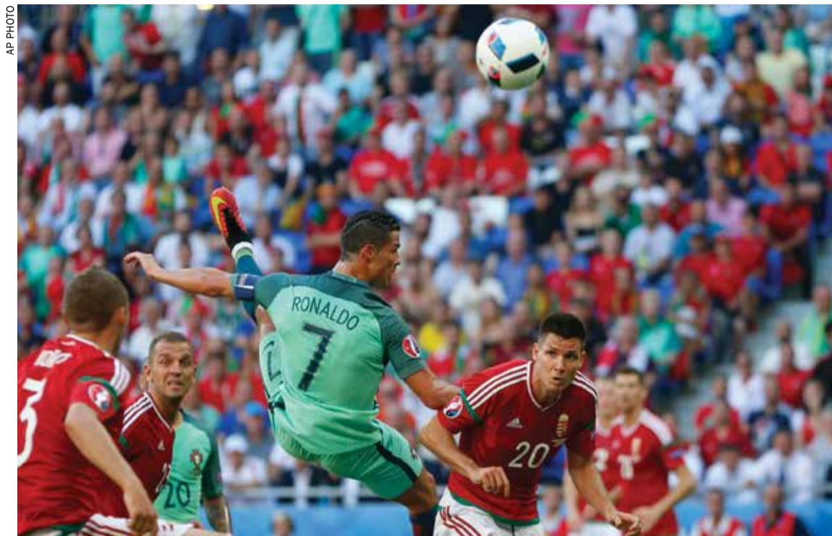
Portugal's Cristiano Ronaldo goes for the ball during the Euro 2016 Group F soccer match between Hungary and Portugal at the Grand Stade in Decines-Charpieu, near Lyon

But, whatever defensive deficiencies within the Portugal team, Ronaldo was going to