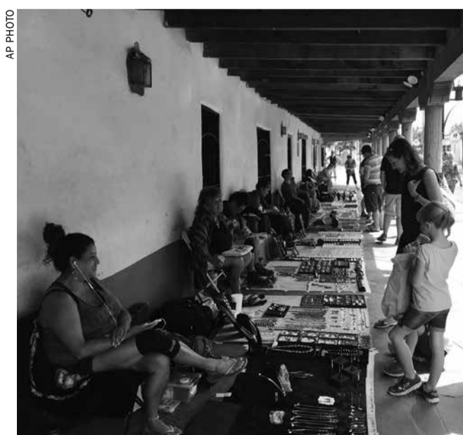
American Indian jewelers sell their artwork in the plaza of Albuquerque's Old Town, N.M. AP

In fact, the most diverse generation is the nation's youngest. Census figures show that of those born since 2000, nearly half — or 49 percent — belong to a race or ethnic group other than non-Hispanic white. In contrast, 44.5 percent of the millennials — born between 1982 and 2000 — did not classify themselves as non-Hispanic whites. AP