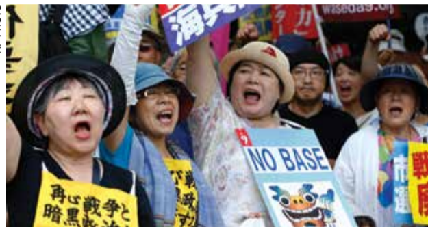
Protesters shout anti-U.S. military base slogans as they hold placards that read: "Get out U.S. Marines" during a rally in front of the National Diet building in Tokyo