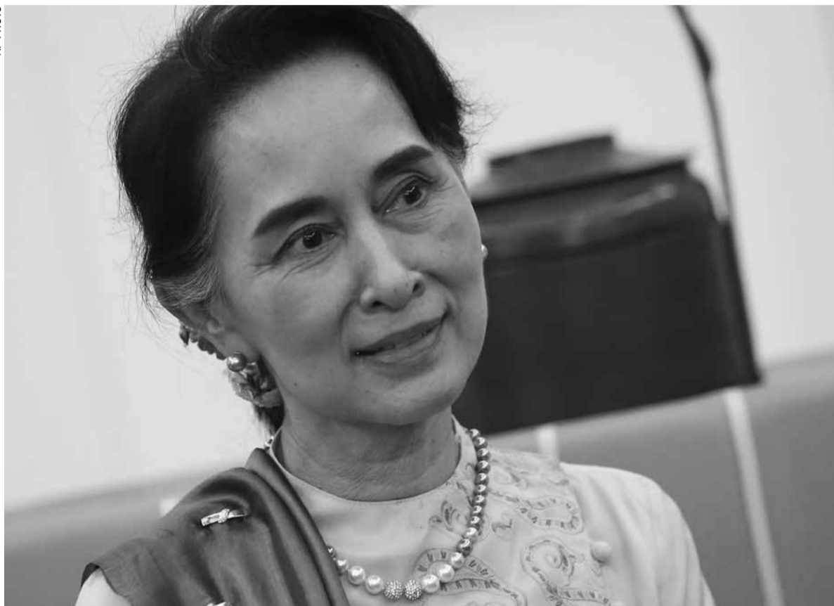
Myanmar's Foreign Minister and State Counselor Aung San Suu Kyi

A large crowd of several thousand waiting outside burst into cheers and song as she was leaving, after staying for the duration of her 45-minute meeting even as a heavy rain poured down on them.