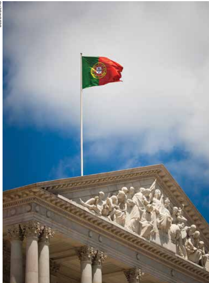
A Portuguese national flag flies above the parliament building in Lisbon

C HINA'S ambassador to Portugal said in Lisbon that the Portuguese government is waiting for Chinese companies to get involved in the country's energy, services, financial, insurance, medical, health, maritime business, agricultural and infrastructure sectors.