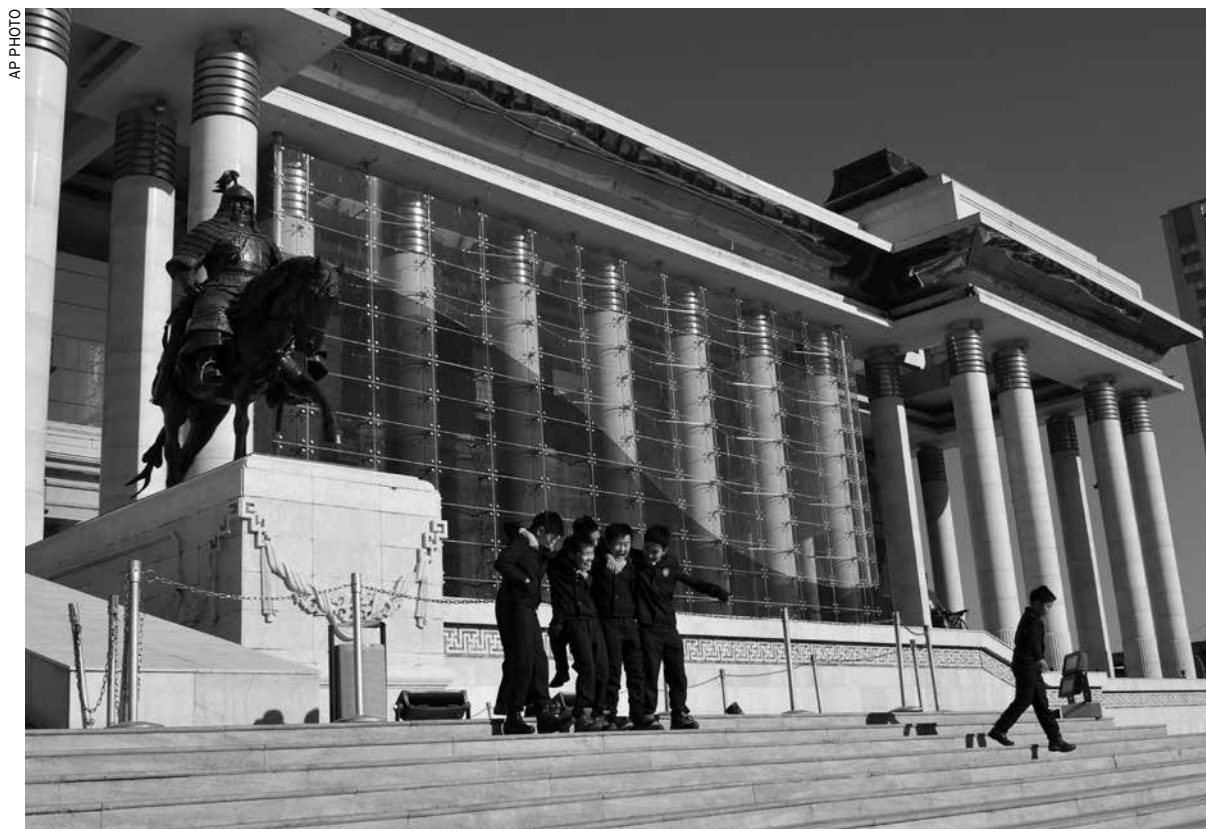
Mongolian children play near a statue of a Mongolian warrior on horseback in front of the Mongolian Parliament House in Ulaanbaatar

Both the ruling Democratic Party and its main rival have campaigned on the promise of more jobs.