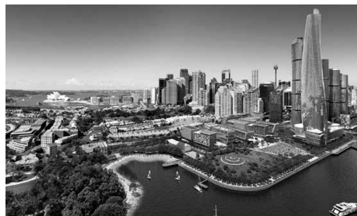
Artist's impression of the project

Crown's partly-owned project Studio City has been among the underperformers this year, in spite of hopes that the entertainment-focused resort would mark a new era for Macau. Packer sold down his stake in the partnership last month. DB