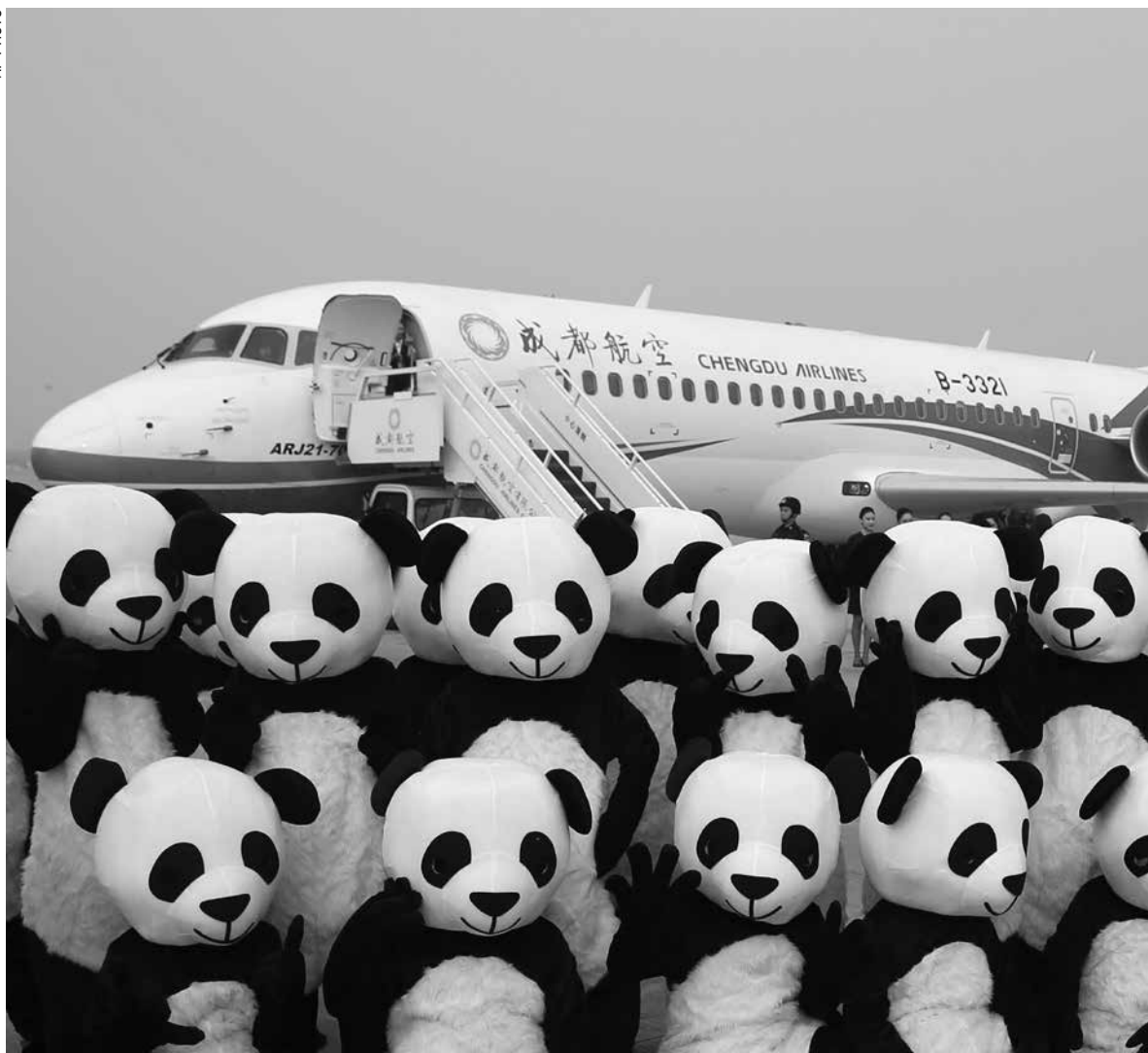
People in panda costumes pose in front of a Chengdu Airlines ARJ21-700 plane before its first commercial flight at Chengdu Shuangliu International Airport