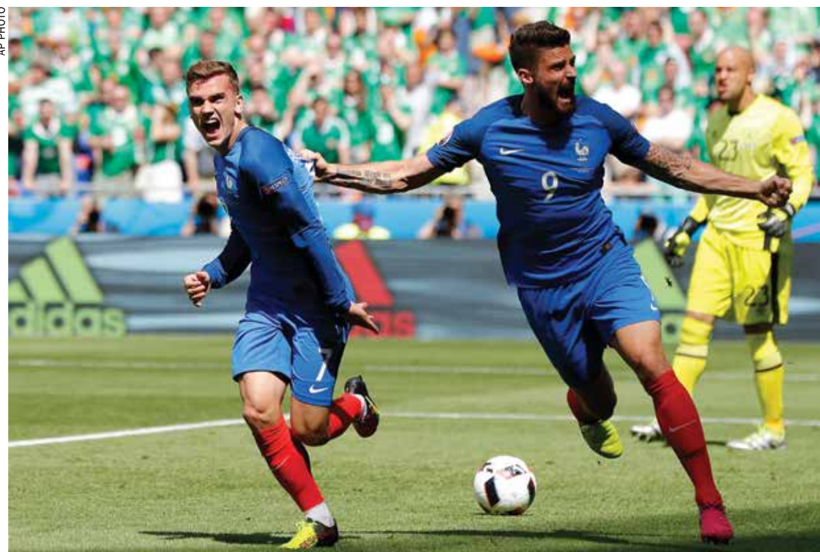
France's Antoine Griezmann (left) celebrates with his teammate Olivier Giroud after scoring his side's first goal, during the Euro 2016 round of 16 soccer match between France and Ireland

Although France crushed Brazil 3-0 in the 1998 World Cup