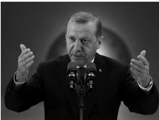
Recep Tayyip Erdogan

to take more than one step to meet each other," Peskov said. "One shouldn't think that everything will be mended overnight. We will keep up our work in that direction."