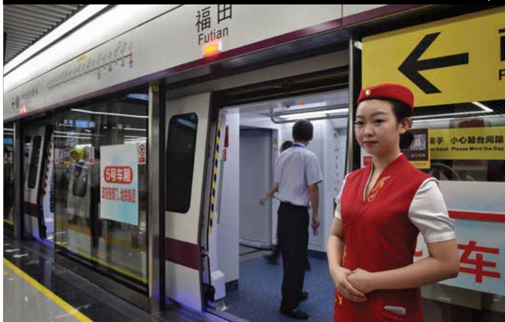
An attendant waits for passengers at Futian Station of newly-opened subway line 11 which directly links Shenzhen Airport with Futian station on the Guangzhou-Shenzhen-Hong Kong Express Rail Link.