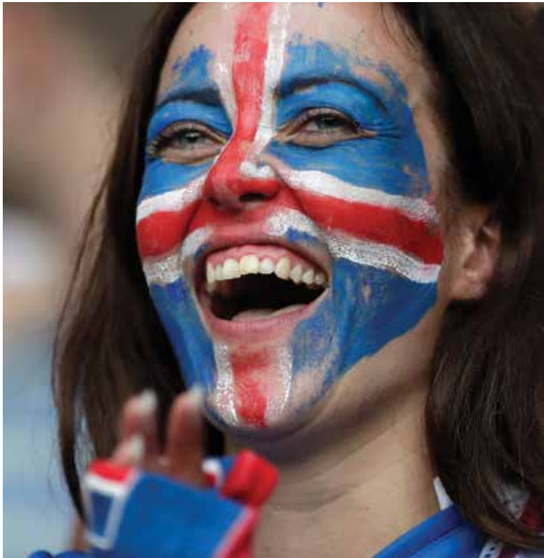
An Iceland supporter smiles prior to the Euro 2016 round of 16 soccer match between England and Iceland, at the Allianz Riviera stadium in Nice