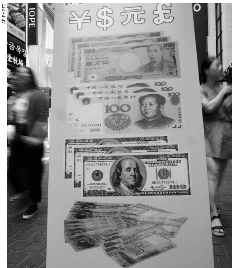
Visitors walk by signs displaying foreign currency exchange rates in downtown Seoul

South Korea's government estimated that the direct impact