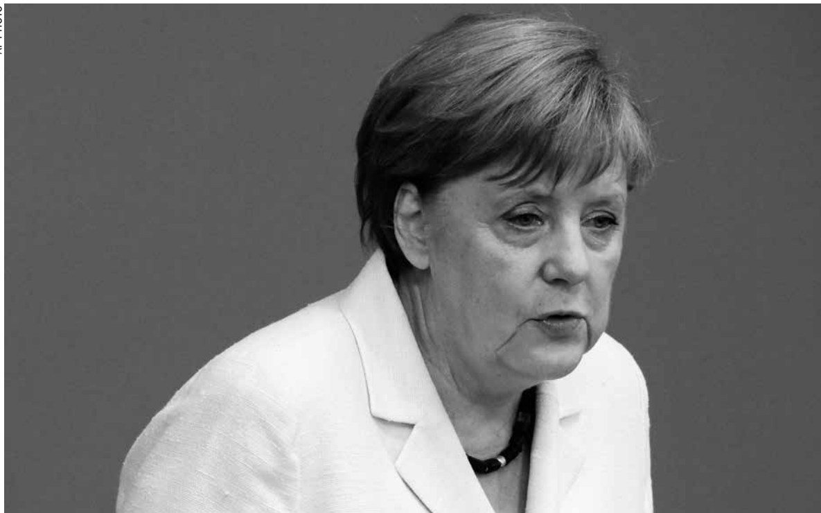
German Chancellor Angela Merkel