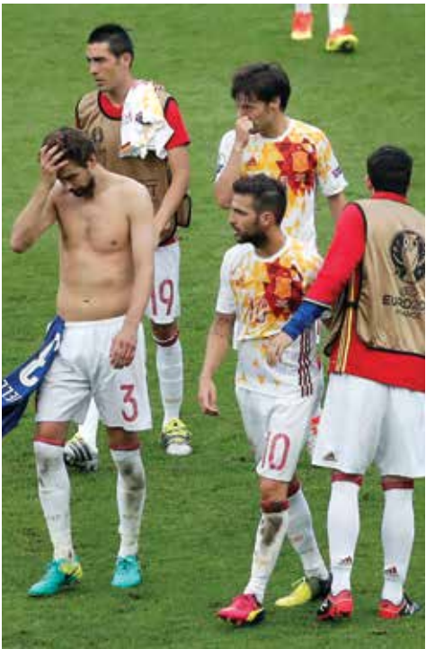
Spain's Gerard Pique (front left)