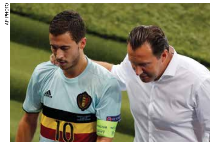
Belgium's Eden Hazard (left) walks off the pitch with his coach, Marc Wilmots, at half-time during the Euro 2016 soccer match between Hungary and Belgium

"He has a free role, we will have to play compact," Wilmots said. "But it's not just one player we have to worry about. Everyone knows his role well and his growth in power."