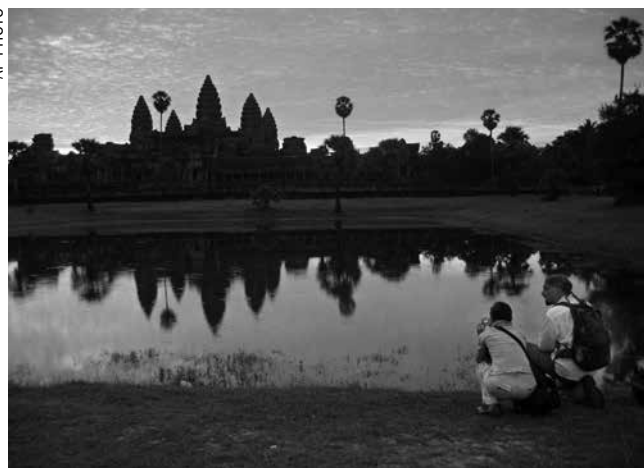
Tourists look at the view of the Angkor Wat temples at sunrise, outside Siem Reap