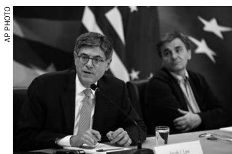
United States Secretary of the Treasury Jacob Lew (left) addresses journalists yesterday during a news conference with Greek finance Minister Euclid Tsakalotos in Athens

The IMF, which has yet to commit to Greece's third bailout program, has argued strongly in favor of debt relief for Greece and has suggested the forecasts underpinning the Greek bailout plan are too optimistic.