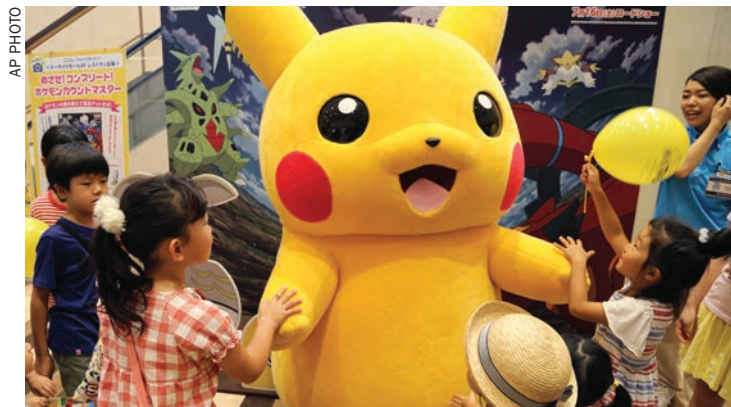
A stuffed toy of Pikachu, a Pokemon character, is surrounded by children during a Pokemon festival in Tokyo

Fans are eagerly awaiting the launch of "Pokemon Go" in the character's country of birth. A report that the game would finally be released in Japan on Wednesday raised expectations, but turned out to be false.