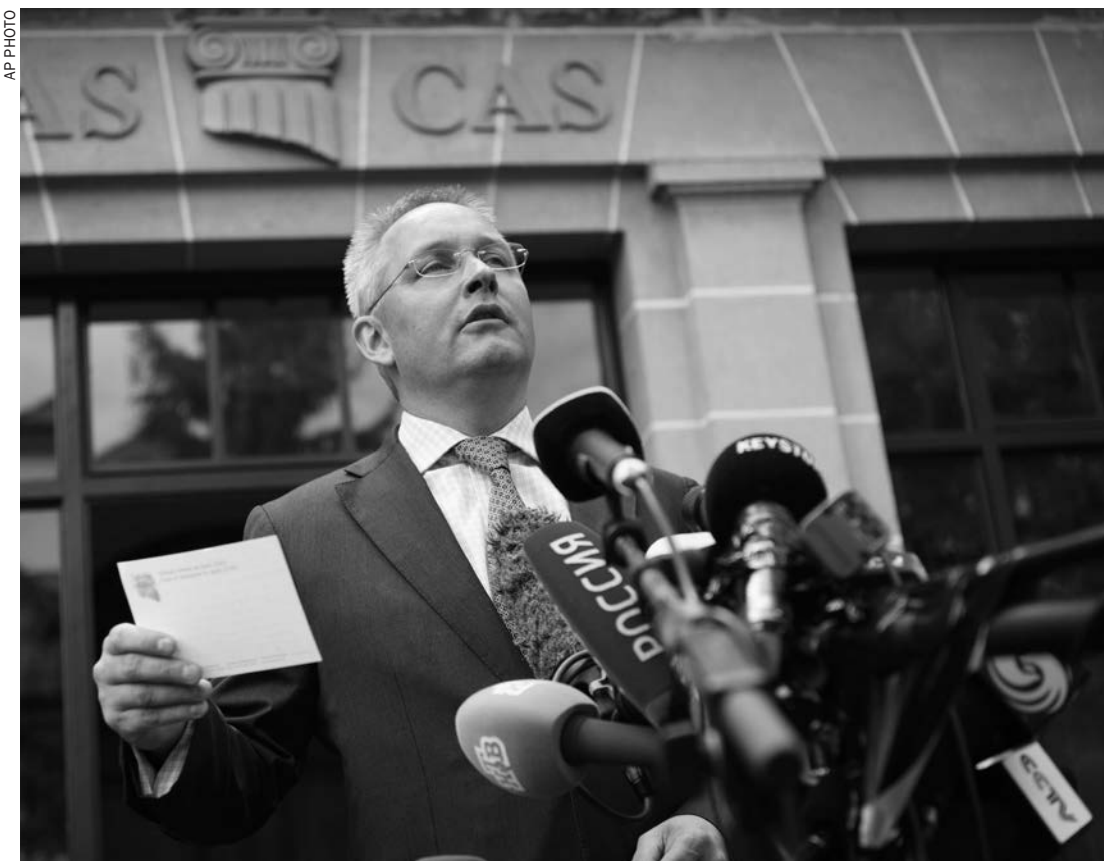
Matthieu Reeb, General Secretary of the Court of Arbitration for Sport, CAS, speaks to journalists

The IOC said it would "study and analyze the full decision" and make its own final ruling on the participation of Russian athletes "in the coming days." The Olympics