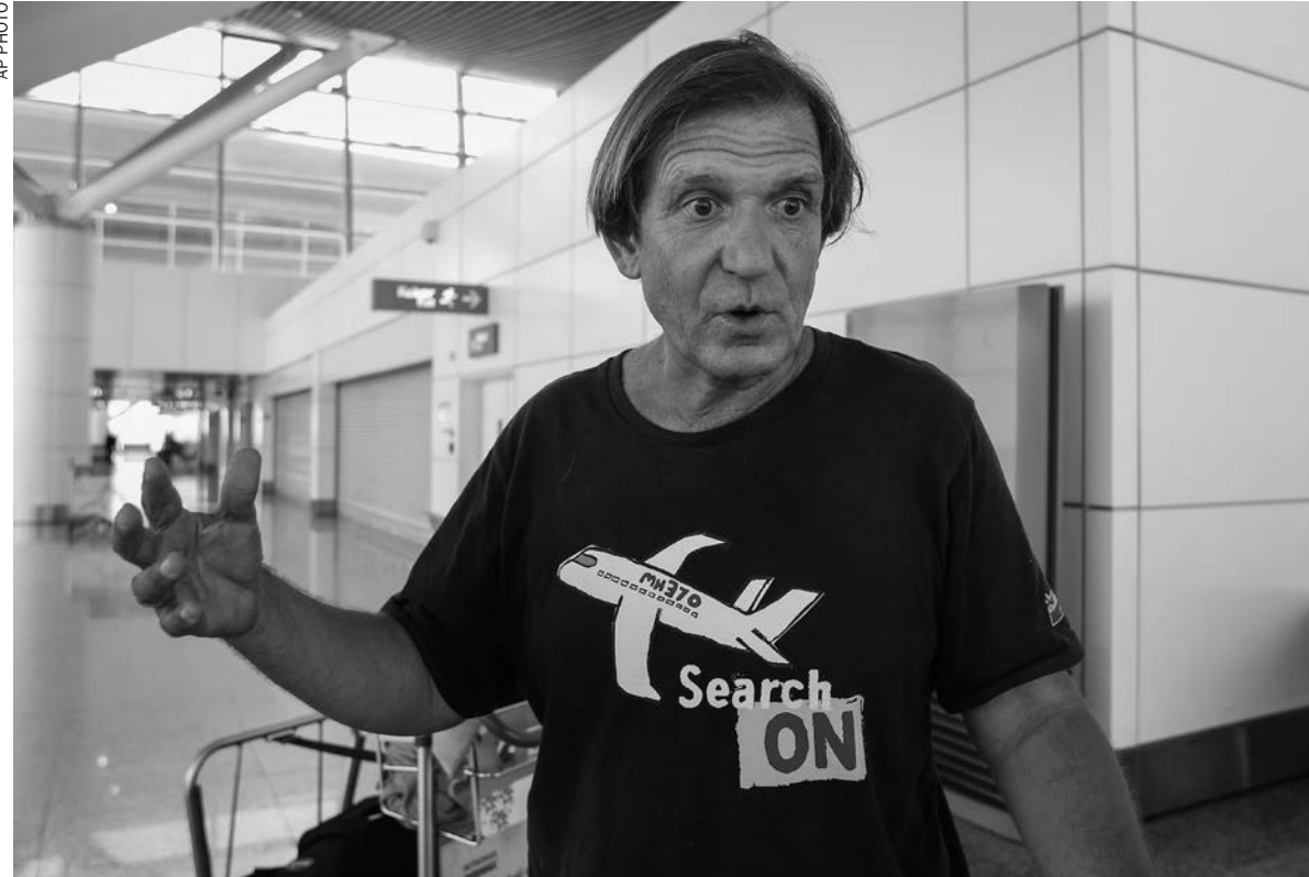
American adventurer Blaine Gibson speaks to The Associated Press during an interview at the Kuala Lumpur International Airport