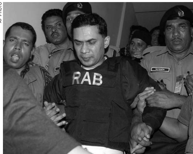
Tarique Rahman (center), who was charged with receiving bribes

B ANGLADESH'S High Court yesterday sentenced a son of the country's top opposition leader to seven years in jail in a money laundering case, overturning an acquittal by a lower court.