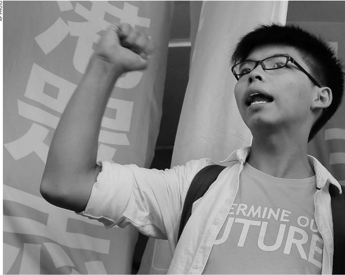
Teen protest leader Joshua Wong shouts slogans outside a magistrate's court in Hong Kong

No matter what is the penalty or the price that we need to pay, we will still continue to fight against suppression from the government.