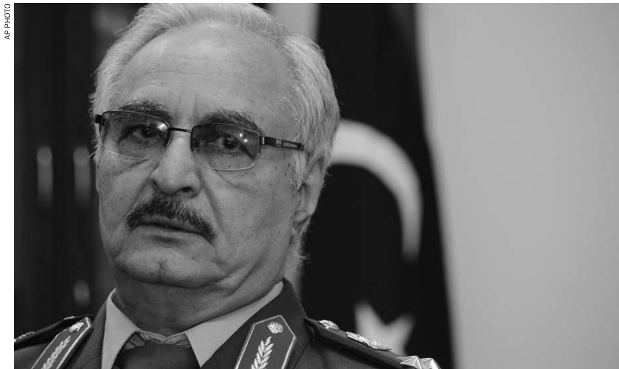
In this March 18, 2015 file photo, Gen. Khalifa Hifter, the head of armed forces based in the east of Libya speaks during an interview with The Associated Press, in al-Marj

On Tuesday, Libyan officials first told The Associated Press that an Islamic militia had shot down a helicopter near the eastern Libyan city of Benghazi, killing two French officers, in an area called al-Magrun, west of Benghazi. French and Libyan officials have not provided information on where the third officer died.