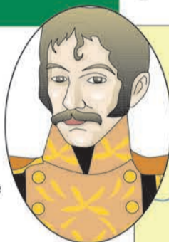
Simón Bolívar 1783-1830

SOURCES: World Book Encyclopedia, World Book Inc.; http://www.boliviabella.com ; http://worldfacts.us ; CIA Factbook; https://www.britannica.com