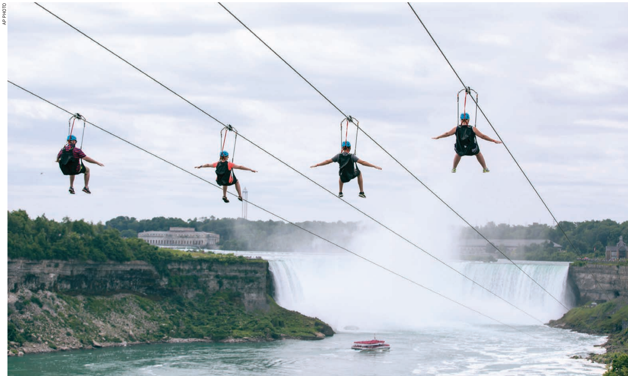
In this July 19, 2016 photo provided by WildPlay Ltd., tourists suspended above the water from zip lines make their way at speeds of up to 40 mph toward the mist of the Horseshoe Falls, on the Ontario side of Niagara Falls