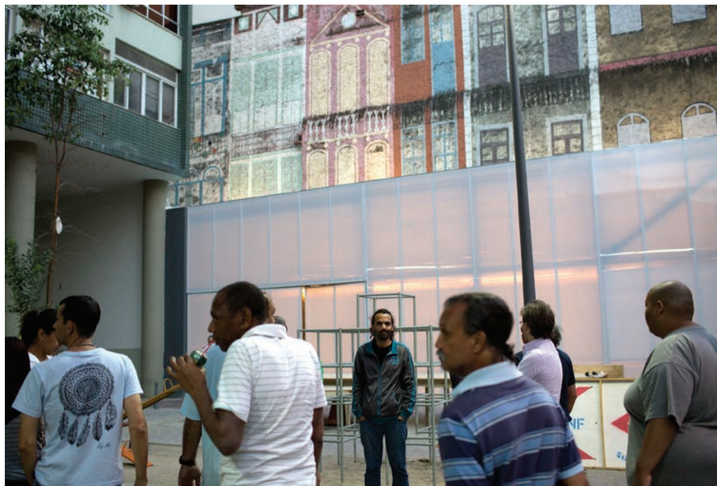
People wait to eat at the gourmet soup kitchen Refettorio Gastromotiva