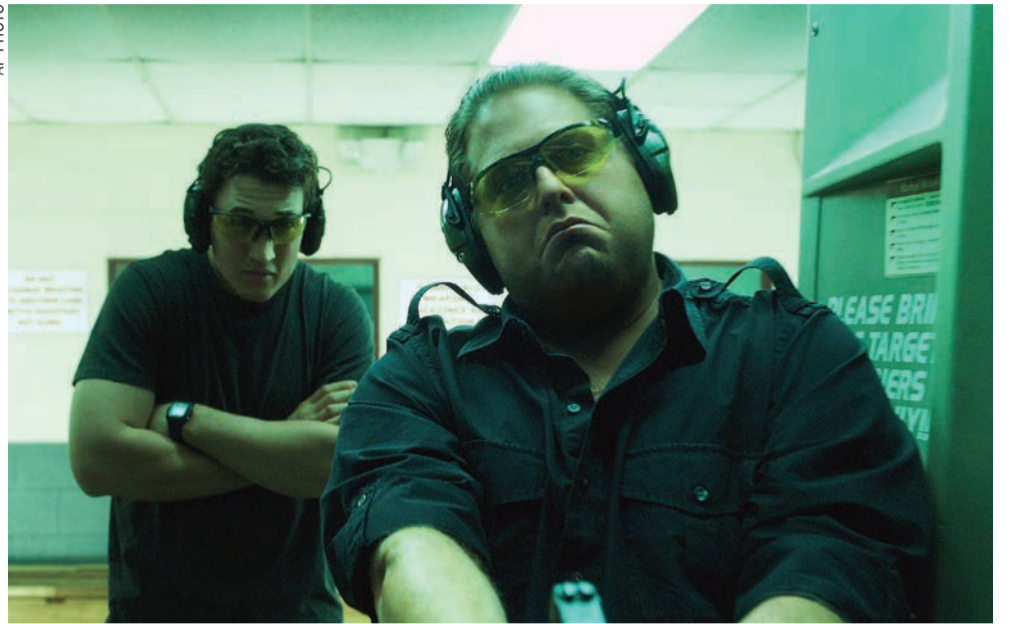
Miles Teller (left) and Jonah Hill in a scene from, "War Dogs"