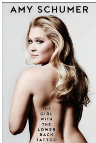
"The Girl with the Lower Back Tattoo" (Gallery Books), by Amy Schumer

Amy Schumer is a powerhouse in the entertainment industry, thanks to her Emmy-winning TV series, "Inside Amy Schumer," and feature film box-office smash "Trainwreck." A comedian, actress, writer, producer and director, Schumer is on her way to adding "best-selling author" to her list of achievements with her new book, "The Girl with the Lower Back Tattoo." Schumer is a talented storyteller. She's known for standing in a spotlight and sharing every corner of her soul with thousands of strangers. So it's no surprise that her book is packed with hilarious, honest and often vulnerably raw details of her life. Her self-deprecating essays reveal a young Amy navigating the tricky waters of adolescence, including new love, lost friendships and the accidental discovery of what the naked body of an older woman looks like up close and personal. Readers also get a peek inside Schumer's "new money" world. She starts by chronicling the