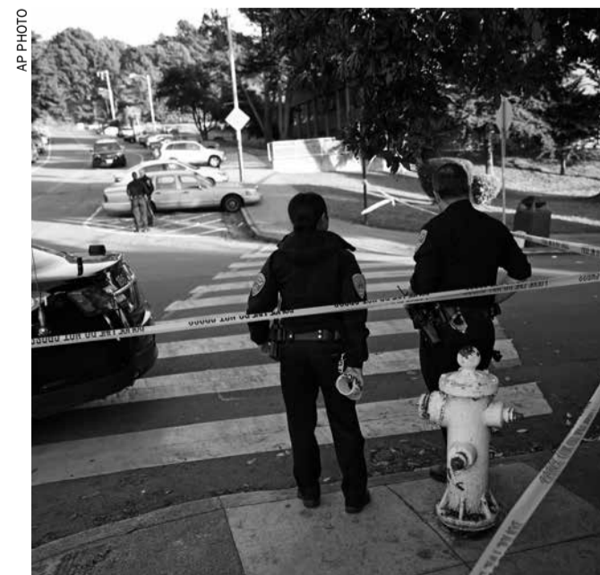
San Francisco Police stand at the site of a shooting outside the June Jordan School for Equity and City Arts and Technology High School

Classes at June Jordan School in the city's Excelsior District will resume today [Macau time] and extra security and counselors for students will be available, it said.