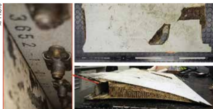
A piece of an aircraft wing found on the Indian Ocean island of Mauritius has been identified as belonging to missing Malaysia Airlines Flight 370