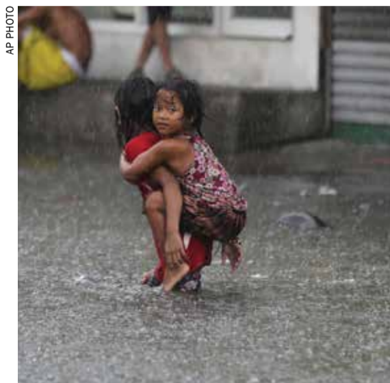
A Filipino girl is carried along a flooded road in suburban Mandaluyong, east of Manila

In November 2013, Typhoon Haiyan struck the central Philippines with ferocious power, leaving more than 7,300 people dead or missing.