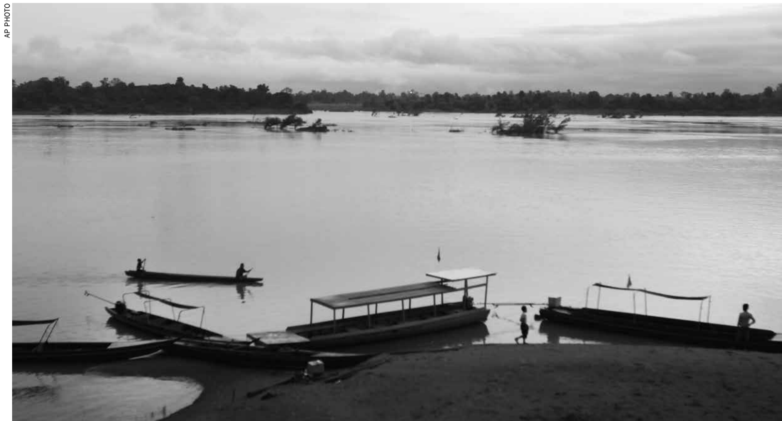
Cambodian fishermen row their wooden boat as they head back from catching fish near a site of Don Sahong dam on the Mekong river

Denmark used a critical review of the commission it conducted in 2013 to press for a faster wi-