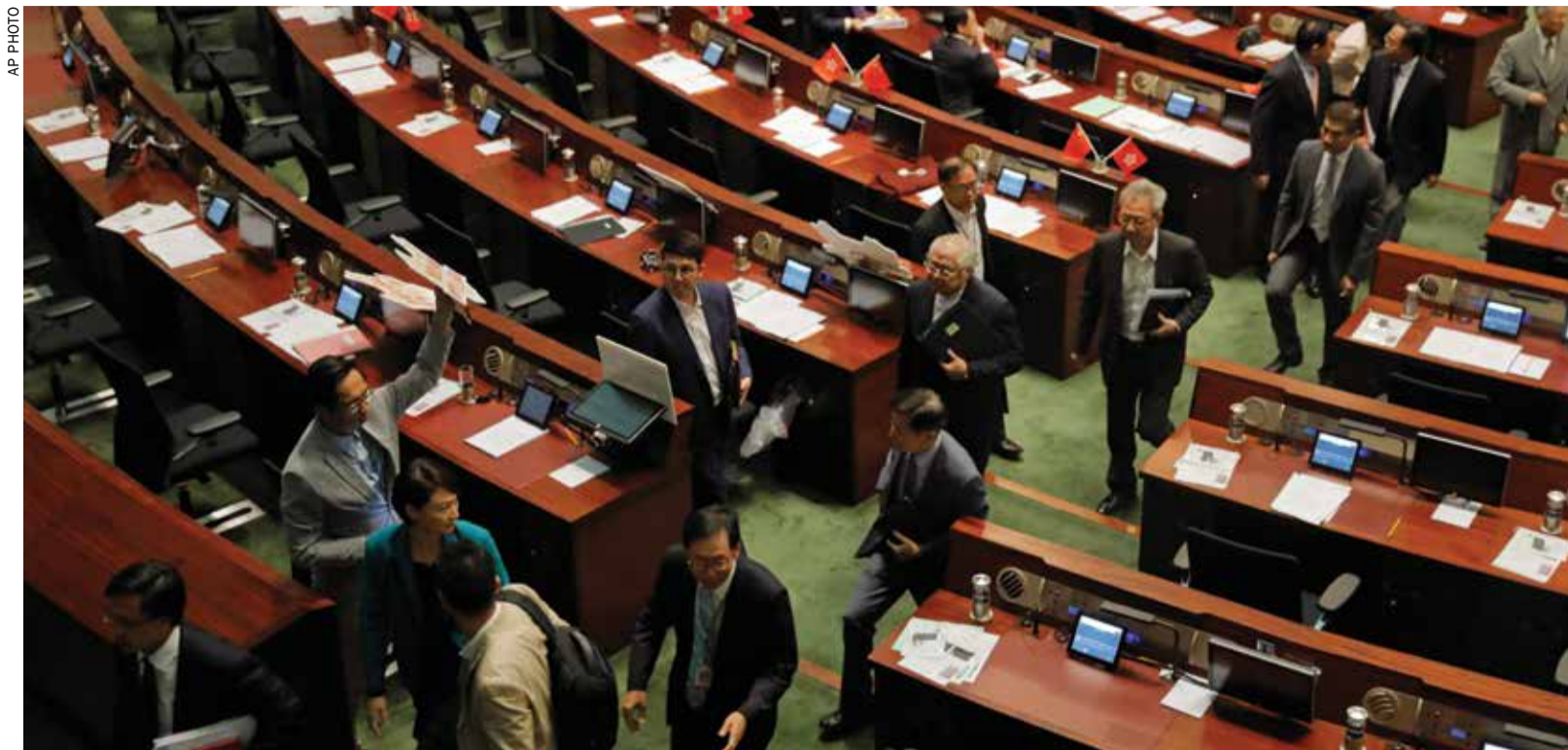
Pro-Beijing lawmakers stage a walkout, depriving the Legislative chamber of the quorum needed to continue in Hong Kong

“We haven’t had any sense of remorse from them [localists], so we just have to do what I believe to be a very unfortunate choice.”