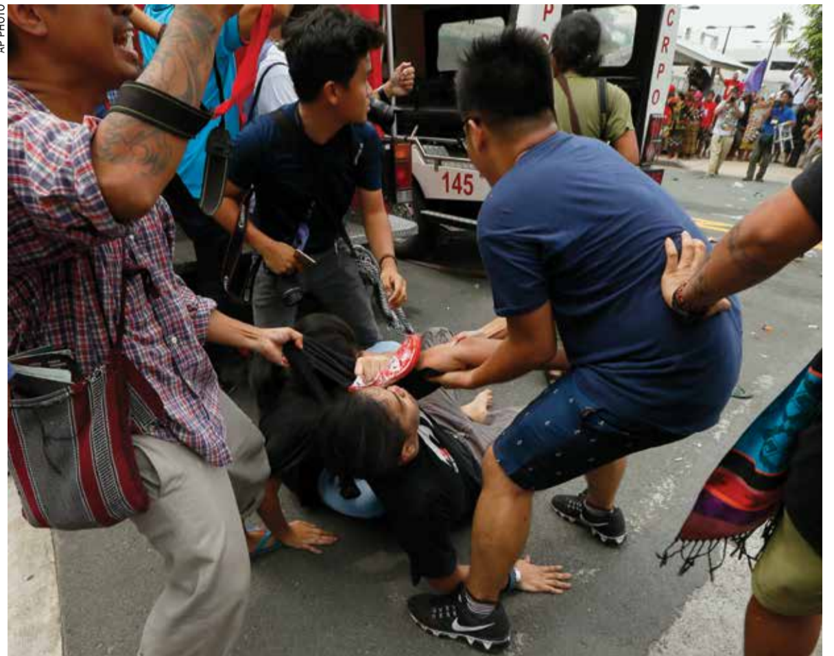
A protester is helped after a Philippine National Police van, background, rammed into protesters outside the U.S. Embassy in Manila

Police lobbed tear gas and arrested at least 23 protesters