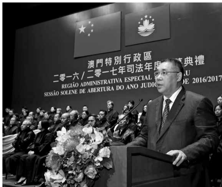
Chui Sai On pictured during yesterday's ceremony

that crimes related to gambling should receive special attention. He recalled that gaming-related criminality has gone up by around 38 percent, resulting from an increase of 193 cases. "Several of those cases resulted in the deaths of the abducted.