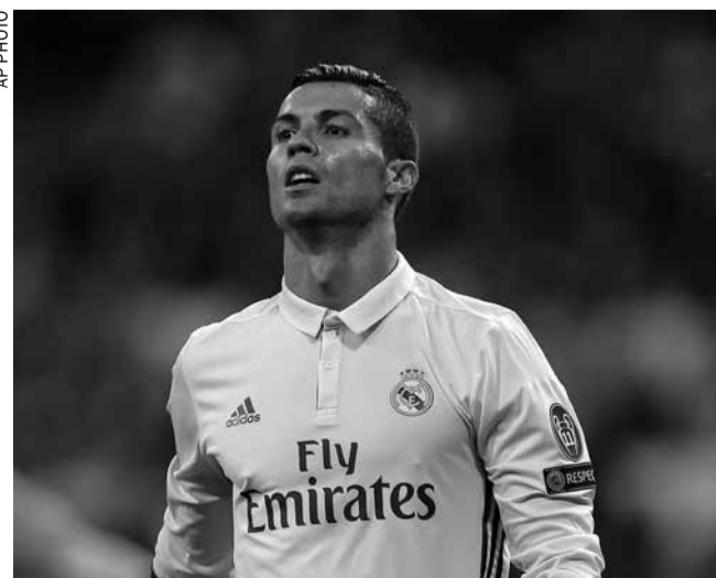
Real Madrid's Cristiano Ronaldo

Colombia midfielder Juan Cuadrado scored the winner for Juventus in the 76th minute with a brilliant angled strike, keeping the Turin team top of Group H. MDT/AP