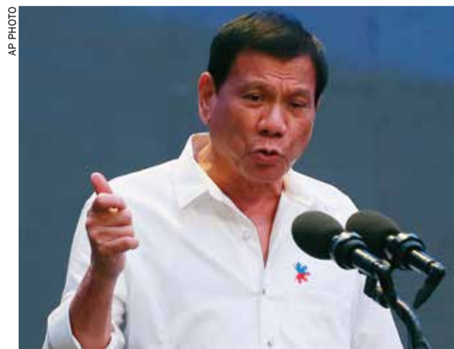
Philippine President Rodrigo Duterte

Both sides have played up the economic benefits of improved relations, with scores of Philippine business leaders accompanying Duterte and Chi-