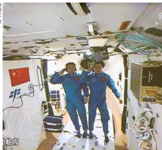
Two Chinese astronauts Jing Haipeng, left and Chen Dong salute in the space lab Tiangong 2

Chinese officials are now looking to internationalize their own program by offering to help finance other countries' missions to Tiangong 2, which, at 60 tons when completed, would still be considerably smaller than the 420-ton ISS. AP