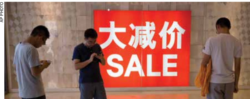
Chinese shoppers stand near a sale advertisement at a shopping area in Beijing