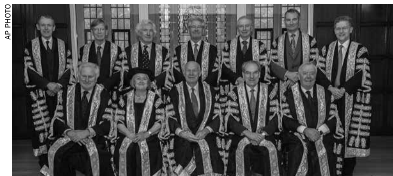
Justices of the Supreme Court of the UK who yesterday ruled on the Article 50 case

fted several possible pieces of legislation in anticipation of losing the Supreme Court case, which upheld a lower court ruling.