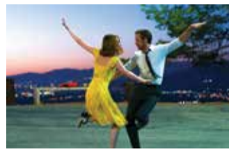
La La Land

Whether fairly or not, the nominations were seen as a test for the revamped film academy. It’s the first Oscars voted on since academy president Cheryl Boone Isaacs ushered in new membership rules and added 683 new mem-