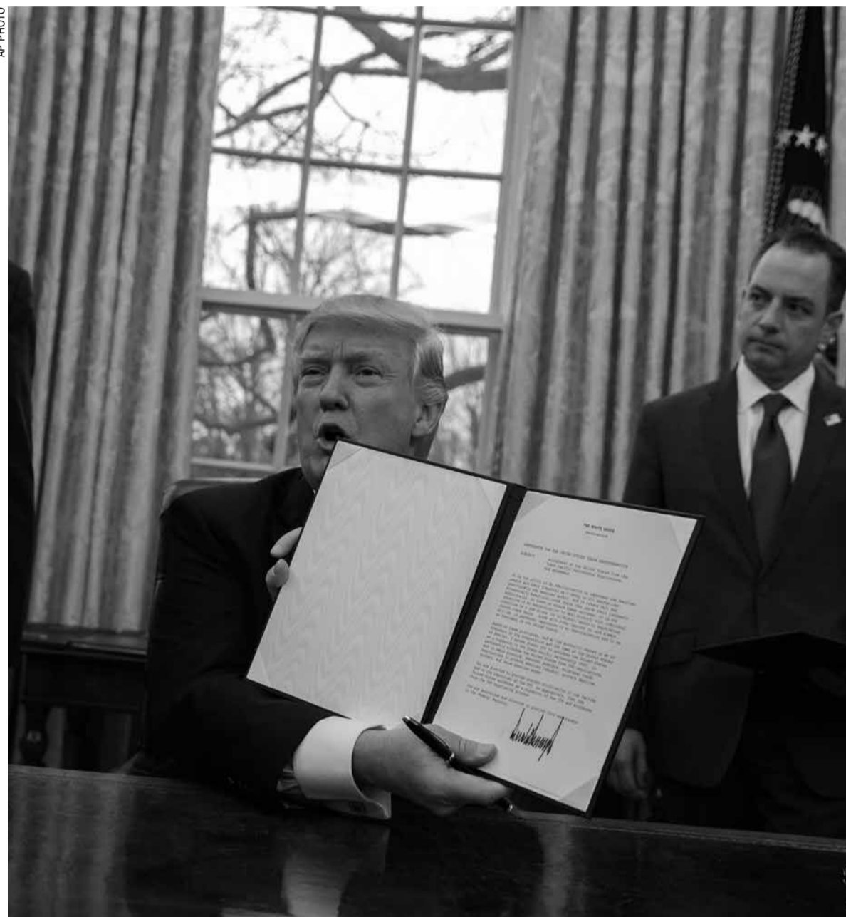
The White House Chief of Staff Reince Priebus watches as President Trump shows off an executive order to withdraw the U.S. from the 12-nation Trans-Pacific Partnership trade pact

“There’s no country or collection of countries that can do what the U.S. has done for the last half-century.”