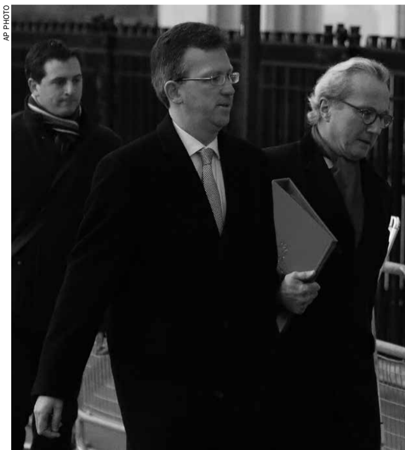
Britain's Attorney General Jeremy Wright (center) arrives at the Supreme Court in London

Significantly, the court also ruled that parts of the United Kingdom — Scotland, Wales and Northern Ireland — do not need to be consulted. Had the court ruled that the "devolved" Parliaments needed a say, a significant delay to the process would have been likely as