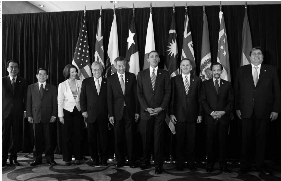
Former U.S. President Barack Obama (center) takes part in the Trans-Pacific Partnership meeting at the APEC summit in Yokohama

That includes Prime Minister Shinzo Abe, who told lawmakers during parliamentary debate that he hoped to gain Trump's "understanding" on the TPP's importance. Abe has said he hopes to meet with Trump as soon as possible.