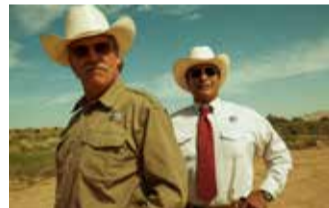
Hell or High Water