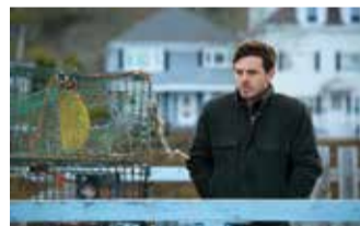
Manchester By The Sea