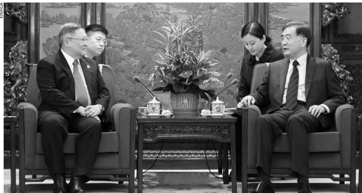
Chinese Vice Premier Wang Yang (right) meets with the Philippine cabinet delegation led by Finance Secretary Carlos Dominguez, in Beijing

Under Philippine President Rodrigo Duterte, who took office in June, the Asian neighbors have seen ties that had been tense over longstanding South China Sea territorial disputes undergo rapid improvement.