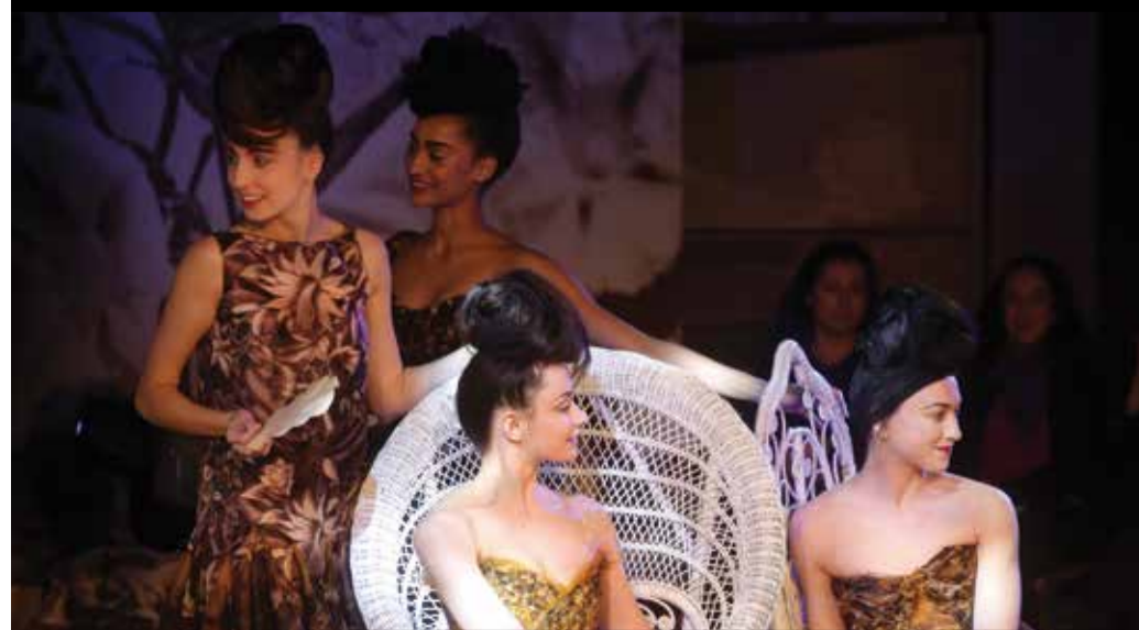
Haute Paris. Models wear creations as part of Franck Sorbier's Spring-Summer 2017 Haute Couture fashion collection presented yesterday in Paris.