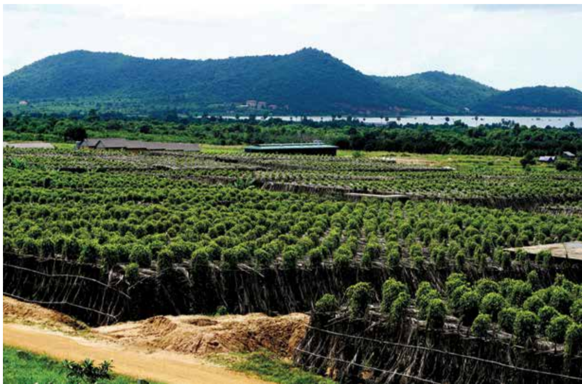
Pepper plantation in Kampot, in southwestern Cambodia

as a "premier cru," a French term for wine and other produce signifying impeccable quality — and hefty price.