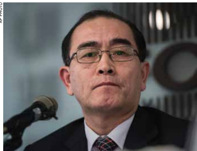
Former North Korean deputy ambassador to the UK, Thae Yong Ho speaks at the Foreign Correspondents Club in Seoul, yesterday

T HE highest-level North Korean diplomat to defect to South Korea said yesterday he decided to flee last year because he didn't want his children to live "miserable" lives in the North.