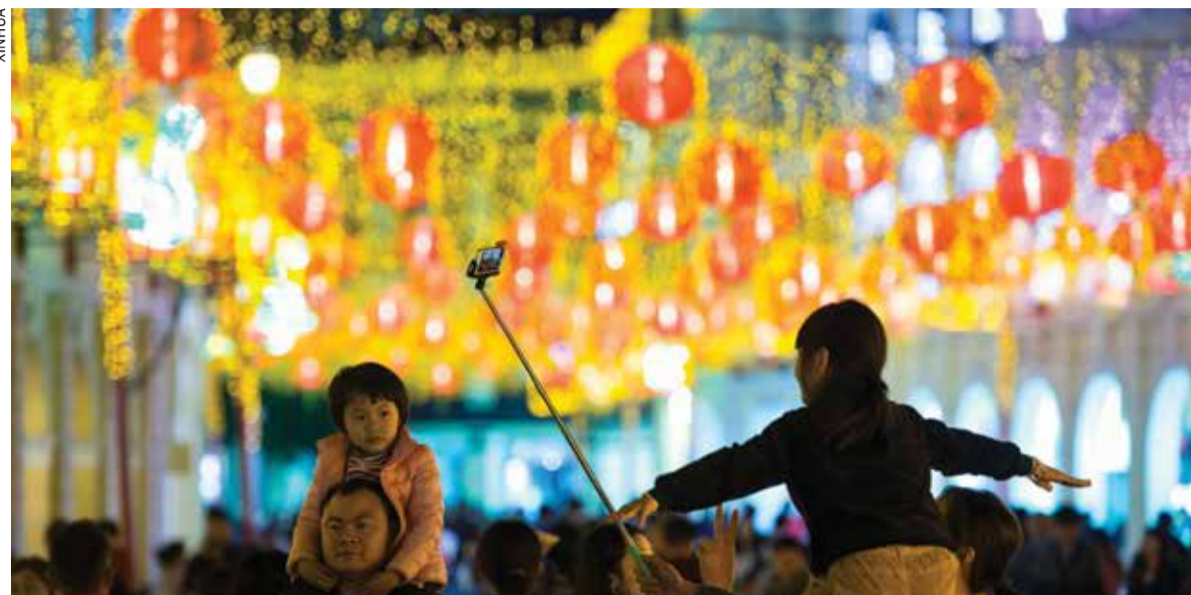
Tourists view the lights decoration for the upcoming Chinese Lunar New Year in Macau