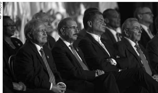
Leaders from left: Salvador Sanchez (El Salvador), Danilo Medina (Dominican Republic), President Rafael Correa (Ecuador) and Raul Castro (Cuba) attend the V Summit of the Community of Latin American and Caribbean States

A summit of Latin American and Caribbean leaders began yesterday in the Dominican Republic with a call to establish mechanisms against the protectionist measures expected from U.S. President Donald Trump.