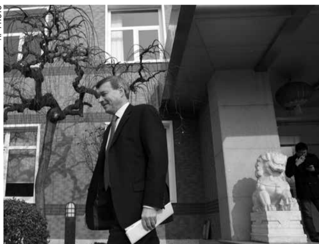
European Union ambassador to China Hans Dietmar Schweisgut walks to a press conference in Beijing, yesterday

Xi's gave no details of possible changes in his