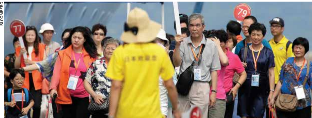
Chinese tourists walk along a pier after disembarking a cruise ship in Fukuoka, Japan