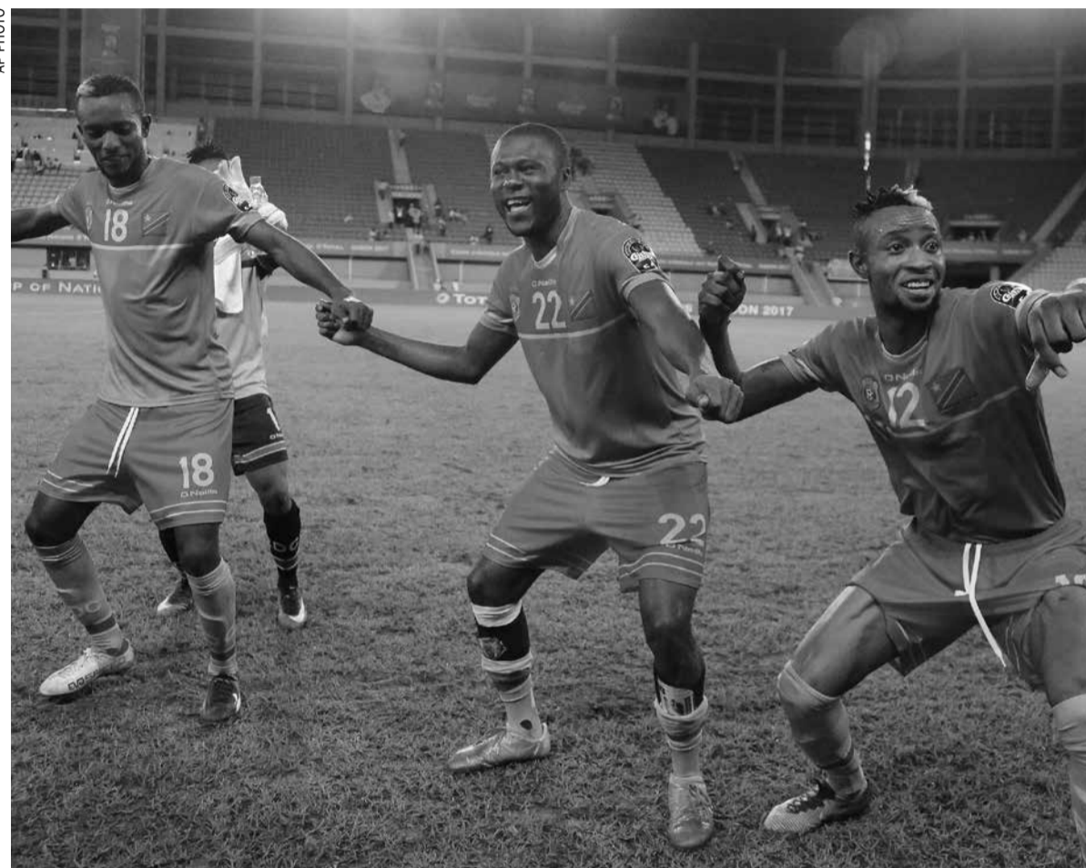
Congo's players celebrate at the end of a soccer match against Togo