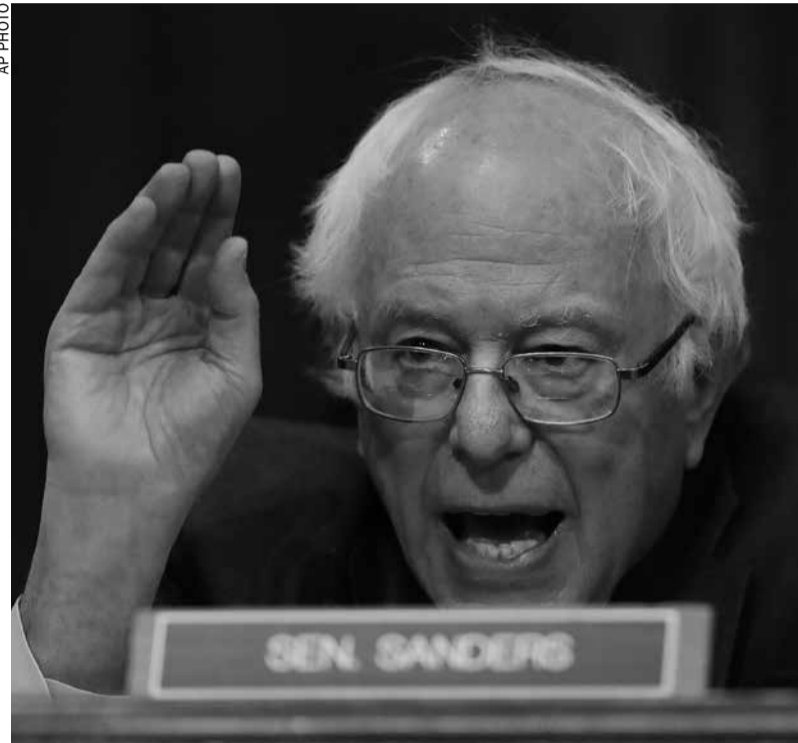
Bernie Sanders and Joe Biden contend to lead the Democrats into a new era