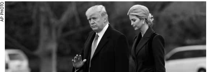
Ivanka and her father walk to board Marine One on the South Lawn of the White House

Ivanka Trump is celebrating Chinese New Year at the Chinese Embassy in Washington.