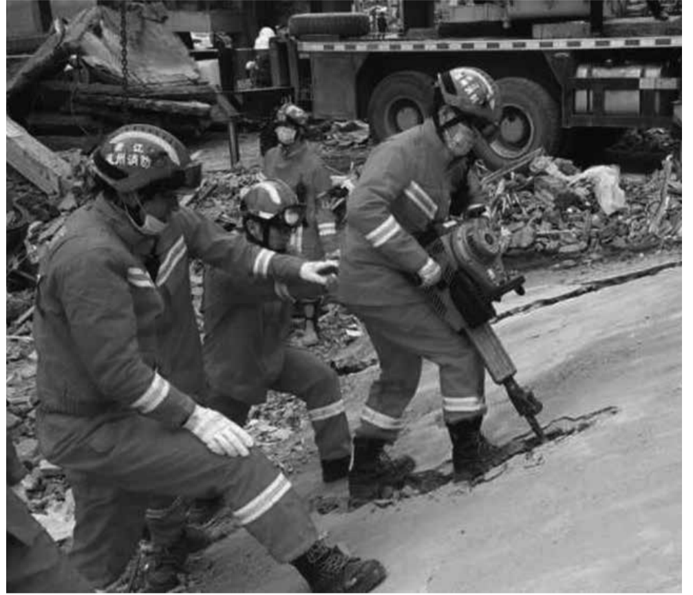
These photos taken by cellphone yesterday show rescuers working at the accident site in Wencheng County, Wenzhou City