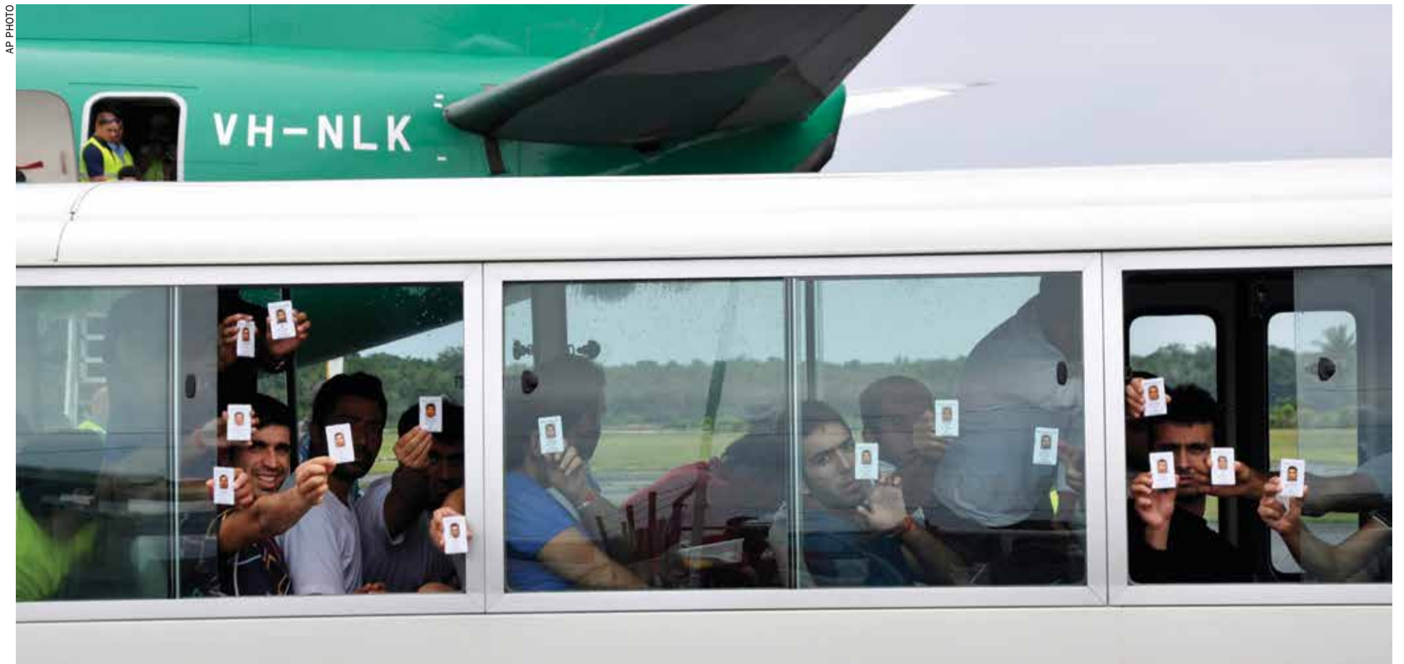
A group of asylum seekers hold up their identity after landing in Manus Island, Papua New Guinea