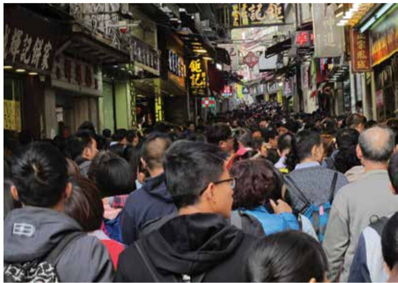
Tourists heading to Ruins of St Paul