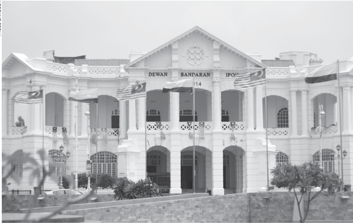
Ipoh's city center is characterized by colonial era buildings, such as the railway station (pictured)

especially since we have been chosen as Lonely Planet's top 10 places to visit in Asia," said Ashilin, adding that the partnership would also attract in-