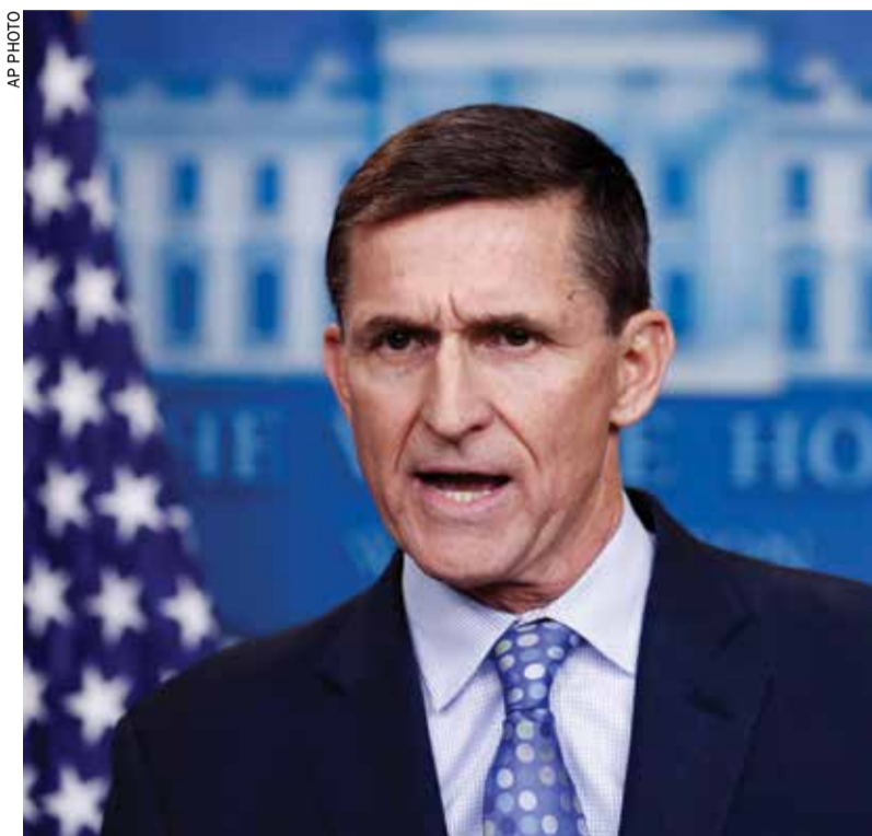
National Security Adviser Michael Flynn speaks during the daily news briefing at the White House, in Washington

Earlier, Flynn forcefully denounced Iran's behavior in his first public remarks since Trump took office. He accused Iran of threa-