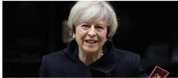
British Prime Minister Theresa May

BRITAIN moved closer to leaving the European Union yesterday as lawmakers backed a bill authorizing divorce proceedings and kept alive the government's plan to trigger Brexit talks within weeks.