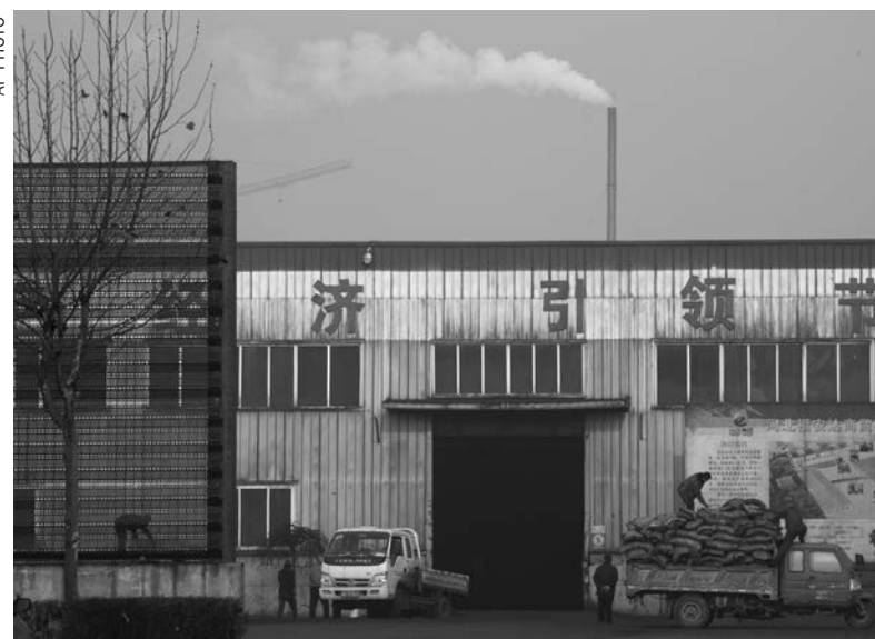
Workers load "clean coal" promoted by the government at a factory in Qianan, in Hebei province

All signers should "fulfill their pledges and implement the agreement with positive actions," Lu said.