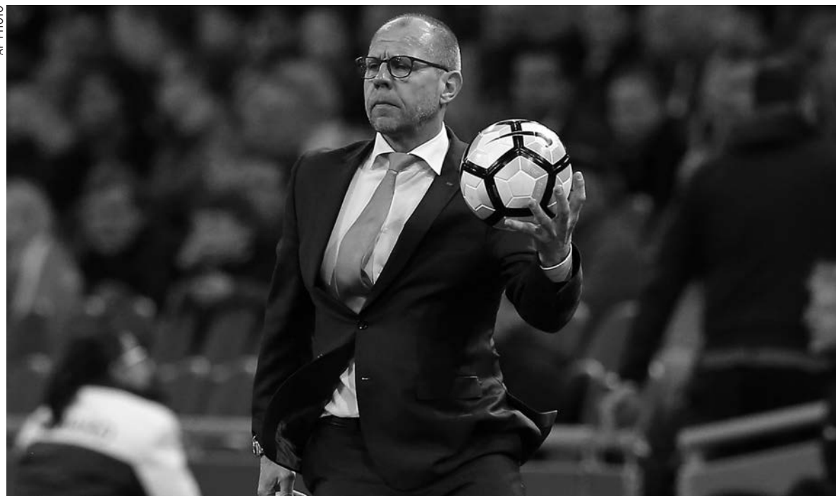
Netherlands' interim coach Fred Grim

sitting in the corner," Willem Vissers wrote in the national daily De Volkskrant.