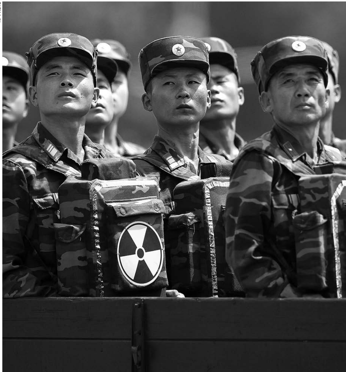
North Korean soldiers turn and look toward their leader Kim Jong Un from a military parade vehicle

In 2013, xenon isotopes were detected — but possibly because North Korea drilled back into the mountain after the test, not from the test itself. Moreover, the samples were collected