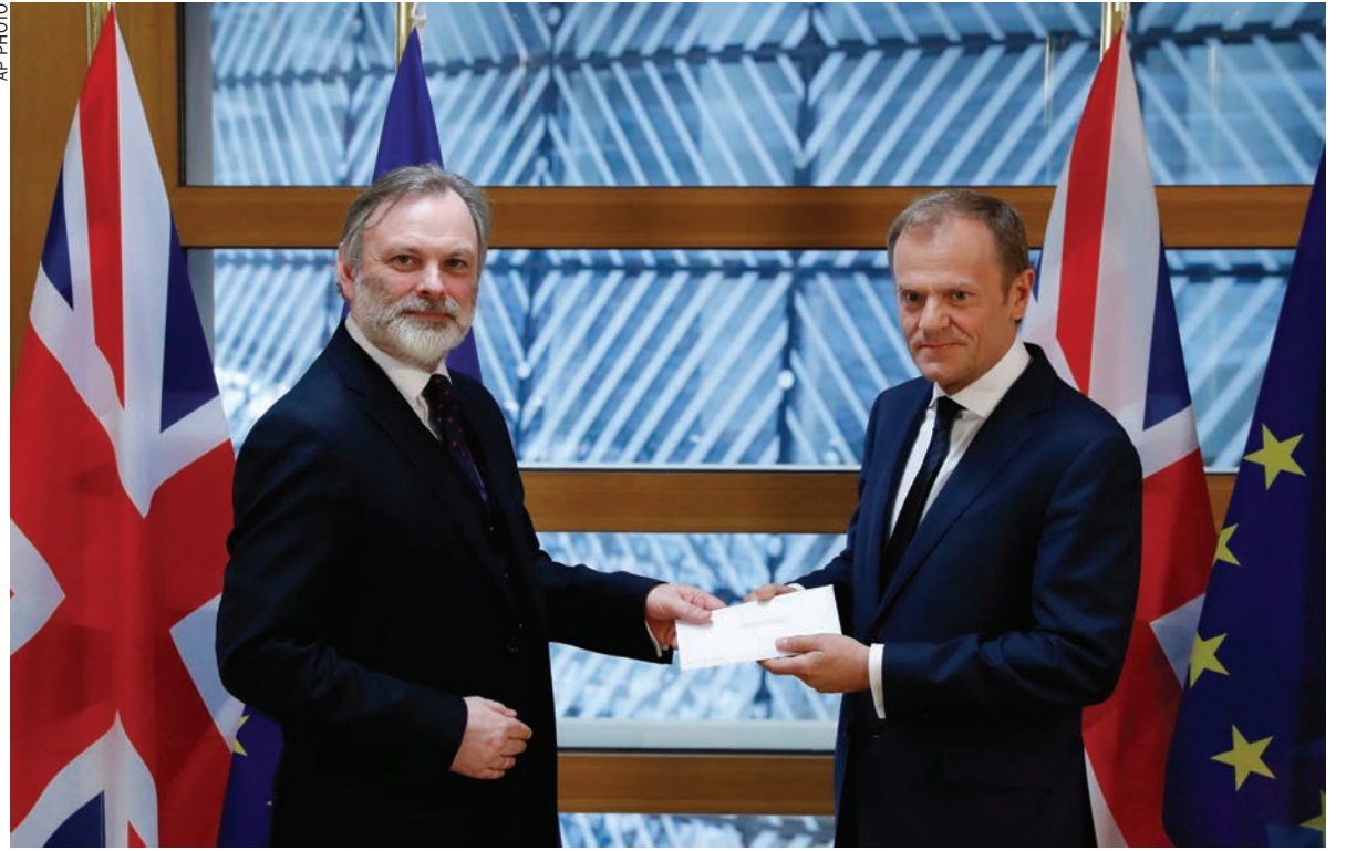
Britain's permanent representative to the European Union Tim Barrow, left, hand delivers British Prime Minister Theresa May's Brexit letter

She said the two sides should "engage with one another constructively and respectfully, in a