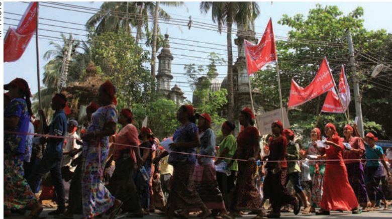
Hard-line Buddhists during a protest march against the government's plan to give citizenship to some members of the persecuted Rohingya Muslim minority

last week for an independent international investigation.