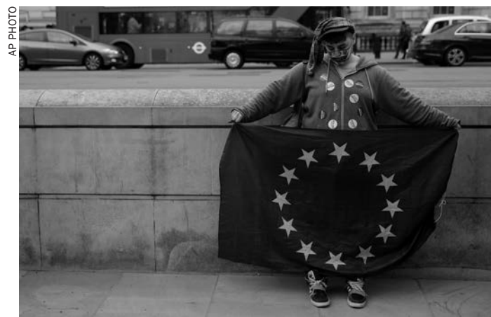
A pro-European Union membership supporter holds a European flag opposite Downing Street

"It is in the interests of both parties to get this done as quickly as possible and as amicably as possible," he said. AP