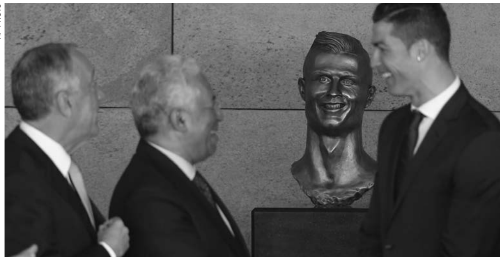
President Marcelo Rebelo de Sousa (left), Prime Minister Antonio Costa (2nd left) and Cristiano Ronaldo

C RISTIANO Ronaldo now has an international airport named after him.