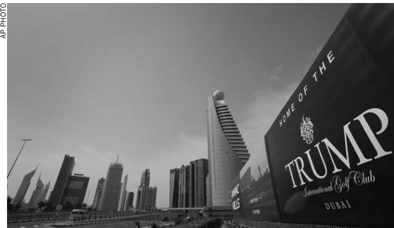
A giant billboard advertising the Trump International Golf Club hangs at the Dubai Trade Center roundabout