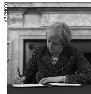
Prime Minister Theresa May signs the official letter to European Council President Donald Tusk, in 10 Downing Street

Oct. 2: May says that Britain will begin the formal process of leaving the EU by the end of March 2017. In order to do this the British