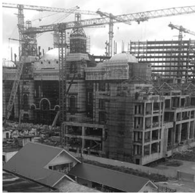
This February 25, 2017 photo shows the under-construction integrated resort in Saipan

allowing the casino to partially open while construction works are underway, while the governor is allegedly lobbying for permission to operate under such conditions.