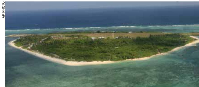
Pag-asa Island, part of the disputed Spratly group of islands

Duterte said he may visit one of the islands, Pag-asa, to plant a Philippine flag on Independence Day. He said money has been budgeted to repair the runway on Pag-asa, home to a small fishing community and Filipino troops.