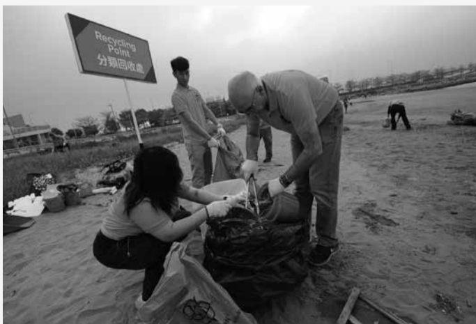
MGM rolled out a two-week "Go Green Campaign" for its 6,000 employees in support of

the Civic and Municipal Affairs Bureau's (IACM) Green Week, as well as the annual Macau In-