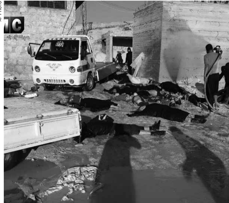
This photo provided by activist group Edlib Media Center, which has been authenticated based on its contents and other AP reporting, shows victims of a suspected chemical attack, in the town of Khan Sheikhoun

Nearly half the Syrian population has been displaced by the violence, with millions seeking sanctuary in neighboring Lebanon, Jordan and Turkey, or heading further west to Europe. U.N. agencies estimate war damage across Syria so far at $350 billion, including physical destruction and the loss of eco-