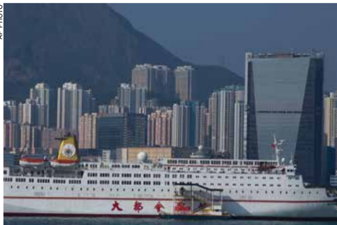
An exterior view of the Metropolis Cruise gambling ship in Hong Kong

According to the data published in the study, around 7