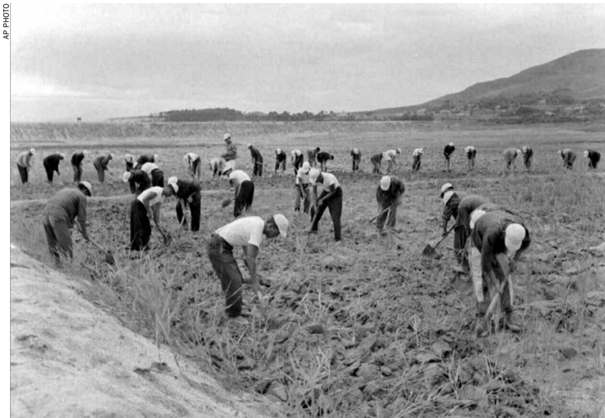
This undated photo, released by National Archives of Korea, shows a group of men working at a land reclamation worksite in Seosan in the 1960s