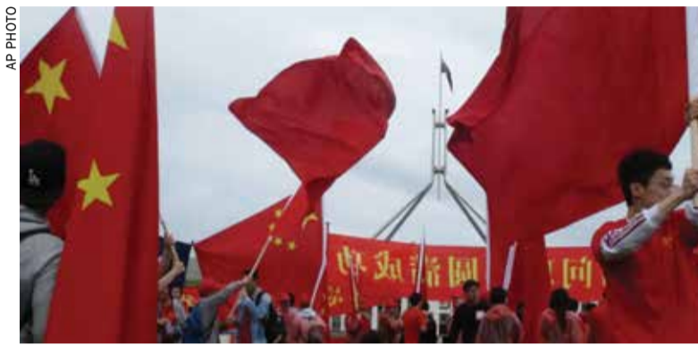
Pro-China demonstrators gather outside Parliament House in Canberra last month

The controversy comes during tense diplomatic times in the Sino-Australian relationship.