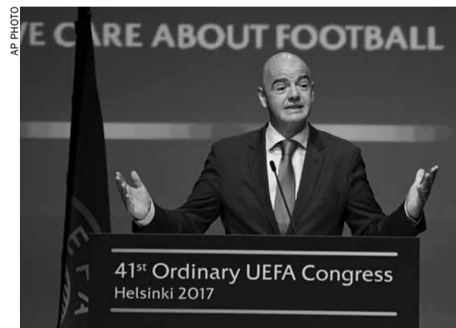
FIFA president Gianni Infantino

FIFA currently has six top-tier "partners," with scope to add two more ahead of the kickoff in Russia in 14 months.