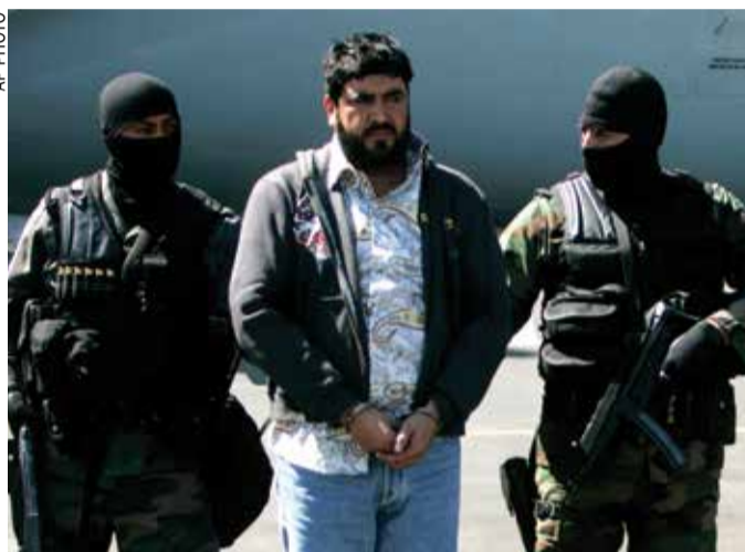
Mexican federal police officers escort Alfredo Beltran Leyva, known as "El Mochomo", upon his arrival at Mexico City's airport (2008)

The organization relied on killings, torture, kidnappings and other violence to sustain its drug trafficking