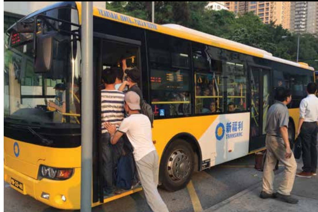
With a little help... Mostly mainland workers fill Macau-bound bus after bus at the Taipa, Ocean Gardens stop - any working day at 6pm.