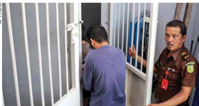
Two men accused of having gay sex are escorted to a holding cell to wait for the start of their trial at Shariah court in Banda Aceh

If found guilty, the men will be the first to be caned for gay