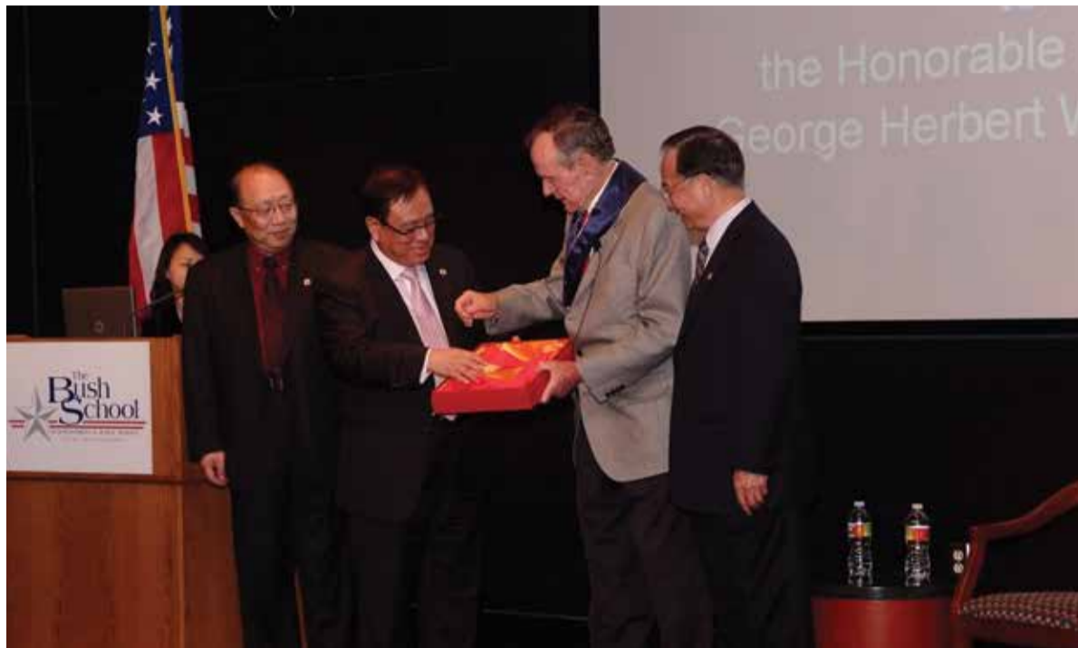
UM conferred an honorary doctorate upon former US president George H. W. Bush in 2009