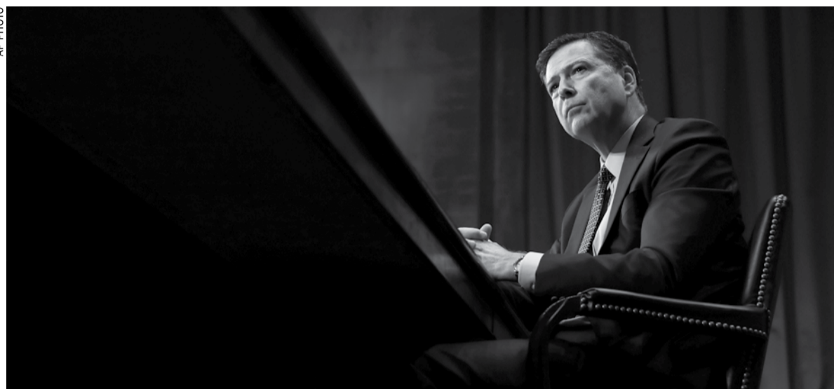
Fired FBI Director James Comey

In his letter to Comey, Trump thanked him for telling him three times “that I am not under investigation.” The FBI has not confirmed that Comey ever made those