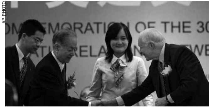
Qian Qichen (second from left)