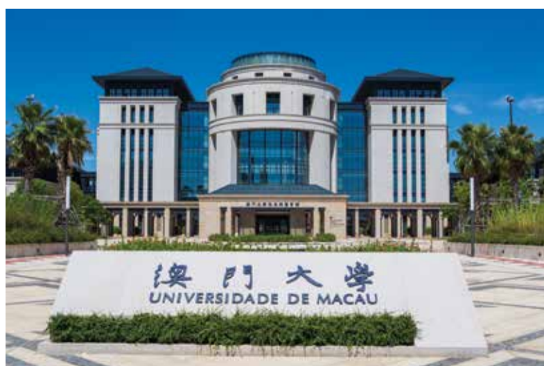
UM has attributed 97 HC degrees since 1984

According to what the Times could ascertain, the same practice occurs in other jurisdictions, in which the conferral of honorary degrees is regarded as a private matter of each institution as they are not subjected to any control or specific regulation.