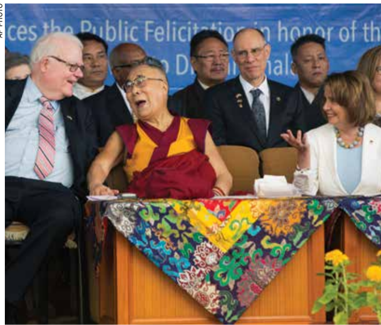
The Dalai Lama laughs with Republican Jim Sensenbrenner as the Minority Leader in the U.S. House of Representatives Nancy Pelosi, right, looks on at the Tsuglagkhang temple in Dharmasala

"Without justice there is no freedom," said the Wisconsin Republican, noting that the U.S. Consti-