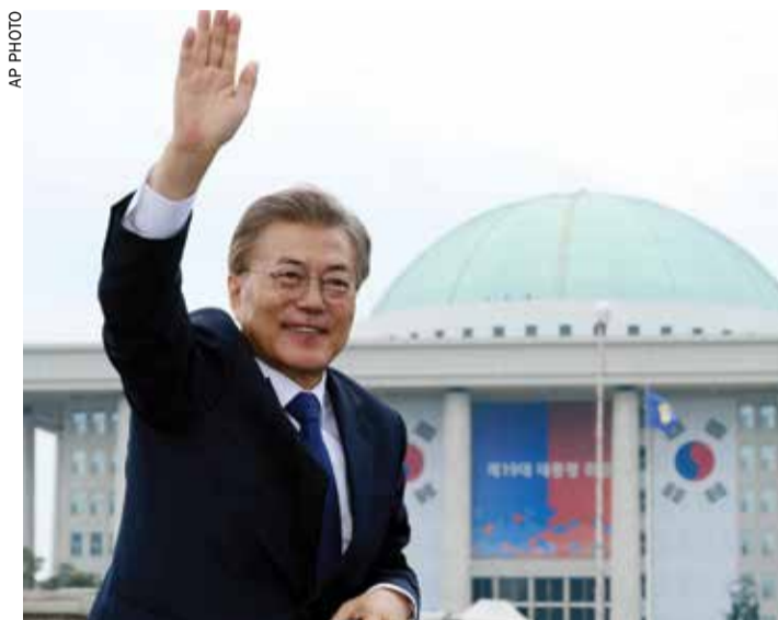
South Korea's new President Moon Jae-in

Trump administration officials may worry about Moon's