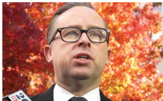
Qantas Airways chief executive Alan Joyce

A man who squashed a lemon meringue pie into Qantas Airways chief executive Alan Joyce's face during a public address in Australia said Wednesday he was protesting Joyce's advocacy for same-sex marriage.