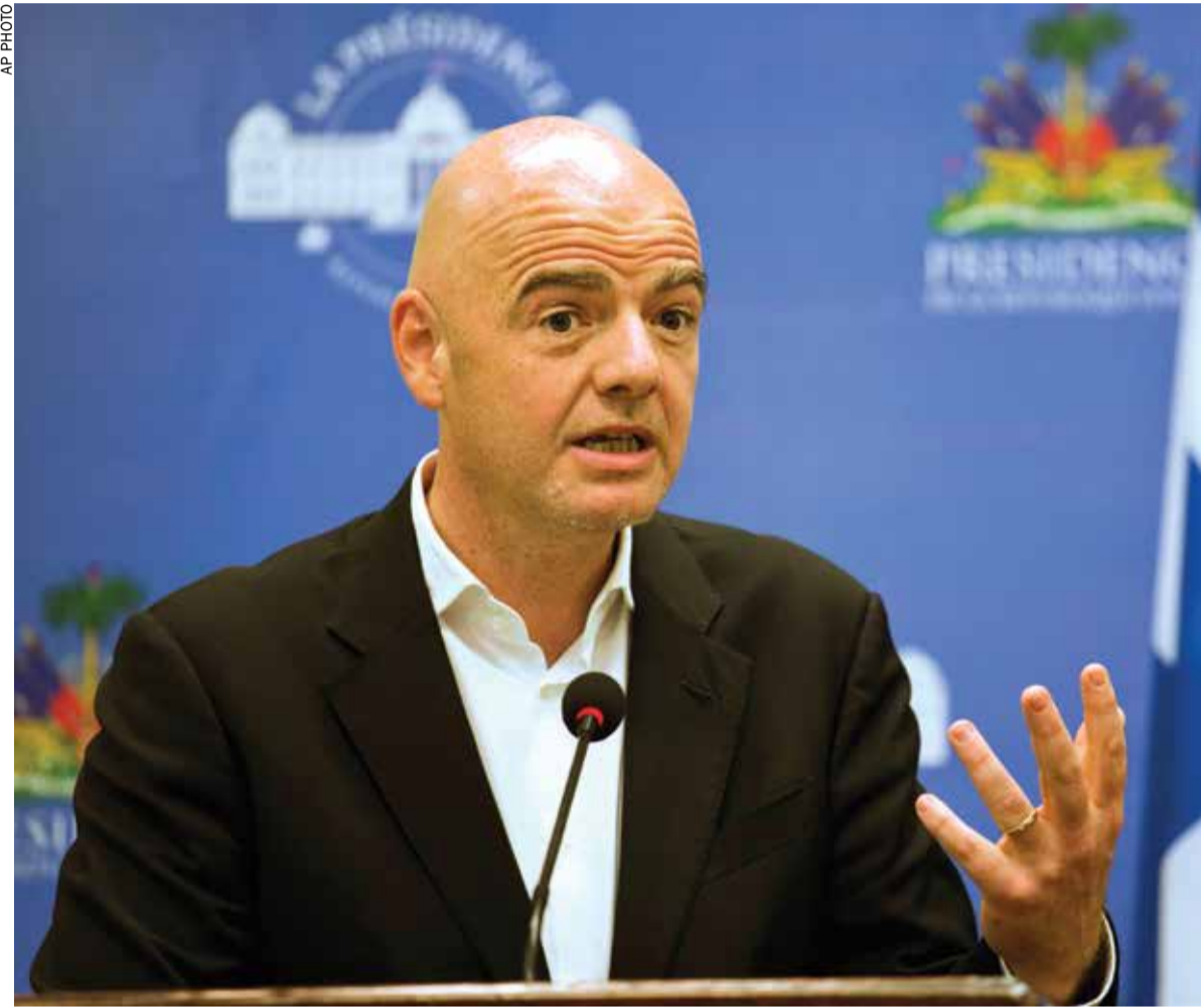
FIFA President Gianni Infantino

FIFA's leadership was able to start its congress week in Bahrain by trumpeting the arrival of Qatar Airways to fill the airline sponsorship category that has been vacant for more than two years. But the