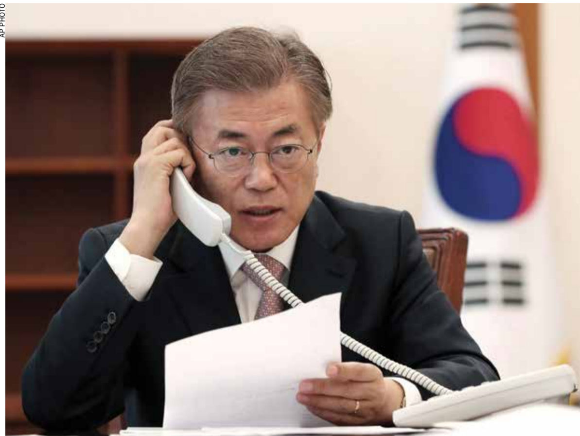
South Korean President Moon Jae-in talks on the phone with Xi Jinping

China has already taken commercial retaliation against South Korean business interests on its soil, but will be hoping Moon follows through on his campaign pledge to review the