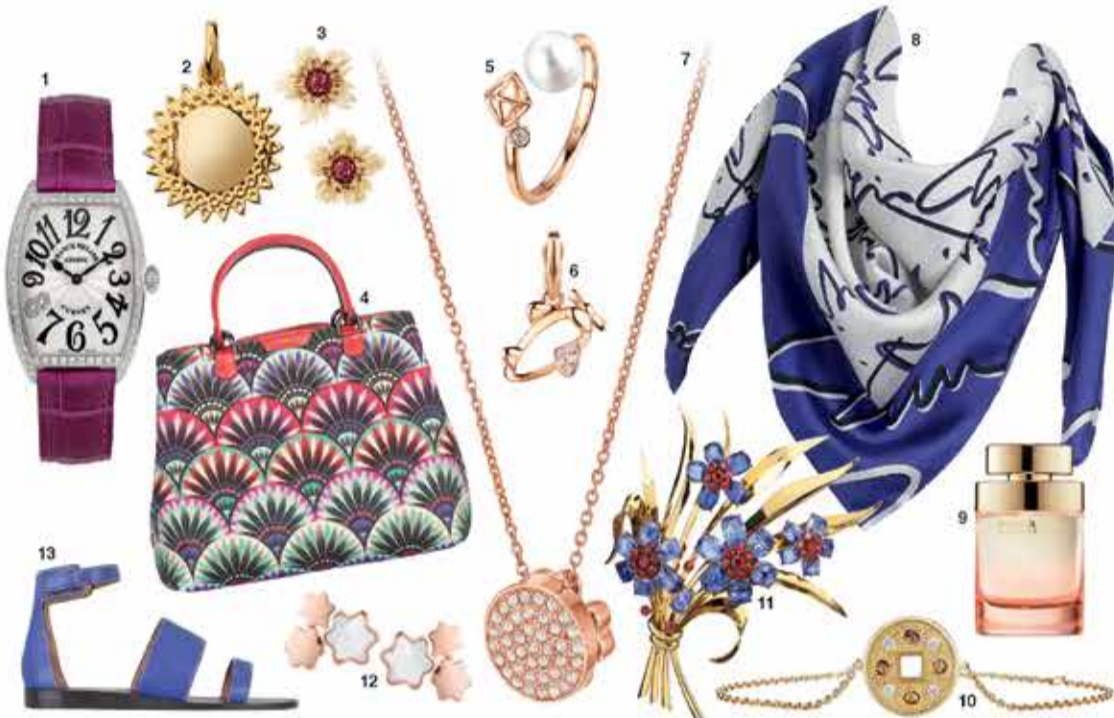
1. Franck Muller Watch 2. Links of London Pendant 3. Van Cleef & Arpels Earrings 4. Emporio Armani Bag 5. Lukfook Ring 6. Lukfook Charm 7. Follie Follie Necklace 8. Giorgio Armani Scarf 9. Michael Kors Perfume 10. De Beers Bracelet 11. Van Cleef & Arpels Brooch 12. Montblanc Earrings 13. Giorgio Armani Sandals

Treat your mum to something special this Sunday. Whether you want to celebrate with stunning jewels, a trendy new timepiece, the chicest new shoes or a bag that ensures she stands out from the crowd, Sands Shoppes has it all and more. Make this Mother's Day one to remember.