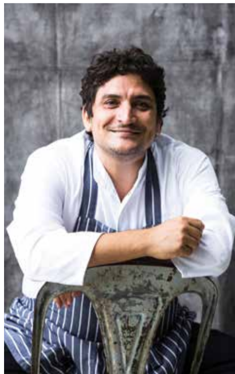
Chef Mauro Colagreco

Janice Wong MGM is a sweets shop where customers can observe a live chocolate, crepe and dessert station, take away confectioneries and pastries, or dine in for a dessert experience beside one of the biggest chocolate fountains in the world - a 7.3-meter high sculpture spouting rivers of dark, milk and white chocolate. LV