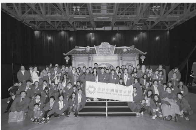
A group of approximately 60 children and parents from the Association for the Parents of the Mentally Handicapped celebrated the upcoming Mo-

ther's Day with close to 40 Sands China Care Ambassadors on Saturday afternoon.