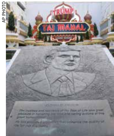
A plaque bearing the likeness of Donald Trump at the entrance to the Trump Taj Mahal Casino resort

At the end, Trump had no ownership interest at all: His stake was wiped out last year when Icahn acquired Trump Entertainment Resorts from bankruptcy. Icahn and Atlantic City's main casino workers' union were unable to agree on a new contract to restore health insurance and pension benefits,