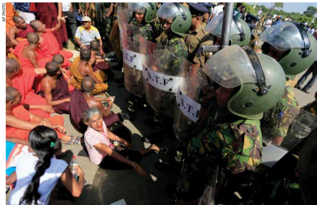
Sri Lankan Buddhist monks and villagers protest against a plan to take over private land for an industrial zone in which China will have a major stake