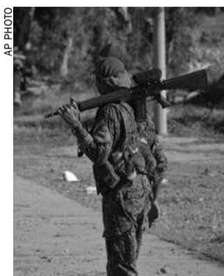
Fighters from the Kurdish-led Syria Democratic Forces, patrolling on a street in Tabqa, northern Syria

Tabqa and the nearby dam, Syria's largest, were seized a day earlier in an offensive that lasted nearly seven weeks, with the backing of airstrikes from the international coalition. The Kurdish-led forces were clearing the town and the dam of land mines, the