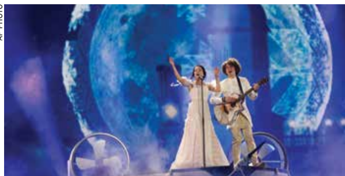
NaviBand from Belarus