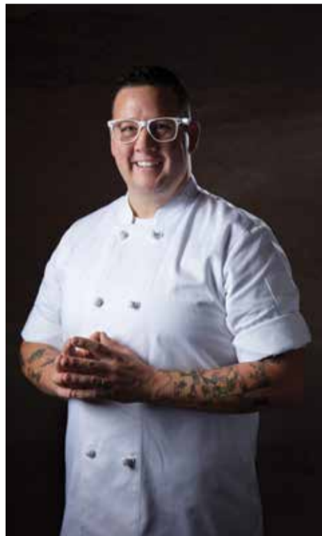
Chef Graham Elliott