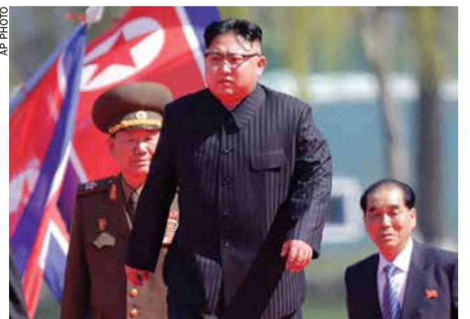
North Korean leader Kim Jong Un

In statements for foreign distribution, North Korea often refers to its leader Kim