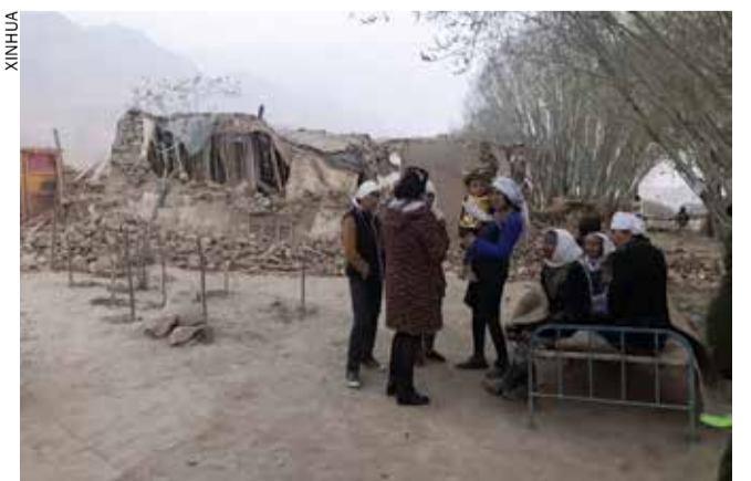
Residents gather near damaged houses following an earthquake in Kuzigun Village, in Xinjiang, yesterday

China's deadliest earthquake this century, a 7.9 magnitude temblor with a depth of 19 kilometers, struck Sichuan province in May 2008, killing nearly 90,000 people.