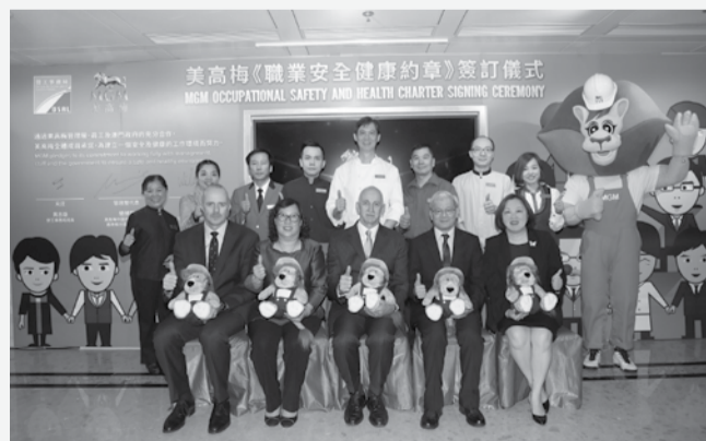
To further promote occupational health and safety (OHS), MGM signed the "Occupational Safety and Health Charter", witnessed by the Labour Affairs Bureau (DSAL).

The signing ceremony was held at MGM Macau's back-of-house area on May 10.