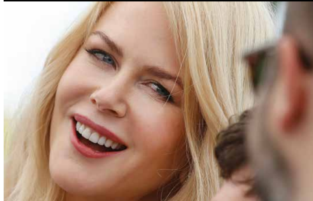
The Aussie star, Nicole Kidman poses for photographers during the photo call for the film The Killing Of A Sacred Deer at the 70th Cannes film festival.