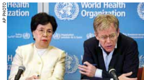
Margaret Chan (left) General Director of the World Health Organization (WHO)

At a time when the cash-strapped health agency is pleading for more money to fund its responses to health crises worldwide, it has struggled to get its travel costs under control. Senior officials have complained internally that U.N. staffers break new rules