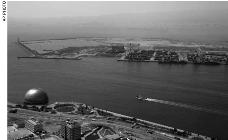
A boat sails near the Yumeshima island (top) in Osaka

Officials from Nagasaki to Hokkaido have raised their hands to host casino resorts in their cities. Some are now also criticizing the process, saying it will lead to big operators only wanting to partner with large cities. Members of the government panel debating the issue