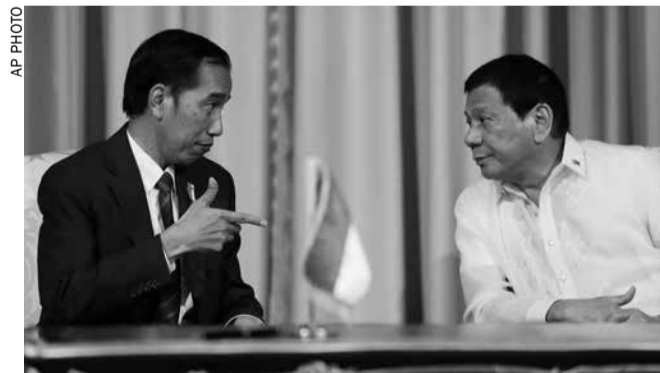
Indonesian President Joko "Jokowi" Widodo (left) and Philippine President Rodrigo Duterte during signing ceremony at the Malacanang Palace grounds in Manila

to deliver a policy speech at the Moscow State Institute of International Relations, bring Filipino business leaders to the Philippine-Russia Business Forum and meet with the Filipino community in Russia.