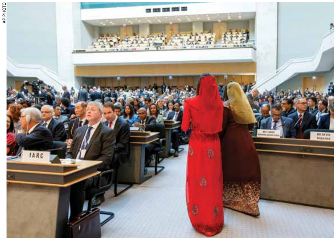
A general view pictured during the 70th World Health Assembly at the European headquarters of the United Nations in Geneva