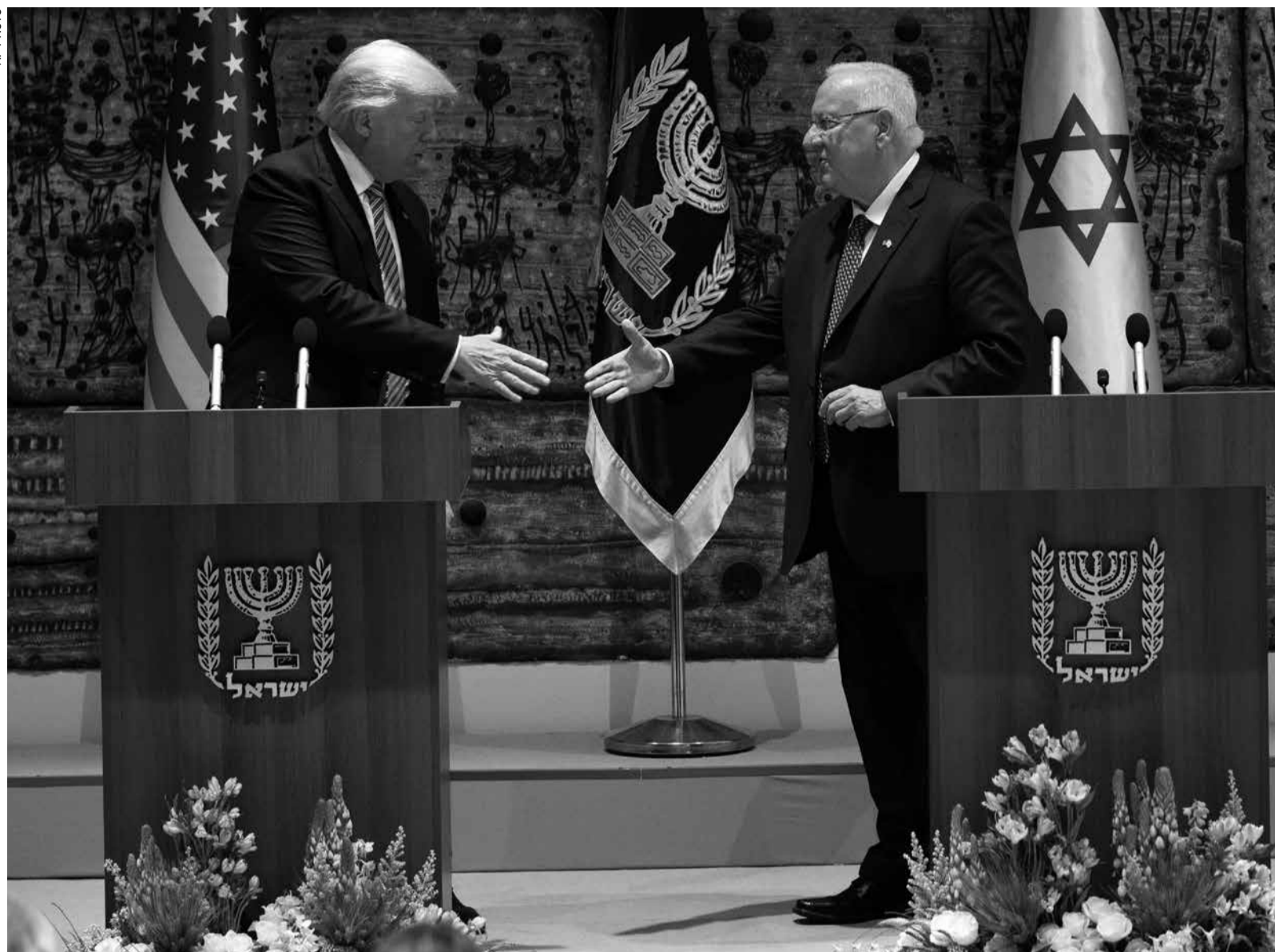
Donald Trump (left) shakes hands with Israeli President Reuven Rivlin after delivering statements