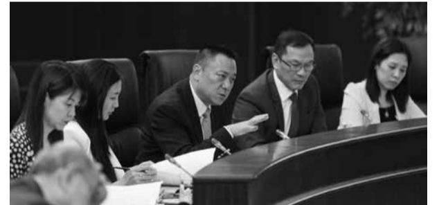
Lionel Leong (center)

creased thresholds will prevent government departments from breaking up service contracts into smaller ones," the secretary explained.