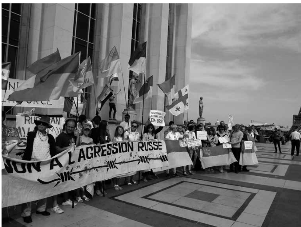
Demonstrators hold flags and a banner reading "No to Russian aggression" during a gathering at Trocadero next to the Eiffel Tower in Paris

his rivals, including far-right candidate Marine Le Pen and conservative Francois Fillon, who both backed ending Western sanctions against Moscow