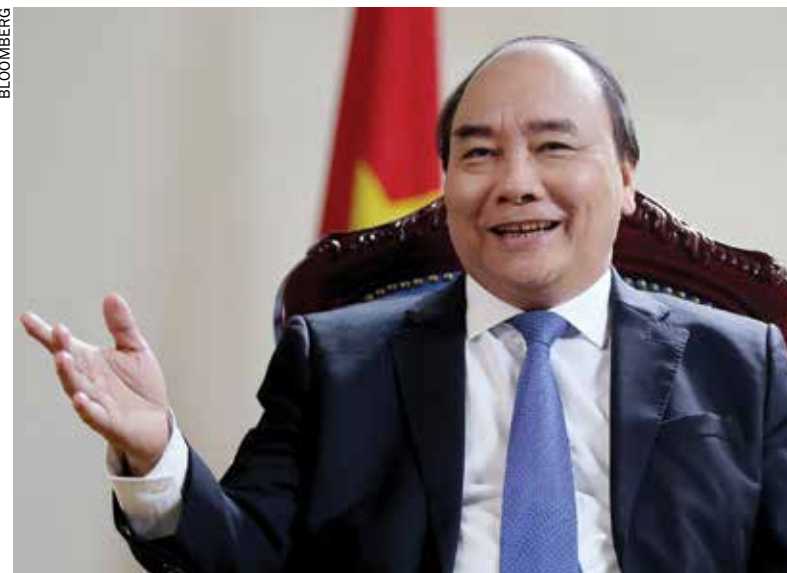
Vietnamese Prime Minister Nguyen Xuan Phuc

The government must balance efforts to spur gross do-