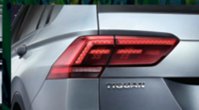
3D LED Taillight

The Tiguan 2 is a great all-grown-up SUV with distinctive styling which redefines its class and confidently points the way to the future. The new generation Tiguan is the first sport utility vehicle to be based on the modular transverse matrix (MQB), and it sets new standards in design, comfort and functionality. In doing so it of course remains capable of off-road, with a rugged all-wheel drive system that includes premium class technology for use on and off the highway. The Tiguan 2 is, then, both more SUV and more than an SUV.