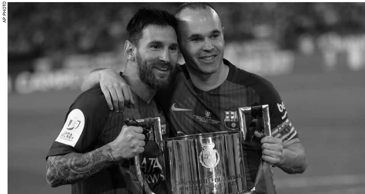
Messi (left) and captain Andres Iniesta pose with the trophy after the Copa del Rey final soccer match between Barcelona and Alaves

Barcelona had the highest scoring attack in the Spanish league with the competition's top two scorers in Messi and Luis Suarez. It also defended well, conceding four fewer goals than champion Real Madrid.