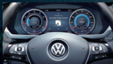
Active Info Display