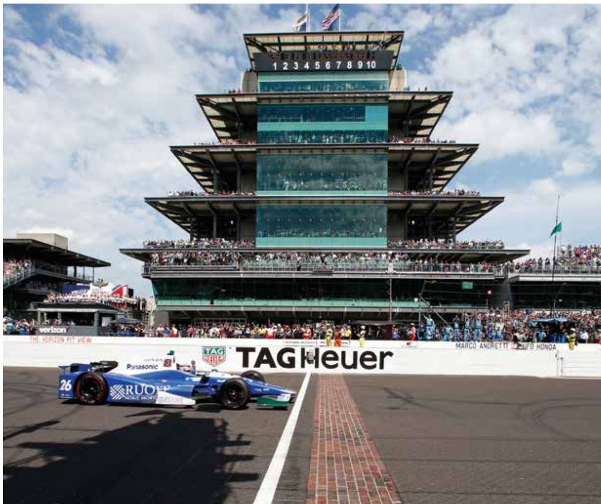
Takuma Sato of Japan celebrates as he crosses the Yard of Bricks to win the Indianapolis 500 auto race

victim to his engine late in the race. The crowd gave the Spaniard a standing ovation as he climbed from his car.