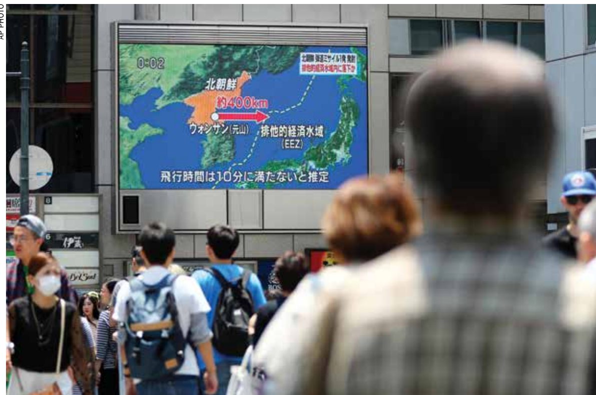
People walk near a screen reporting North Korea's missile launch in Osaka, Japan

Japan, Guam and even, according to some South Korean analysts, Alaska.