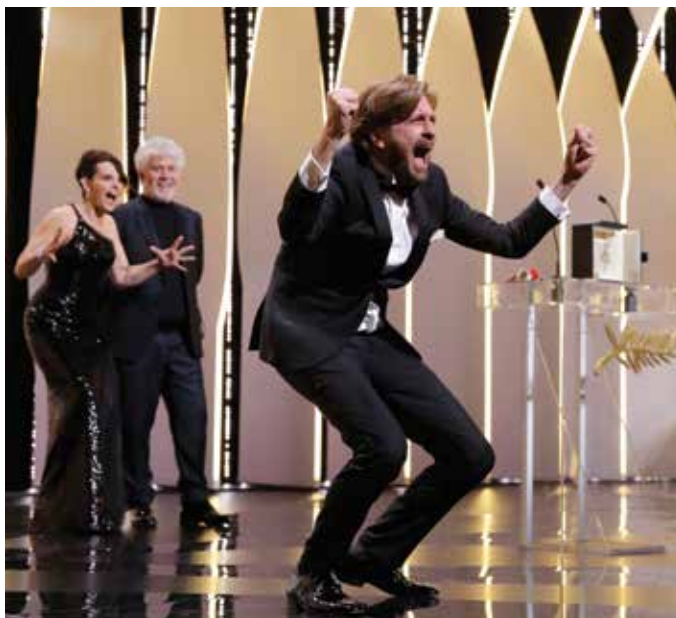
Ruben Ostlund (right) celebrates winning the Palme d'Or award presented by actress Juliette Binoche (back left) and jury president Pedro Almodovar (back right)

Coppola was one of three female filmmakers out of 19 in competition for the Palme this year. The first – and until now, only – female winner