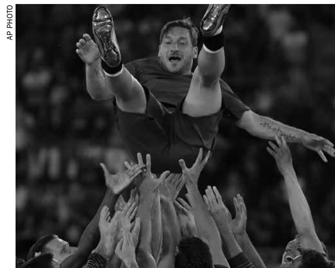
Totti is tossed in the air by his teammates

Fans also reacted negatively when James Pallotta, Roma's American owner, greeted Totti after the match.