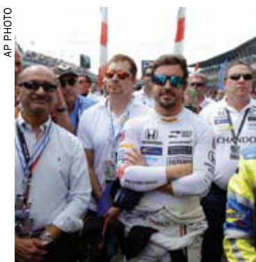
Fernando Alonso (center)

th he would take a break from a subpar F1 season and skip the Monaco Grand Prix to race in the Indy 500 for Andretti Autosport. His presence drew worldwide interest for "The Greatest Spectacle in Racing" and surely provided a television ratings boost for IndyCar's premier event.