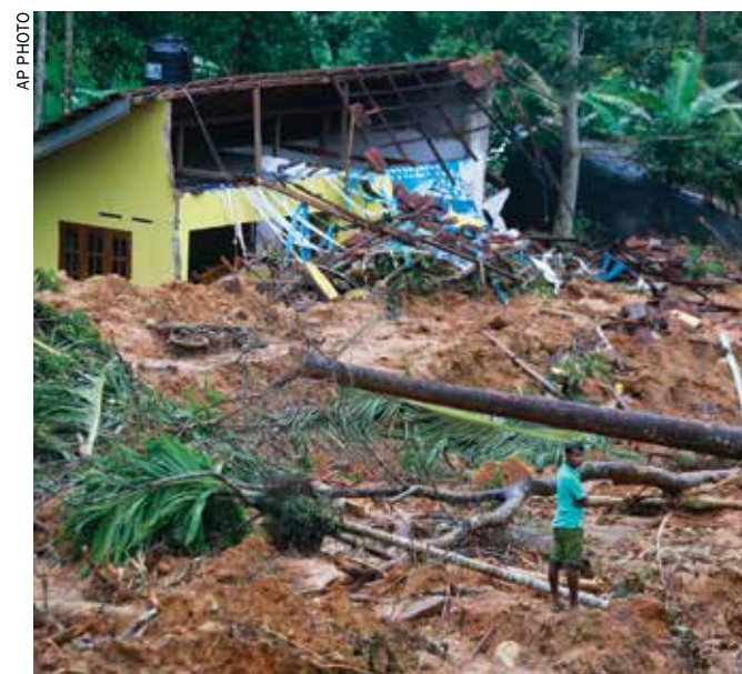
An aerial view of an inundated area of Kiriella, in Ratnapura district of Sri Lanka

The United Nations said it is donating water purification tablets, tents and other supplies for the displaced. India sent two shiploads of goods and some medical staff, and the Uni-