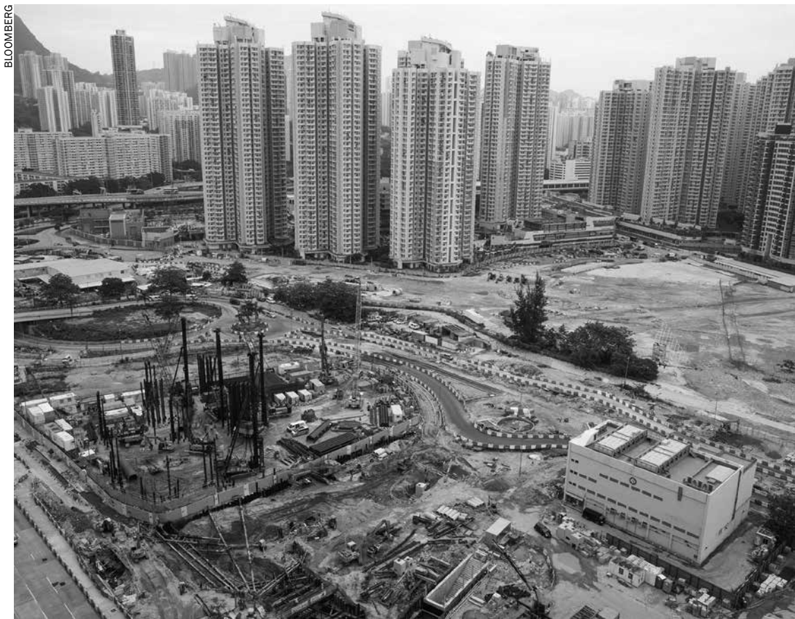
Cranes operate at land sites under construction at the former Kai Tak airport area in Hong Kong

The Hang Seng Properties Index of developers rose as much as 1.2 percent yesterday, up more than 20 percent this year. Bloomberg