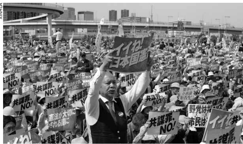
Tokyo citizens attend a protest earlier this month against Japanese Prime Minister Shinzo Abe's attempts to amend the nation's pacifist constitution

Japan's ruling party has long advocated a more drastic revision, but the public generally supports the war-renouncing