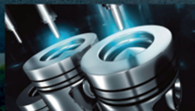
1.4TSI with 150HP