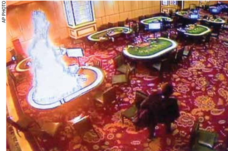
A gunman walks away after setting fire to a gambling table in the Resorts World Manila entertainment and gambling complex