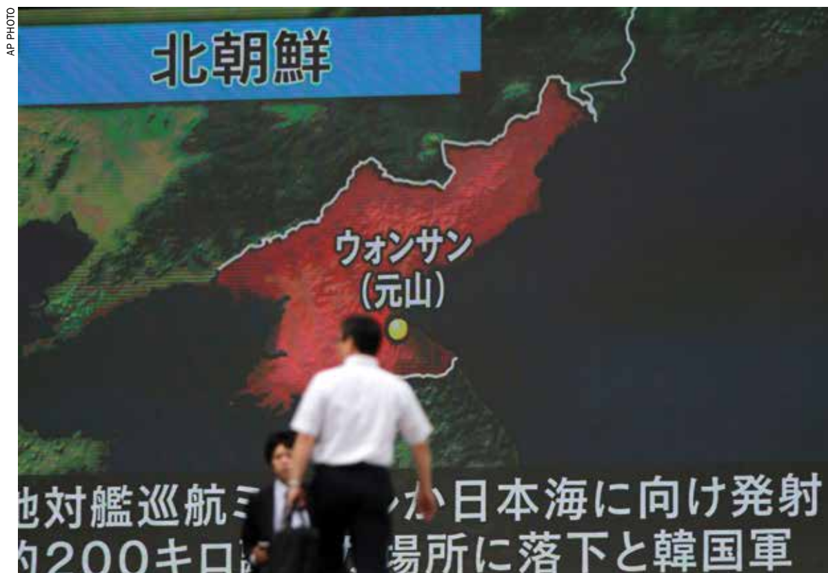
A screen in Tokyo shows a news program reporting about North Korea's missile firing from Wonsan

The North's missile tests present a difficult challenge to Moon. North Korea, which could have a working nuclear-tipped intercontinental ballistic missile in the next several years,