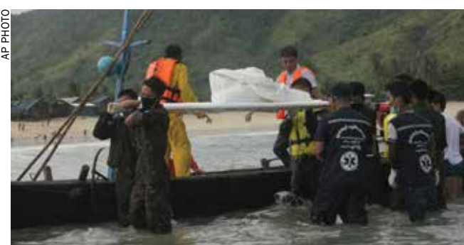
Rescue personnel carry bodies recovered by fishing vessels in the waters off San Hlan village in southern Myanmar

The Facebook page, the main source of official information about the crash, said the plane, carrying about 2.4 tons of cargo in addition to the 122 people aboard, was received in March last year and since