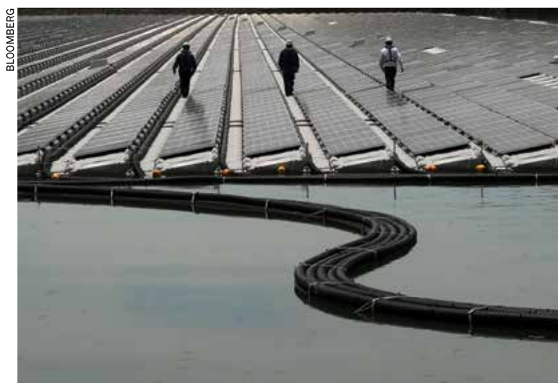
The world's largest floating solar plant, with panels set up on a reservoir, in Kasai, Hyogo Prefecture, Japan

Meanwhile, construction has begun on China's first large-scale effort to trap and store carbon dioxide emissions. The Yanchang Integrated Carbon Capture and Storage Project, Asia's first commercial carbon