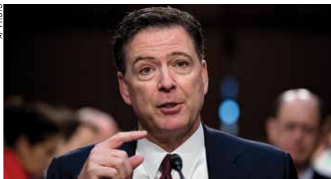
Former FBI director James Comey

Comey made his comments as the packed hearing got underway, bringing Washington and parts of