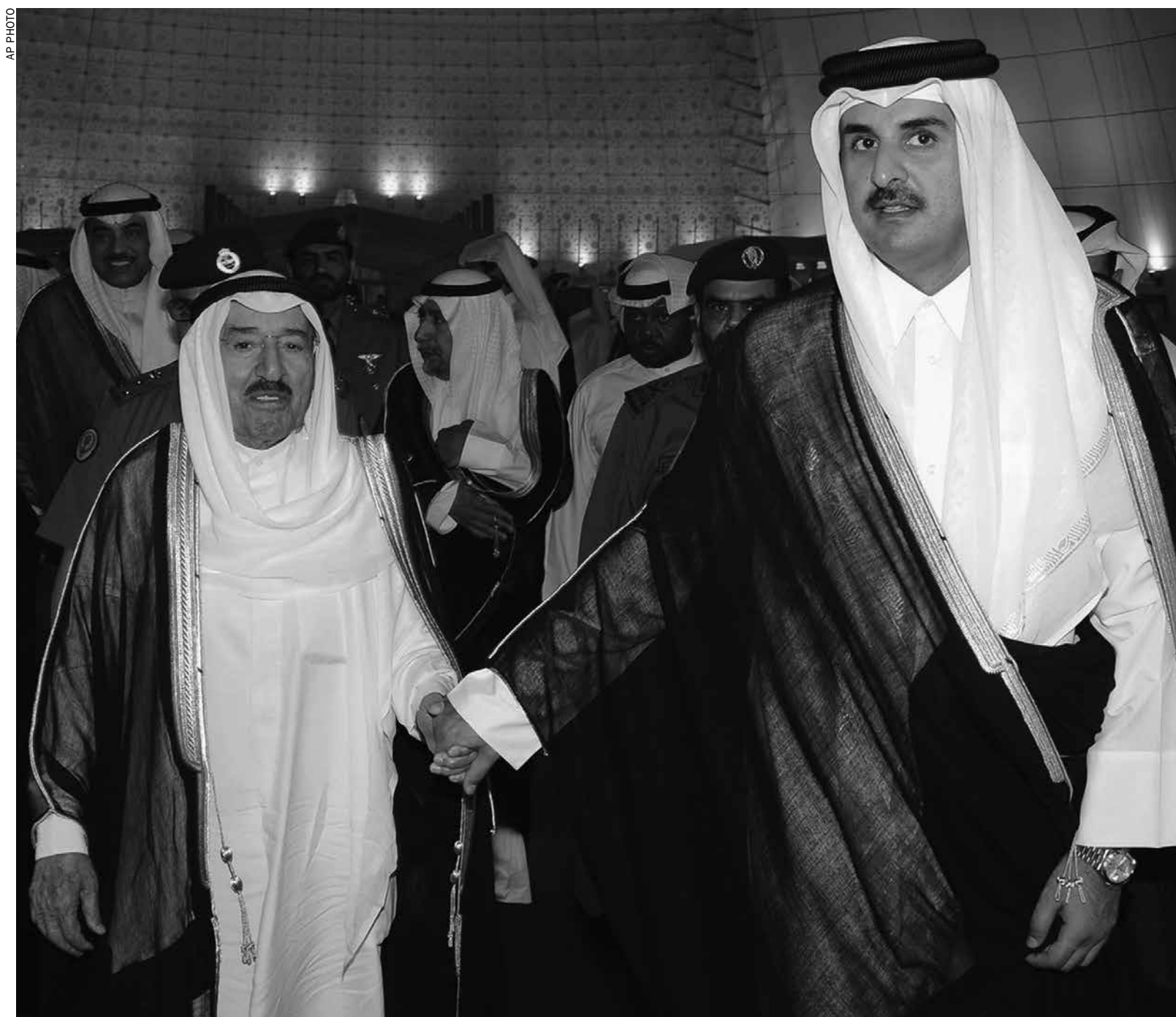
Kuwait's Emir Sheikh Sabah Al Ahmad Al Sabah (left) holds the hand of Qatar's Emir Sheikh Tamim bin Hamad Al Thani in Doha, Qatar