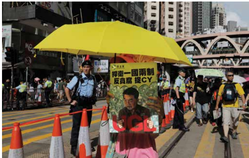
A protestor carries a poster with an illustration of former Hong Kong Chief Executive Leung Chun-ying and Chinese words reading: "Defend one country two systems, Fight corruption. Catch CY"