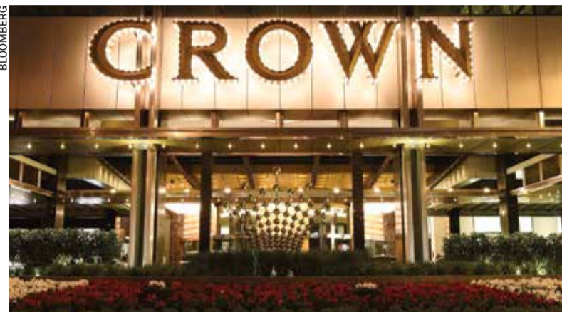
The Crown Resorts Ltd. logo is displayed at the entrance to the Crown Towers hotel in Melbourne

"The company has basically transformed itself into almost a different investment vehicle, much more focused on income