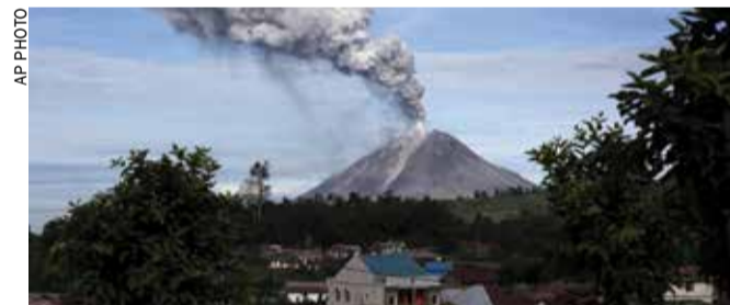
Mount Sinabung spews volcanic ash into the air

While economists mostly agree that a single, nationwide tax will streamline business, there are concerns about how an economy as unwieldy as India's will transition to a system that involves filing monthly tax returns online.