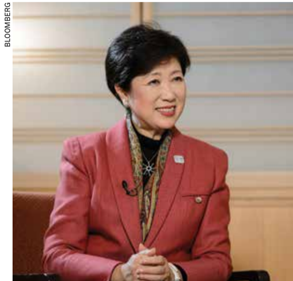
Yuriko Koike, governor of Tokyo

Koike's Tomin First party and the Komei party, its new ally and the LDP's longtime coalition partner in parliament, are certain to