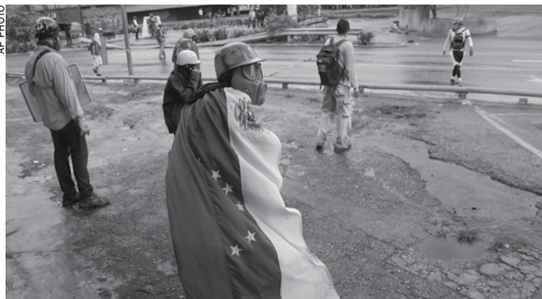
Demonstrators look back during protests in Caracas

who have lost their children in the street protests. I appeal for an end to the violence and for a peaceful and democratic solution to the crisis." The Vatican sponsored a dialogue last year that failed. Recently, Venezuelan bishops have travelled to the Vatican and briefed Francis on their criticism of President Nicolas Maduro's authoritarian bent.