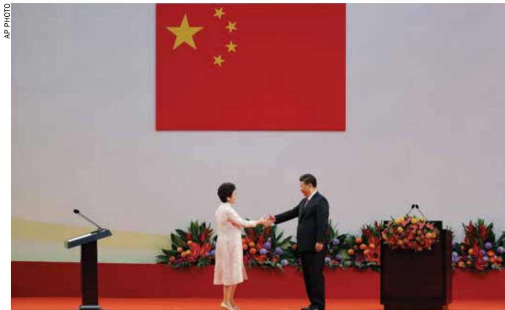
Xi Jinping (right) shakes hands with Hong Kong's new Chief Executive Carrie Lam after Xi administered the oath for a five-year term in office at the Hong Kong Convention and Exhibition Center