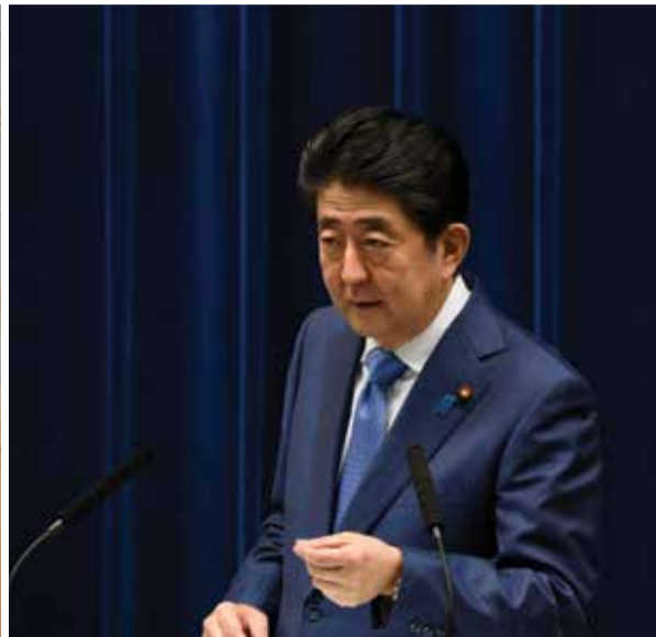
Shinzo Abe, Japanese Prime Minister

secure a majority of the assembly seats together, making it easier for Koike to push through her political agenda.