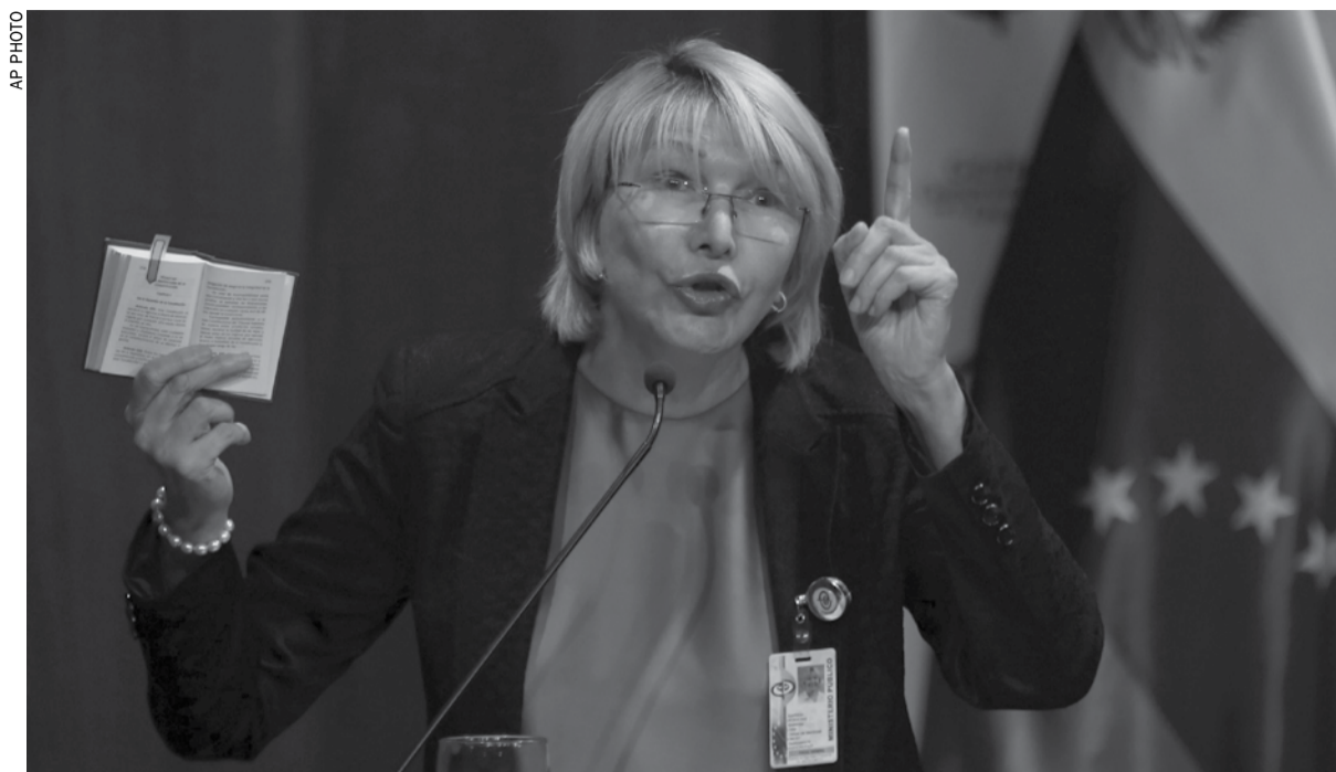
Venezuela's chief prosecutor Luisa Ortega