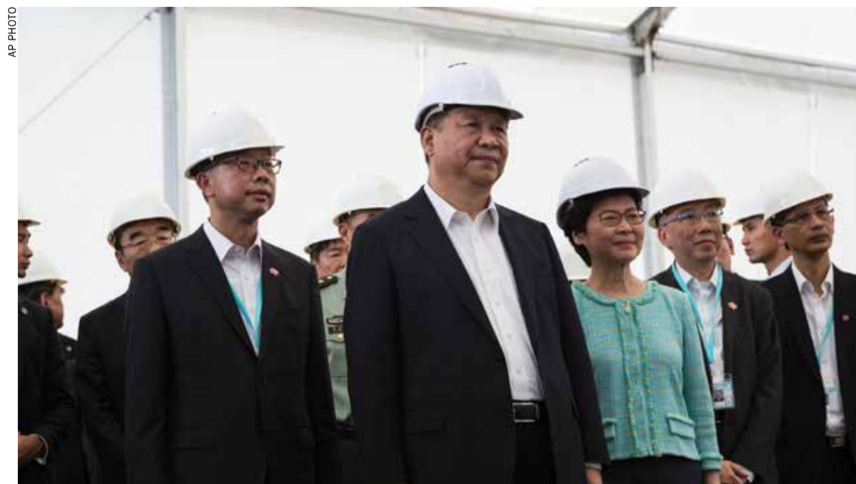
Xi Jinping (center) accompanied by Hong Kong Chief Executive Carrie Lam (third right) watches a presentation during their visit to a section of the Hong Kong-Zhuhai-Macau Bridge