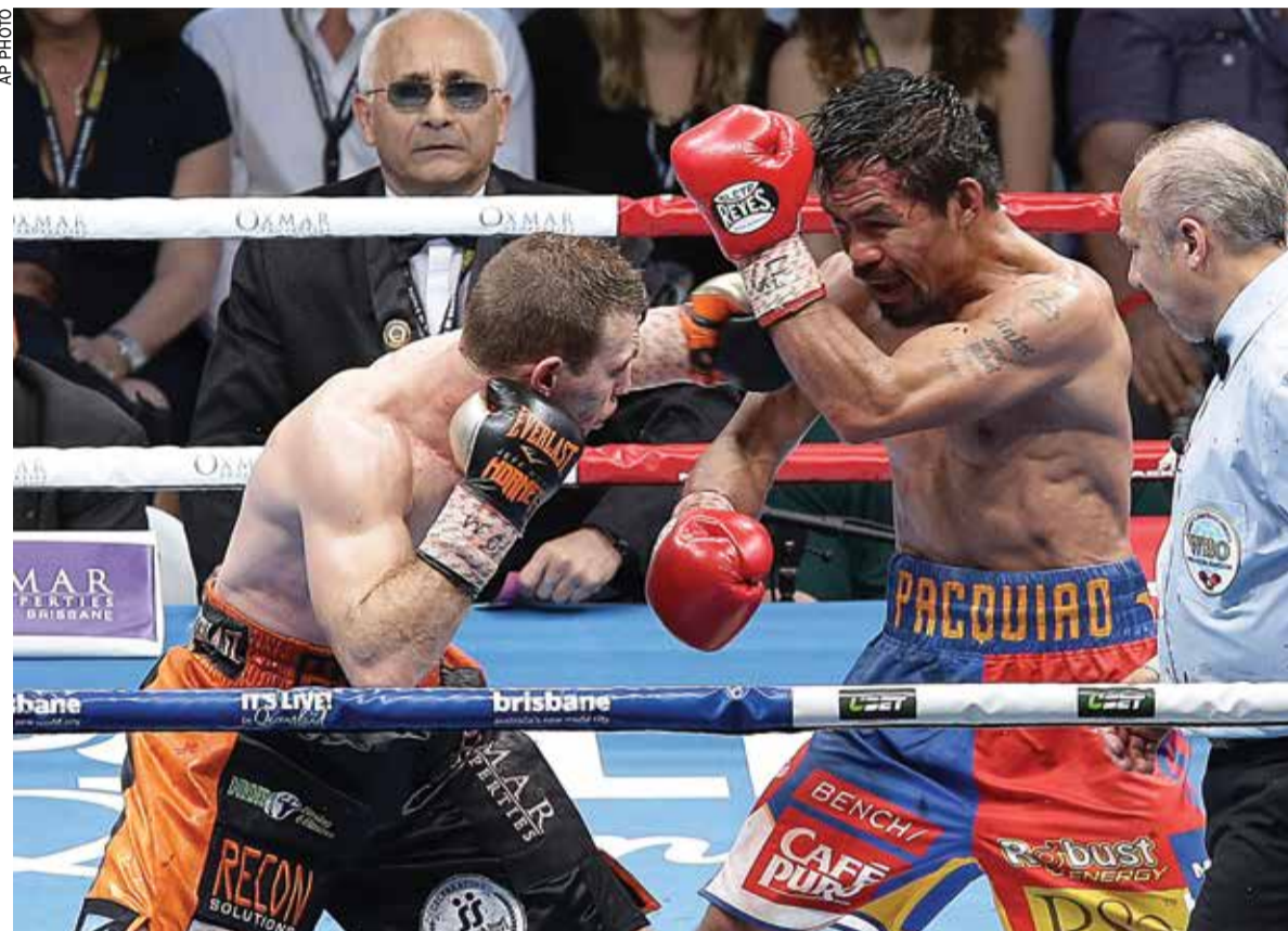
Manny Pacquiao of the Philippines (right), and Jeff Horn of Australia fight during their WBO World welterweight title bout in Brisbane

"When you come into someone's backyard, you need to really do a number on them or knock