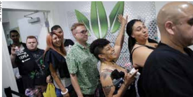
People wait in line at the Essence cannabis dispensary in Las Vegas

Those 21 and older with a valid ID can buy up to an ounce of pot. As of Friday, the state had licensed 44 dispensaries to sell recreational marijuana.