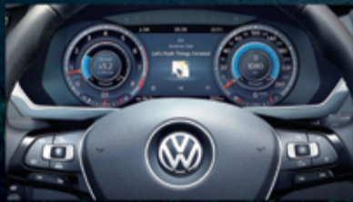
Active Info Display