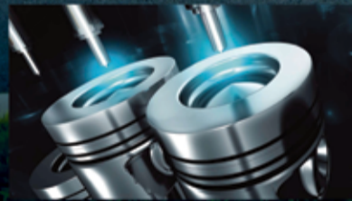
1.4TSI with 150HP