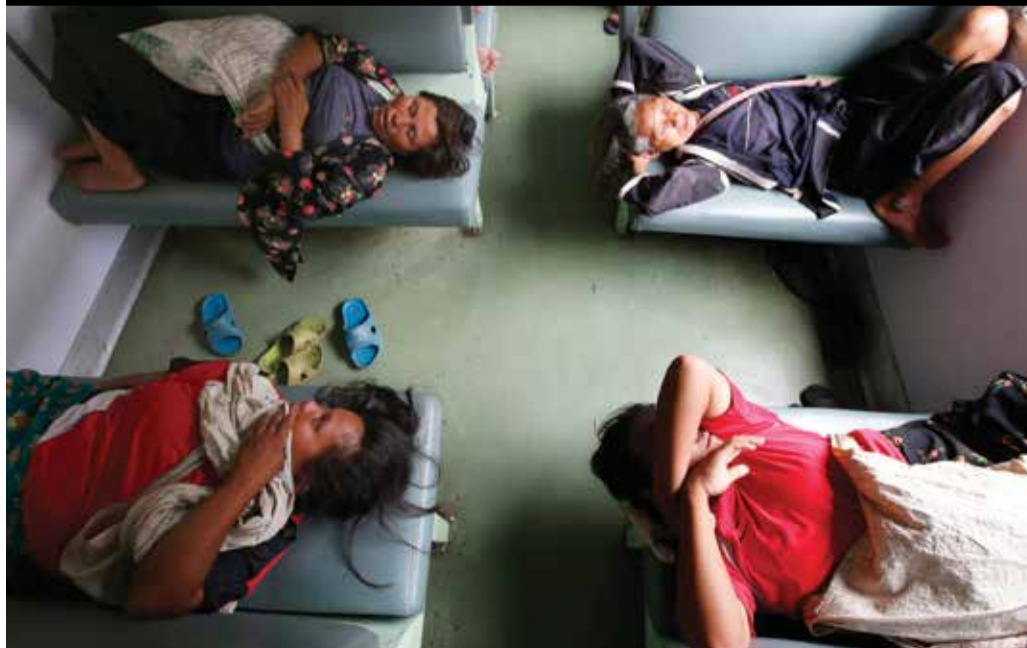
Passengers sleep in a train bound for the northern province of Chiang Mai at Hua Lampong railway station in Bangkok, Thailand. Hua Lampong is the main railway station in the country.