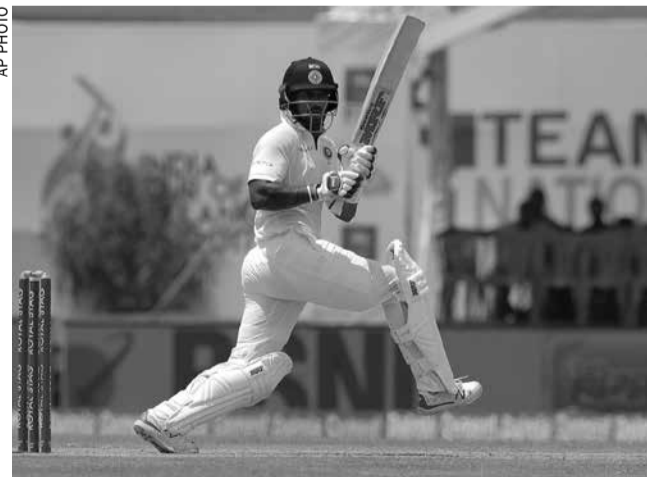
India's Shikhar Dhawan

re tea. But the way I was playing, I was confident that I could clear the mid-off fielder and I was almost hitting a boundary per over."