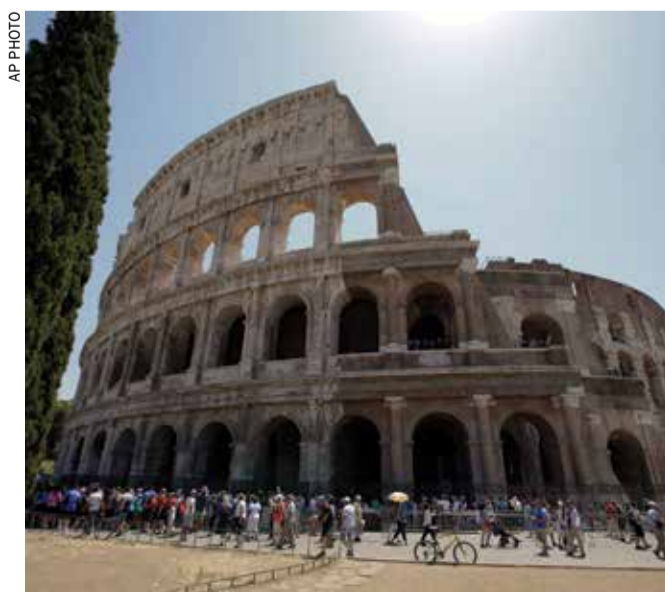
A view of the Colosseum after the first stage of the restoration work was completed in Rome

The number of visitors to the Colosseum increased 12.5 percent during the first half of the year compared to the same period last year, while ticket sales and similar revenues increased by nearly 11 percent, the minister said. AP