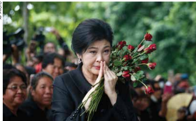
Thailand's former Prime Minister Yingluck Shinawatra arrives at the Supreme Court on July 21 for the last day of her hearing in Bangkok

"The government has chosen to exploit its power to freeze my assets without waiting for the Administrative Court's ruling. The timing of their decision comes a