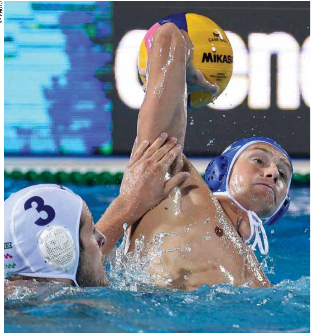
Roman Shepelev of Russia (right) is challenged by Krisztian Manhercz of Hungary for the ball during the men's water polo quarterfinal match Hungary vs Russia at the 17th FINA Swimming World Championships

Punches were thrown at the beginning of the second, but it didn't stop the Hungarian advance, or the party. Fans whooped, chan-