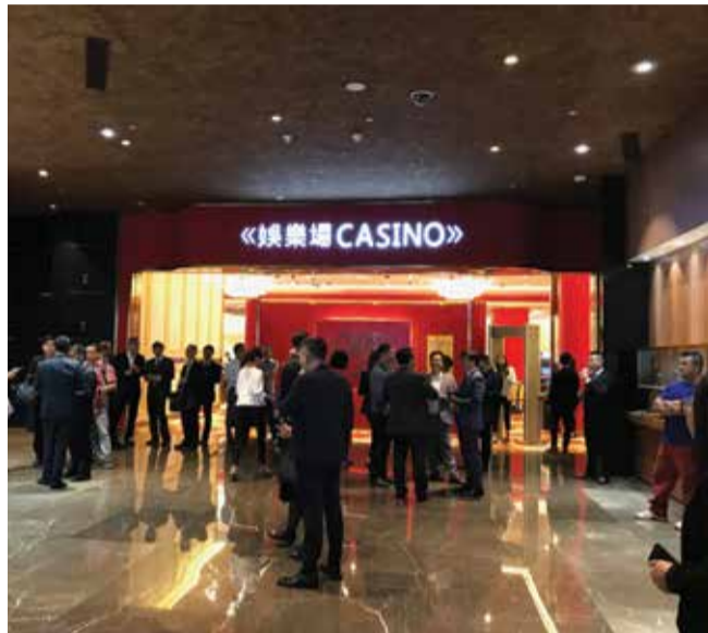
Tables operating at the Macau Jockey Club were relocated to the new hotel