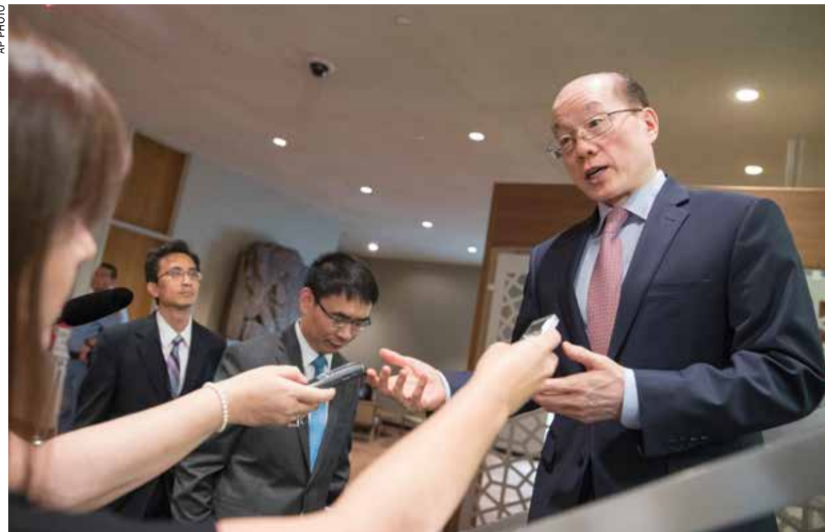
Chinese Ambassador to the UN and current Security Council President Liu Jieyi (right)

The Security Council has already imposed six rounds of progressively tougher sanctions against North Korea, but so far that has failed to halt the coun-