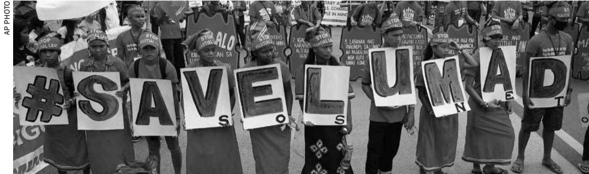
Young Indigenous People known as Lumads form the words “Save Lumad schools” as they join a march of thousands of protesters to coincide with the state of the nation address

In a televised news conference he called late Monday shortly after