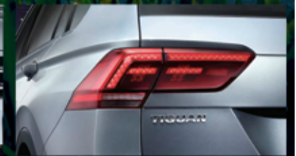
3D LED Taillight

The Tiguan 2 is a great all-grown-up SUV with distinctive styling which redefines its class and confidently points the way to the future. The new generation Tiguan is the first sport utility vehicle to be based on the modular transverse matrix (MQB), and it sets new standards in design, comfort and functionality. In doing so it of course remains capable of off-road, with a rugged all-wheel drive system that includes premium class technology for use on and off the highway. The Tiguan 2 is, then, both more SUV and more than an SUV.