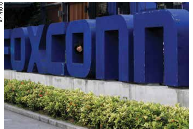
A worker looks out through the logo at the entrance of the Foxconn complex in the southern Chinese city of Shenzhen