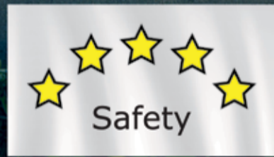
5 star NCAP