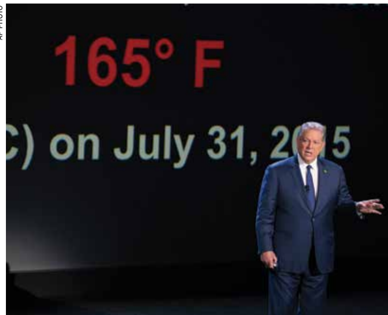
This image released by Paramount Pictures shows Al Gore in "An Inconvenient Sequel: Truth to Power"

"I'm under no illusion that there's any position with as much chance to do good as president of the United States, but I'm very grateful to have found another way to serve the public interests. I'm devoting my life to this and hoping to make a big difference,"