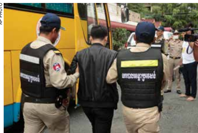
A Chinese national arrested over an alleged internet scam, is escorted by police officers to be deported at the immigration office in Phnom Penh

Taiwanese authorities say such deportations reflect the great influence China