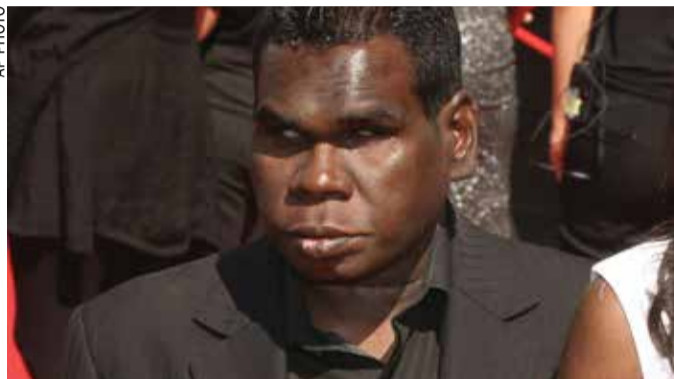
Aboriginal singer Geoffrey Gurrumul Yunupingu

He released another two top-five studio albums – "Rakala" and "The Gospel Album" – and performed around the world for audiences including former President Barack Obama and Queen Elizabeth II.