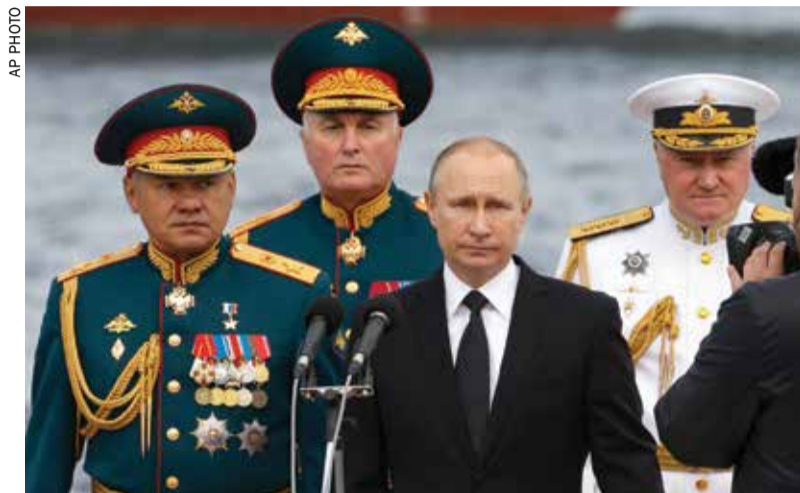
President Vladimir Putin (center) Defence Minister Sergei Shoigu (left) Commander-in-Chief of the Russian Navy Vladimir Korolev (right) and Commander of Western military district Andrei Kartapolov attend a military parade

"We had hoped that the situation will somehow change, but