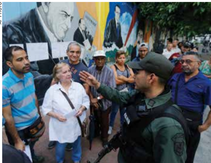
Venezuela: Voters receive instructions about their voting machine place by a National Guard officer outside of a poll station

mockery and anger from members of the opposition, who said they believed between 2 million and 3 million people voted. One well-respected independent analysis said 3.6 million appeared to have voted.