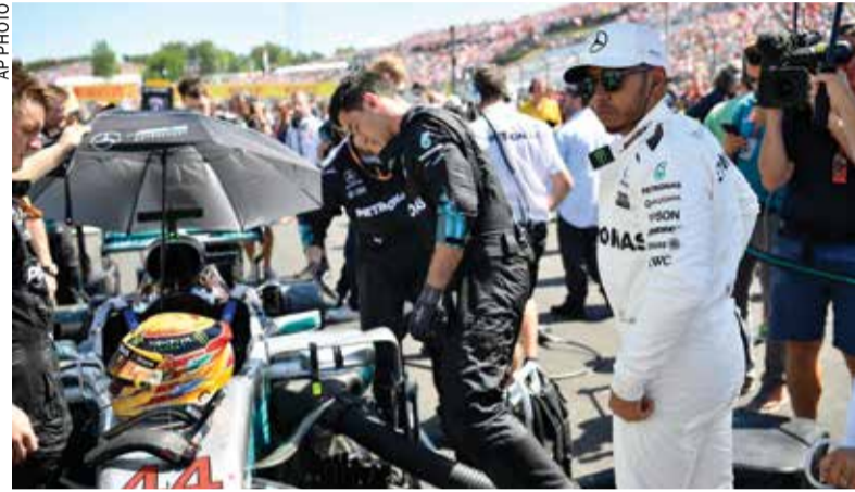
Lewis Hamilton (right)

the Hungarian GP, with Vettel winning from pole position ahead of Ferrari teammate Kimi Raikkonen.