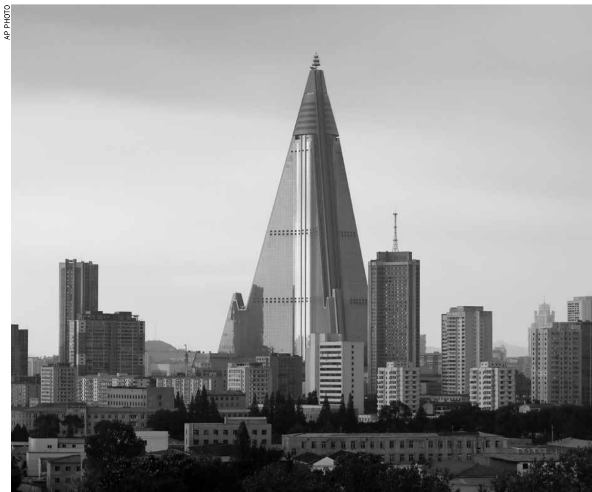
The 105-story pyramid shaped Ryugyong hotel towers over residential buildings in Pyongyang