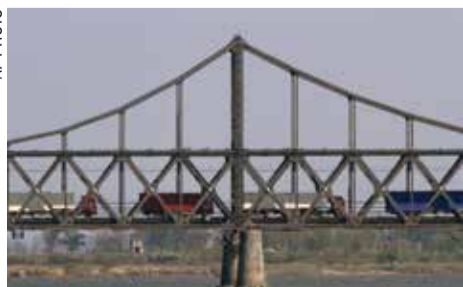
In this October 2016 photo, loaded trucks are seen crossing the friendship bridge connecting China and North Korea in Dandong