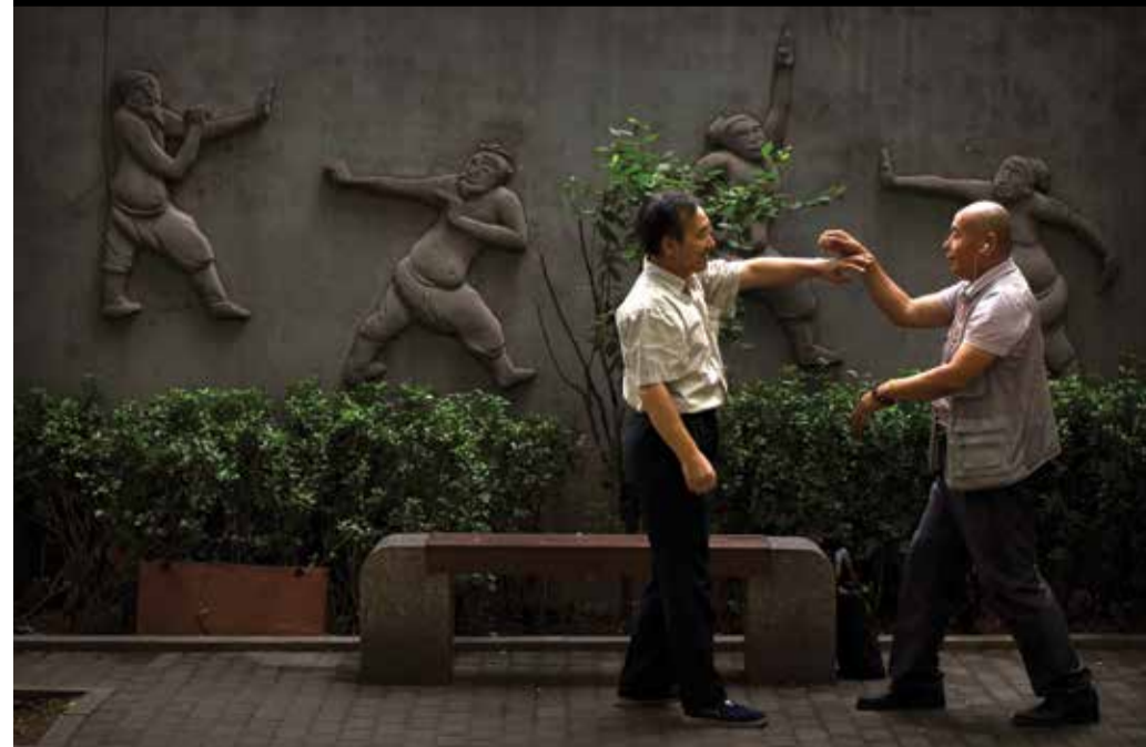
Two to tango. Two men practice martial arts techniques at a public park in Beijing.