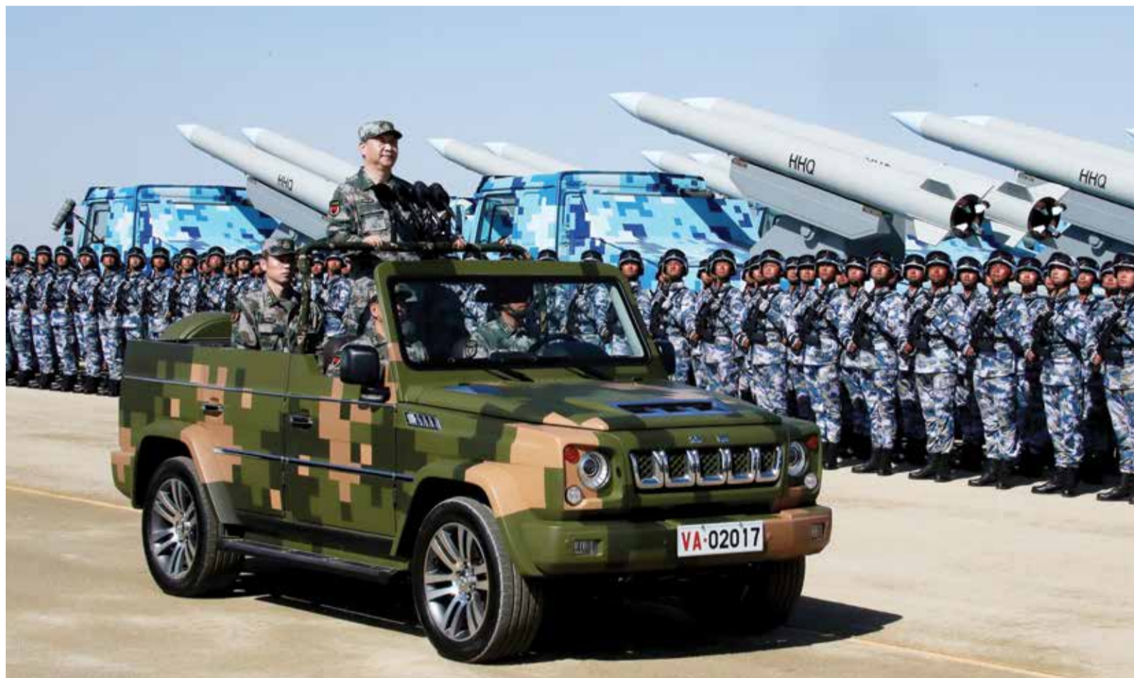
'A strong army is needed now more than ever' Xi said, without specifically addressing North Korea or Trump's comments