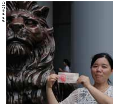
A woman poses for a photograph at the HSBC building in Hong Kong

For the first half of the year, net profit rose 10 percent to $7 billion as revenue adjusted for currency fluctuations and one-off gains and losses rose