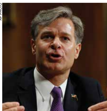
Christopher Wray

"This is a tough time to take this tough job," Sen. Amy Klobuchar, D-Minn., said during a relatively low-key Senate debate of the nomination. "The previous FBI director, as we know, was fired because of the Russia investigation. The former acting attorney general was fired. And we've had a slew of other firings throughout the government over the last few months."