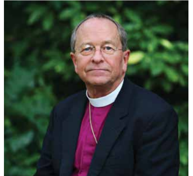
Reverend Canon Gene Robinson