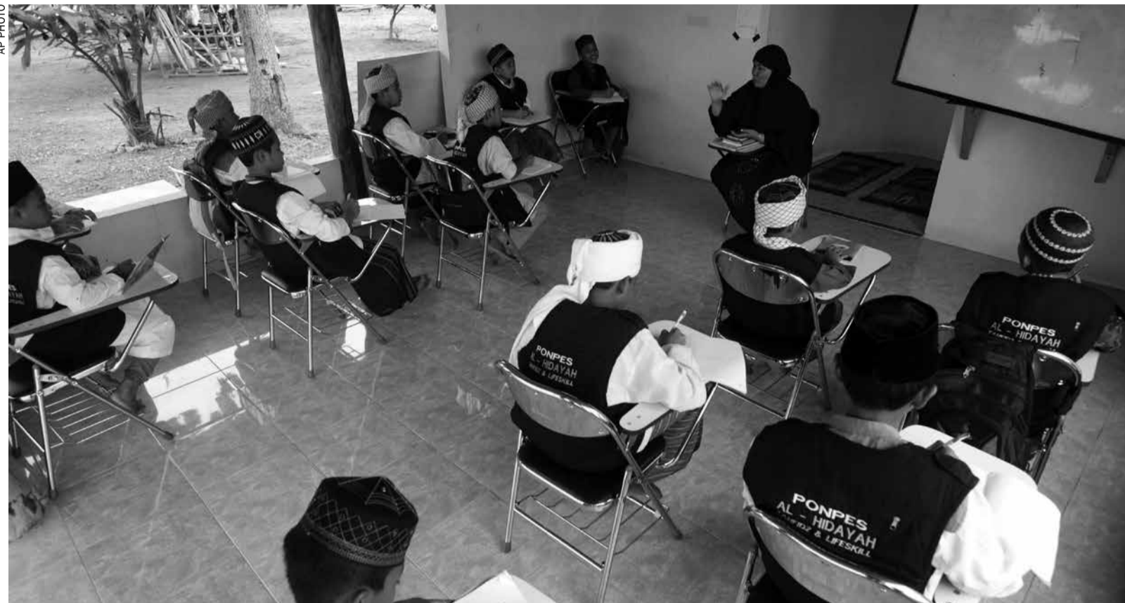
A class at Al Hidayah Islamic Boarding School in Sei Mencirim, North Sumatra