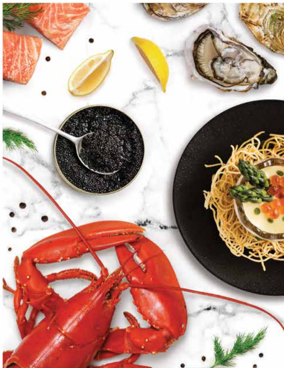
©2017 Marriott International, Inc. All Rights Reserved. St. Regis and its logos are the trademarks of Marriott International, Inc., or its affiliates.