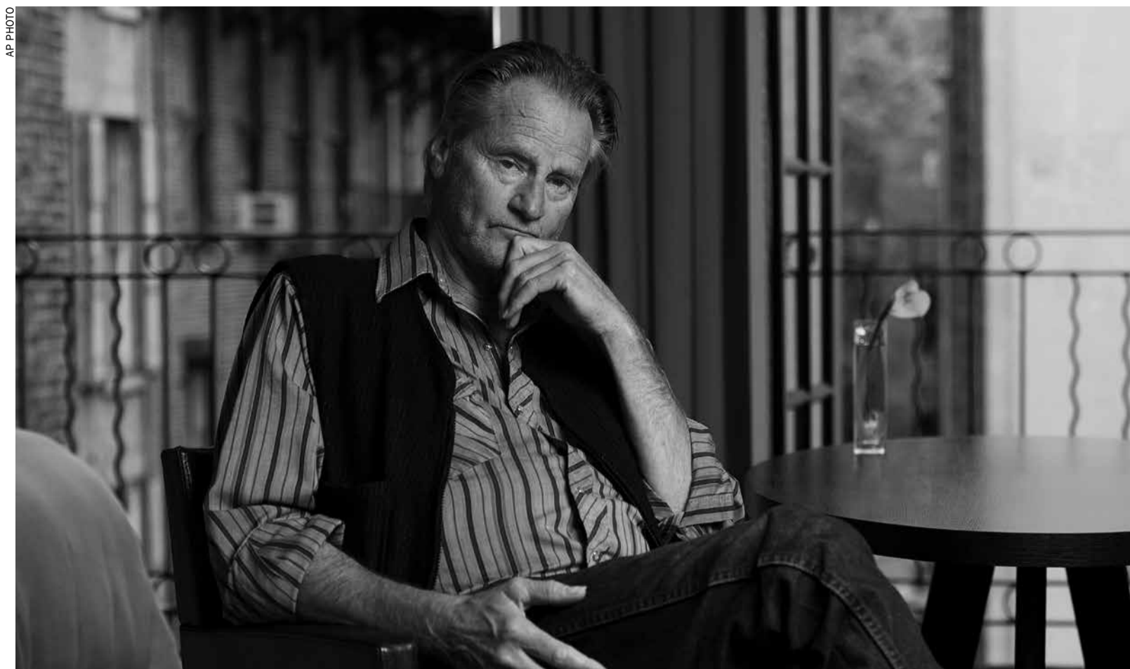
Sam Shepard, the Pulitzer Prize-winning playwright, Oscar-nominated actor and celebrated author (New York, 2011)