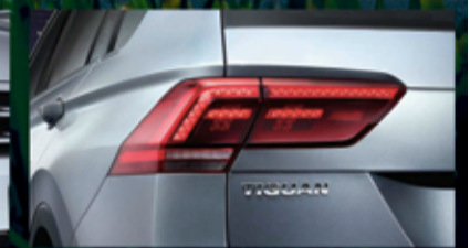
3D LED Taillight

The Tiguan 2 is a great all-grown-up SUV with distinctive styling which redefines its class and confidently points the way to the future. The new generation Tiguan is the first sport utility vehicle to be based on the modular transverse matrix (MQB), and it sets new standards in design, comfort and functionality. In doing so it of course remains capable of off-road, with a rugged all-wheel drive system that includes premium class technology for use on and off the highway. The Tiguan 2 is, then, both more SUV and more than an SUV.