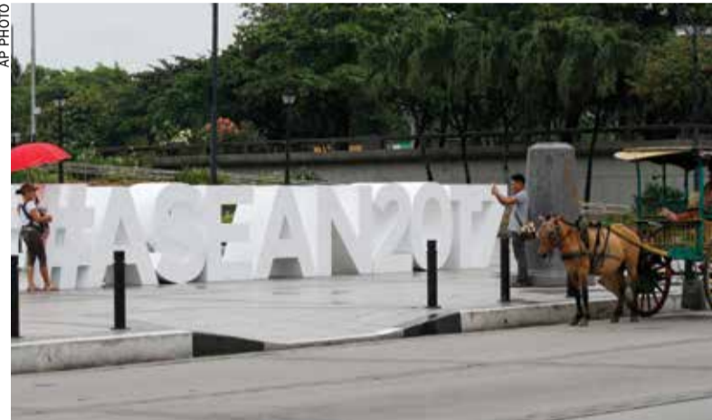
The 50th ASEAN Foreign Ministers' Meeting and its regional partners is taking place in suburban Pasay city, south of Manila

The long-seething disputes in the South China Sea, alarm over North Korea's missile tests and the rise of Islamic radicalism in