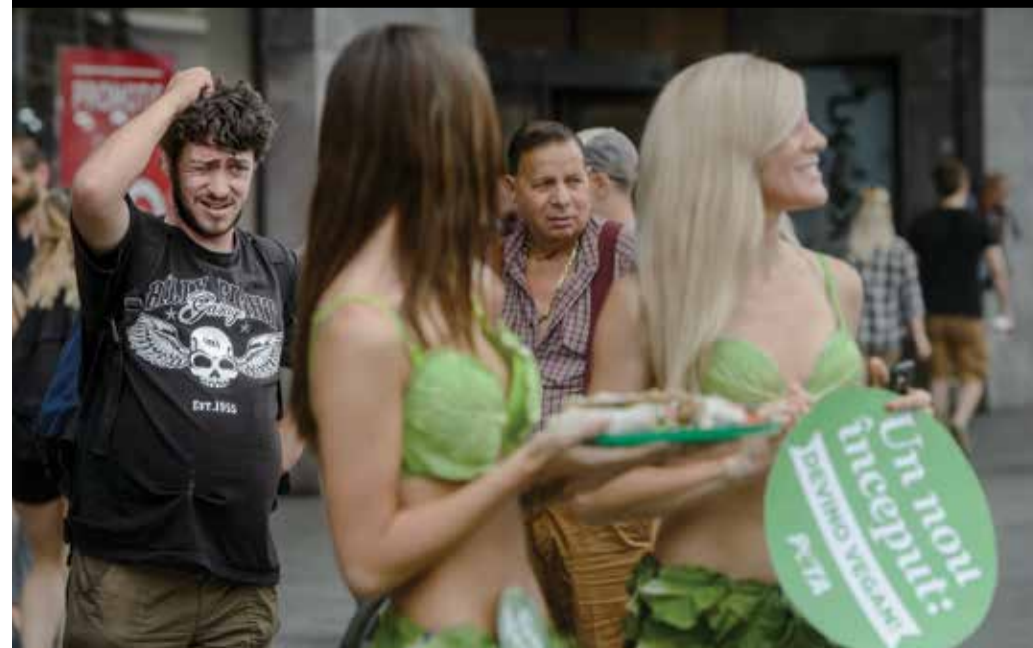
Start fresh. A man grimaces walking by the "Lettuce Ladies", a group of PETA activists, during an event promoting a vegan lifestyle, downtown Bucharest, Romania, this month. The sign reads in Romanian 'start fresh: become vegan.'