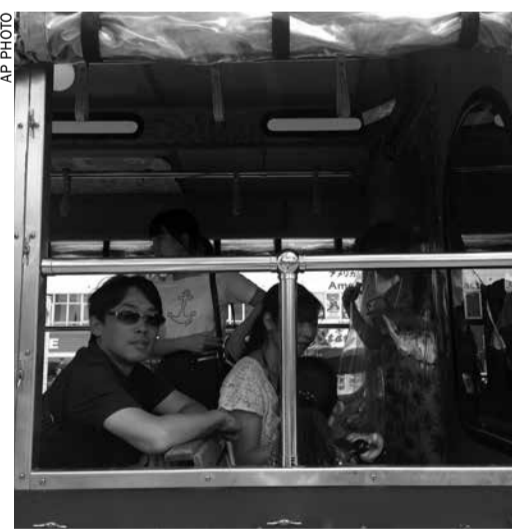
Visitors sit on a tour bus in Tumon, Guam, yesterday

The agency has been relaying assurances from the governor and defense officials that Guam is protected and safe, he said.