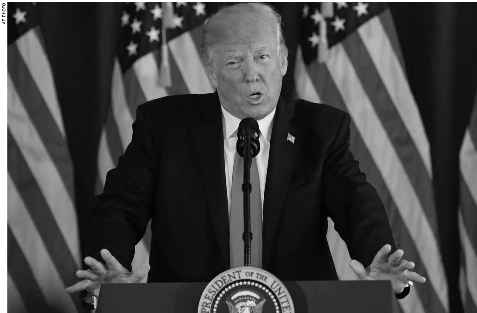
President Trump speaks about the ongoing situation in Charlottesville