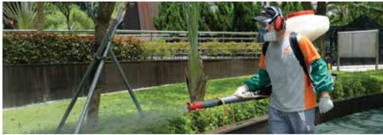
A mosquito eradication action conducted by a IACM staff member