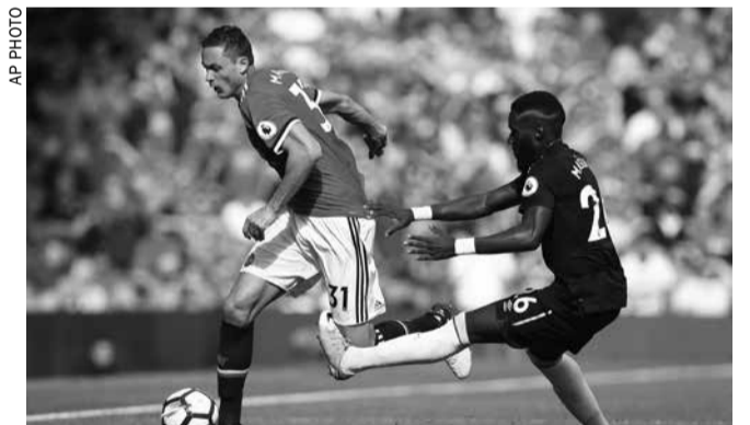
Nemanja Matic (left) gets past West Ham United's Arthur Masuaku during the EPL match between Manchester United and West Ham United

at the moment. Conte is short on numbers after a frustrating summer in the transfer market. Tiemoue Bakayoko was signed from Monaco, to complement Matic rather than replace him. Bakayoko is currently out injured, leaving Chelsea with Cesc Fabregas and N'Golo Kante as central midfielders.