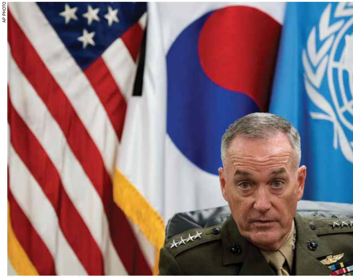
US Joint Chiefs Chairman Gen. Joseph Dunford at a news conference at U.S. Army Garrison Yongsan, Seoul

The U.S.-North Korea impasse, which has simmered since the end of the Korean War in 1953, has grown more tense in recent months over worries that the North's nuclear weapons program is nearing the ability to target the U.S. mainland. Pyongyang tested two intercontinental ballistic missiles last month.