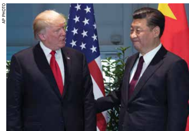
Donald Trump, left, and Xi Jinping at a meeting on the sidelines of the G-20 Summit in Hamburg this year

In a phone call Friday, Trump praised Chinese President Xi Jinping for backing the recent U.N. vote to impose tougher sanctions on North Korea, and the leaders reaffirmed their commitment to a nuclear-free Korean Pen-