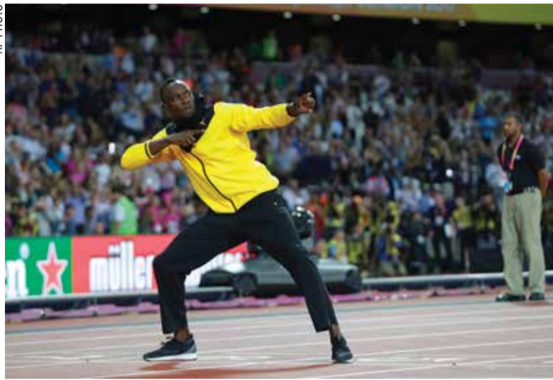
Usain Bolt makes his trademark gesture during a lap of honor at the end of the World Athletics Championships in London

"Someone tried to blame me, and said I started it," Bolt said of a 10-day run filled with upsets and surprises. "It was just one of those things. It was one of those championships where everything does not go your way."