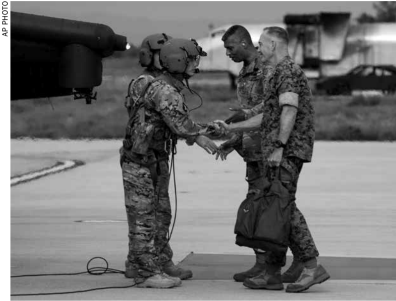
U.S. Army chiefs salute at a base in South Korea

The top U.S. military officer, Marine Corps Gen. Joseph Dunford, is traveling in Asia and expected to meet with leaders in South Korea, Japan and China. Dunford, the chairman of the Joint Chiefs of Staff, told reporters traveling with him that he aims to "sense what the temperature