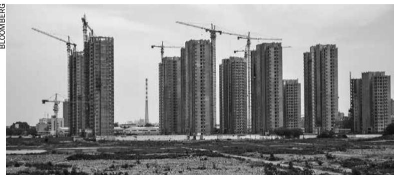
Residential buildings stand under construction in Jining, China