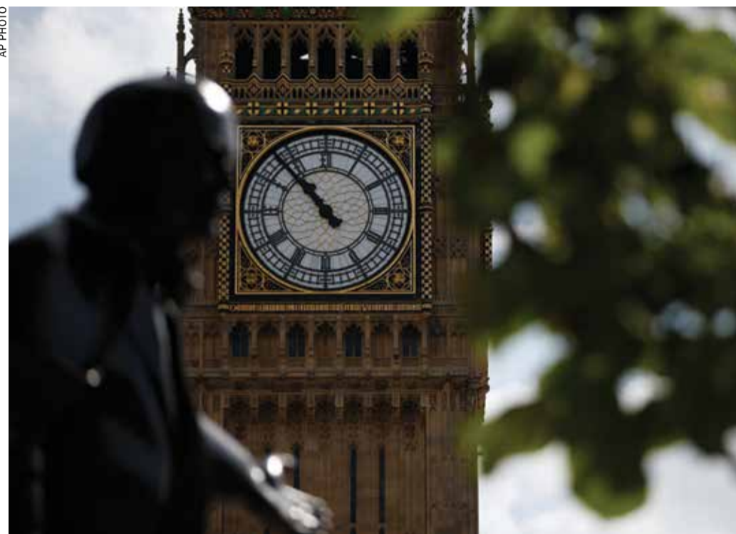
The statue of former British Prime Minister David Lloyd George is silhouetted against the Queen Elizabeth Tower which holds the bell known as 'Big Ben' in London

THE bongos will soon be gone. Big Ben — the huge clock bell of Britain's Parliament — will fall silent next week as a four-year restoration project gets underway.