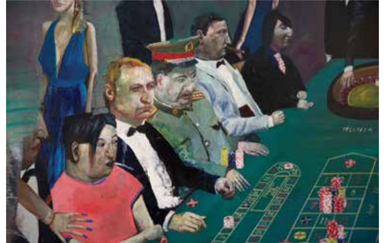
A painting by Konstantin Bessmertny featured in the exhibition

According to a press release from AFA, the exhibition is curated based on the theme "Beginner's Mind." The term comes from a Buddhist classic text of Avatamsaka Sutra which is "The very beginning mind itself is the most accomplished mind of true enlightenment." It is noted as the "best mind" but the most difficult one to attain. While the founders have