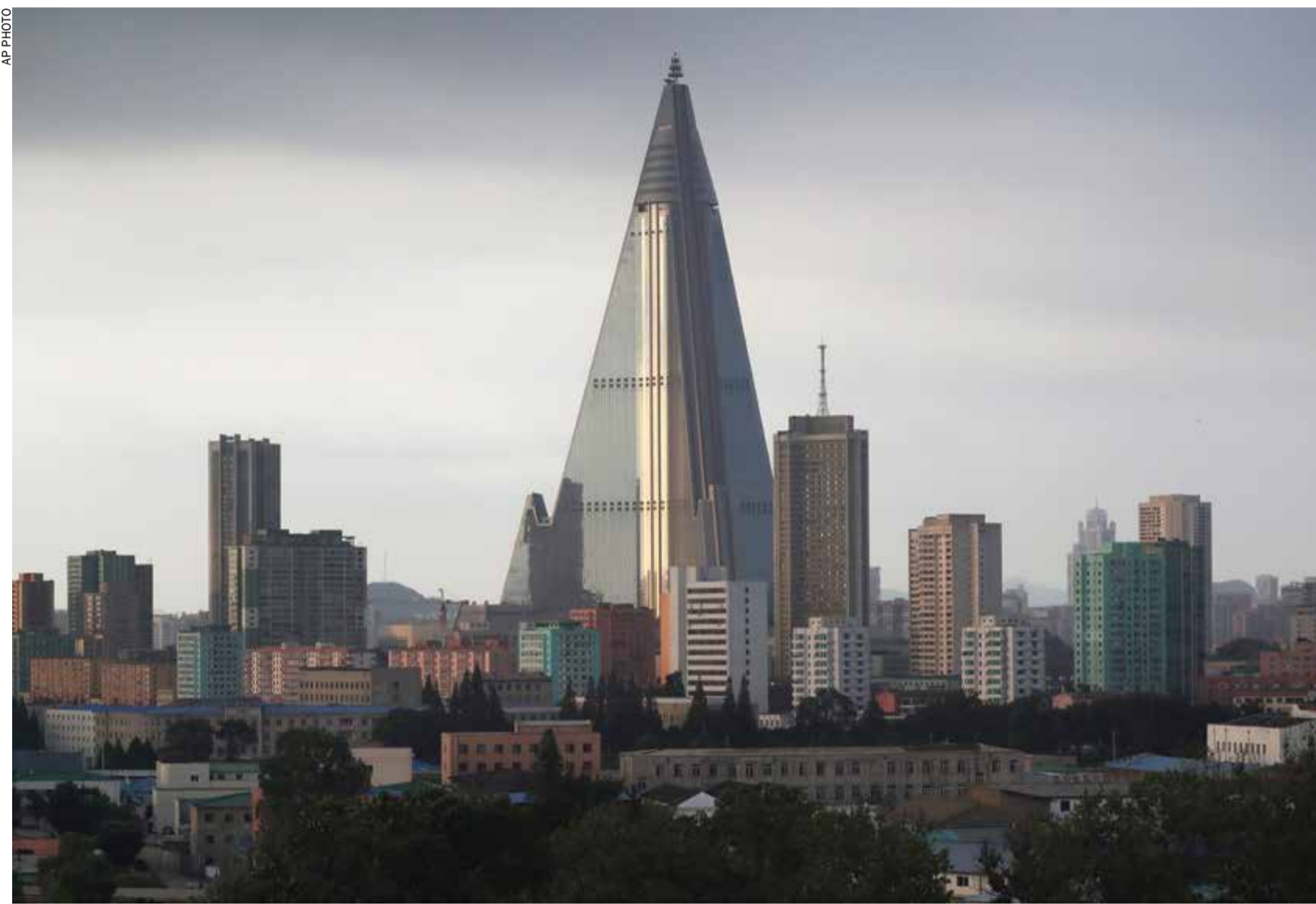
The sky is overcast in Pyongyang, North Korea