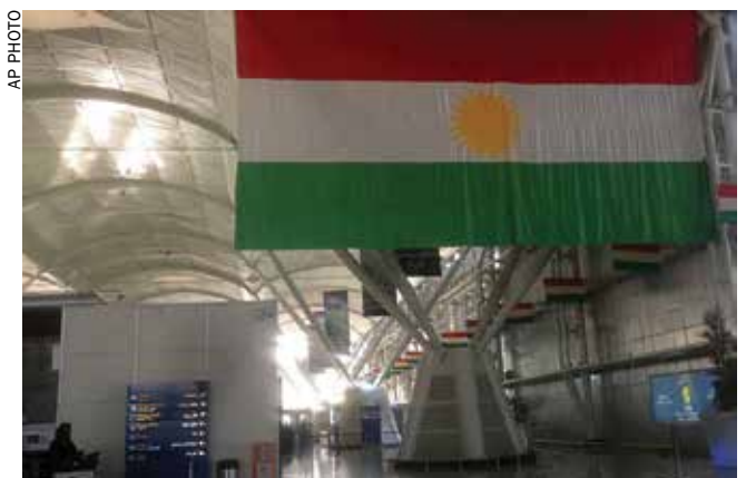
A Kurdish flag hangs in the Irbil International Airport,

the self-ruled Kurdish region has been unilaterally exporting crude oil produced in their region and contested areas through Turkey.