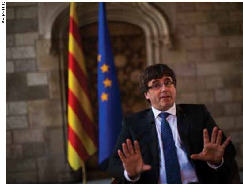
Catalonia's regional president, Carles Puigdemont

No country, within or outside the European Union, has openly expressed support for the Oct. 1 referendum that Spain's conservative government sees as illegal. U.S. President Donald