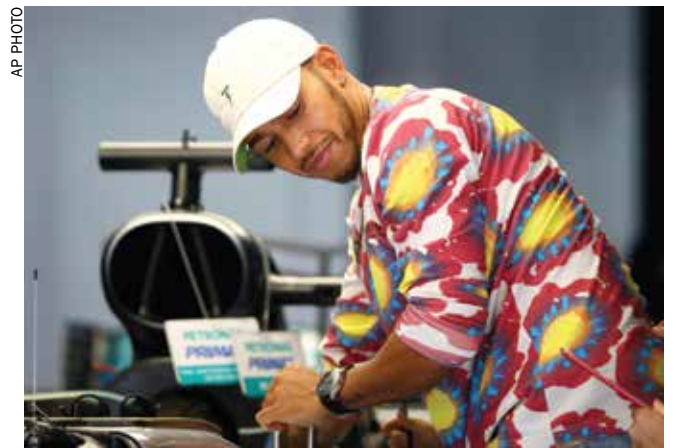
Hamilton takes a look at his car ahead the Malaysian F1 Grand Prix

Without Rosberg around, Hamilton's focus is clearer because it is geared toward an external rival in Vettel, rather than an internal opponent — making for a far healthier and managea-