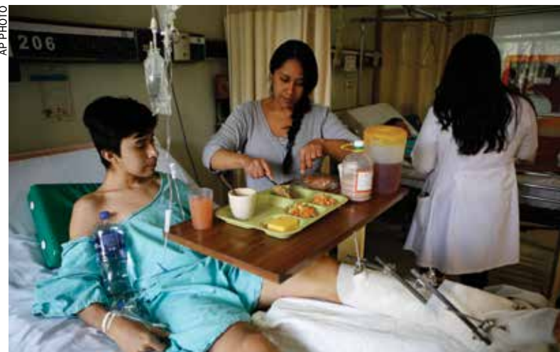
A 13-year-old boy from Iztapalapa, who along with his sister was seriously injured by a collapsing wall in last week's earthquake, is fed by his mother as he recuperates