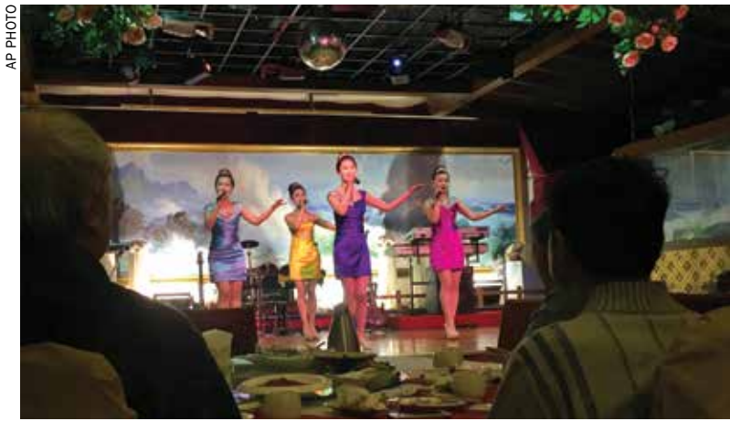
North Korean performers entertain customers at the Okryugwan restaurant in Beijing

North Korean companies operate restaurants and other ventures in China, helping to