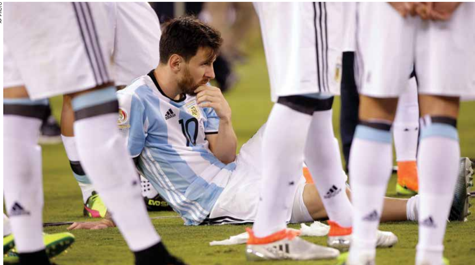
Argentina's Lionel Messi waits for trophy presentations after the Copa America Centenario championship soccer match

That is a risk France will surely take at Euro 2016 if it is playing on July 10 — a Sunday.