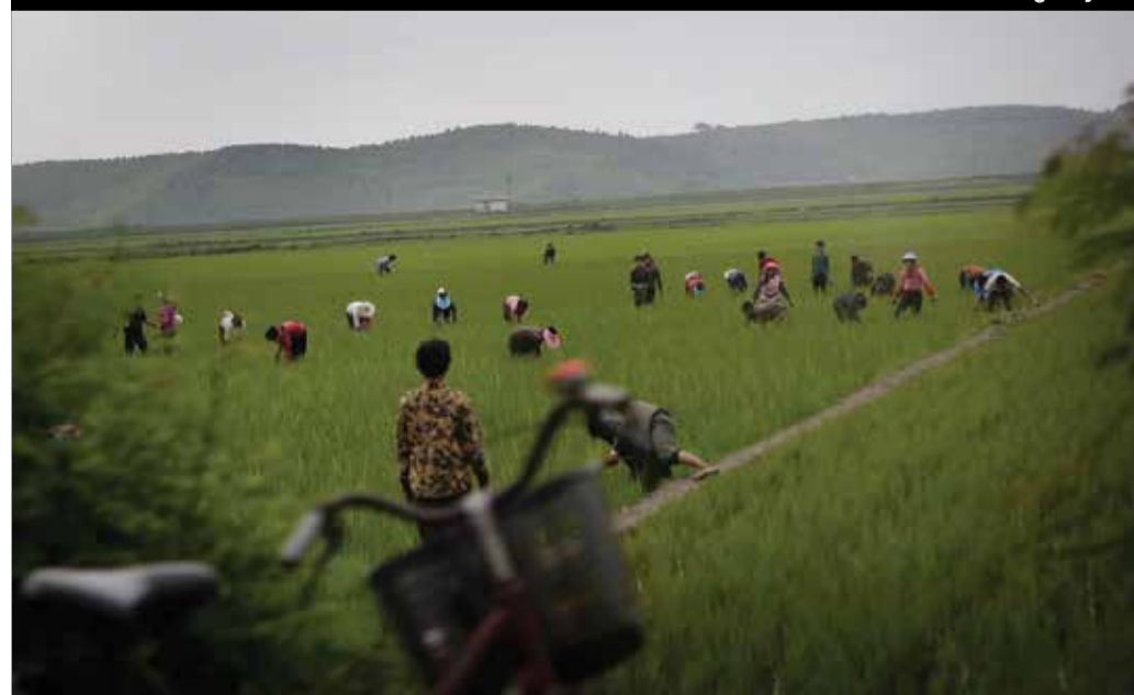
North Korea. Men and women work in rice fields in eastern Kangwon province. Its capital, Wonsan, was one of the cities chosen to be developed into a summer destination for locals as well as tourists.