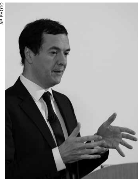
Chancellor George Osborne

BRITAIN'S Treasury chief sought yesterday to ease concerns about the vote to leave the European Union, saying the economy is as strong as it could be to face the uncertainty — even as a survey showed many companies are looking to move business out of the country.