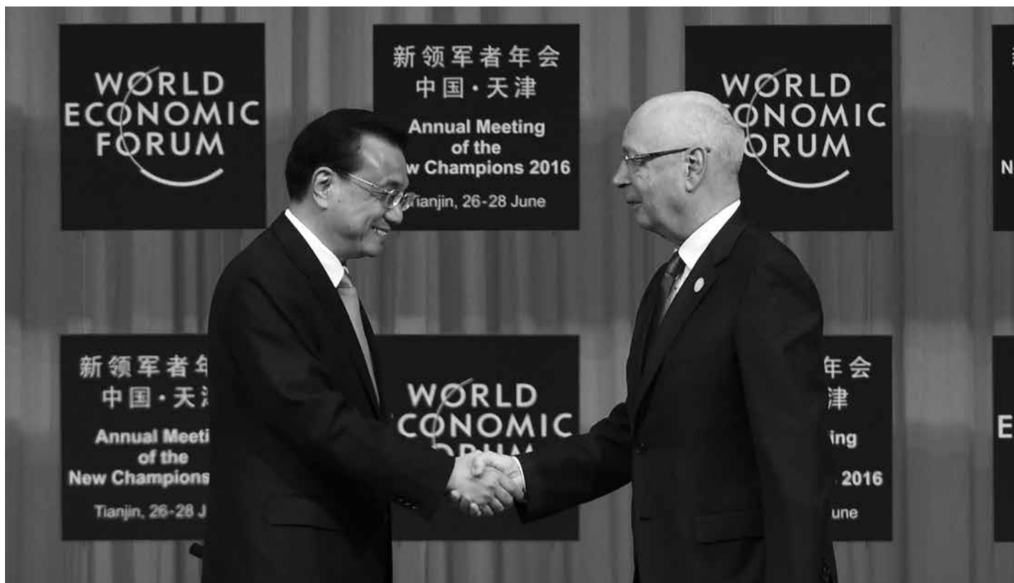
Founder and Executive Chairman of the World Economic Forum Klaus Schwab (right) shakes hands with Chinese Premier Li Keqiang during the World Economic Forum in Tianjin