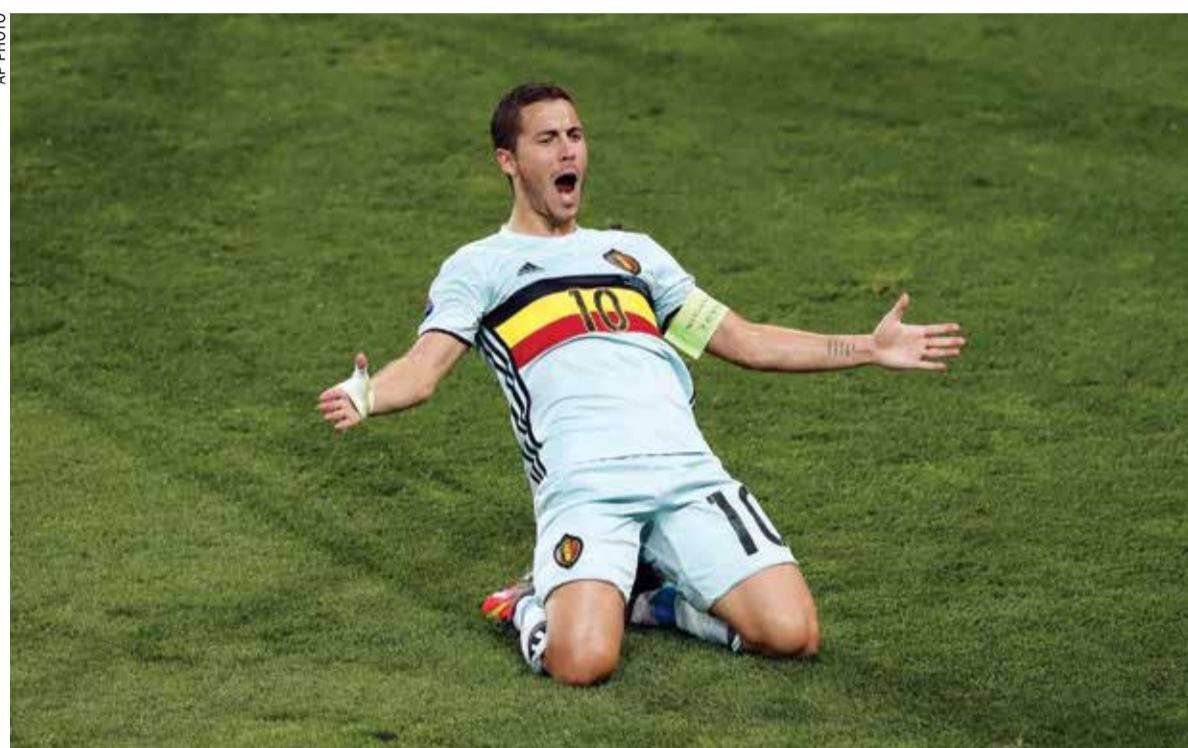
Belgium's Eden Hazard (right) celebrates scoring his side's third goal during the Euro 2016 round of 16 soccer match between Hungary and Belgium, at the Stadium municipal in Toulouse

Ireland chased for every ball and worked tirelessly to