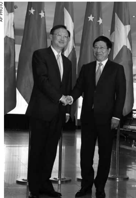
Chinese State Councilor Yang Jiechi (left) shakes hands with Vietnamese Foreign Minister Pham Binh Minh at the start of a bilateral conference in Hanoi