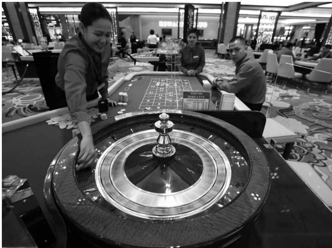
Casino dealers work on their respective games at the Solaire Casino