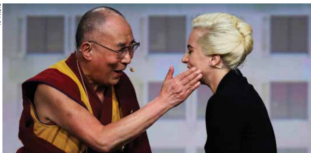
The Dalai Lama greets Lady Gaga (right)

CHINA warned people to be aware of what it said are nefarious motives of the Dalai Lama after he met with Lady Gaga on a trip to the U.S. and spoke about love and compassion.