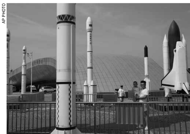
A man holds a child as they visit a park with replicas of foreign and domestic space vehicles displayed in Beijing

ceship aboard the newly developed Long March 7 rocket on Saturday was hailed as a breakthrough in the use of safer, more environmentally friendly fuels. The launch also marked the first use of the massive new Wenchang Satellite Launch Center on the southern island province of Hainan.