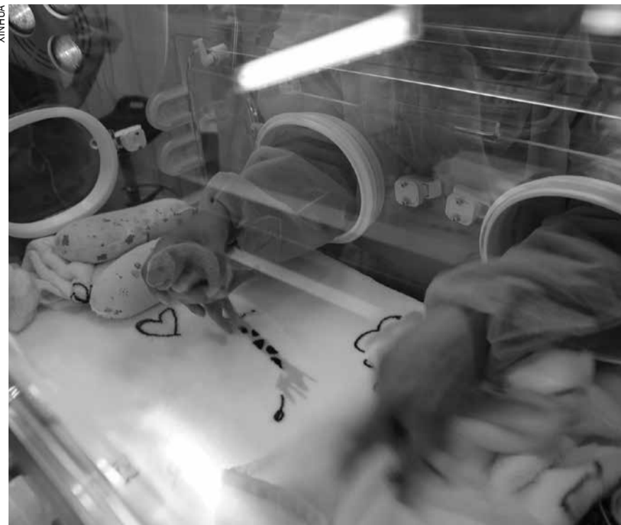
A feeder takes care of the second newly-born giant panda cub in Macau

At this stage according to the IACM, the gender of the cubs is not ascertained. However, in light of the current situation, all signs indicate the two cubs to be males.