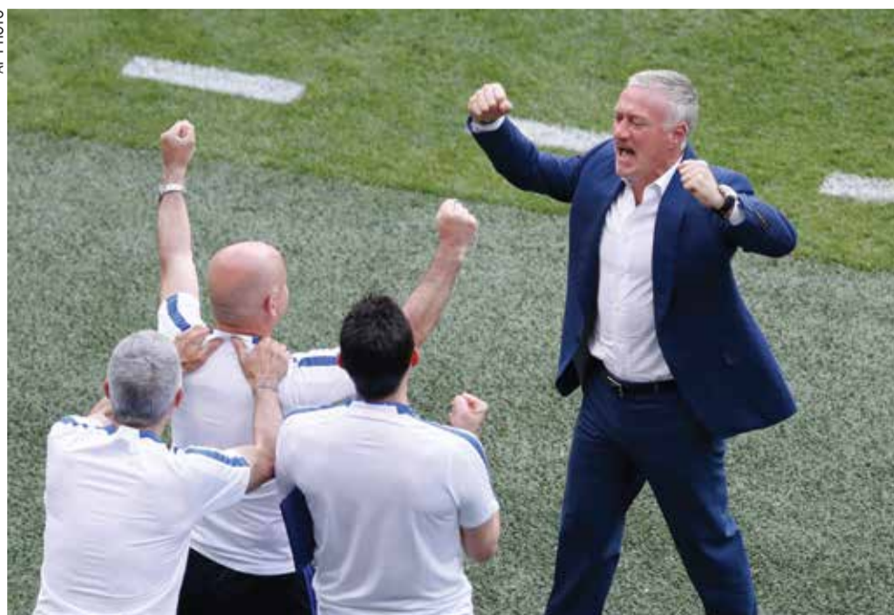
France coach Didier Deschamps (right) celebrates at the end of the Euro 2016 round of 16 soccer match between France and Ireland, at the Grand Stade in Decines-Charpieu, near Lyon

Messi, meanwhile, is expected to return to preseason with Barcelona in Spain, where it should be another successful season for him at the club level. AP