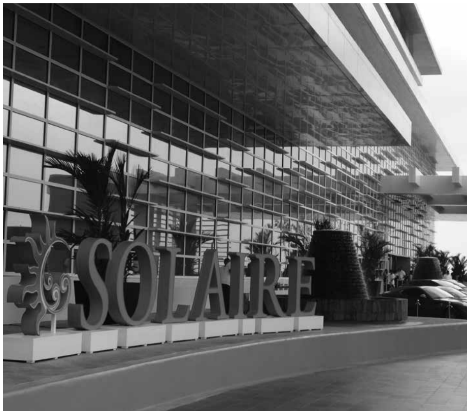
Solaire Casino VIP entrance