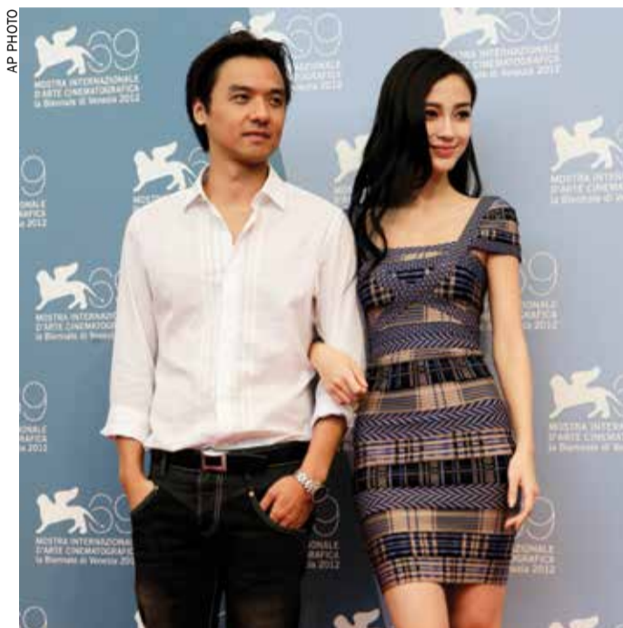
Director Stephen Fung, left, and actress Angelababy Yang poses during the photo call of the movie 'Tai Chi O' at the 69th edition of the Venice Film Festival in Venice, Italy, Friday

The film is set during the dawn of industrialization, but the filmmakers readily mix in high-tech modern touches, including comic book graphics, to introduce chapters and graphic overlays to map the trajectory of the martial arts moves.