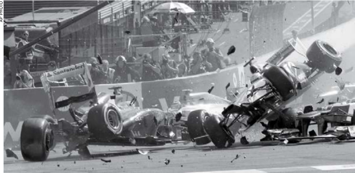
McLaren Mercedes driver Lewis Hamilton of Britain crashes with Ferrari driver Fernando Alonso of Spain, during the first lap of the Belgian Formula One Grand Prix in Spa-Francorchamps

Defending champion Sebastian Vettel benefited from the chaos to finish second and trim Alon-