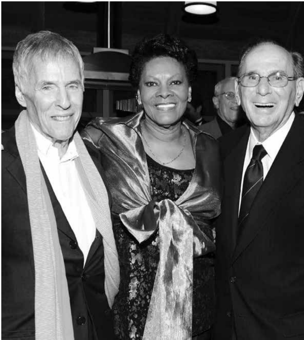
Legendary songwriters Bert Bacharach, left, and Hal David pose with singer Dionne Warwick at the "Love, Sweet Love" musical tribute to Hal David on his 90th birthday in Los Angeles