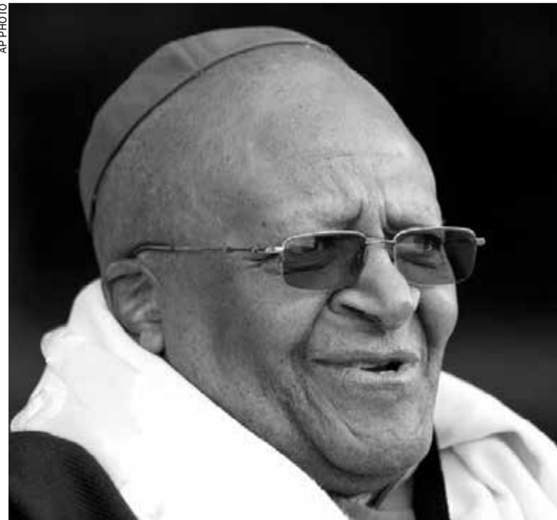
Archbishop Desmond Tutu

critic of the Iraq war, while others opposed to the conflict — including playwright Harold Pinter — have previously