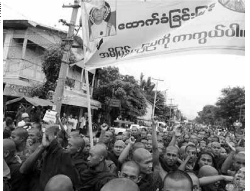
Myanmar Buddhist monks stage a rally to protest against ethnic minority Rohingya Muslims and to support Myanmar President Thein Sein's

President Thein Sein suggested in July that Myanmar send all Rohingya to any country willing to take them, a proposal quickly opposed by the U.N. refugee agency.