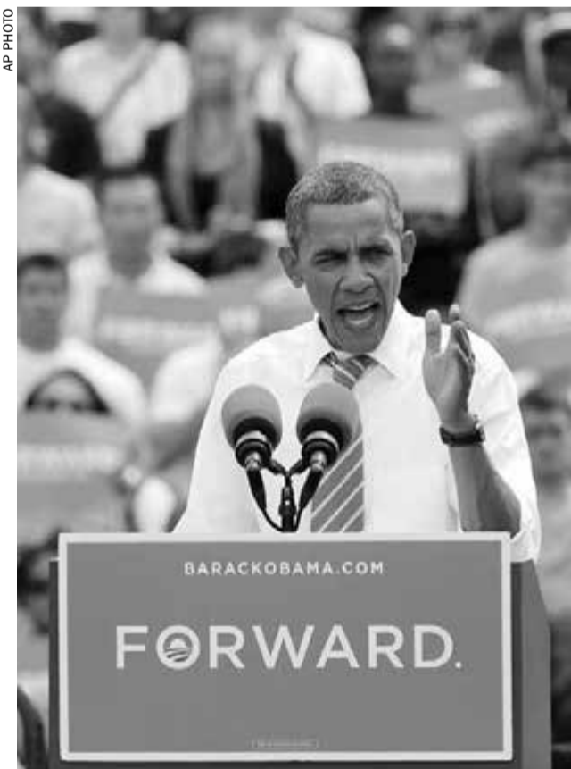
President Barack Obama

Starting tomorrow, a parade of high-profile speakers will stand on a blue-carpeted stage in Charlotte's Time Warner Cable Arena to vouch for Obama's economic agenda, which his team says is focused on the middle class: ending tax cuts for the rich and reducing the debt, while spending more on education, energy and infrastructure. Several voters — called "American Heroes" by Obama's team — also will speak at and appear in videos at the convention, putting a human face on Obama's program.