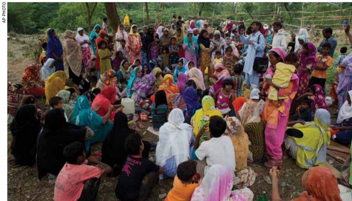
Pakistani Christians from a neighborhood where a girl was arrested on alleged blasphemy charges pray in a clearing of an urban forest in Islamabad

The cleric, Khalid Chishti, was arrested late the day before yesterday for allegedly planting pages of a Quran in a shopping bag containing burned papers and ash that had been carried