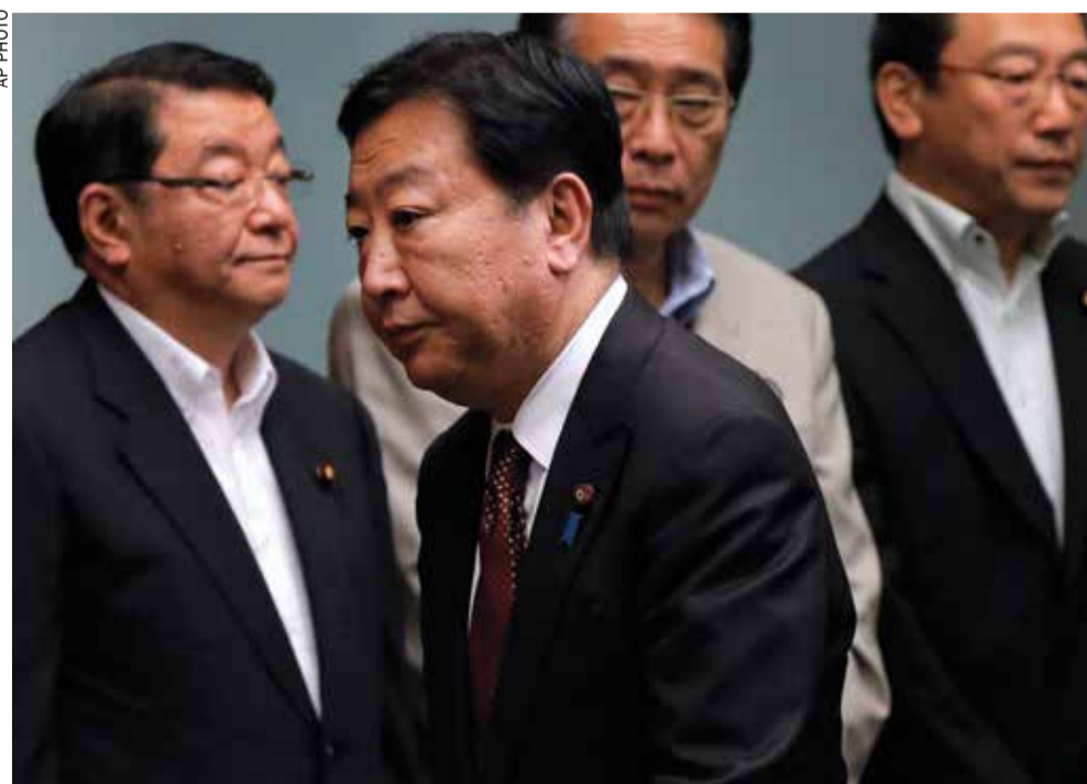
Japanese Prime Minister Yoshihiko Noda

"It is an undeniable fact that the islands are Japanese territory, so our task is to see how we can best maintain that," Yoshihiko Yamada, a special adviser