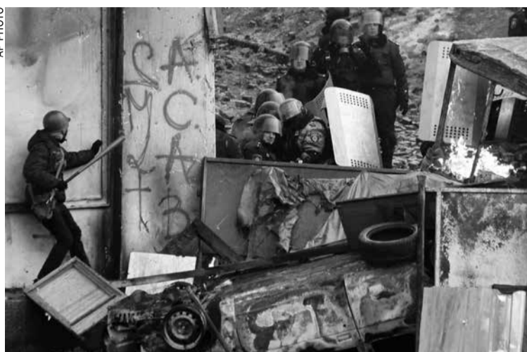
A protester, left, waits for a moment to clash with riot police officers in central Kiev, Ukraine

As parliament delayed the session to take up the issue, thousands marched toward the parliament building to put pressure on lawmakers. Shouting "shame!" the demonstrators hurled stones at police and set trucks blocking their way on fire. Law