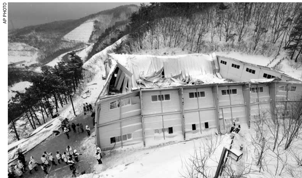
A collapsed resort building is seen in Gyeongju, South Korea

red rescuers who had to reach the site outside the historic tourist city of Gyeongju on icy roads. Working all night, they extricated survivors, many of them injured, and rushed them on stretchers to waiting ambulances.