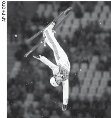
Australia's Lydia Lassila makes her bronze medal-winning jump during the women's freestyle skiing aerials final at the Rosa Khutor Extreme Park

Rule 40 of the IOC charter states: "Except as permitted by the IOC executive board, no competitor, coach, trainer or official who participates in the Olympic Games may allow his person, name, picture or sports performances to