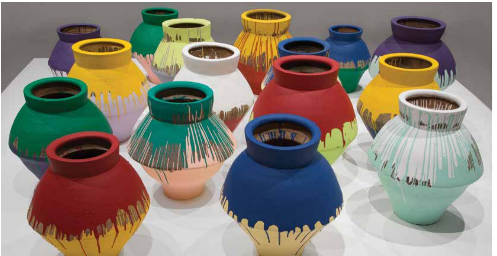
A series of 16 vases that are part of an installation by Chinese artist Wei Wei and currently on display at the Perez Art Museum in Miami

punishable by up to five years in prison when the property damaged is worth more than $1,000.