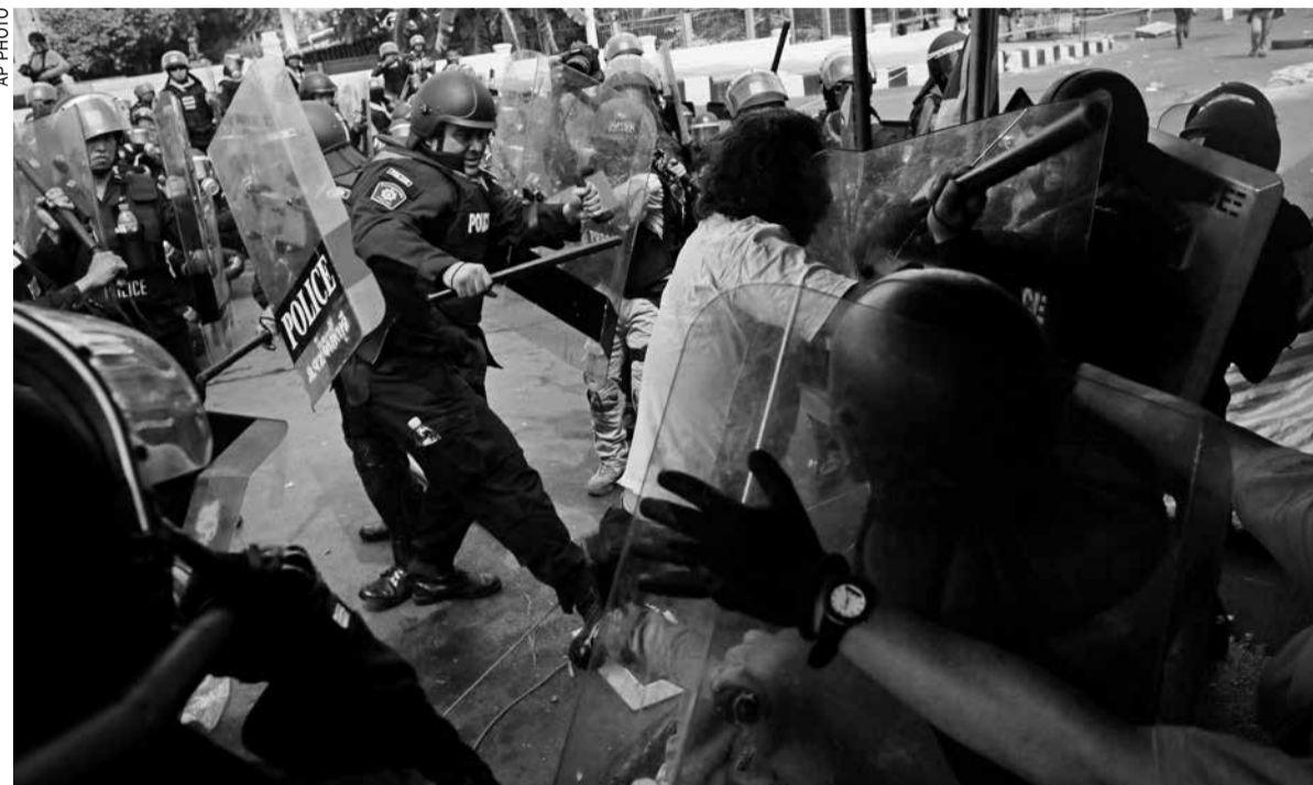
Riot police beat an anti-government protester during a clash in Bangkok

The violence erupted after police moved into several locations around the city to detain and remove protesters who have been camped out for weeks to press for Prime Minister Yingluck Shinawatra's resignation. They have blocked access to government offices since late last year and occupied key