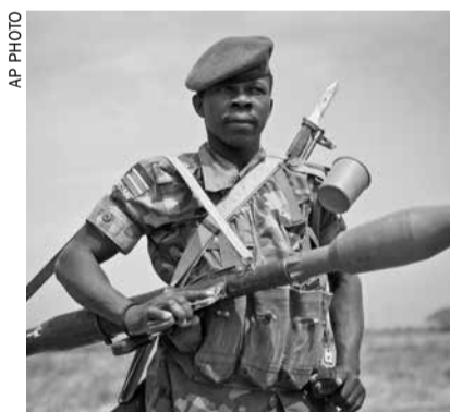
A South Sudanese government soldier stands guard as a delegation of visiting officials leaves from the airport in Malakal

Toby Lanzer, the United Nations' top humanitarian official in South Sudan, said on Twitter yesterday that all groups "engaged in the violence must uphold people's rights and protect non-combatants." The U.N. says both sides have committed rights violations, and on Mon-