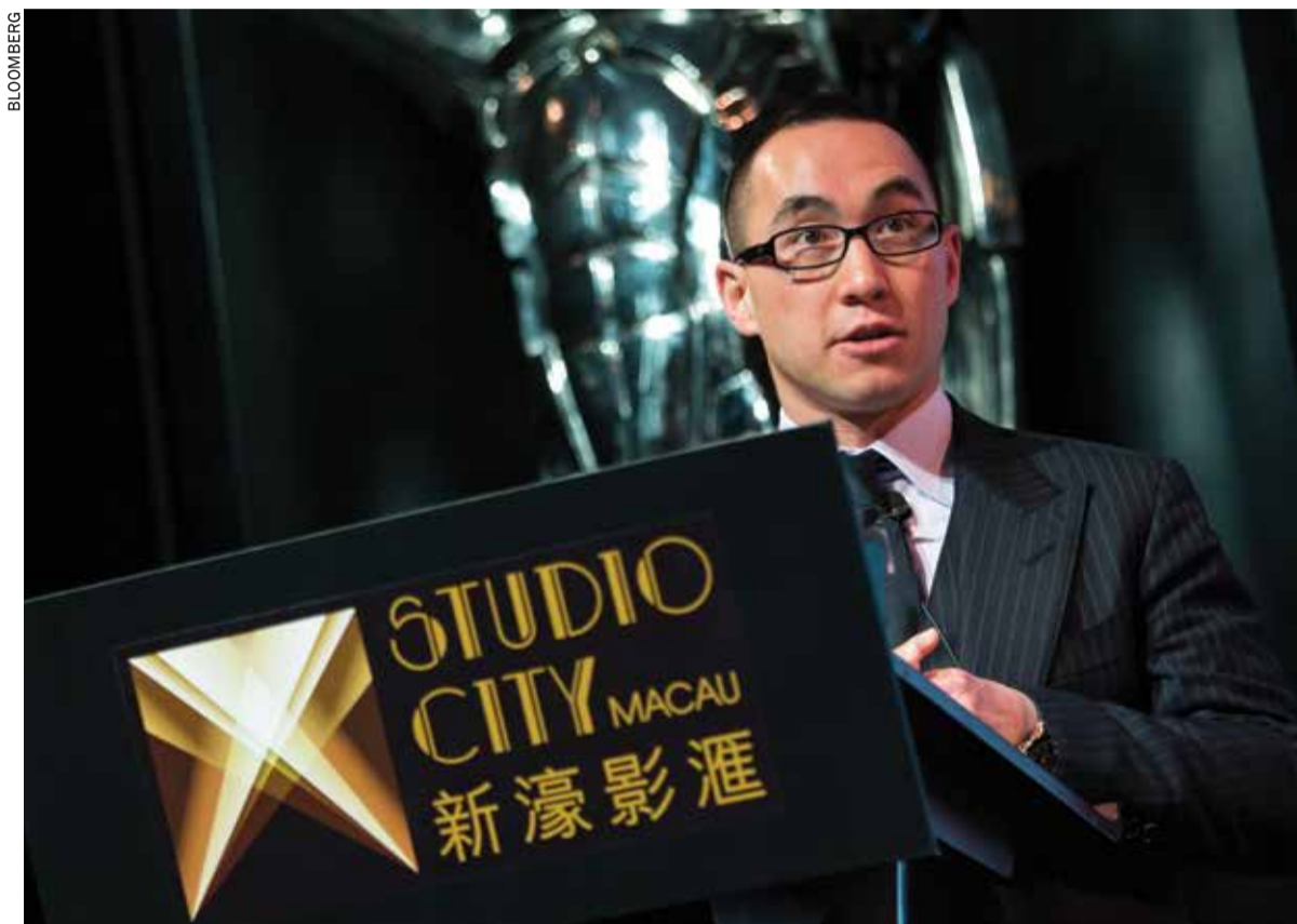
Lawrence Ho speaks during the unveiling ceremony of the Studio City casino resort