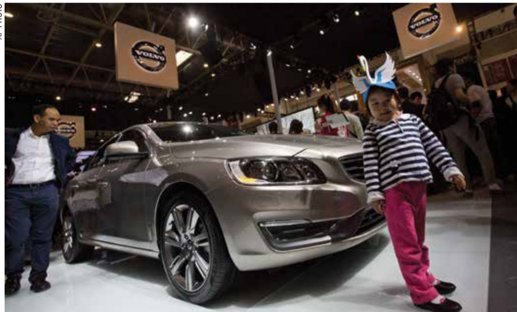
A Volvo car during the China Auto show held in Beijing

Volvo was acquired in 2010 by Geely Holding Group Ltd., which also sells cars under its own name. The following year, Volvo announced an $11 billion, five-year