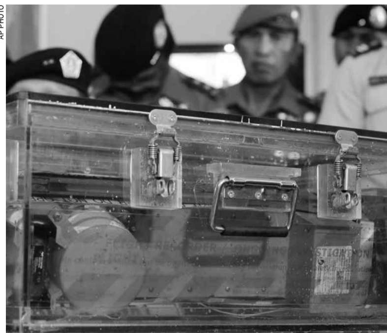
A black box of the ill-fated AirAsia Flight 8501 that crashed in the Java Sea, is briefly displayed at airport in Pangkalan Bun, Indonesia

Searchers began zeroing in on the location a day earlier