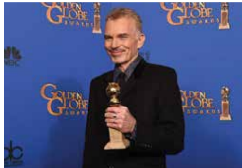
Billy Bob Thornton