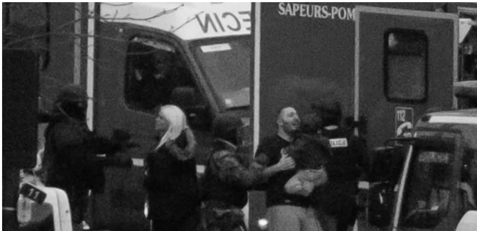
A security officer directs released hostages after they stormed a kosher market to end a hostage situation, Paris