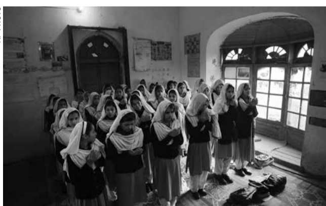
Pakistani students of a government-run girls school pray for the victims of Taliban attack on the Army Public School