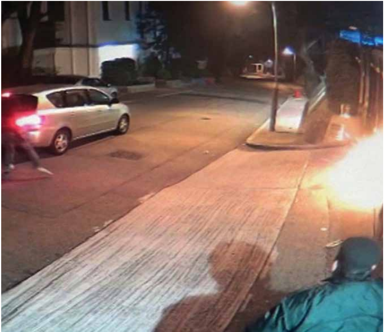
This screen capture taken from a surveillance video shows a car backing up to the gates of pro-democracy media magnate Jimmy Lai's home