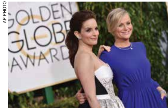
Tina Fey, left, and Amy Poehler

Both Budvar and Anheuser-Busch – which was taken over by Belgian brewer InBev in 2008 to form AB InBev – claim exclusive right to the Budweiser name.