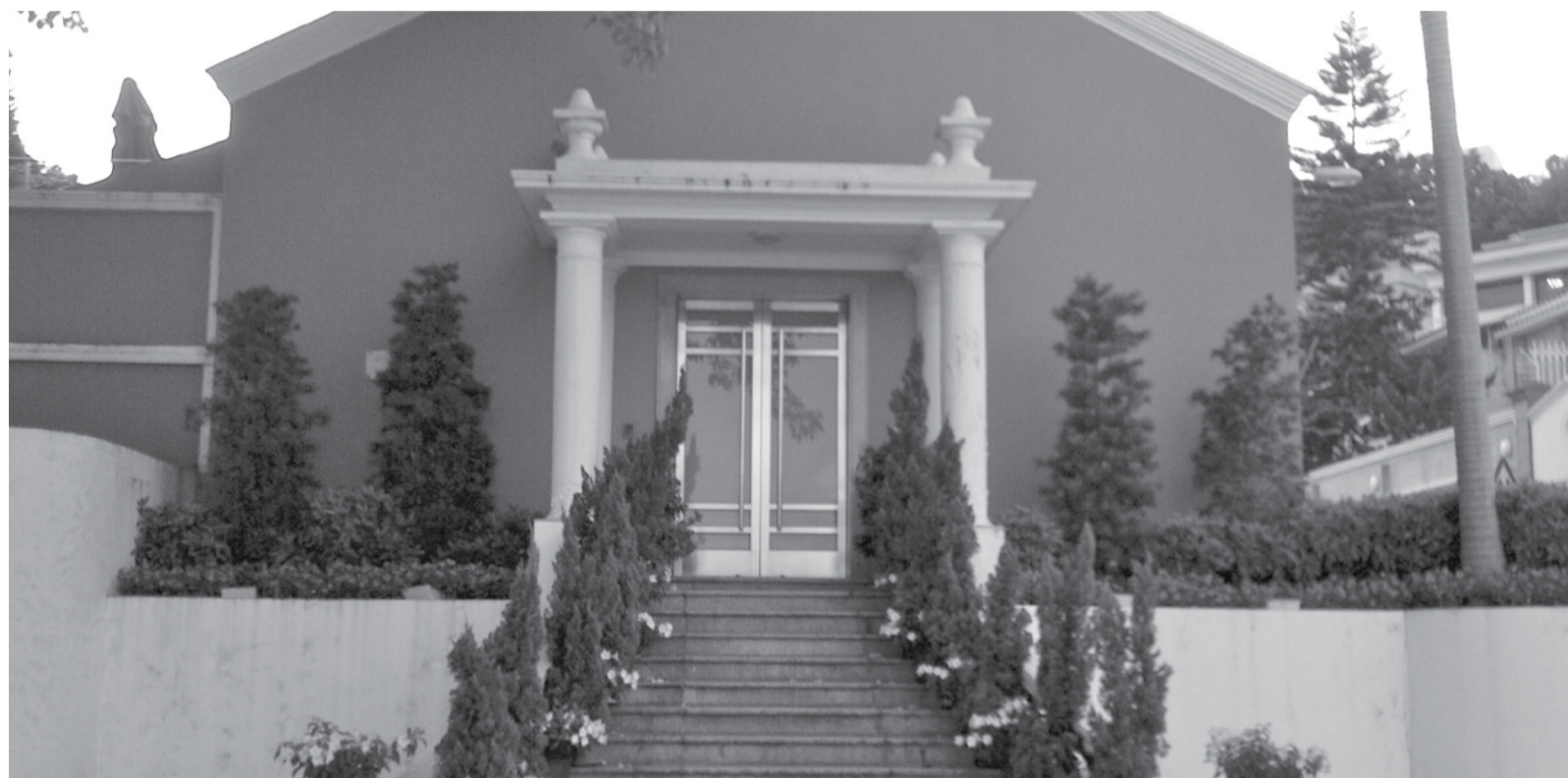
The Macau Foundation headquarters

to retrieve more than MOP3 million from these individuals. It claimed that if the recipients refused to repay the scholarship, FM will hand the case over to the Coercive Collection Bureau of the Financial Services Bureau.