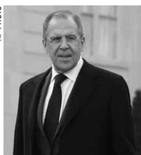
Russian Foreign Minister Sergey Lavrov

Sergey Lavrov said yesterday that such cooperation, which the West suspended last year amid ten-