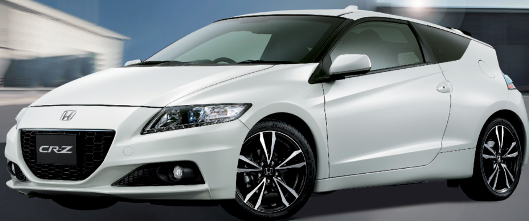
Wide performance xenon Lamphead