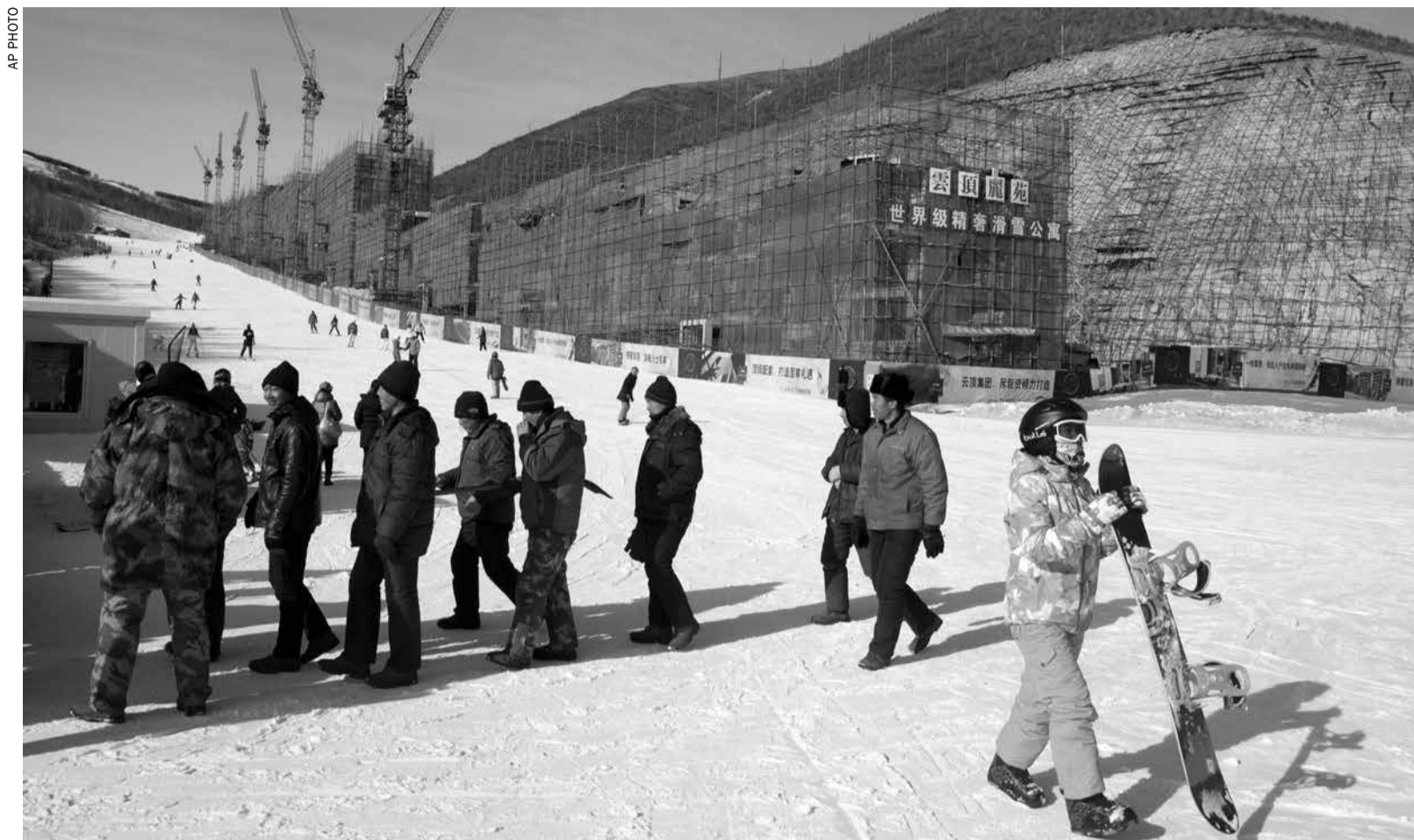
A snowboarder walks past migrant workers near a hotel under construction next to a ski slope at the Chongli ski resort in Hebei province where Nordic skiing, ski jumping, and other outdoor Olympic events are proposed to be held for Beijing's 2022 bid

Beijing says its bid closely aligns with the International Olympic Council's 2020 goals for a more frugal, more athlete-oriented games whose legacy