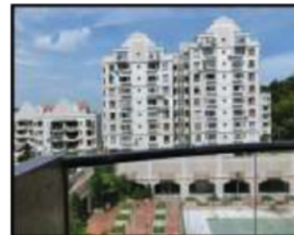
Hellen Garden, LOT 3 Coloane

Renovated 5 years ago. Modern open plan kitchen. Good size double bedroom on main floor. Separate bathroom on main floor. Wooden staircase to upper floor (open area: good for bedroom, office, studio or entertainment area). Great size private terrace. Viewings over looking Government Offices. Rare chance to buy a view. Viewings by appointment only.