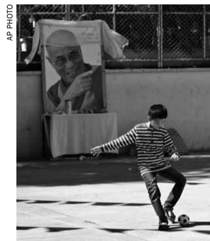
A Tibetan child plays with a soccer ball in front of a portrait of his spiritual leader the Dalai Lama

It's unclear from the new rules if Chinese authorities are treating self-immolation as a form of terrorism or if violence inside Tibet has escalated. With journalists' access to Tibet tightly restricted, all information from the region is extremely difficult to confirm.