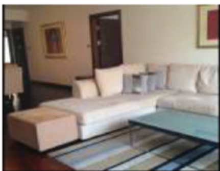
Manhattan F Unit Taipa (Ref: 14095417) 1,720sq. ft. HKD 17M Rate: HKD 9,883sq ft

3 bedroom. 2 bathroom. Open plan living / dining area. Modern Fitted Kitchen.