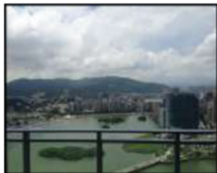
One Central Tower 7 Penthouse

Fully furnished. Small Balcony. Including one parking space on 2nd floor close to lift lobby.