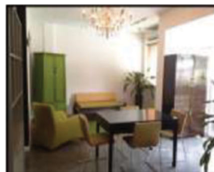
Designer Apartment Macau

Unique opportunity to live in an exclusive penthouse. Located in the One Central complex this property offers stunning views across the South China Sea towards Penha Hill. Floor to ceiling windows across one wall makes the living / dining room bright and spacious. For all interested parties please contact Juliet on 66809804 or email juliet@jmlproperty.com