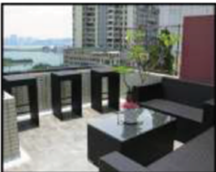
Unique Roof Top Apartment Central Macau

Low Floor, Tower 14. Views of the lush interior gardens. 2 Double Bedrooms, 2 Bathrooms. Excellent condition. All furniture included with the sale. Well equipped kitchen. Small store room & toilet off kitchen. Available to view anytime.