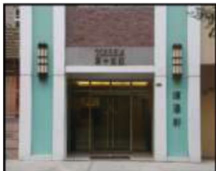
Excellent Investment Property - Nova City Tower 14 Taipa

(Ref: 14105419) 1,340sq. ft. HKD 10.184M Rate: HKD 7,600sq ft