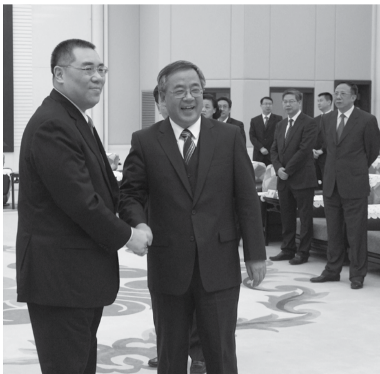
Chui Sai On and Hu Chunhua

"In the upcoming year, we hope to further our work based on these well-established foundations. It is especially [so] that we are paying high attention to the Guangdong Free Trade Zone. We have been studying the related documents in the past two days [and hope that] we can strengthen our collaboration [with Guangdong]," he said.