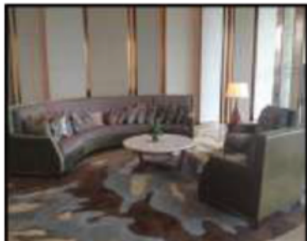
One Oasis D and J Units Coloane

High quality finishes. Full use of Clubhouse facilities. Viewings by appointment only.