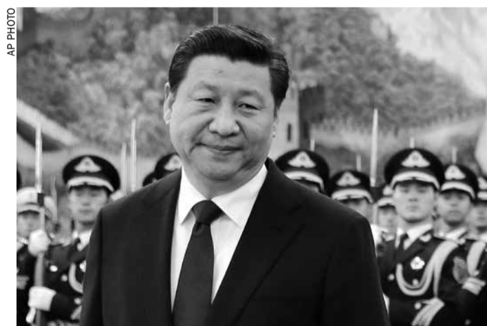
Chinese President Xi Jinping has issued guidelines requiring universities to strengthen ideological controls in classrooms and telling professors to champion Marxism, traditional culture and socialist core values

An internal party document leaked in 2013 warned against Western values such as constitutionalism, respect