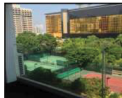
Macau Nape Area Macau

Overlooking Macau's Icon St Pauls Cathedral. One of the few views not to be built out. Second Floor walk up. Renovated 5 years ago HKD480,000 spent. All new water pipes / electrics / air con's / double glaze windows. Only two apartments per floor. Balcony overlooking St Pauls. Open plan modern built in kitchen. Large dining / living area, Shower room, bedroom with built wardrobes.