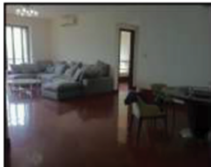
One Grantai Unit S, Taipa (Ref: 14090441) 3,000 sq. ft. HKD 40,000

Brand new furnished/unfurnished 2 bedroom apartments, D & J units available. Unfurnished asking $16,000 or furnished asking $19,500. Clubhouse offers cinema, indoor and outdoor pool and gym. Great location with Coati Strip and ferry terminal only 10 mins away.