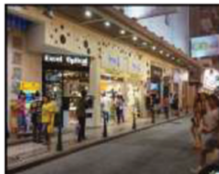
Macau Ginxa Plaza (Mall Shops)

Beautiful and Luxurious 5 bedrooms plus one maids room are merged 4 bedroom plus one maids room apartment next to Cotai Strip. 5 star Clubhouse; swimming pool & gym. Within walking distance of the Cotai Strip and Taipa town, international school, restaurants etc.