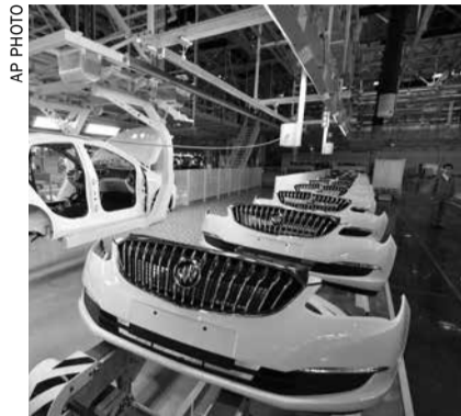
A worker walks past an assembly line at a General Motors joint venture in Wuhan in central China's Hubei province

Seasonal reasons, falling commodity prices, and weak domestic and international demand caused the