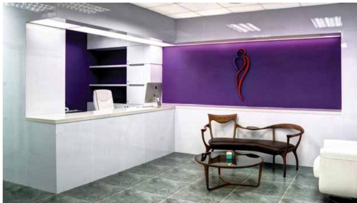
Dali Clinic's reception area