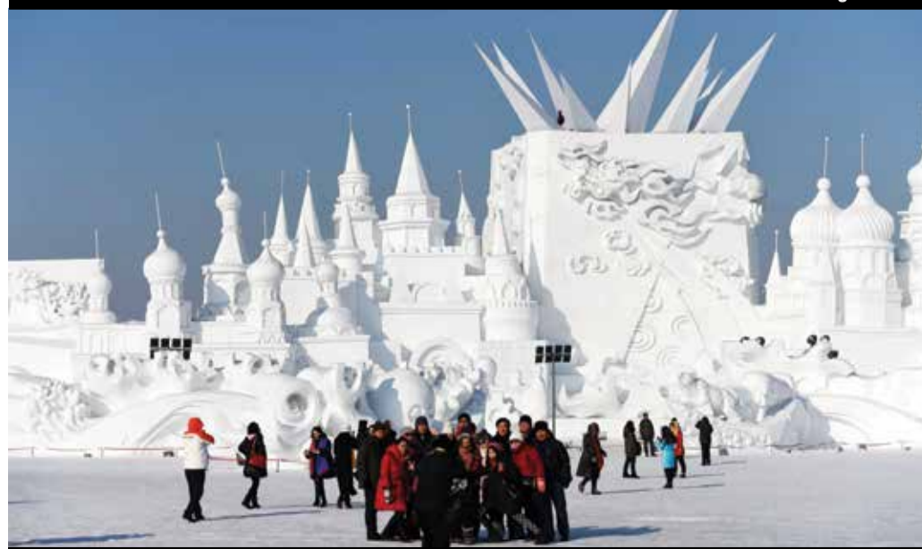
Tourists pose for photos in front of a snow sculpture at the Sun Island International Snow Sculpture Art Expo in Harbin, capital of northeast China's Heilongjiang Province, Jan. 31.