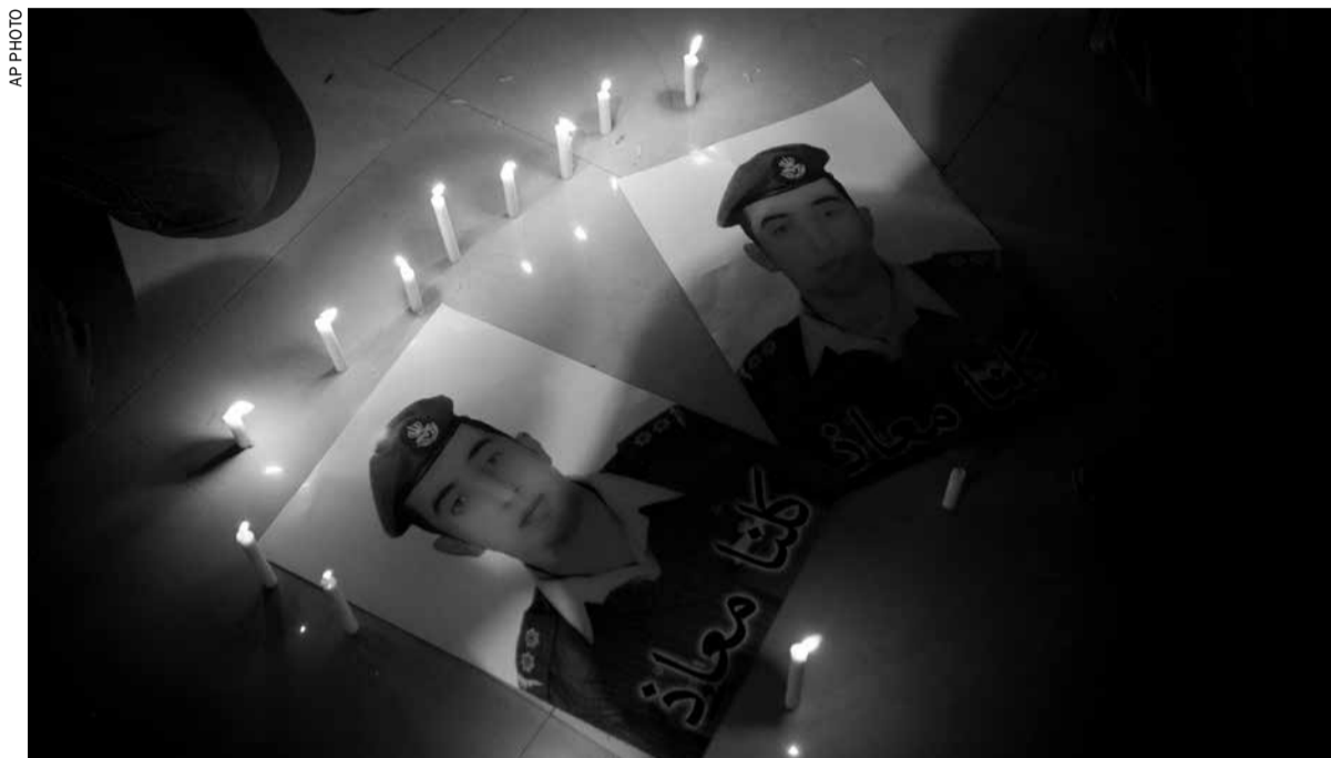
Members of Al-Kaseasbeh, the tribe of Jordanian pilot, Lt. Muath al-Kaseasbeh, who is held by the Islamic State group militants, light candles by posters with his picture and Arabic that reads, "We are all Muath"