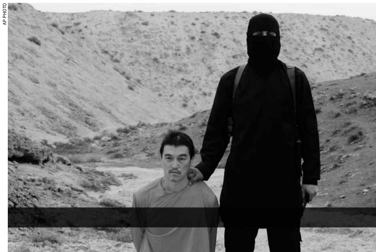
This image made from a video released by Islamic State militants on Saturday purports to show a militant standing next to Japanese journalist Kenji Goto before his beheading

He said it would be "inappropriate" to comment on the status of the Jordanian pilot, Muath al-Kaseasbeh. He was captured in December when his F-16