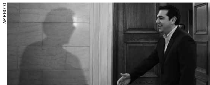
The shadow of Eurogroup chairman Jeroen Dijsselbloem is cast on a wall as Greek Prime Minister Alexis Tsipras waits to greet him during their meeting in Athens

Bond yields surged on Friday after Finance Minister Yanis Varoufakis said the new