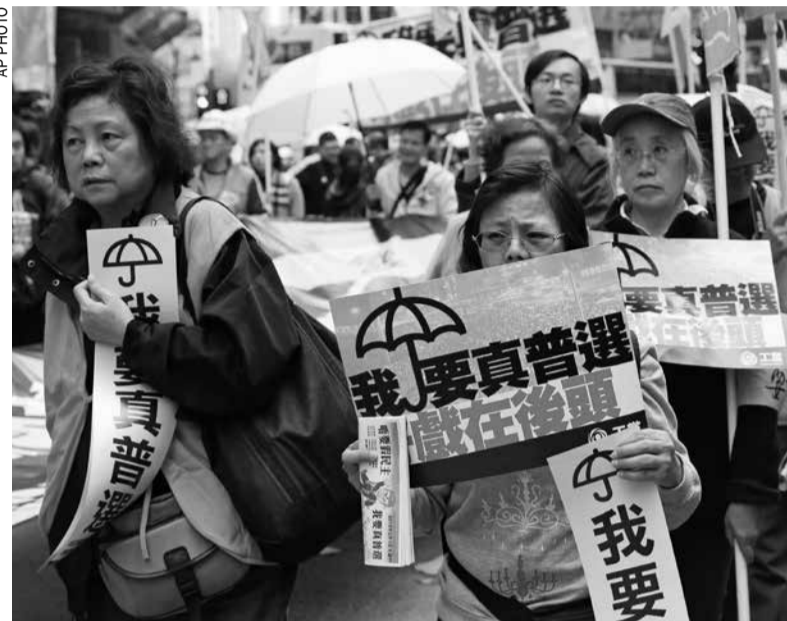
Thousands of pro-democracy activists take part in a democracy march to Central, demanding for universal suffrage in Hong Kong

the march, though the formal notice the department issued last weekend stressed that organizers should ensure none of the marchers tried to occupy streets as happened during the mass protests.