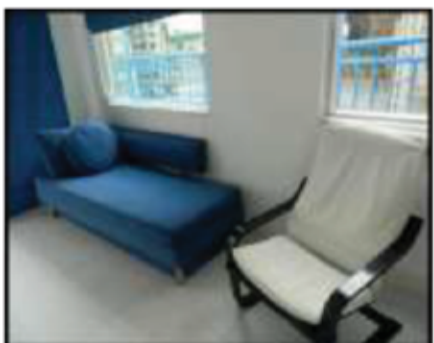
Pou Kei Unit A

Fabulous apartment renovated 5 years ago. Originally 3 bedrooms converted to 2 double bedrooms. En suite bathroom off master bedroom with another separate shower room. Modern open plan kitchen, with island feature and separate utility room. Large living room with dining area which could be converted to a 3rd single bedroom. Great size balcony overlooking the Grand Lapa resort.