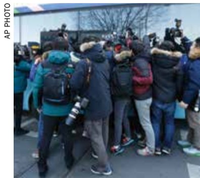
Members of the media try to get pictures of Cho Hyun-ah, the former vice president of Korean Air Lines, outside of the Seoul Western District Court after her trial in Seoul, South Korea

A Seoul court said Cho, 40, was guilty of forcing a flight to change its route, obstructing the flight's captain in the performance of his duties, forcing a crew member off a plane and assaulting a crew member. It