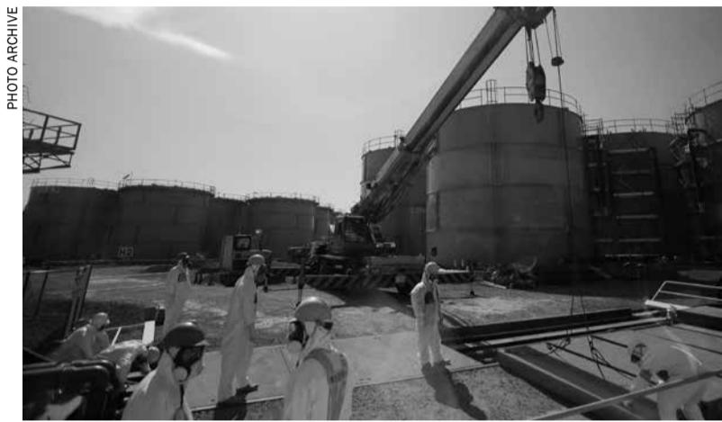
The Fukushima nuclear disaster in 2011 tilted global public opinion against nuclear power

Those reports will follow Prime Minister Tony Abbott's comments in December that global warming has made the issue worth revisiting. It's a significant shift in a nation where grassroots resistance to nuclear energy dates back to the 1960s. Still, any push to introduce nuclear power