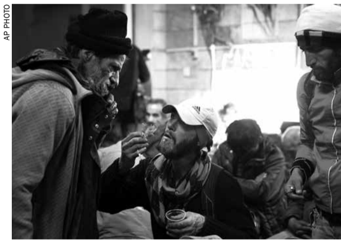
A drug addict smokes cigarette at a drop-in center and shelter