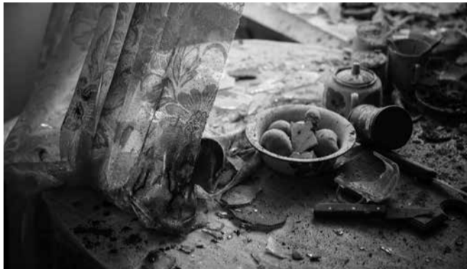
A kitchen table after a mortar attack in Donetsk