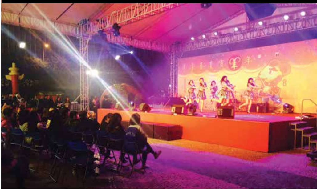
Tap Seac Square, Wednesday night. The opening of the Chinese New Year Market with a variety show. Local talents on the stage before an enthusiastic audience. Nice atmosphere.