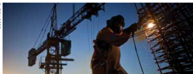
An OAS SA welder cuts a piece of steel during the construction of a bridge over Guanabara bay, near Rio de Janeiro, Brazil

SIX of the eight Portuguese-speaking countries recorded increases in the 2015 Index of Economic Freedom, drawn up by the US Heritage Foundation, the exceptions being Brazil and Mozambique, according to the document that was published recently.