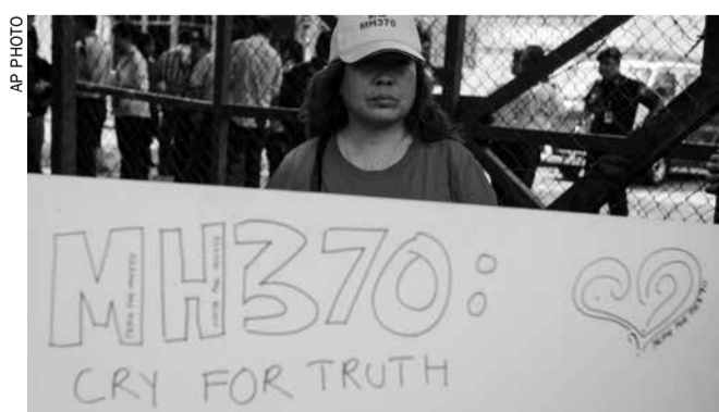
An unidentified Chinese family member of a passenger on board the missing Malaysia Airlines flight MH370 stands behind a placard outside of the Malaysia Airlines office in Kuala Lumpur

Malaysia's government on Jan. 29 formally declared the plane an accident and said all 239 people on board were presumed dead, paving the way for compensation claims. It upset victims' families, who are still waiting for evidence