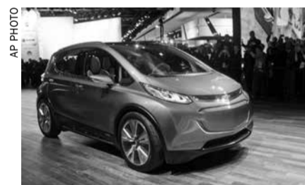
The Chevrolet Bolt EV electric concept vehicle is driven onto the stage at a presentation during the North American International Auto Show, in Detroit