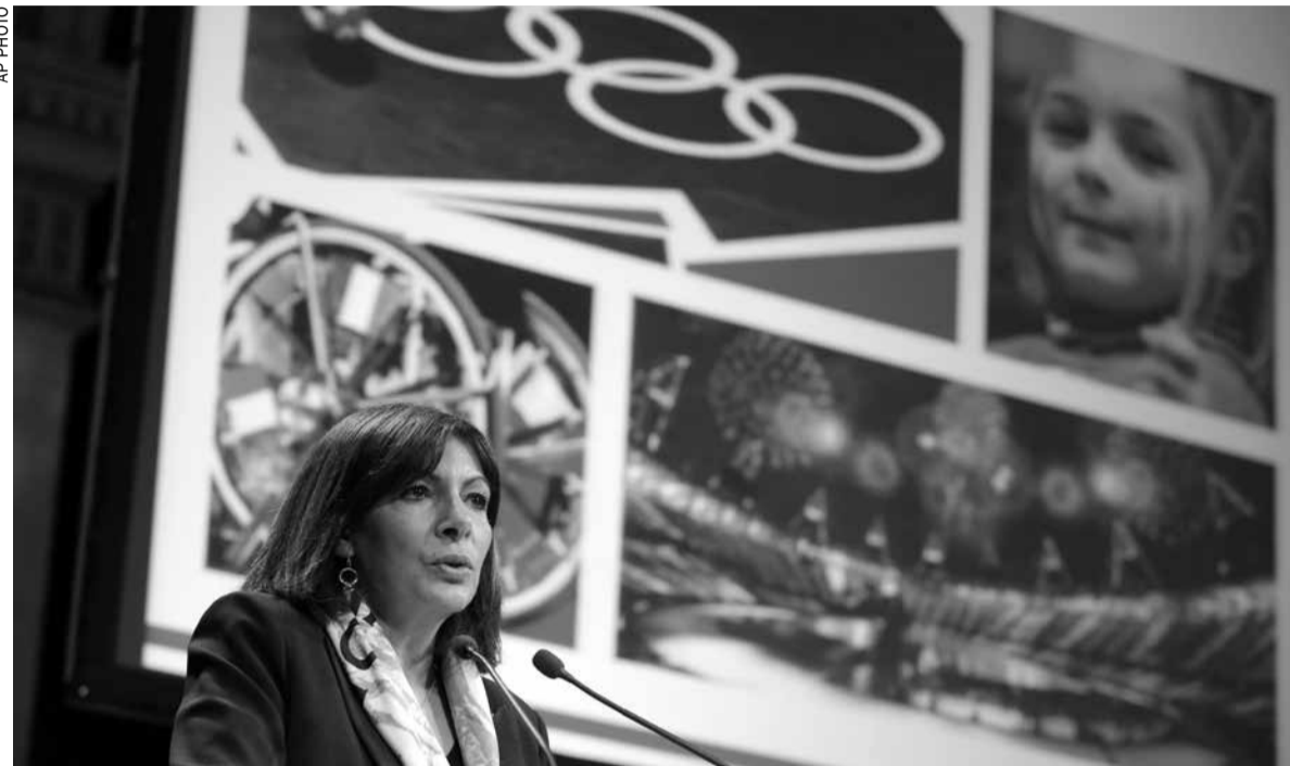
Mayor Anne Hidalgo delivers her speech after receiving the results of a feasibility study on hosting the 2024 games in Paris

Hidalgo said she was pleased with the financial and environmental guarantees in the study, but still needs to consult with members of the Paris city council and nearby cities that could be involved before making a decision on whether to bid. An announcement is expected in April.