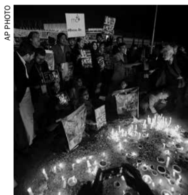
Members of Pakistan's civil society groups light candles and shout anti-Taliban slogans to condemn the militant group's attack on a military-run school in Peshawar

In the wake of that attack, both Pakistan and Afghanistan mutually pledged to work together more directly on counter-terrorism