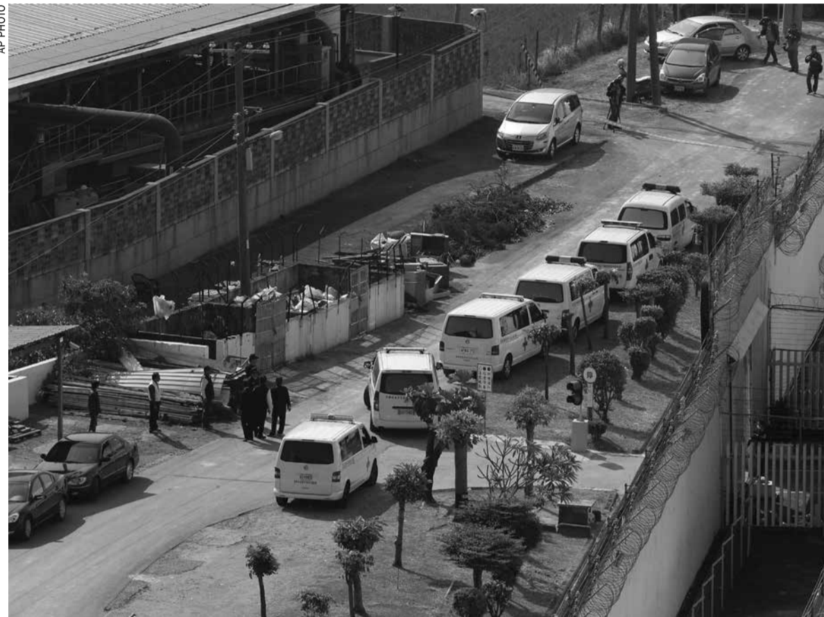
Ambulances wait outside of a prison after a standoff hostage situation in Kaohsiung