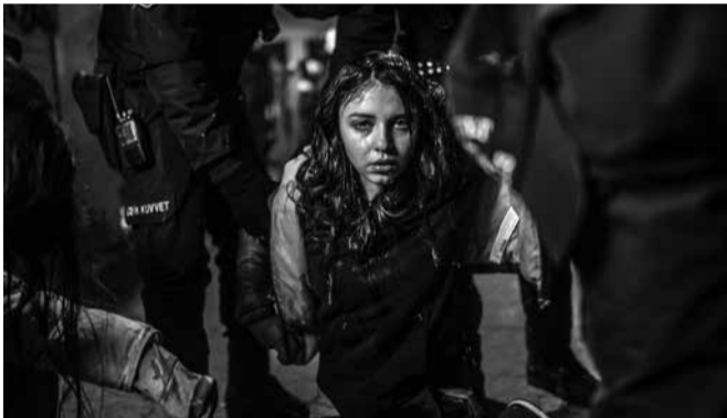
A young girl was wounded during clashes in Turkey