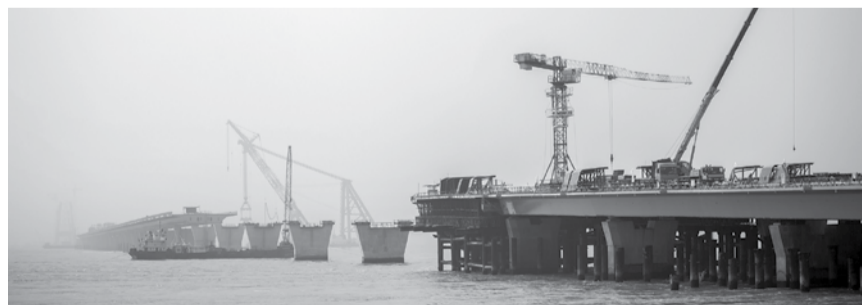
The Delta Bridge is under construction

The chief then stressed several times that the construction is "too challenging." In fact, he reckons that the assembly of the underwater tube is as complicated as an outer space rendezvous. The authorities are still trying to come up with an estimated construction period.