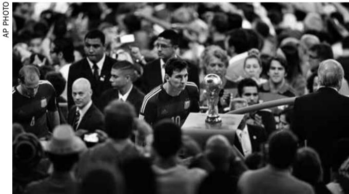
Messi looks at the World Cup trophy

The contest drew 97,912 images from 5,692 photographers from 131 countries. Nissen wins a 10,000-euro (USD11,330) cash prize. The World Press Photo exhibition will be showcased in Macau in a date to be announced.