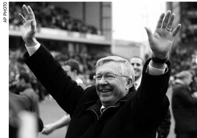
United is trying to fill the gap left by Alex Ferguson (pictured), who retired after 26 years as the most successful coach in English history

Manchester United had a fiscal second-quarter loss of 55,000 pounds in the three months ended Dec. 31, compared to net income of 19 million pounds in the same period in 2013, according to a BusinessWire statement. Revenue declined 14 percent to 105.8 million pounds and income from televised ma-