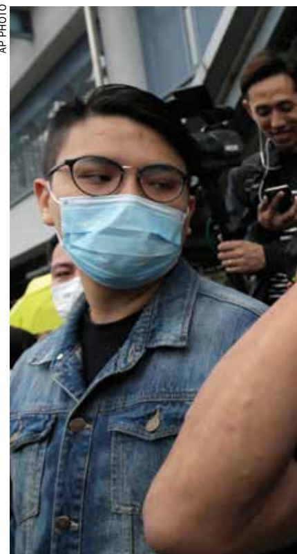
Protesters demonstrating against mainland

Such resentment also helped fuel massive pro-democracy protests that rocked the Asian financial center for 11 weeks last year. The student-