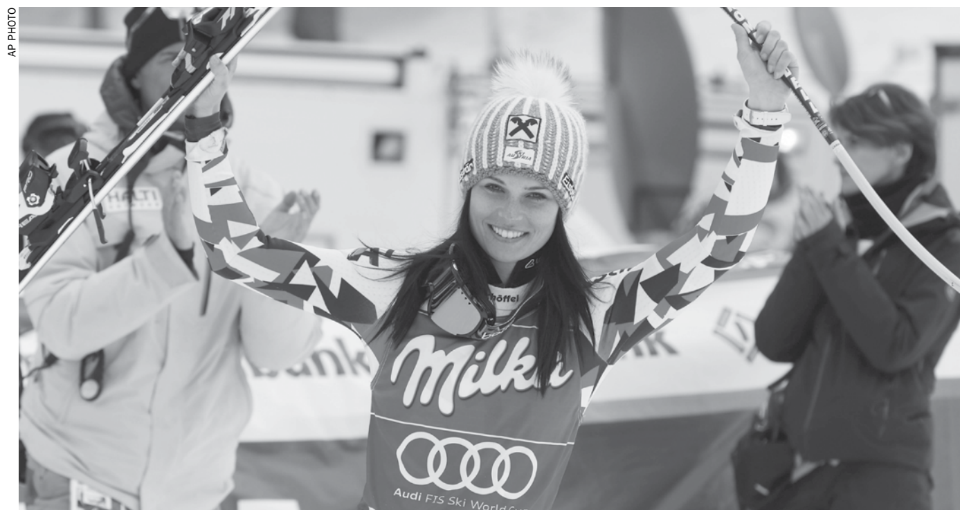
Austria's Anna Fenninger

"After that (2005 League Cup final) we got more experience in big moments, big games, big finals like this one," said the 36-year-old Drogba, who was a late substitute on Sunday. "It's a step forward for this team. We want to grow up ... and I'm really happy to be part of this team and help them to become better and stronger."