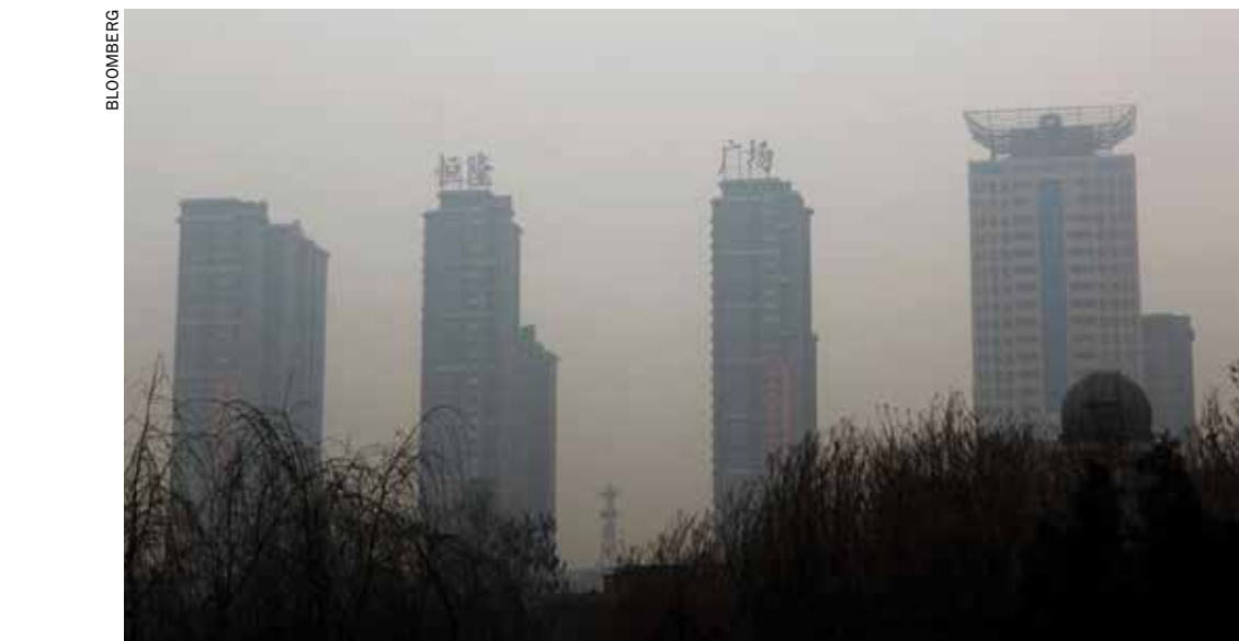
Buildings stand shrouded in haze in Handan, Hebei province