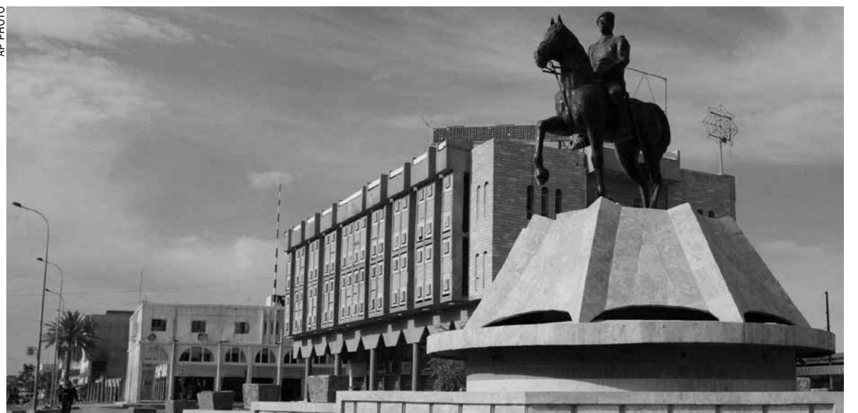
A statue of Iraqi President Saddam Hussein is seen as the streets are nearly deserted in central Tikrit