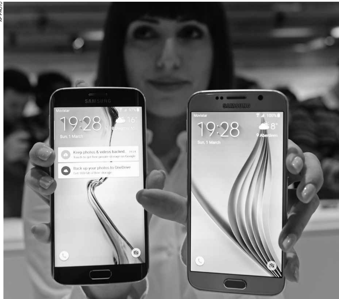
The new Galaxy S6, right, and S6 Edge are displayed during a Samsung Galaxy Unpacked 2015 event on the eve of this week's Mobile World Congress wireless show in Barcelona, Spain

Earlier Sunday, HTC announced a new HTC One smartphone that also sports a better camera, while keeping such previously lauded elements as