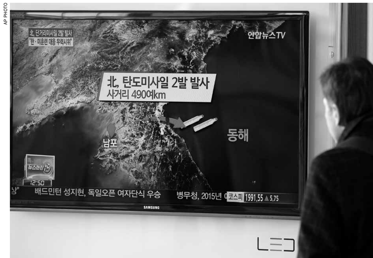
A man watches a TV news program reporting that North Korea fired two short-range ballistic missiles, at Seoul Railway Station in Seoul

The annual U.S.-South Korean military drills inevitably lead to angry North Korean rhetoric,