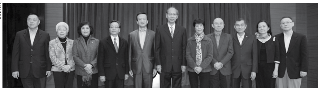
Deputies to China's 12th National People's Congress (NPC) pose for a group photo before leaving for Beijing at Macau airport

Another topic on the agenda of local delegates will be the usage of reclamation zones currently under development: "The diversification of the local economy