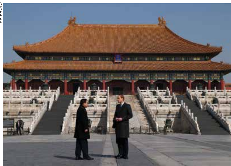
Britain's Prince William, right, talks to a Chinese museum officer during a visit to the Forbidden City in Beijing

He won't be visiting Hong Kong, the former colony Britain handed back to China in 1997. It was the scene last year of weeklong pro-democracy protests, during which Beijing prevented a British parliamentary committee from tra-