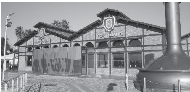
One of Portugália's restaurants in Lisbon

Originally a brewery, Portugália later became known for the quality of its steak. The opening of the chain's first beerhouse outside of Portugal coincides with its 90th