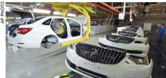
A worker walks past an assembly line at a General Motors joint venture in Wuhan in central China’s Hubei province

China’s manufacturing activity improved in February for the first time in four months but export demand weakened, a survey released yesterday showed. HSBC’s manufacturing index based on a survey of factory purchasing managers rose to 50.7 from January’s 49.7. It uses a 100-point scale on which numbers above 50 show activity increasing. On Saturday, Beijing cut interest rates for a second time in three months in a sign of official worry that China’s economic slowdown is deepening too abruptly. The HSBC survey, conducted by Markit Economics, found growth in output and total new orders accelerated but new export business declined for the first time in 10 months. Input costs fell, adding to the possibility that already low inflation could tumble into a potentially dangerous bout of deflation. Consumer inflation fell to just 0.8 percent in January. Wholesale inflation has been in negative territory for two years due to excess production capacity in many industries that has led to price-cutting competition. Companies reported “the strongest expansion of output since last summer while total new business also rose at a faster rate,” said Markit economist Annabel Fiddes in a report. Export orders fell for the first time in 10 months. “The renewed fall in new export orders suggests that foreign demand has weakened,” said Fiddes. “Meanwhile, marked reductions in both input and output prices indicated that deflationary pressures persist.” AP