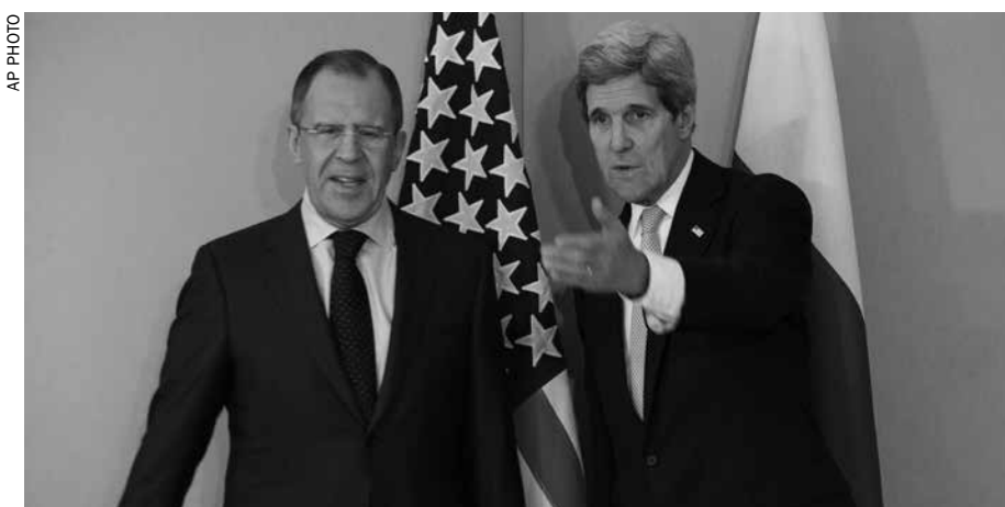
U.S. Secretary of State John Kerry, right, meets with Russian Foreign Minister Sergey Lavrov

Both Ukraine and the Russian-backed rebels have accused each other