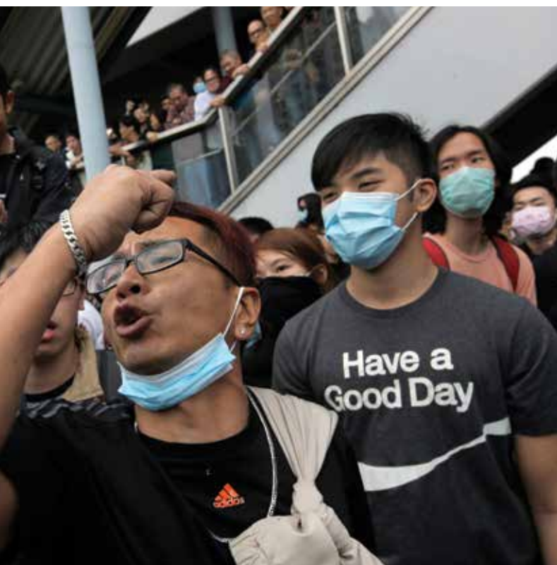
Chinese shoppers gesture against local villagers at a suburban district of Yuen Long

led “Umbrella Movement” protesters occupied streets to demand Hong Kong abandon Beijing’s plan to restrict inaugural 2017 elections for the city’s top leader.