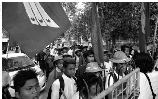
Student protesters wait near the gate of the Aung Mye Beikman monastery after police surrounded it apparently to prevent them from proceeding with a protest march to Yangon from Letpadan

T RUCKLOADS of police yesterday prevented hundreds of students from continuing their march to Myanmar’s biggest city to protest a new law that they say curbs academic freedom.