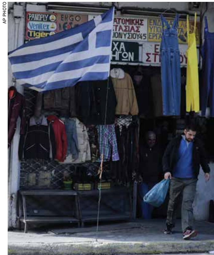
A Greek flag flies as a man leaves from a clothes shop in the port city of Piraeus, near Athens