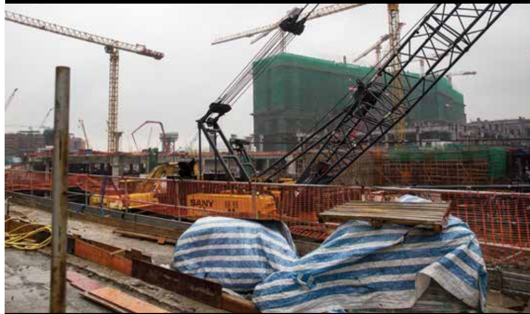
The MGM Cotai casino resort, foreground, and the Wynn Palace project, developed by Wynn Resorts Ltd., background, stand under construction