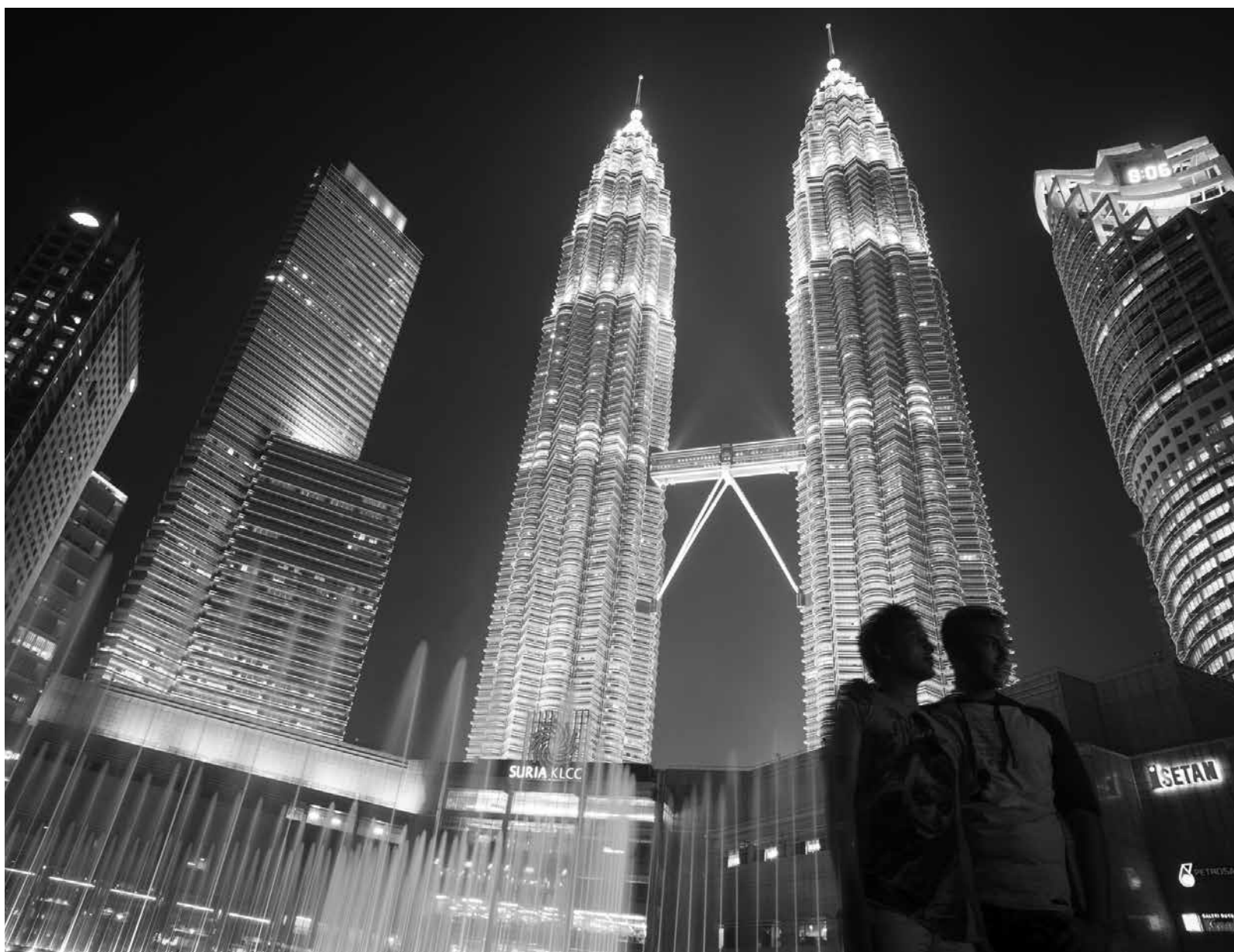
Tourists have their souvenir photograph taken against the Petronas Twin Towers in Kuala Lumpur