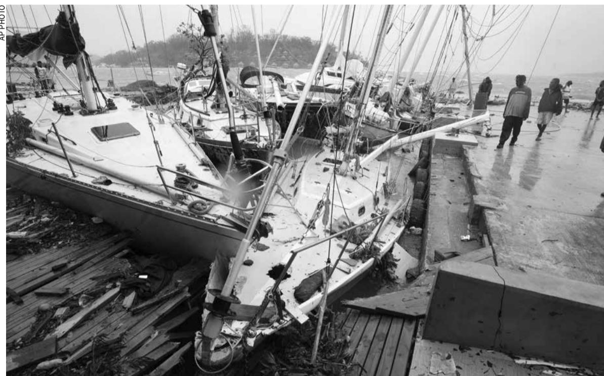
In this image provided by UNICEF Pacific, people on a dock view yachts damaged in Port Vila, Vanuatu

Officials were planning to head to the outer islands in helicopters, small planes and