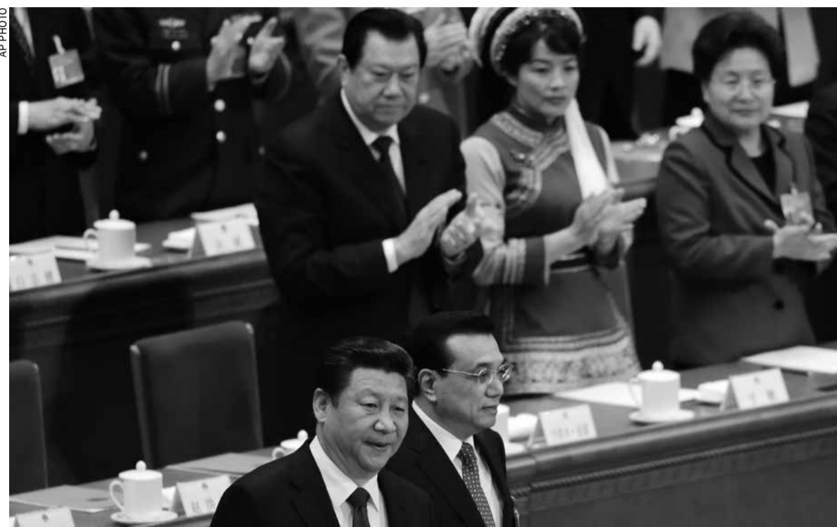
Delegates applaud as Chinese President Xi Jinping, bottom left, and Premier Li Keqiang, bottom right, arrive for the closing session of the annual National People's Congress at the Great Hall of the People in Beijing

At this year's meeting, the government lowered China's official economic growth to 7 percent from last year's 7.5 percent and promised to maintain em-