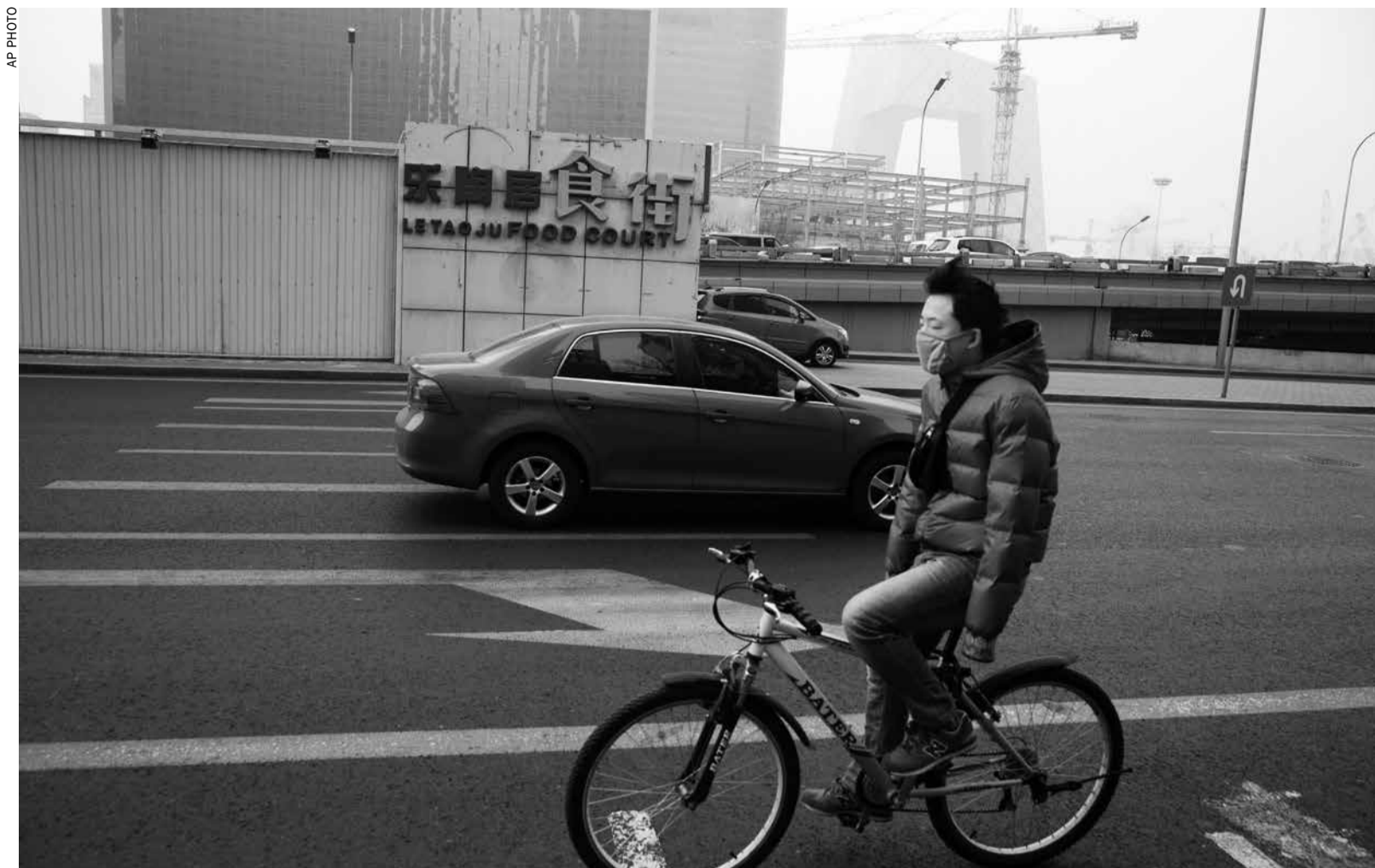
A Chinese man wears a mask for protection against pollution as he cycles past cars on a road in Beijing