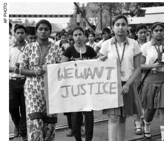
Students of Convent of Jesus and Mary School participate in a protest against the gang rape of a nun in her 70s at the Christian missionary school in Begopara, about 80km northeast of Kolkata

The outcry led the federal government to rush legislation doubling prison terms for rapists to 20 years and criminalizing voyeurism, stalking and the trafficking of women. The law also makes it a crime for officers to refuse to open cases when complaints are made.