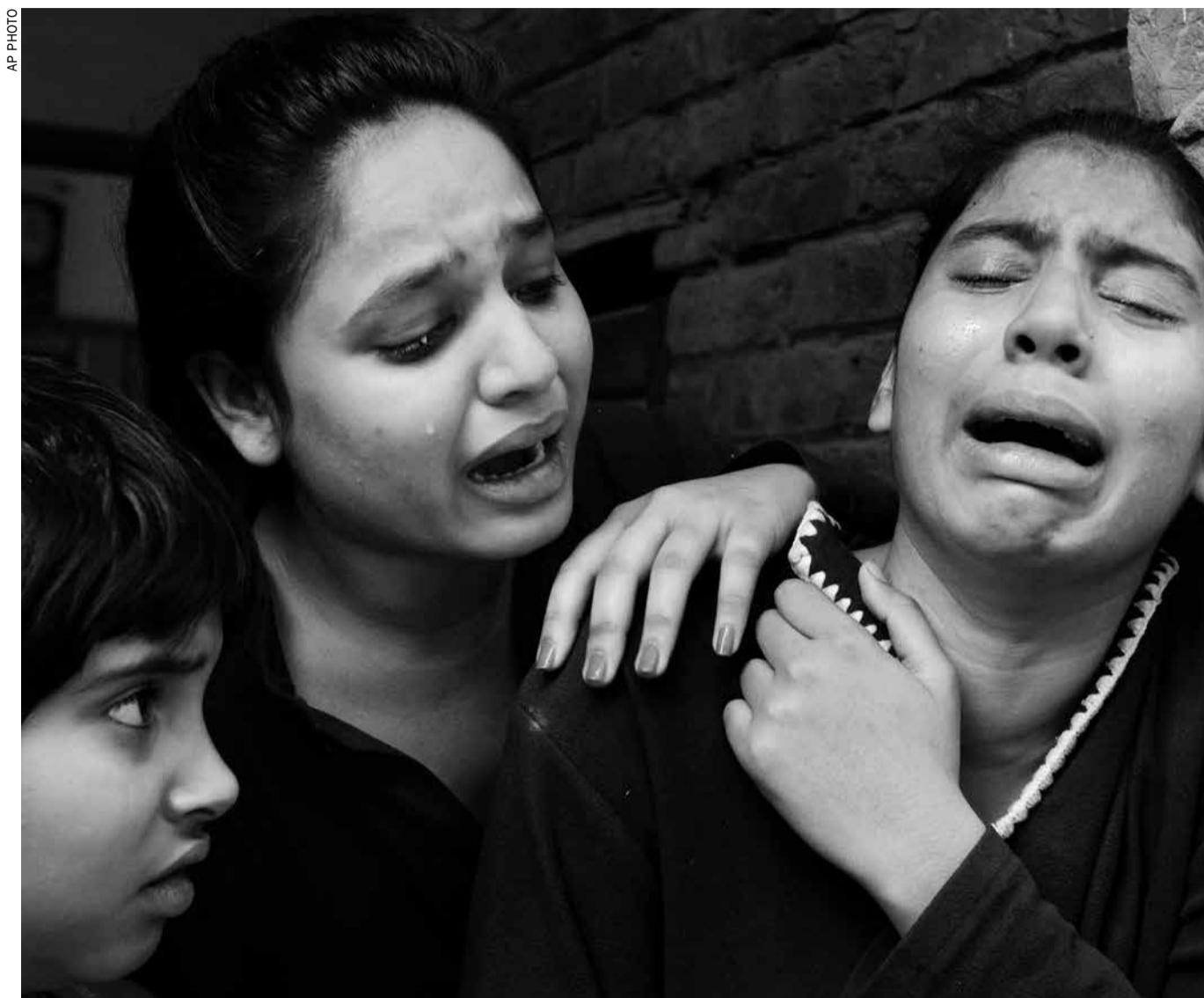
Pakistani Christian girls mourn over a family member who was killed from a suicide bombing attack near two churches in Lahore