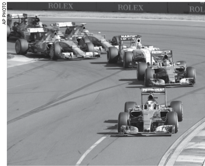
Lewis Hamilton of Britain, followed by teammate Nico Rosberg of Germany, leads the field at the start of the Australian GP

"Lewis drove like a world champion today, but I was driving to the max every lap and I will be doing my best to give this guy a big