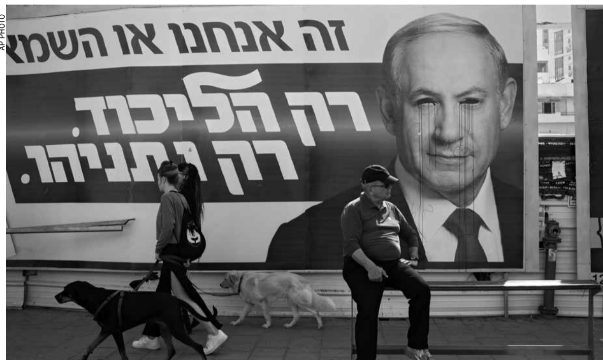
Israelis walk by a vandalized election campaign billboard showing Israel's Prime Minister Benjamin Netanyahu, in Tel Aviv

The Israeli campaign is widely seen as a choice between two world views: Netanyahu's