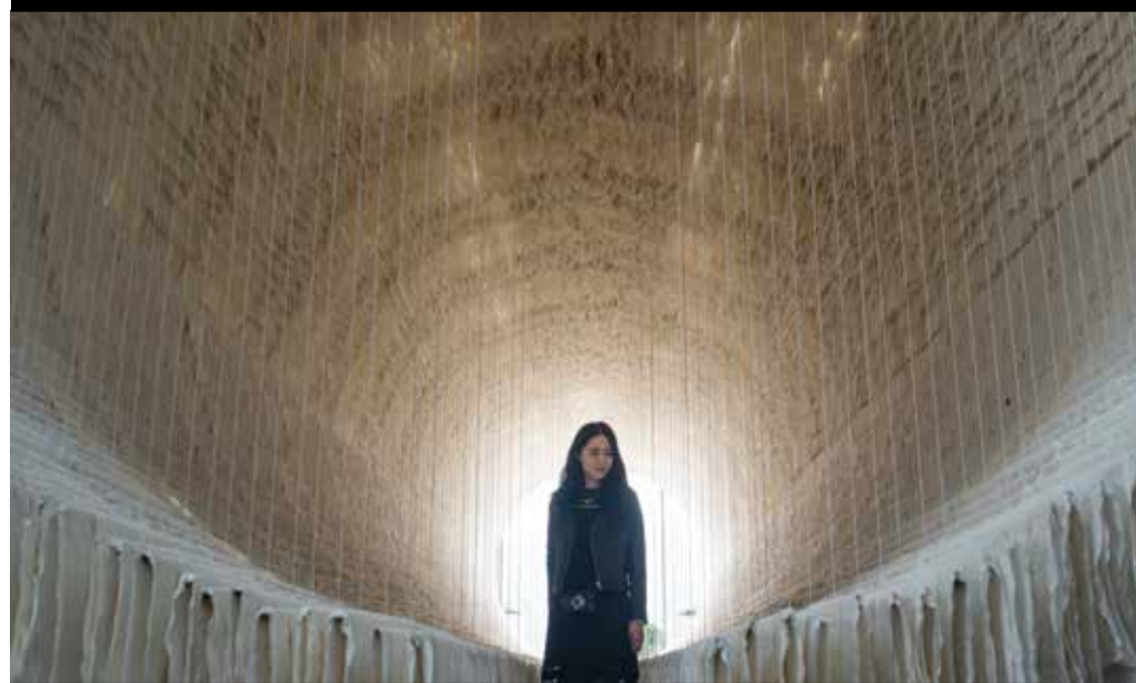
A visitor views an art installation titled the "Boat" in Hong Kong. The 18-meter-long artwork is made of bamboo, cotton threads and over 12,000 pieces of Chinese art paper.