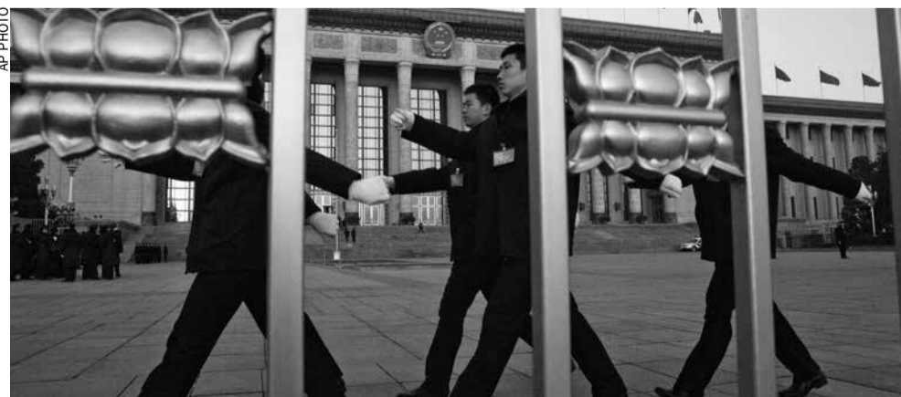
Security personnel march outside the Great Hall of the People before the closing ceremony of the National People's Congress in Beijing

of the Chinese legislature's annual session in Beijing. "I believe that