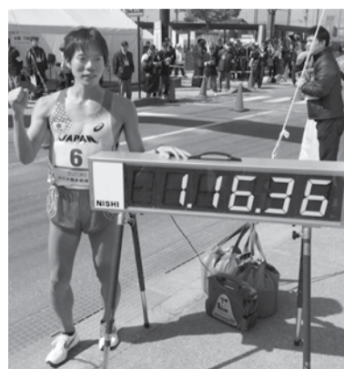
Yusuke Suzuki of Japan poses next to his record after breaking the 20-kilometer race walk world record

Yusuke Suzuki of Japan broke the 20-kilometer race walk world record yesterday at the Asian Race Walking Championships. Suzuki won the IAAF Race Walking Challenge in his home town with a time of 1 hour, 16 minutes, 36 seconds, a mark 26 seconds faster than that set by Johann Diniz of France just a week ago.