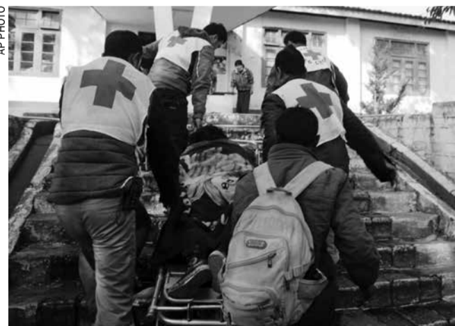
In this Feb. 17, 2015, photo provided by the Eleven Media Group, Myanmar red-cross members carry an injured victim during a clash between government troops and Kokang rebels in Kokang, northeastern Shan State

The Myanmar official said Yangon would extend "full cooperation"