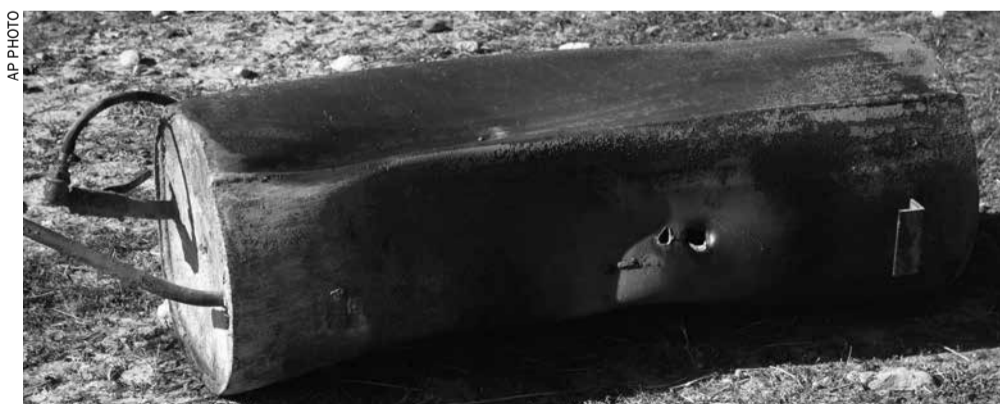
A piece of debris that the Kurdistan Region Security Council said is a gas canister lies at the site of a bomb attack on a road between Mosul, Iraq, and the Syrian border in northern Iraq

The allegation by the Kurdistan Region Security Council, stemming from a Jan. 23 suicide truck bomb attack in northern Iraq, did not immediately draw a reaction from the Islamic State group, which holds a third of Iraq and neighboring Syria in its self-declared caliphate. However, Iraqi officials and Kurds fighting in Syria have made similar