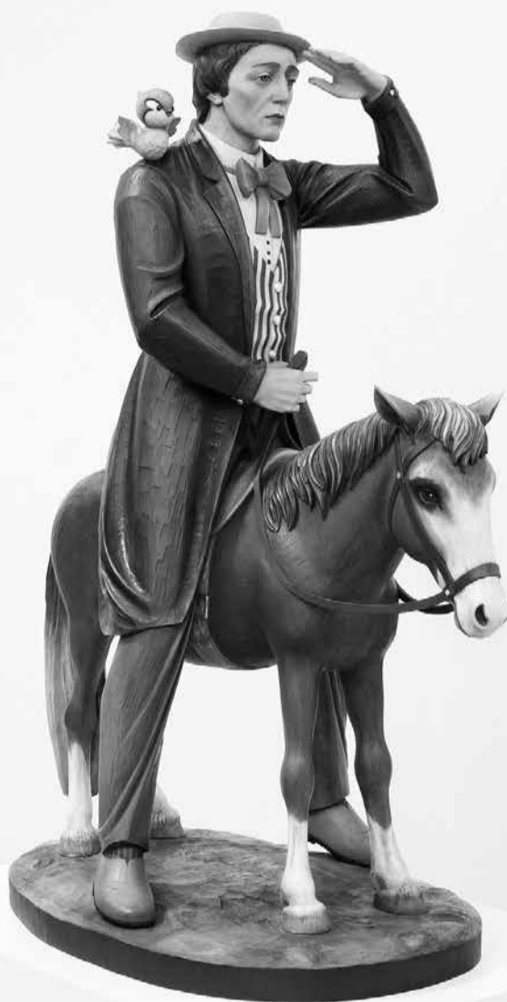
Polychromed wood sculpture by Jeff Koons of Buster Keaton

banks and Michelin-starred restaurants are pulling out the stops in their pursuit of the vast amount of wealth pouring into the city as art and commerce converge in Hong Kong.