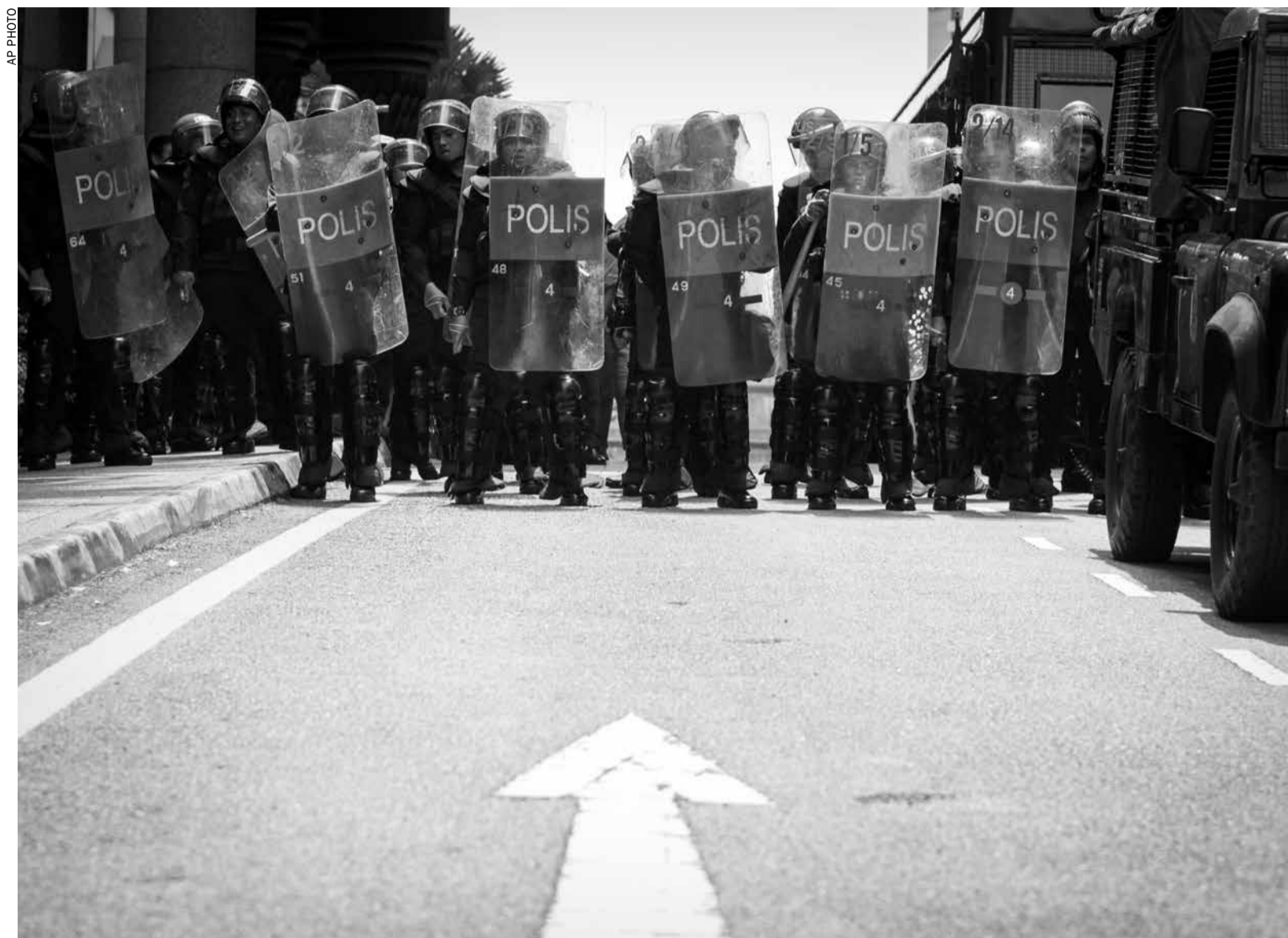
Malaysian police stand guard during a protest for the Malaysian opposition leader Anwar Ibrahim outside the Palace of Justice in Putrajaya, Malaysia