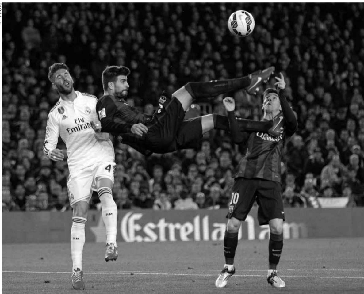
Barcelona's Gerard Pique kicks the ball with Real Madrid's Sergio Ramos, left, and Barcelona's Lionel Messi, right, during a Spanish La Liga soccer match between FC Barcelona and Real Madrid

Coach Pep Guardiola called Bayern's injury situation "critical, very critical" after its 3-0