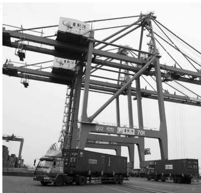
Container trucks carry goods at a sea port in Rizhao in east China's Shandong province

The economy has cooled steadily as communist leaders try to steer China to more sustainable growth based on domestic consumption and reduce reliance on trade and investment. Last year's full-year growth of 7.4 percent was