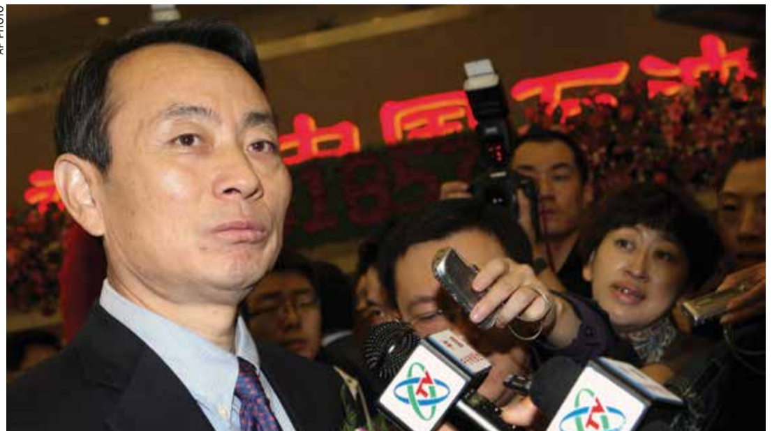
In this Nov. 5, 2007, file photo, Jiang Jiemin, chairman of PetroChina, left, is mobbed by journalists after attending an IPO ceremony for PetroChina at the Shanghai Stock Exchange

Jiang was charged with taking bribes, possessing a large number of assets from unidentified sources and abusing his position at a state-owned enterprise. The court said on its microblog that prosecutors had presented evidence including witness statements,