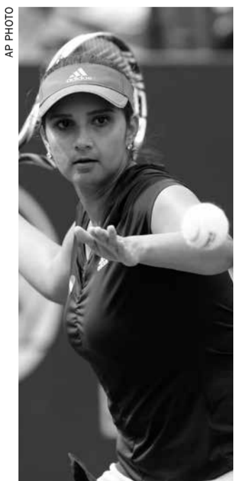
Sania Mirza of India