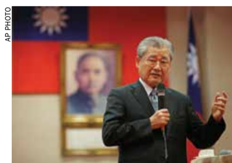
Standing in front of the national flag and a portrait of Dr. Sun Yat-sen, the founding father of the Republic of China, Taiwan's Premier Ma Chi-kuo speaks to foreign media about Taiwan's interest in joining the Asian Infrastructure Investment Bank (AIIB) in Taipei, Taiwan, Wednesday, April 1

"The AIIB is an international multilateral