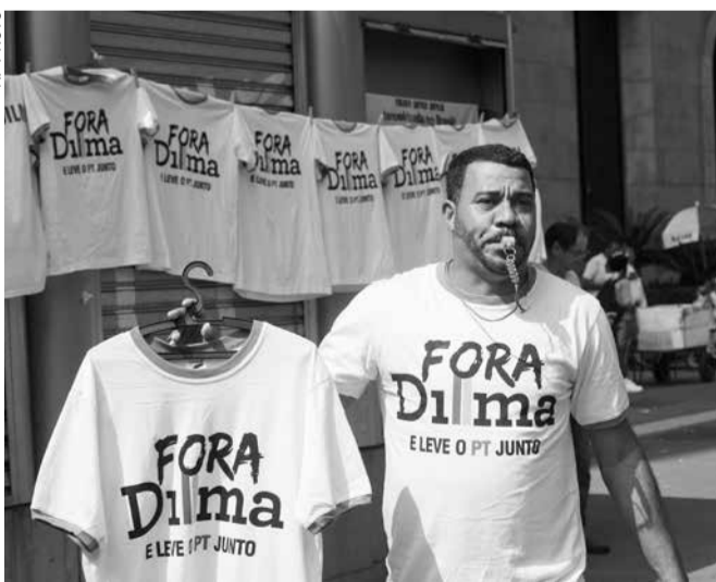
A street vendor sells shirts with the words "Dilma out, and take the Workers Party with you," written on it during a protest demanding the impeachment of Brazil's President Dilma Rousseff in Sao Paulo