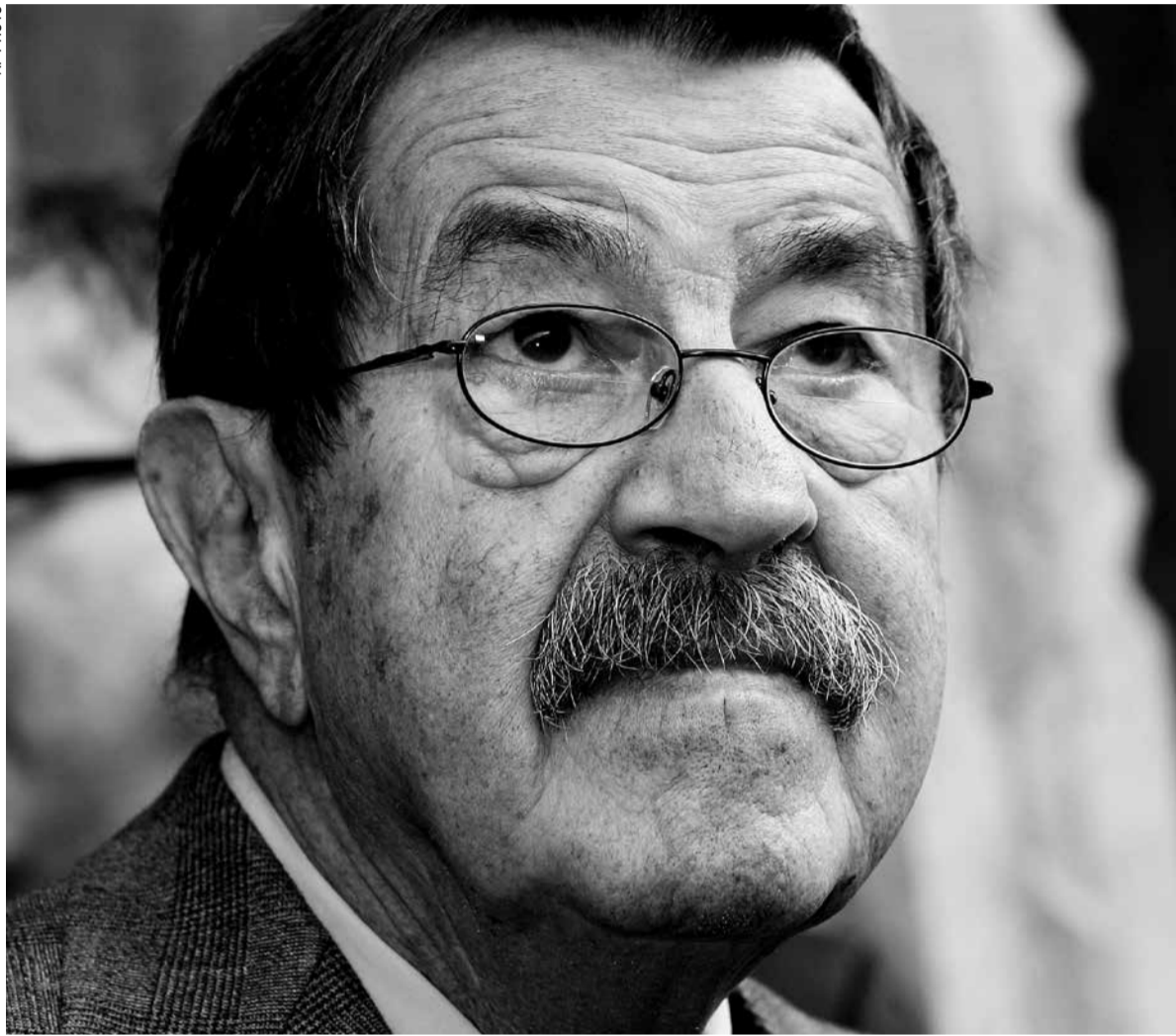
German novelist Guenter Grass

with "The Tin Drum," published in 1959. It was followed by "Cat and Mouse" and "Dog Years," which made up what is called the Danzig Trilogy — after the town of his birth, now the Polish city of Gdansk.