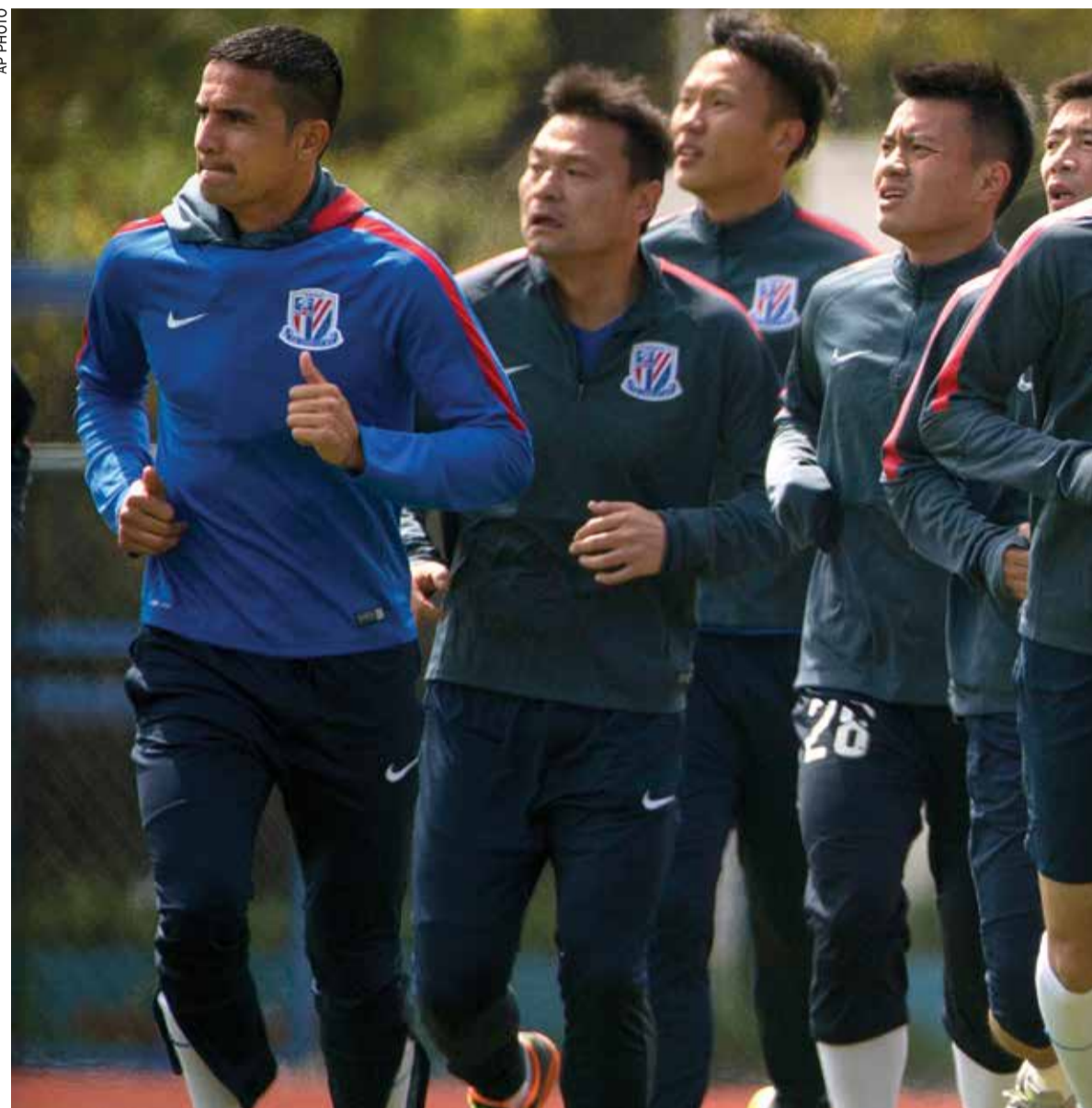
In this Thursday, April 9, 2015 photo, Australian soccer player Tim Cahill, left, jogs with his Shanghai Shenhua teammates as they warm up during practice at the team's training facility in Shanghai

The league's mismanagement had a knock-on effect with the national team, as well. China suffered a number of humiliating defeats, including a 5-1 loss to a Thai side comprised mainly of junior players in 2013 that prompted spectators to riot outside the stadium, shouting "disband the national team!"