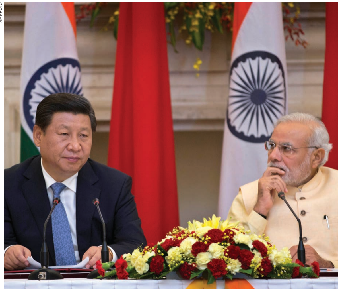
In this Sept. 18, 2014 file photo, Chinese President Xi Jinping, left, makes a statement watched by Indian Prime Minister Narendra Modi after signing agreements in New Delhi, India

with fellow democracies such as Japan and the U.S. while authoritarian China regards both as its key rivals.