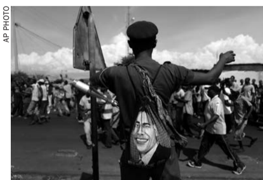
A police officer with a bag depicted the image of US President Barack Obama, stands on patrol as protesters march through the Musaga district of Bujumbura

Maj. Gen. Godefroid Niyombare read a statement on Bonesha FM radio, saying the president had violated the Constitution and the Arusha peace accords by seeking a third term in June elections.