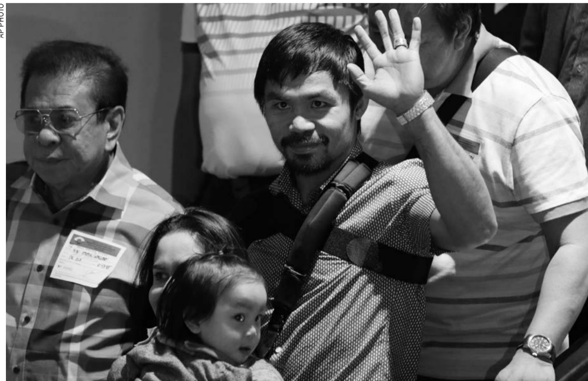
Filipino boxer and Congressman Manny Pacquiao waves to the crowd upon arrival with his family at the Ninoy Aquino International Airport at suburban Pasay city south of Manila, Philippines

The boxer is also going into the last year of his current term as congressman of southern Sa-