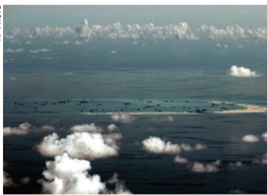
This aerial photo taken through a glass window of a military plane shows China's alleged on-going reclamation of Mischief Reef in the Spratly Islands in the South China Sea

The Wall Street Journal first reported the remarks out of Washington, citing an anonymous official as saying Defense Secretary Ash Carter had asked for ideas about how to address China's moves to reinforce