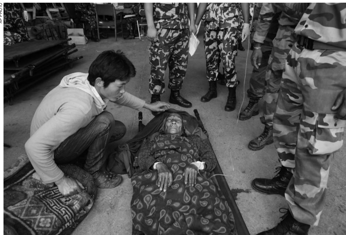
A Nepalese woman injured in Tuesday's earthquake is comforted by her relative after she is brought from Charikot, Dolakha District, at the Tribhuvan International Airport in Kathmandu

Among 14 quake-hit districts, some are very inaccessible. A large part of population could not be reached easily as roads