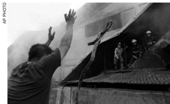
A fireman throws a hose at colleagues at a still-smoldering Kentex rubber slipper factory in Valenzuela city