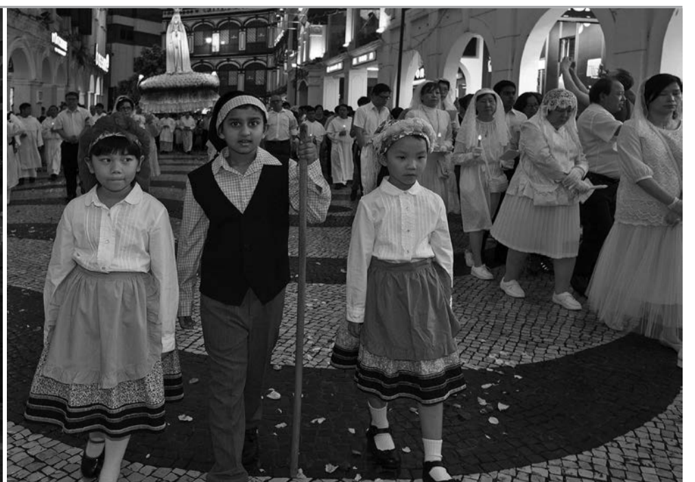
The Our Lady of Fatima procession was held yesterday to mark the May 13 1917 apparitions in Portugal