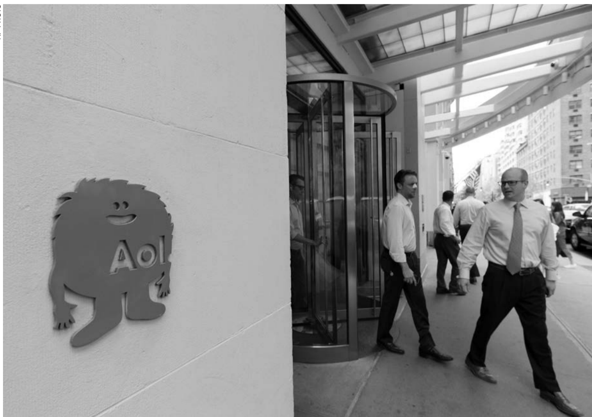
People walk out of the New York office building where AOL headquarters is located