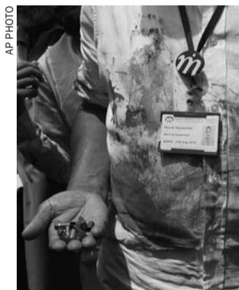
A Pakistani security official displays cartridges he collected from the scene of an attack on a bus, in Karachi