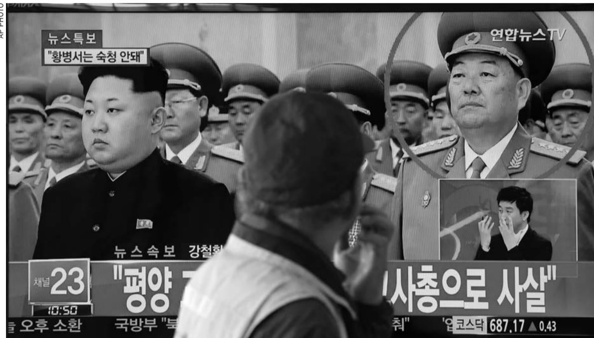
A man watches a TV news program reporting that People's Armed Forces Minister Hyon Yong Chol was killed by anti-aircraft gunfire, at Seoul Railway Station in Seoul

Kim Gwang-lim, chairman of the parliament's intelligence committee, quoted the spy service as saying Hyon had failed several times to comply with