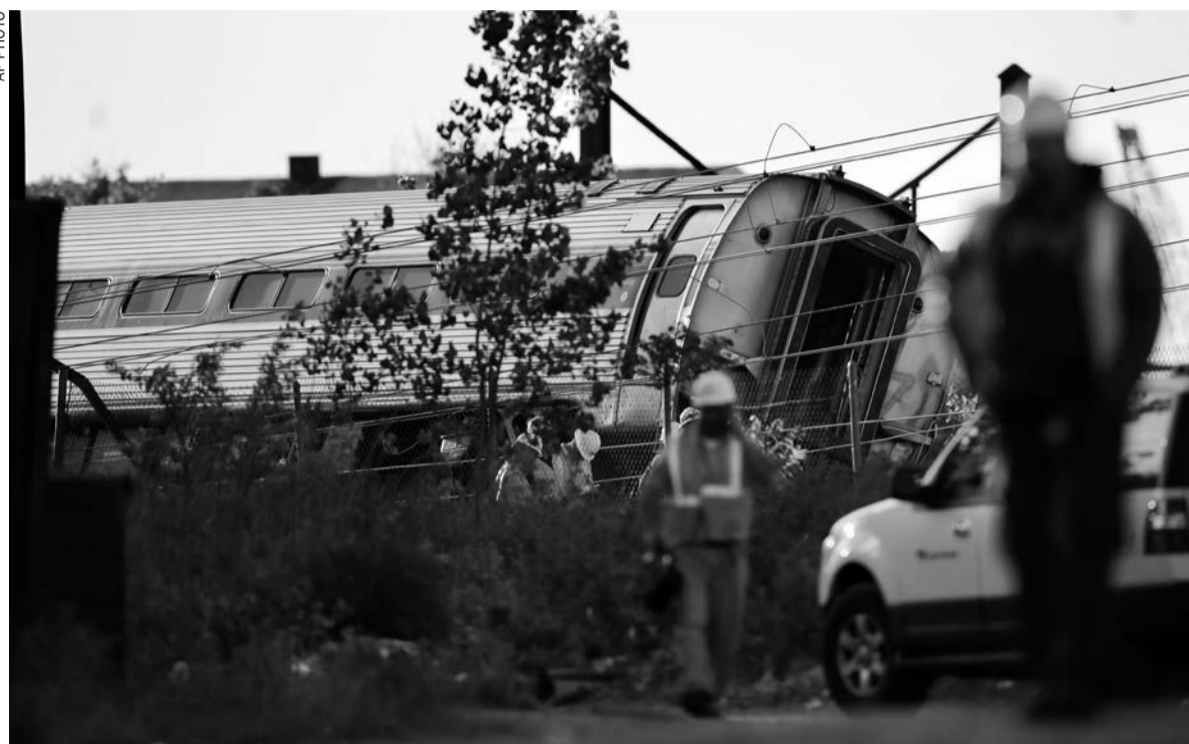
Emergency personnel walk near the scene of a deadly train wreck in Philadelphia

He said all seven train cars, including the engine, were in "various stages of disarray." He said there were cars that were "completely overturned, on their side, ripped apart." The