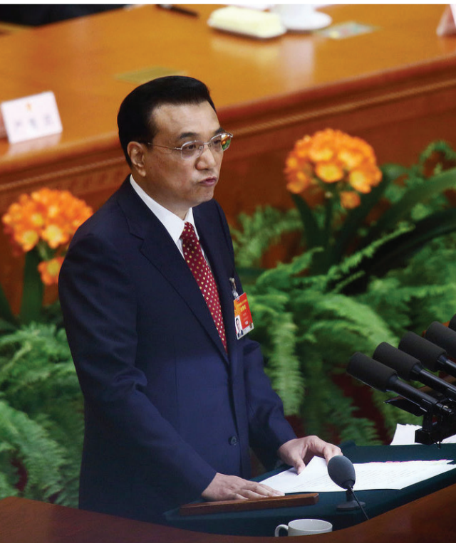
China's Premier Li Keqiang