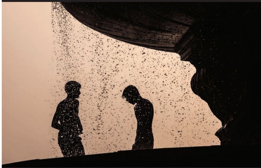
Hot days. Indian boys cool themselves at a fountain on a hot day in New Delhi yesterday. An intense heat-wave continues to grip several parts of north India with most cities crossing the 40 degrees Celsius mark.