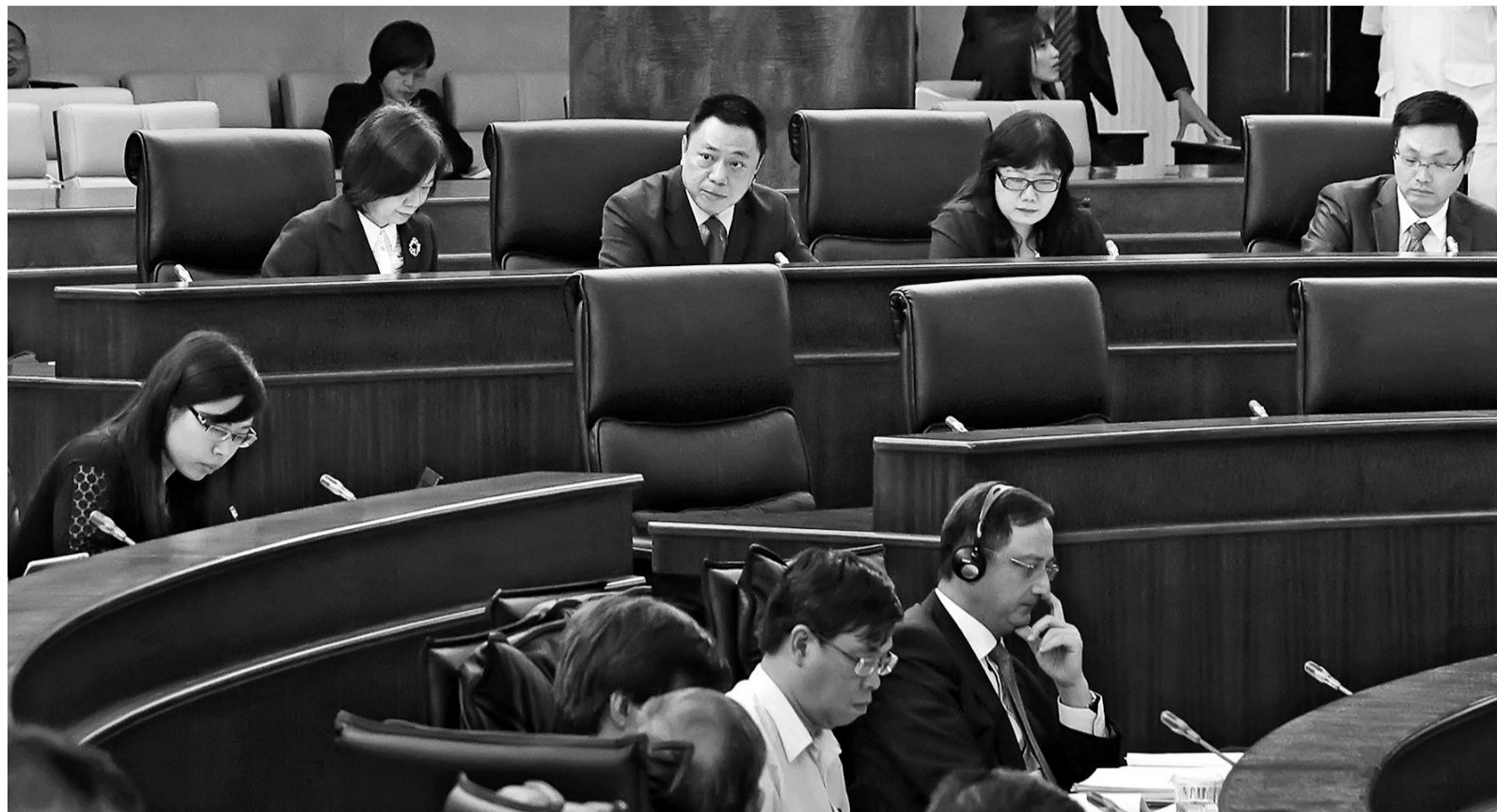
Secretary for Economy and Finance, Lionel Leong Vai Tac, attends the plenary session of the Legislative Assembly

The bill also suggests implementing a licensing system on cargo transshipments, in order to effectively oversee the transit of sensitive and regulated goods. Under the current External Trade Law, regulated cargo is permitted to transit through Macau as long as it is declared. “The licensing is to regulate goods that will be controlled in the future, such as psychotropic substances,” added the Macao Economic Services deputy di-