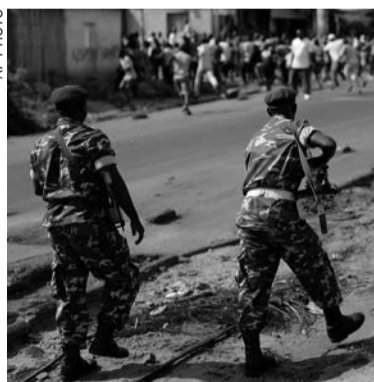
Soldiers from a special unit disperse a group of protesters by firing in the air in the Musaga neighborhood of Bujumbura

In an apparent effort to assert greater control over the military, President Pierre Nkurunziza fired his defense minister, Pontien Gacyubenge, who earlier this month had said the army would play a neutral role in the street protests and respect the Constitution. Nkurunziza also replaced International Affairs Minister Laurent Kavakure and Trade Minister Ma-