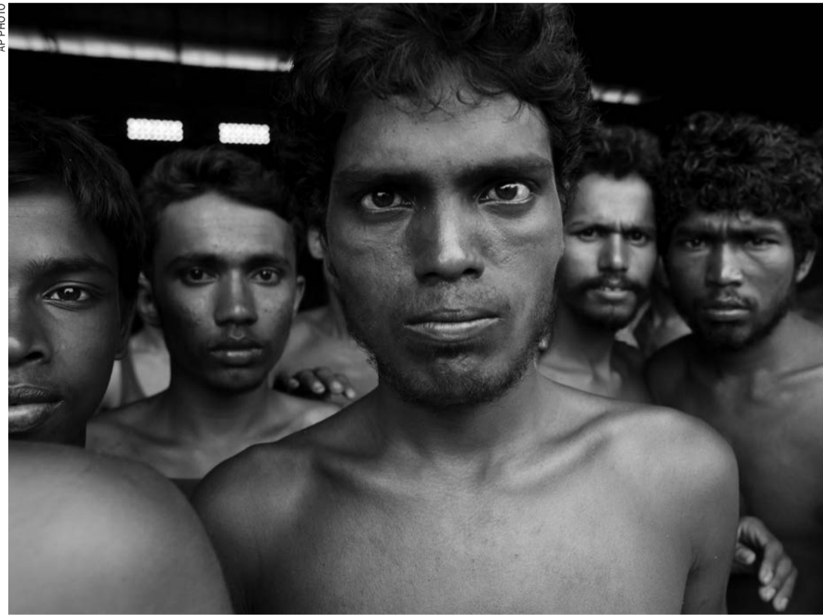
Newly arrived migrants gather at Kuala Langsa Port in Langsa, Aceh province, Indonesia

But more than two weeks into the spiraling humanitarian crisis, the stance of Southeast Asian governments remains unchanged — none wants to take the migrants in, fearing that accepting a few would result in an unstoppable flow. A political cartoon in Thailand's The Nation newspaper yester-