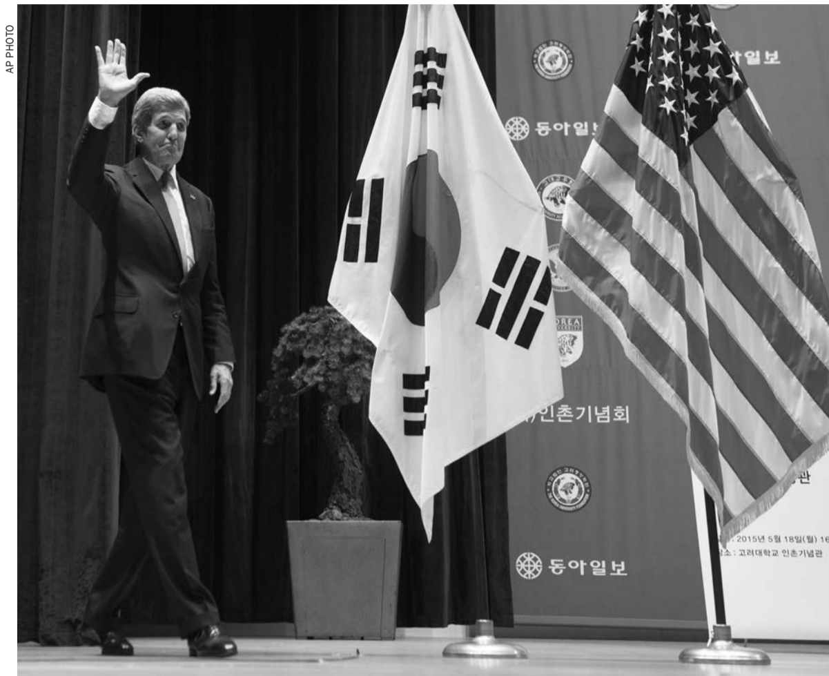
U.S. Secretary of State John Kerry waves after delivering a speech at Korea University in Seoul

The actions come despite a recent U.S. diplomatic over-