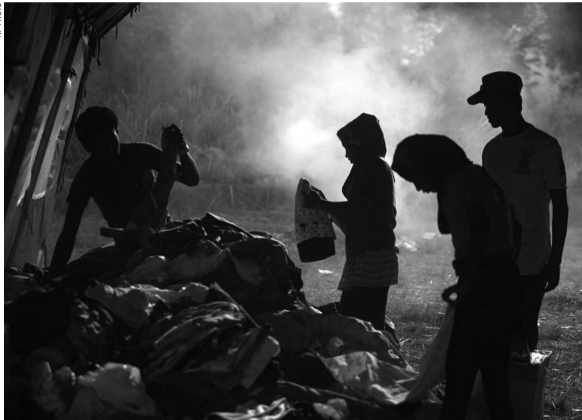
Ethnic Rohingya migrants sift through used clothing donated by local residents at a temporary shelter in Langsa, Aceh province