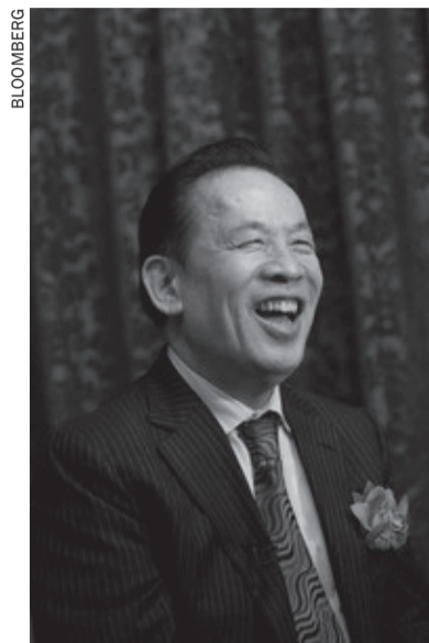
Kazuo Okada, chairman of Universal Entertainment Corp.

Century Properties was supposed to be in charge of developing a luxury residential and