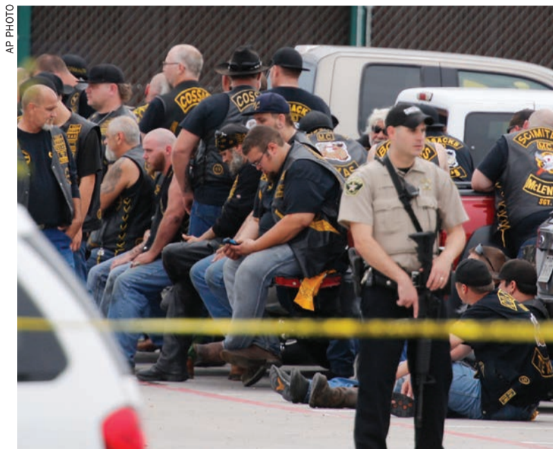
A McLennan County deputy stands guard near a group of bikers in the parking lot of a Twin Peaks restaurant in Waco, Texas