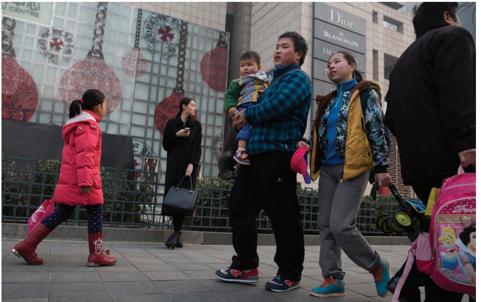
Pedestrians walk past a shopping mall selling luxury brands in Beijing

goods ranging from unlicensed copies of designer clothing and Hollywood movies to fake cancer drugs.