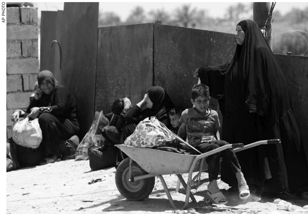
In this Saturday, May 16, photo, Iraqis flee from their hometown of Ramadi, Iraq, rest near the Bzebib bridge, 65km west of Baghdad