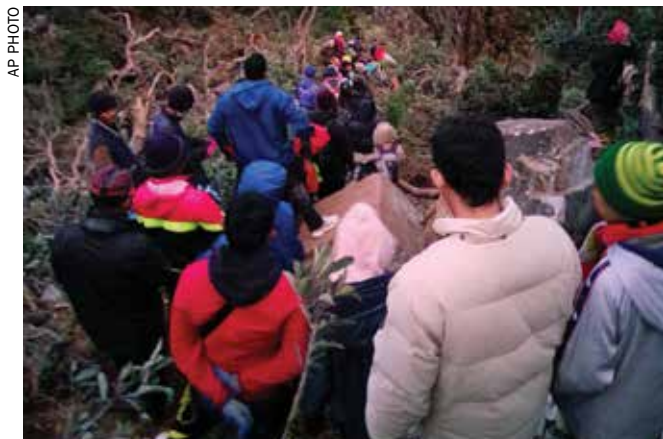
In this Friday, June 5 photo, climbers trek down the Timpohan Trail with the help of local mountain guides on Mount Kinabalu in eastern Sabah state on Borneo

guides told her group of 21 climbers that a helicopter would pick them up, but when it did not, they decided to walk after a frustrating nine-hour wait.