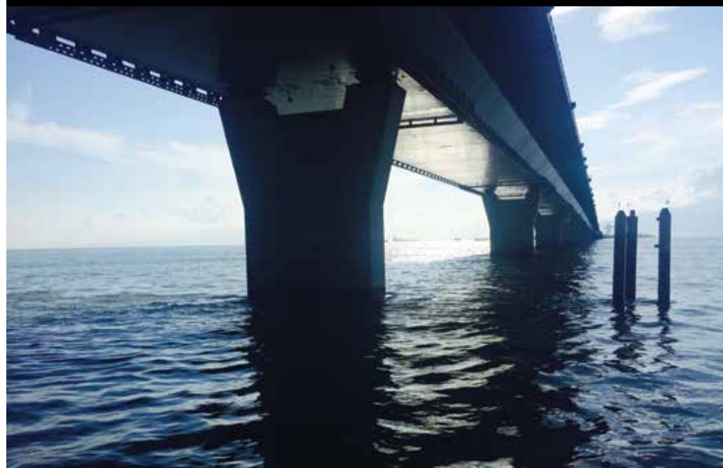
The Hong Kong-Zhuhai-Macau Bridge (Delta Bridge), that's currently under construction, seen from close to Lantau Island, Hong Kong.