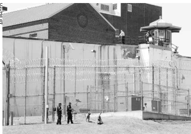
Law enforcement officers with bloodhounds stand guard at the Clinton Correctional Facility in Dannemora, N.Y.

Roadblocks were set up in the area, which is