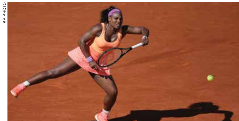
Right-handed Serena Williams of the U.S. returns with a left-hand in the final of the French Open

After almost hitting her opponent in the warm-up with a prac-