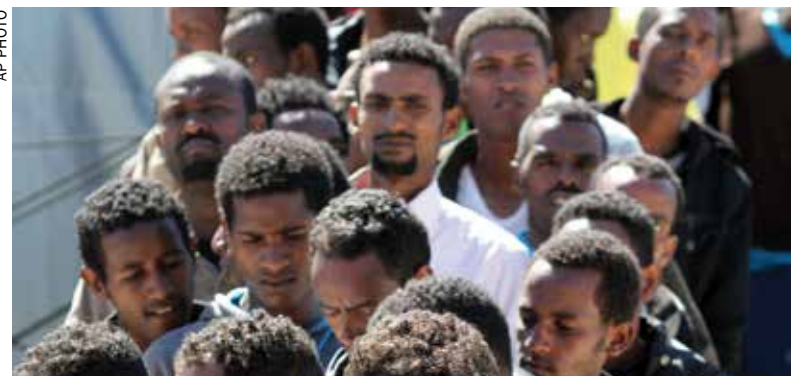
Migrants disembark from the German Navy ship Hessen, at the Reggio Calabria harbor, southern Italy

During Saturday, a total of 3,480 migrants had been safely rescued in 15 separate operations, the Italian coast guard said. Calls for help went out via satellite phone earlier in the day from the smugglers boats, which