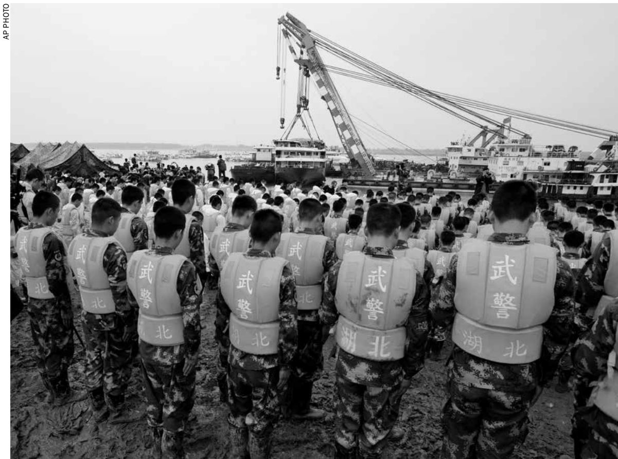
Rescuers bow during a memorial service near the raised capsized Eastern Star ship on the Yangtze River in Jianli county

Hundreds of military and police personnel and others took off their hats and bowed as vessels blared their horns. State broadcaster CCTV showed some relatives also bowing as they watched the event on te-