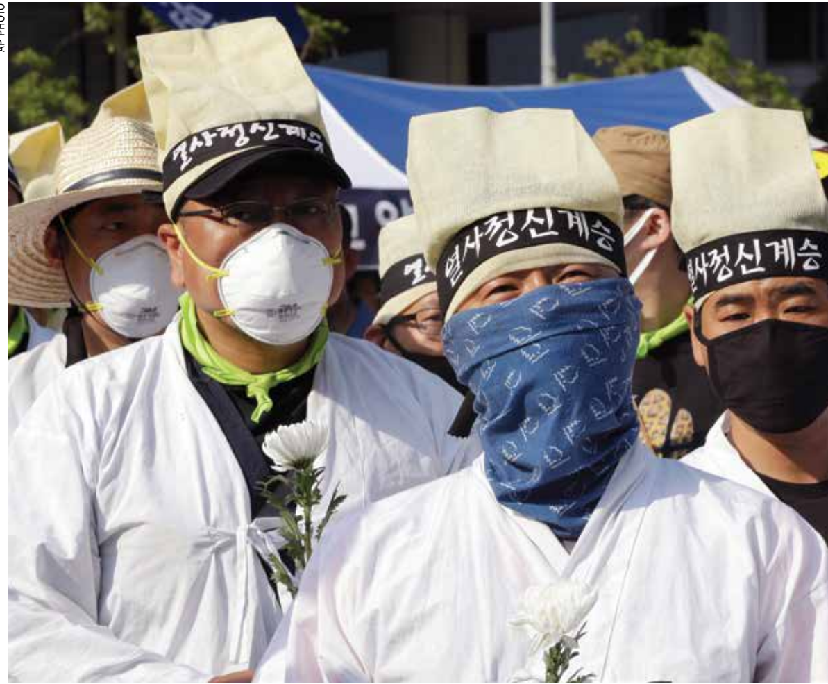
Protesters wear masks as a precaution against the MERS virus during a rally against the government's labor policy in Seoul

ported that there's no evidence yet in South Korea of "sustained transmission in the community."