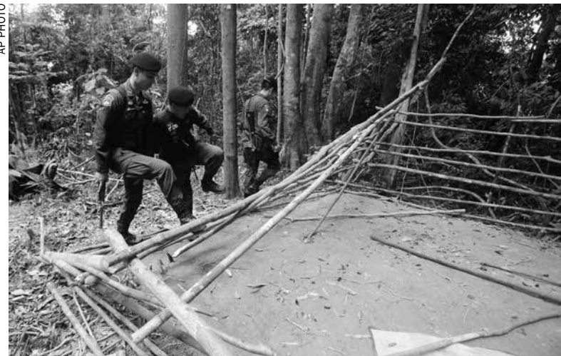
In this May 5 photo, border patrol police officers dismantle an abandoned migrant camp on Khao Kaew mountain near the Thai-Malaysian border

The discovery of 36 bodies at abandoned traffickers’ camps near Thailand’s southern border with Malaysia has intensified international pressure on Thailand to crack down on smugglers. So has a subsequent crisis involving thousands of migrants who were stranded at sea by their traffickers — and whose boats were pushed back by Thai officials. Those migrants, mainly Bangladeshis and