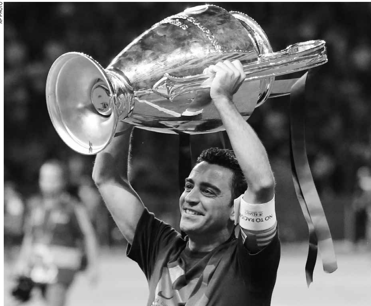
Xavi Hernandez holds the trophy after the Champions League final match between Juventus Turin and FC Barcelona at the Olympic stadium in Berlin Saturday. Barcelona won the match 3-1.

The combination was dizzyingly quick and devastating for Gianluigi Buffon, left with no chance from such short range in the Juventus goal.