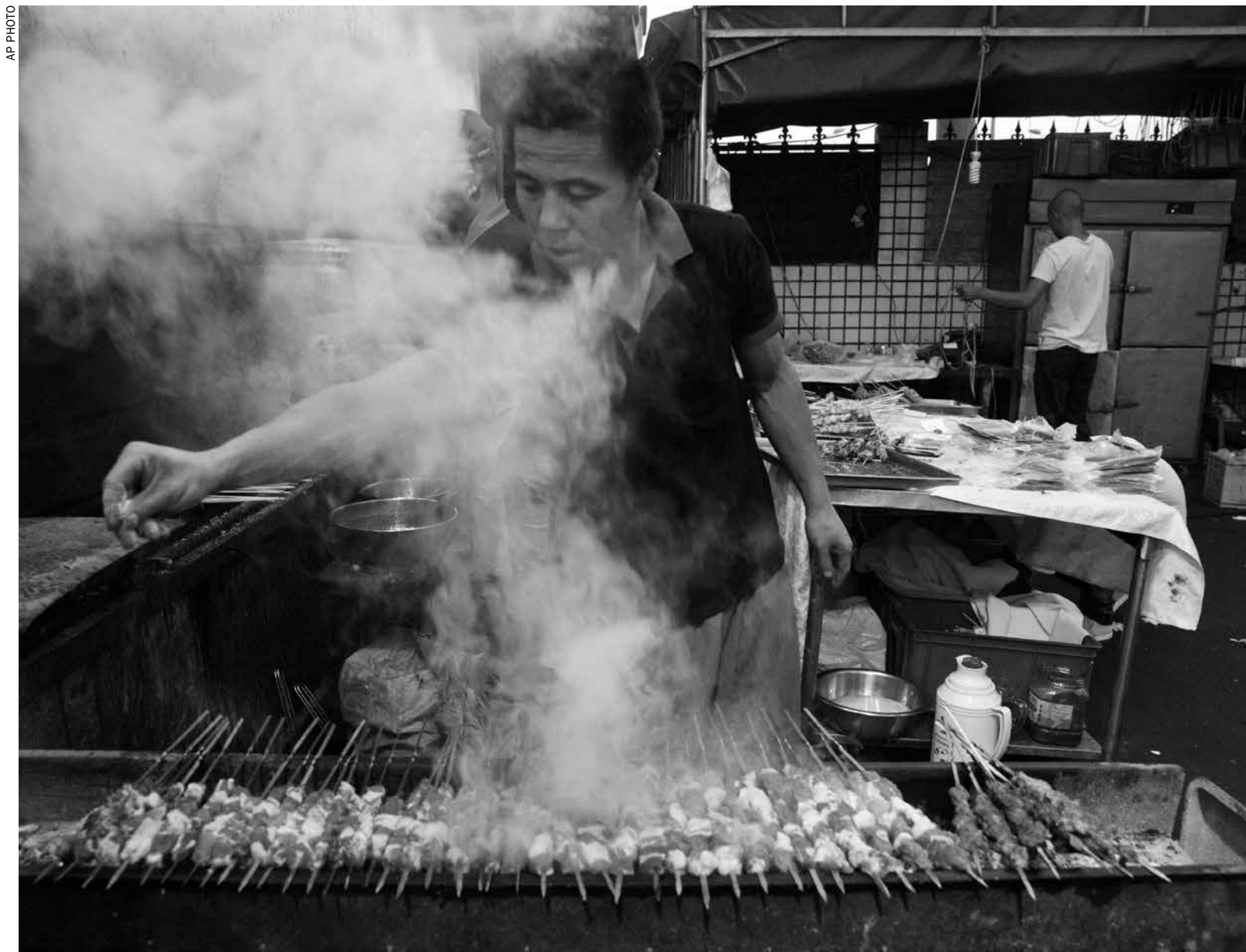
A restaurant worker barbecues meat skewers in Beijing