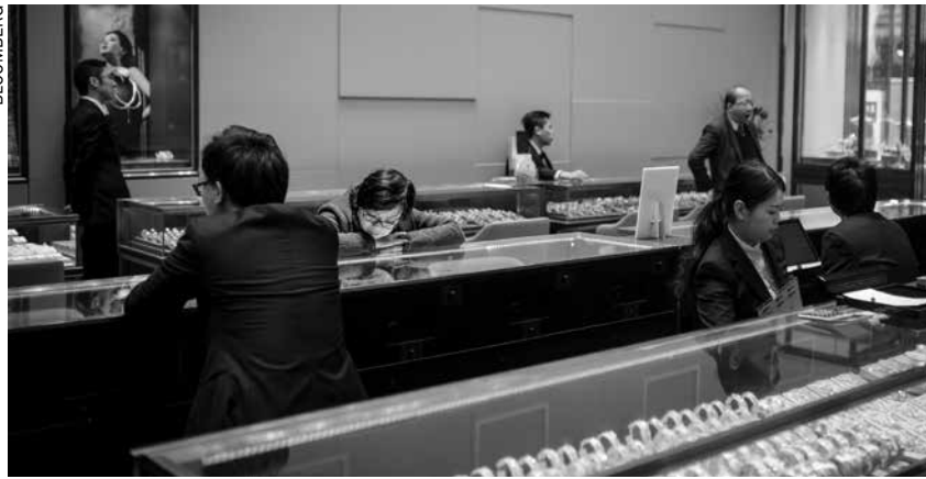
A customer looks at gold jewelry, center, as employees work inside a Chow Tai Fook Jewellery Group Ltd. jewelry store in the Central district of Hong Kong

Jewelry sales fell 16 percent in China and 33 pct in HK and Macau