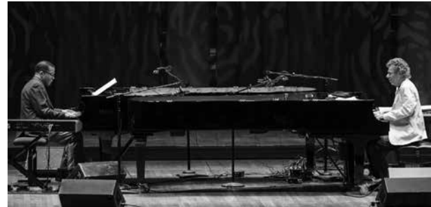
Herbie Hancock and Chick Corea

J AZZ legends Herbie Hancock and Chick Corea displayed their musical mastery with improvisational takes on well-known tunes before a sold-out concert at the Macau Cultural Center Grand Auditorium on Friday.