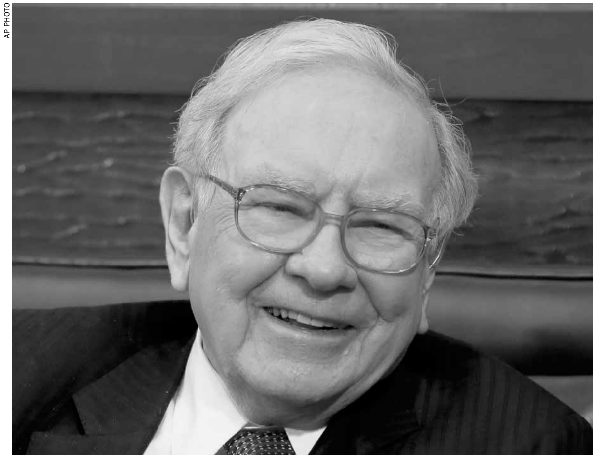
Berkshire Hathaway Chairman and CEO Warren Buffett

Buffett has said the lunches generally last at least three hours