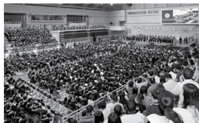
The University of Science and Technology congregation ceremony

Among the 1,150 attendees, out of a total of 2,500 graduates this academic year, students majoring in hotel management and tourism admitted that the unpleasant economic downturn in the field of hospitality and gaming was worrying.