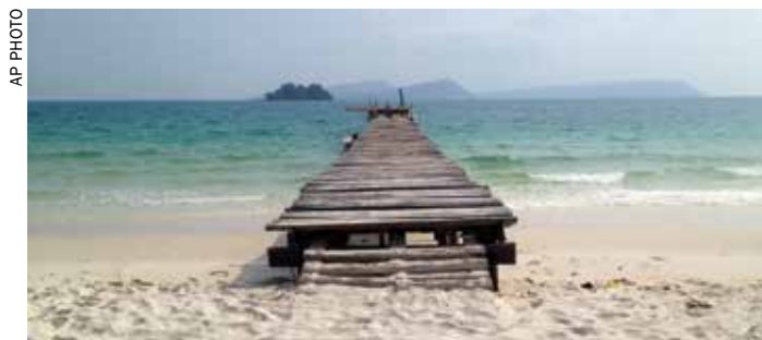
A secluded beach in Koh Rong, Cambodia