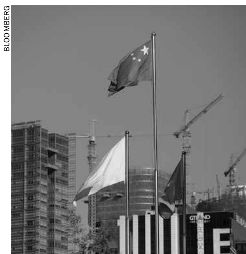
A Chinese flag flies in front of a construction site in the Zhujiang New Town district of Guangzhou, China

Among a total of 82 articles, Macau and Hong Kong are both mentioned twice. Article 11 states that "Safeguarding China's sovereignty and territorial integrity is the common obligation of all Chinese people, including compatriots in Hong Kong and Macau as well as Taiwan," whereas Article 36 further