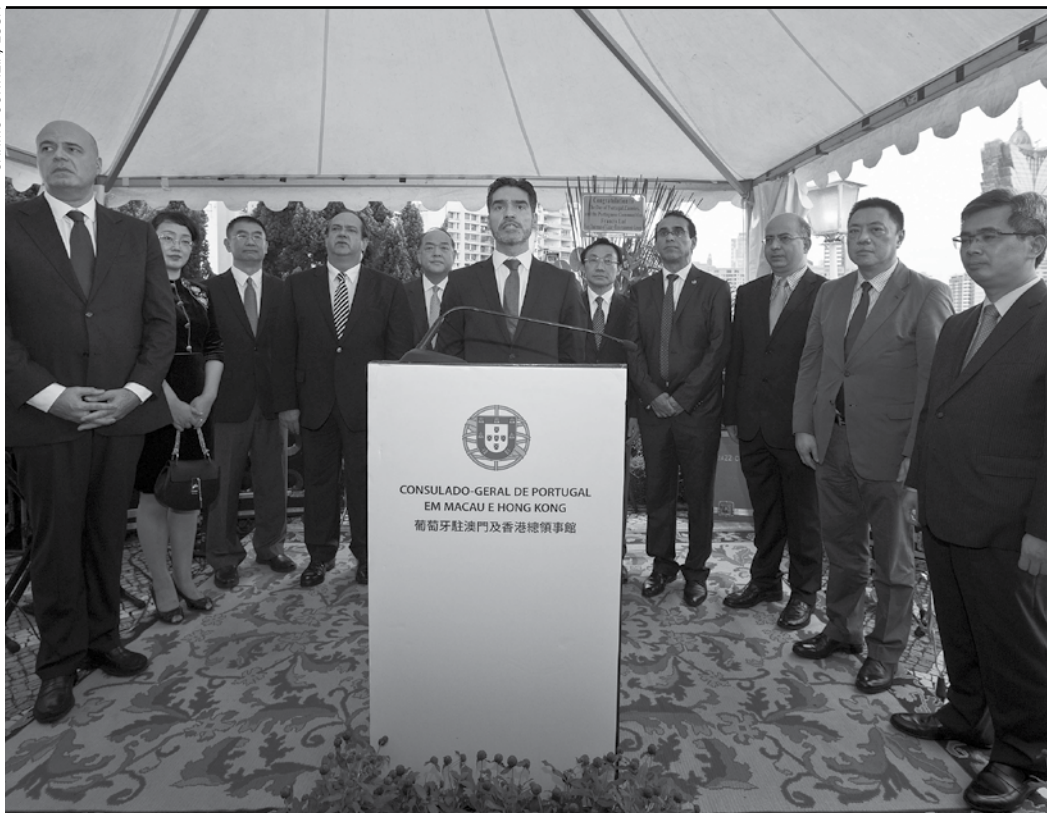
Portugal's National Day was marked with several activities in Macau, including a reception at the official residence of the Portuguese Consul, located at the former Hotel Bela Vista. Four MSAR government secretaries were in attendance, as well as the Portuguese Secretary of State for Justice, António Costa Moura.