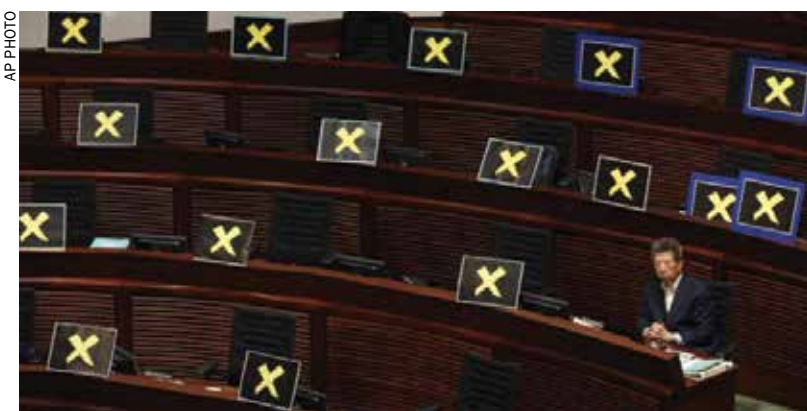
Yellow crosses are placed after pro-democracy lawmakers walked out of the legislative chamber to protest against Chief Secretary Carrie Lam who unveiled the Beijing-backed election reform package details, Wednesday, April 22

The result of the poll comes a week before the government is due to present the election plan for a vote in the city's legislature. Chief Executive Leung Chun-ying needs support from at least four pro-democracy lawmakers to secure the two-third majority needed for passage.