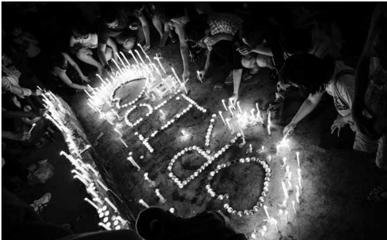
Malaysians light candles at a vigil for the victims of the earthquake in Kota Kinabalu, Malaysia on Monday, June 8

Friday sent rocks and boulders raining down the trekking routes on the 4,095-meter-high mountain in Sabah on Borneo island, killing 18 climbers.