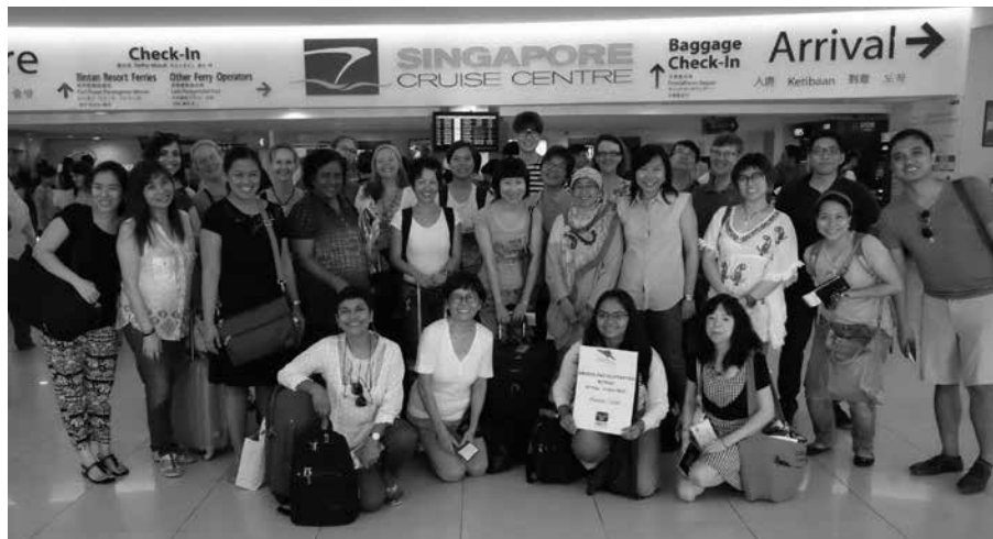
The artists depart for the Indonesian retreat

the aspiring writer-illustrator seeks to explore self-discovery in her next work, where all characters born shadow-less in a virtual town strive to keep themselves visible. "I would like them to find their own shadows at the end of the story," she described.