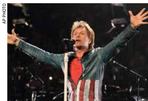
Jon Bon Jovi performs in concert with his band Bon Jovi on their "Because We Can Tour 2013," in Philadelphia

Priced from MOP/HKD3580 to MOP/HKD 580, tickets will go on sale from 10 a.m. on June 16 through Cotai ticketing