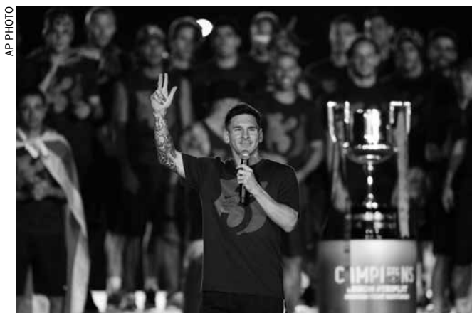
Lionel Messi speaks during celebrations at the Camp Nou stadium in Barcelona after winning the Champions League final

Many of the corruption allegations have centered on the governing body of South American football. Its former president, Nicolas Leoz of Paraguay, was one of 14 people in-