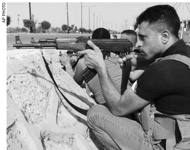
In this Sunday, May 10 photo, Sunni tribal fighters secure central Ramadi, the capital of Anbar province, 115 km west of Baghdad

The decision, which could be announced as soon as today, would increase the number of U.S. training sites in Iraq from four to five and enable a larger number of Iraqis — mostly Sunni tribal volunteers, in this case — to join the fight against the Islamic militant group. It is consistent with the over-