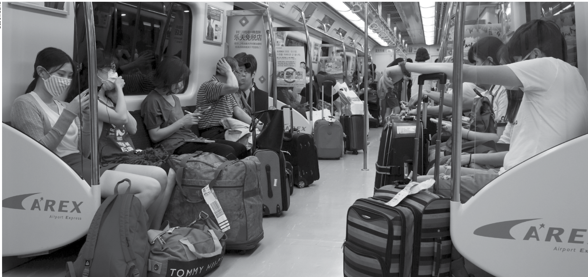
People wearing face masks ride onboard a subway train in Incheon, South Korea