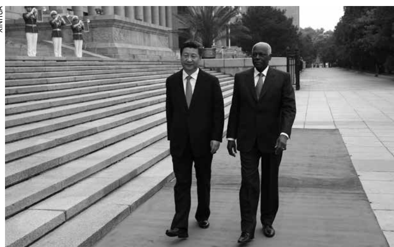
Xi Jinping and Eduardo dos Santos