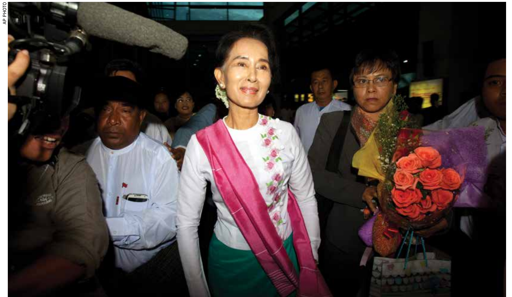
Myanmar's opposition leader Aung San Suu Kyi, center, arrives at Yangon International Airport to depart for China

When asked yesterday whether Suu Kyi's visit might be an occasion for China to release Liu, convicted in 2009 of subversion and sentenced to 11 years in prison, Foreign Ministry spokesman Hong Lei said no. "There's no reason to backpedal on the verdict that has been made by Chinese judicial authorities according to law,"