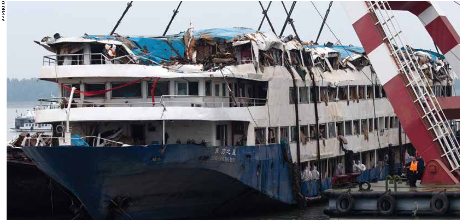
Rescuers work on the raised capsized ship Eastern Star on the Yangtze River in Jianli county, in southern China's Hubei province

CHINA has assembled a team of 60 investigators to look into last week's river cruise ship sinking following orders from President Xi Jinping to find the cause of the country's