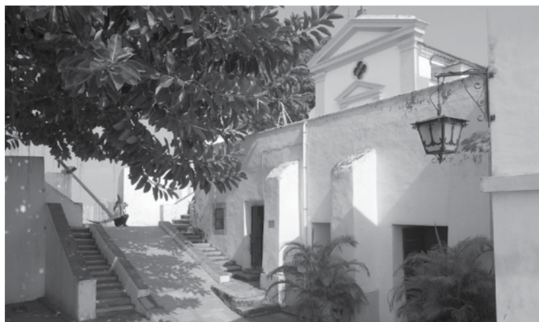
The Guia Lighthouse is one of the World Heritage sites

Marking the 10th anniversary of Macau's historic center being added to the UNESCO World