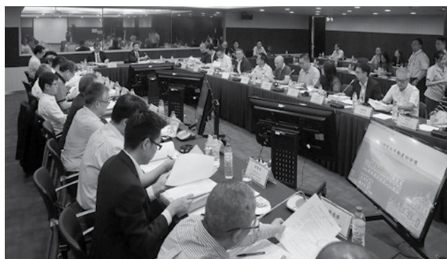
Yesterday's Urban Planning Committee meeting