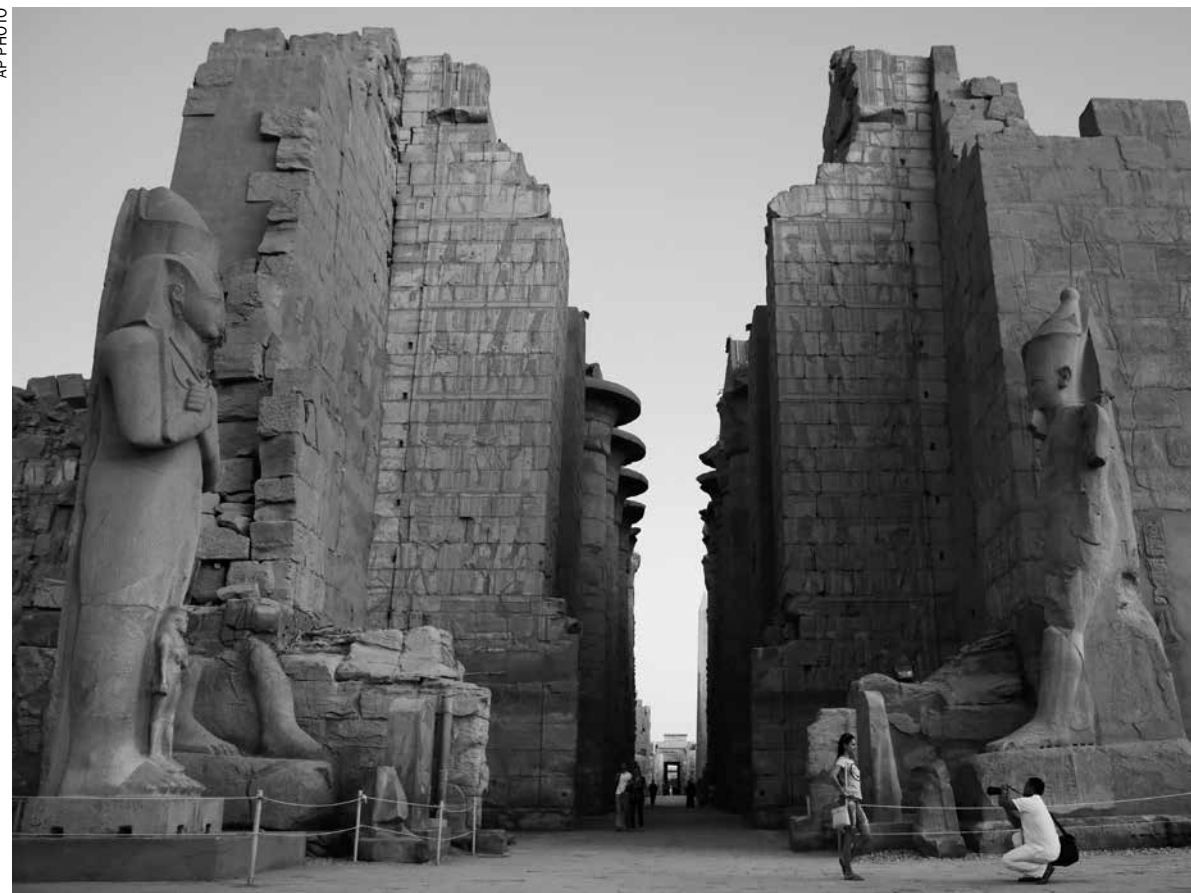
A tourist has her picture taken at the ruins of the Karnak Temple in Luxor

Yesterday's attack was the second this month by suspected Islamic militants at or near a major tourist attraction. On June 3, gunmen on a speeding motorcycle opened fire outside the famed Giza Pyramids on the outskirts of Cairo, killing two