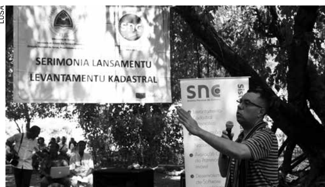
Justice Minister Ivo Valente explains the census process

This census, the third after those carried out in 2004 and 2010, will collect information on aspects such as the size of