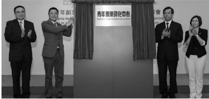
Lionel Leong attends the plaque unveiling ceremony for the Business Incubation Center

As he inaugurated the new center, the Secretary for Economy and Finance, Lionel Leong, stated that this is the government's "new attempt" to provide youths