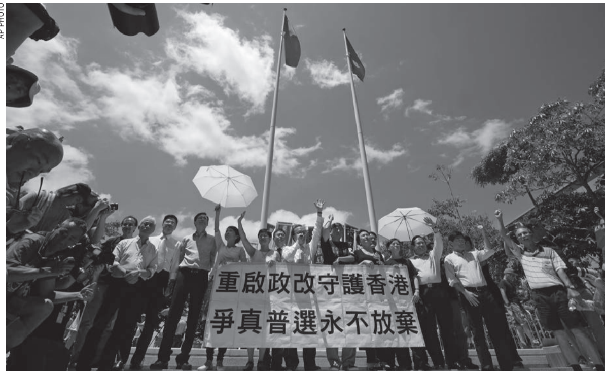
Pro-democracy lawmakers celebrate outside the Legislative Council in Hong Kong

The defeat marks the end of the territory's most tumultuous year since Beijing took control in 1997. Known for being a stable and prosperous Asian financial center, Hong Kong has been hit by chaotic and unruly protests since Beijing decreed last summer that it wanted elections to be restricted. Tens of thousands of people, most of them students, took to the streets in response, occupying busy thoroughfares in three neighborhoods for 11 weeks last autumn to protest what they