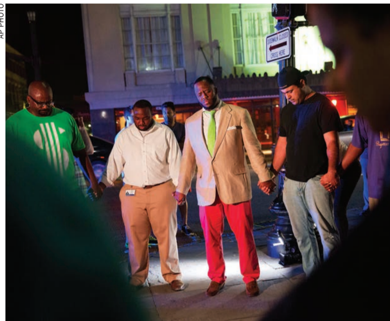
Worshippers gather to pray down the street from the Emanuel AME Church following a shooting in Charleston, S.C.