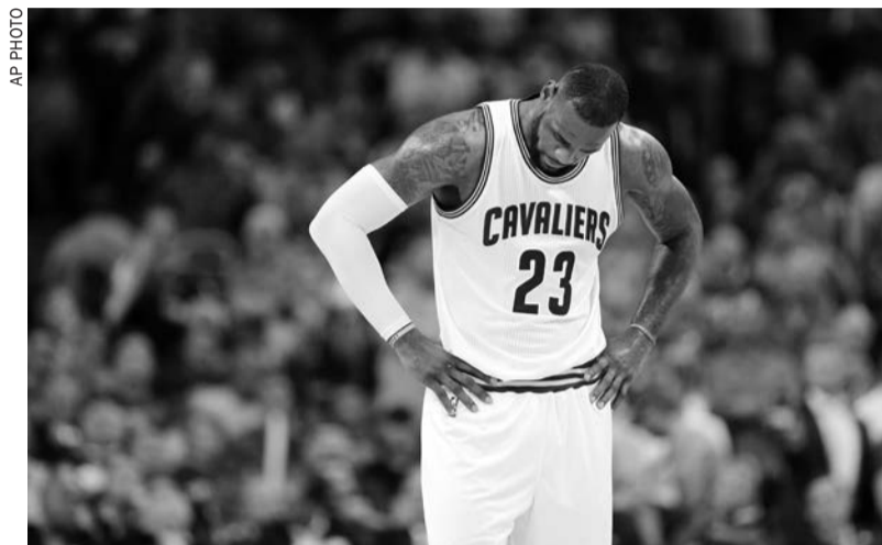
Cleveland Cavaliers forward LeBron James (23) hangs his head during the second half of Game 6 of basketball's NBA Finals against the Golden State Warriors

James believed he could will Cleveland to a championship, with a confidence that turned almost defiance. Even as the Golden State Warriors had asserted themselves as the series went on, James said he didn't doubt the Cavaliers could win