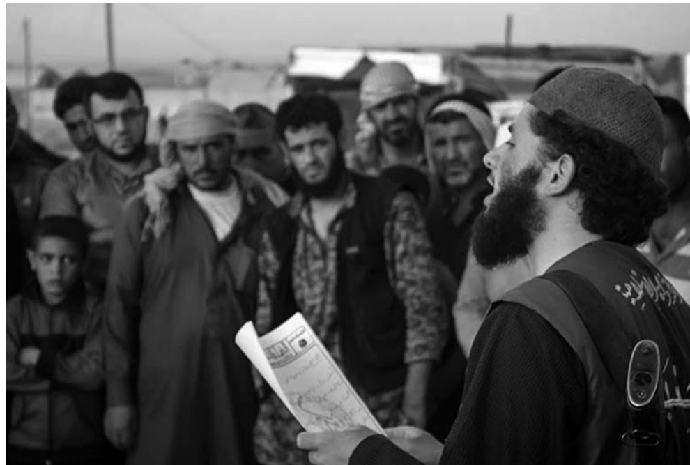
A member of the Islamic State group's vice police known as “Hisba,” right, reads a verdict handed down by an Islamic court sentencing many they accused of adultery to lashing