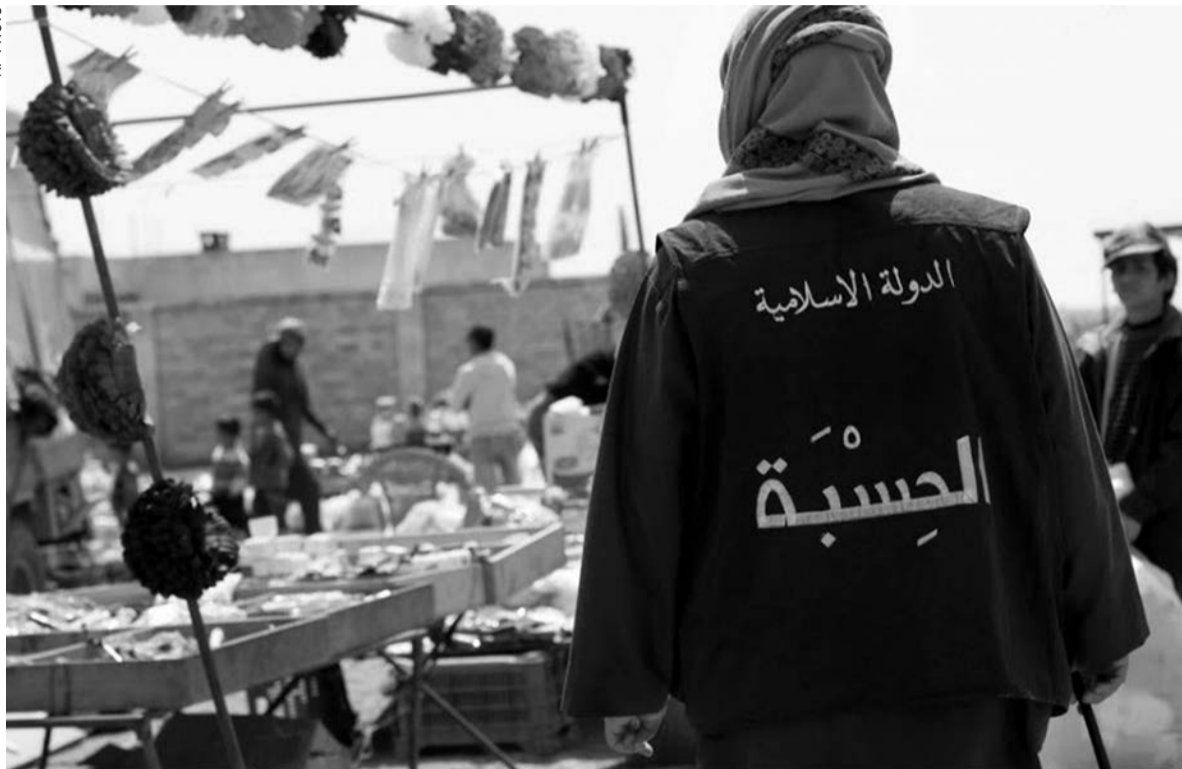
In this photo released on April 17 by a militant website, a member of the Islamic State group's vice police known as “Hisba,” patrols a market in Raqqa City, Syria