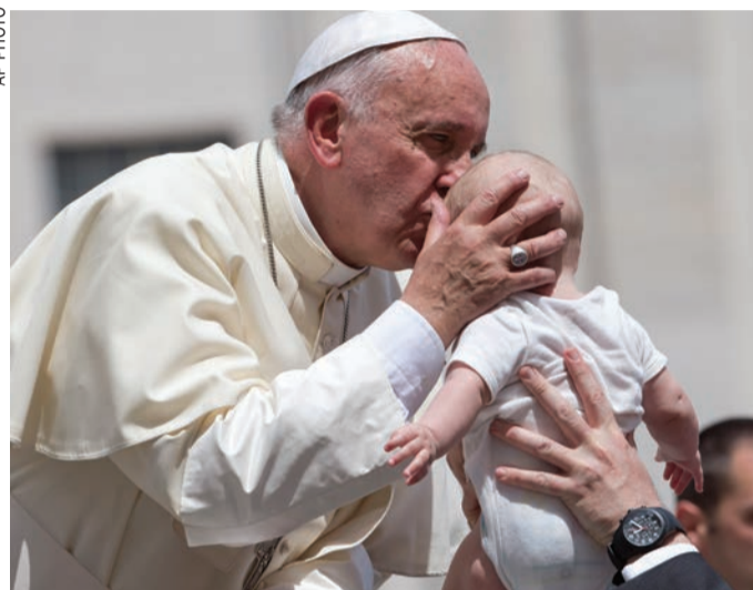
Pope Francis kisses a baby as he leaves at the end of his weekly general audience, in St. Peter's Square at the Vatican