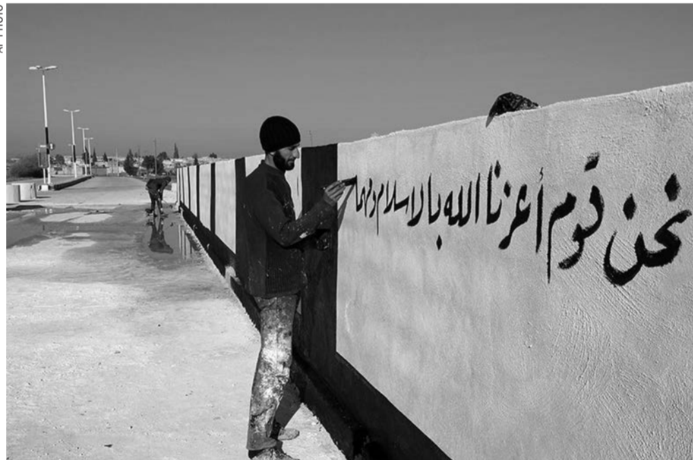
A member of the Islamic State group writes in Arabic, “we are a people whom God has honored with Islam,” on a newly painted wall