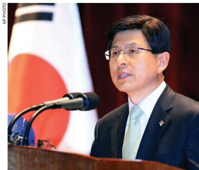
South Korea's new Prime Minister Hwang Kyo-ahn speaks during his inauguration ceremony at the government complex building in Gwacheon

South Korea's executive power is concentrated in the president, but the prime minister leads the country if the president becomes incapacitated.