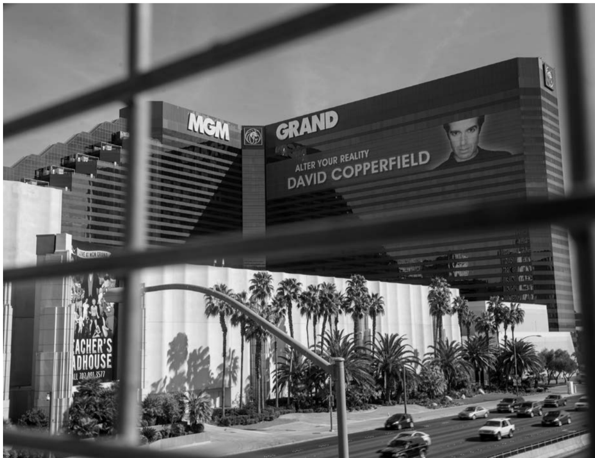
The MGM Resorts International Grand Hotel & Casino stands in Las Vegas, Nevada, U.S.

"I have some eye problems from when I was a pilot,"