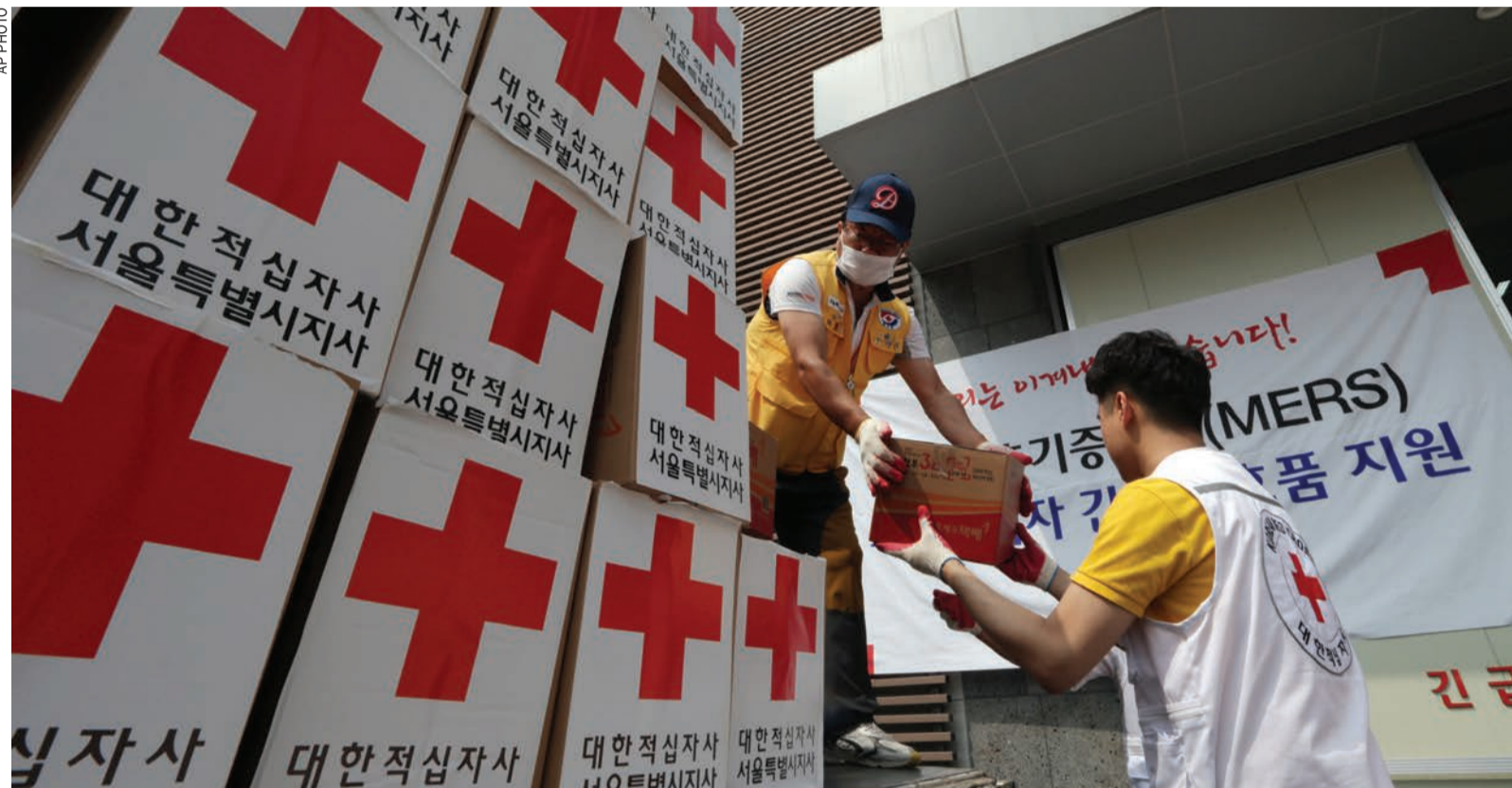
Members of the South Korean Red Cross unload relief items from a truck for people who are suspected of infection and isolated at their homes after having close contact with MERS patients, at the Red Cross Emergency Relief Operation Center in Seoul

Chan said South Korea's initial sluggish reaction might have contributed to the wider-than-expected spread of a virus that usually moves poorly between people. South Korean officials early on struggled to trace and identify the contacts of those infected, and their initial refusal to name the hospitals where MERS patients