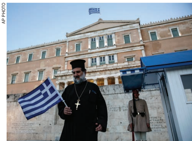
A Greek Orthodox priest holding a national flag walks in front of a Presidential guard during an anti-austerity rally in front of the parliament in Athens