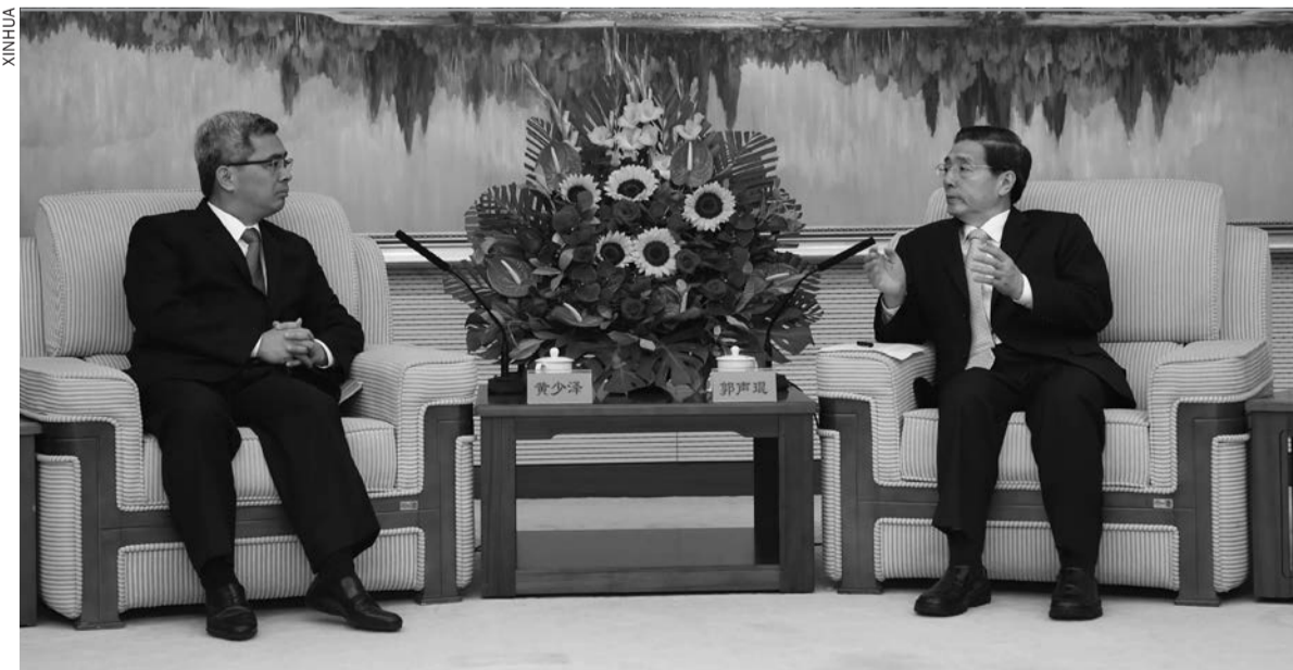
Chinese State Councilor and Minister of Public Security Guo Shengkun (r) met yesterday with Macau's Secretary for Security Wong Sio Chak in Beijing