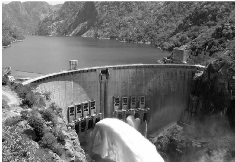
Cahora Bassa Hydroelectric Dam

EDP has said that Mozambique "is a strategic market" that "can be an important vector of internationalization" for the company, which "will contribute to the strategic development of the