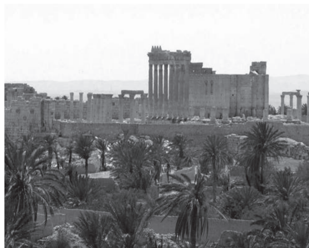
General view of the ancient Roman city of Palmyra, northeast of Damascus, Syria