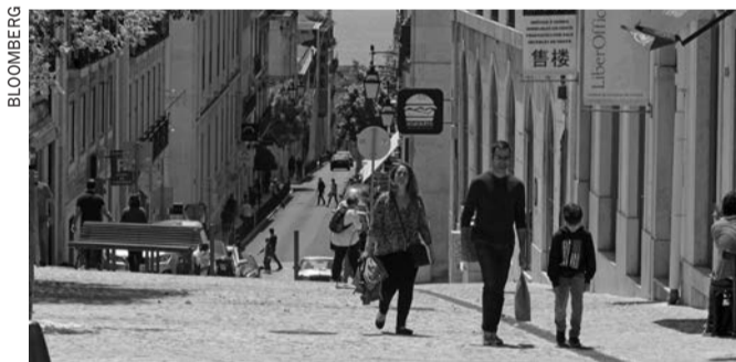
Pedestrians walk along Rua Serpa Pinto street in the Chiado district of Lisbon, Portugal

The data requested by the newspaper from the National Statistics Institute (INE) showed that last year 5,256 businesses were entirely dependent on Angola for their sales