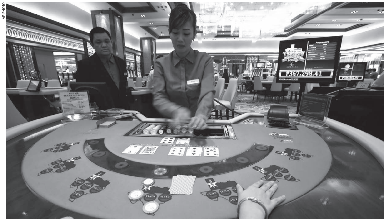
Casino dealers work on their respective games during the media tour of the Solaire Casino

Bloomberry added 0.8 percent to 9.08 pesos at the close of trade in Manila, paring a gain of as much as 2 percent, while Travellers was unchanged. Melco advanced as much as 3.8 percent before closing unchan-