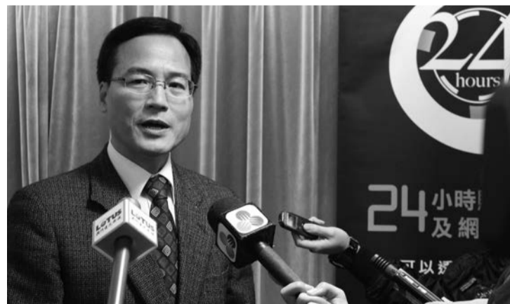
Iong Kong Io

T HE group that is working on proposals to amend the anti-drug trafficking law has advocated for heavier penalties to be imposed on people found to have committed drug offenses. A report made by the group was presented yesterday, stating that the current penalties fail to have a deterrent effect. According to the document, the group believes that drug consumers, who currently can be sentenced to between 45 and 60 days in prison, should be sentenced to penalties that vary between three and six months.