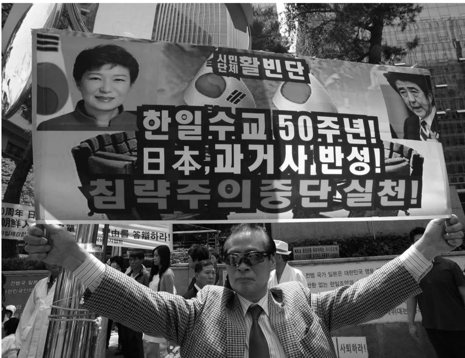
A South Korean protester holds up a banner with images of South Korean President Park Geun-hye, left, and Japanese Prime Minister Shinzo Abe in front of Japanese Embassy during a rally marking the 50th anniversary of the normalization between the two countries, in Seoul