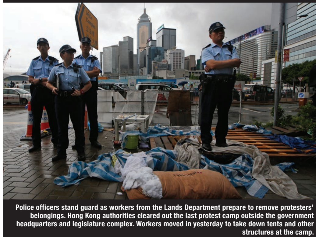
Police officers stand guard as workers from the Lands Department prepare to remove protesters' belongings. Hong Kong authorities cleared out the last protest camp outside the government headquarters and legislature complex. Workers moved in yesterday to take down tents and other structures at the camp.