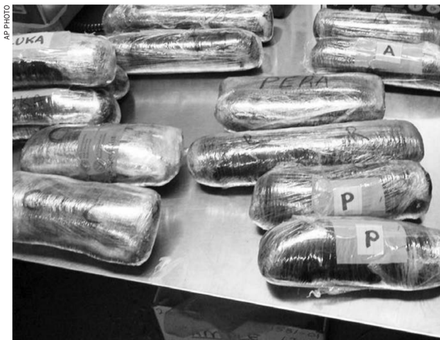
Packages of methamphetamine and heroin

SOUTHEAST Asia's lawless 'Golden Triangle' region remains the overwhelming source of the heroin and methamphetamine sold in China, the country's Cabinet said in a report issued yesterday.