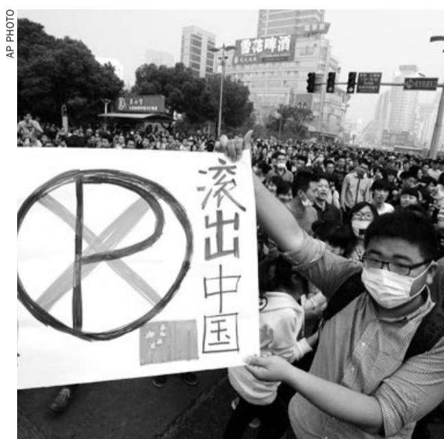
Protesters march in Ningbo city in Zhejiang province, demonstrating against the proposed expansion of a petrochemical factory

The government held a public session earlier yesterday at which officials assured residents that the planned chemical zone would be properly managed. It also urged the public not to assemble illegally and not to believe in rumors or spread them.