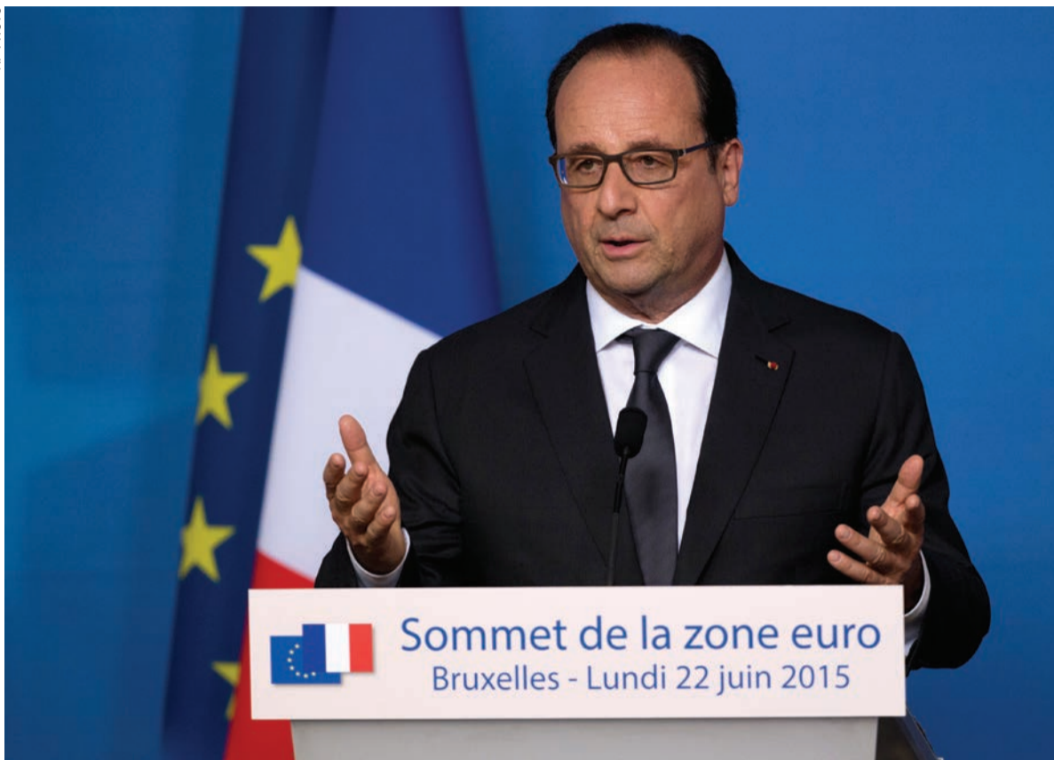
In this June 22 file photo, French President Francois Hollande speaks during a media conference at an EU summit in Brussels