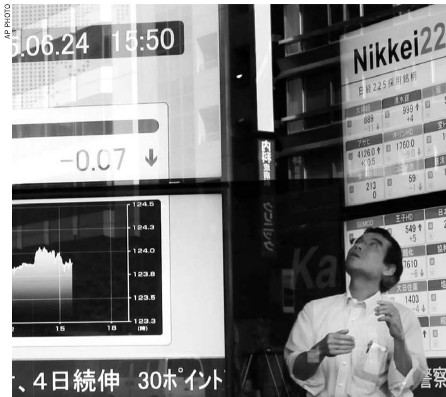
A worker looks up to check an electronic stock indicator of a securities firm showing Tokyo's Nikkei 225 prices in Tokyo

The chances are about 50-50 that the U.S. economy will improve