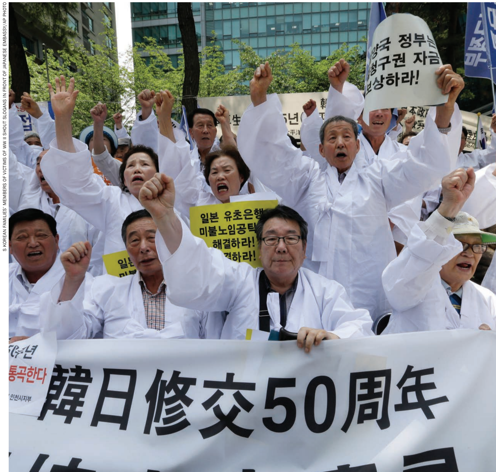
S. KOREAN FAMILIES: MEMBERS OF VICTIMS OF WW II SHOUT SLOGANS IN FRONT OF JAPANESE EMBASSY