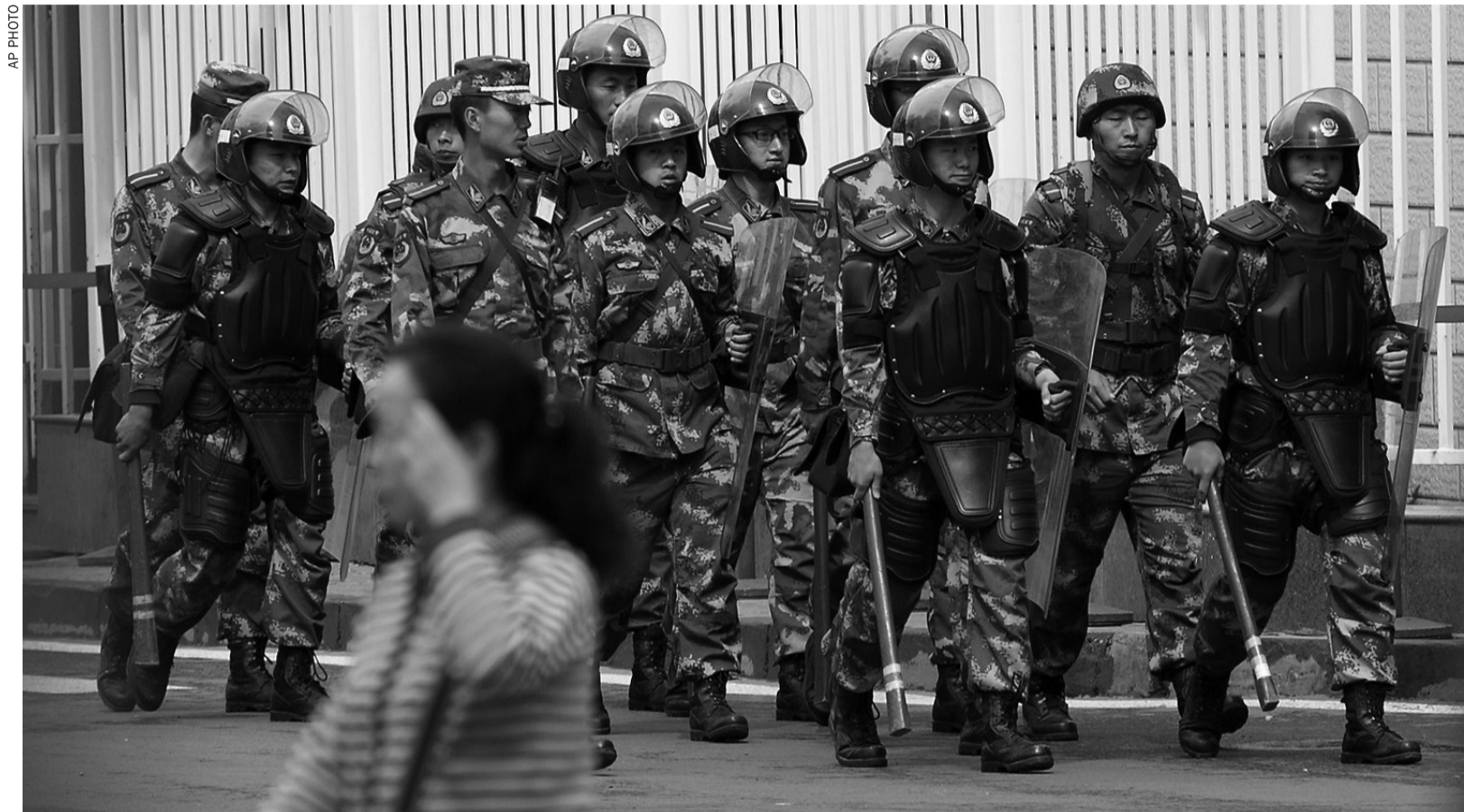
Paramilitary policemen with shields and batons patrol near the People's Square in Urumqi, Xinjiang region

The violence is the latest in a series of attacks in the region and elsewhere in the country blamed by Chinese authorities on Uighur separatists. President Xi Jinping has overseen a nationwide crackdown against alleged Uighur terrorists, that led to several shootouts, mass