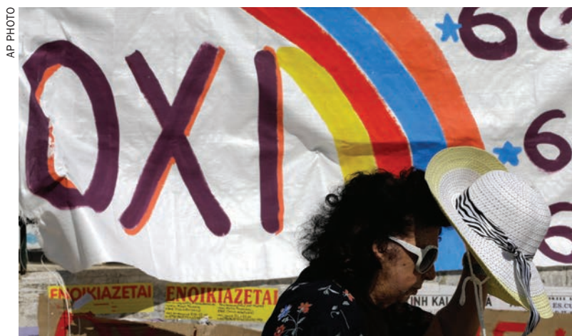
An elderly woman covers her head from the sun as she passes a banner that reads "NO", hung up by supporters of the NO vote in the upcoming referendum in Athens

There was speculation yesterday that a last-minute deal might be possible, with reports that Prime Minister Alexis Tsipras was to undertake an initiative based on a last-minute offer by European Commission President