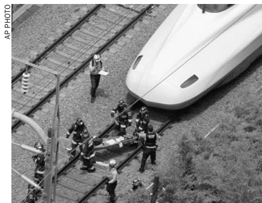
A passenger is carried out of the bullet train, right, which made an emergency stop in Odawara, west of Tokyo

The man then started dumping the liquid on the floor, and the businessman quickly left as he smelled gasoline, he said.