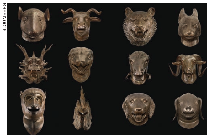
Ai Weiwei's "Circle of Animals/Zodiac Heads" depicts the signs of the ancient Chinese zodiac

The 50-lot sale's tally exceeded the low estimate of 17.2 million pounds and was an 84 percent increase from Phillips'