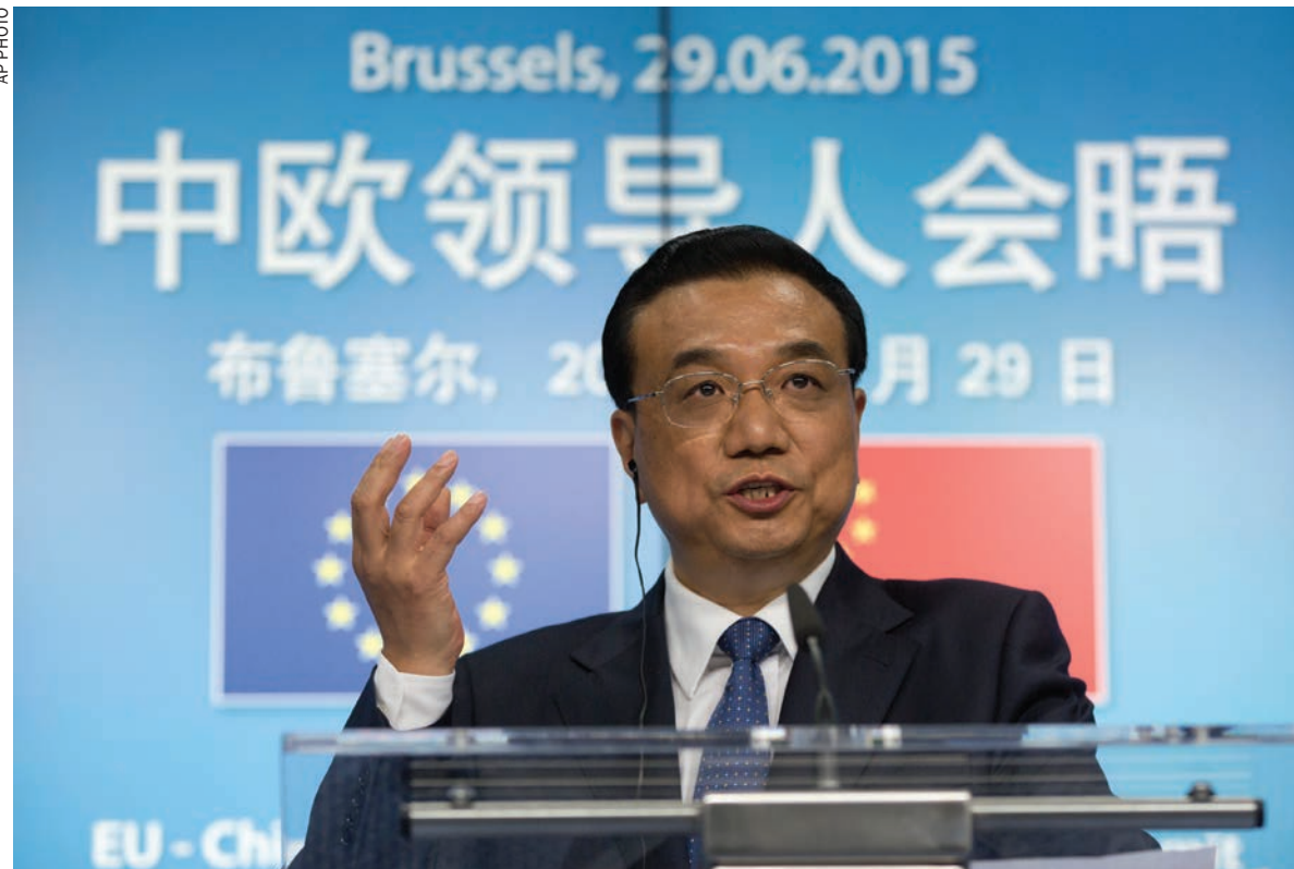
China's Premier Li Keqiang speaks during a media conference during an EU-China Summit at the European Council building in Brussels

2014 for 14 percent of its total trade in goods outside the EU, compared to 9 percent in 2004.