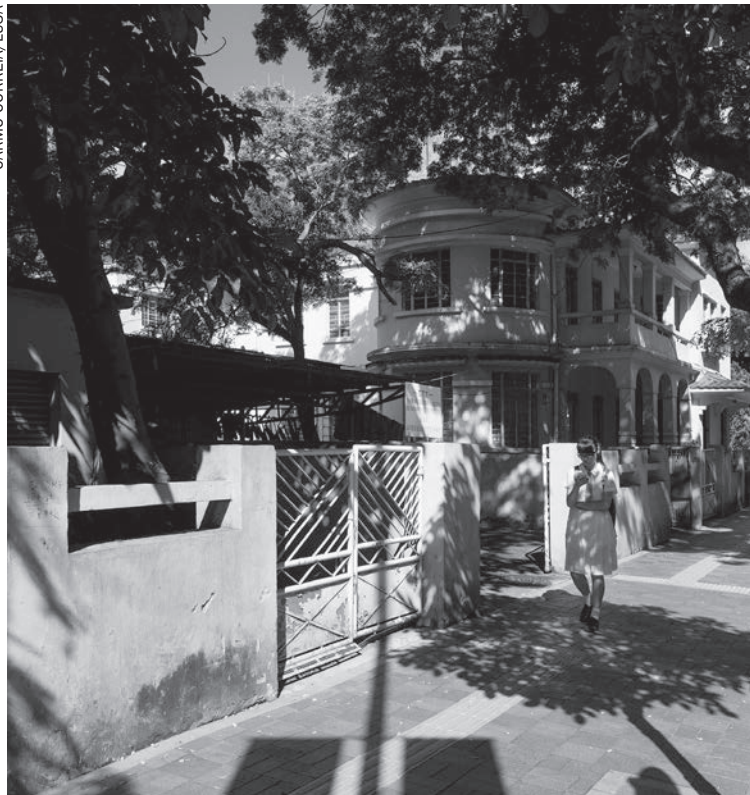
Coronel Mesquita buildings

IT has been ten years since Macau's historic center was listed as a World Heritage site by UNESCO, but some experts claim that buildings with cultural value continue to be neglected, particularly those of Portuguese style.