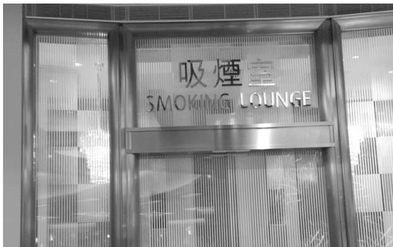
A casino smoking lounge

Casino operators are already bracing for the worst results in