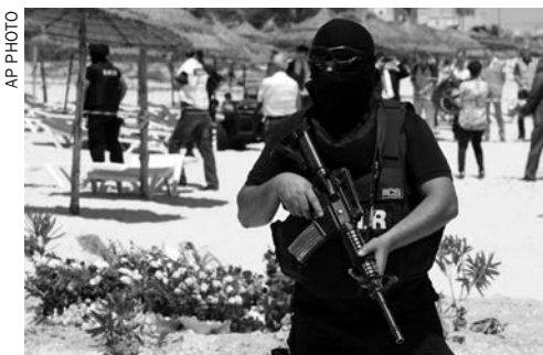
A hooded Tunisian police officer stands guard at the scene of Friday’s shooting attack in front of the Imperial Marhaba hotel in the Mediterranean resort of Sousse

“It is not a perfect system — it is true we were surprised by this affair,” he said.