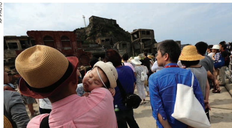
Tourists visit a part of Hashima Island, commonly known as Gunkanjima, which means "battleship island," off Nagasaki

Japan's bid for UNESCO recognition is confined to the 1968-1912 era of the Meiji Emperor, who presided over the country's rush to industrialize and catch up with Western colonial powers. It