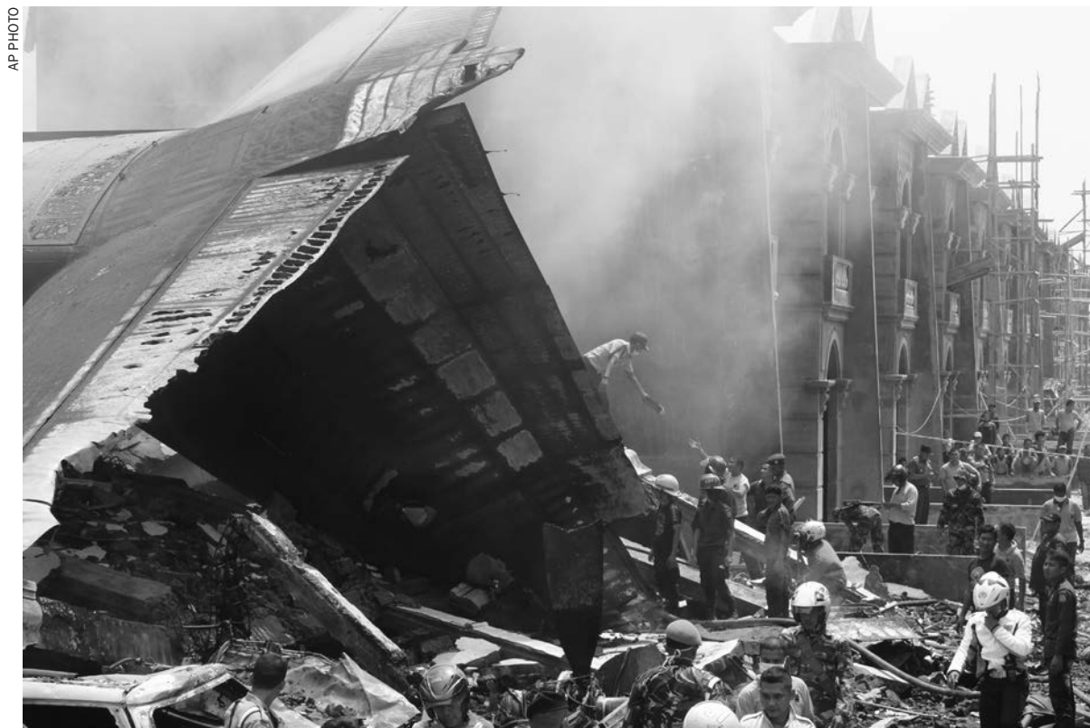
Indonesian military personnel search for victims at the site where an air force cargo plane crashed in Medan, North Sumatra

The plane's manifest showed there were 50 people on the flight from Medan to the remote Natuna island chain, according to Nor-