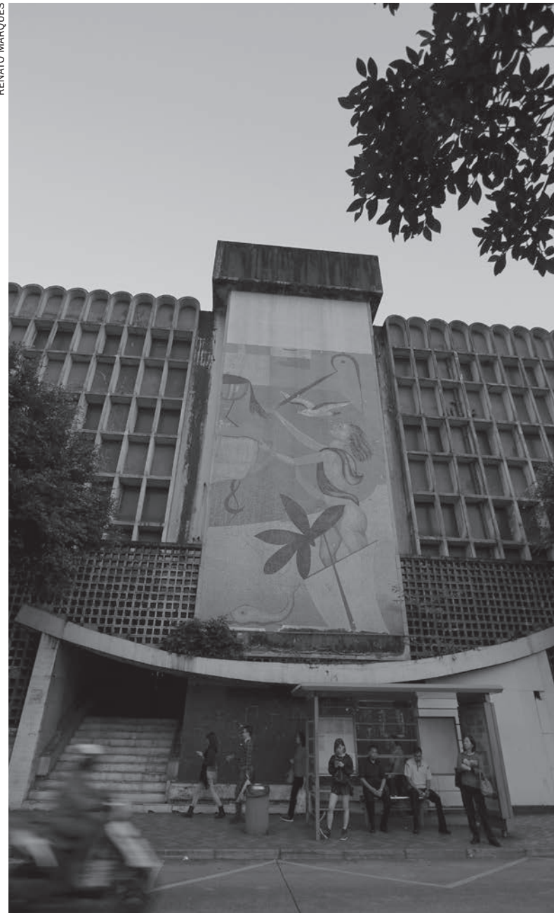
The decrepit Hotel Estoril

Amongst a wide range of functions suggested for the future multi-activity complex, the government has