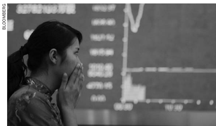
A Chinese worker looks at quotes at the Stock Exchange in Shanghai

Speculation is growing that policy makers are preparing stock-boosting measures after the Shanghai Composite plunged more than 20 percent from a June 12 peak amid surging valuations and concern record