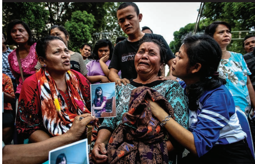
A relative of a victim mourns at a hospital after the crash of an Indonesian Hercules C-130 military plane in Medan, the capital of North Sumatra province, Indonesia (see full report on page 12).