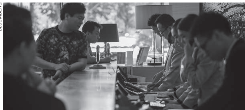
Guests are served at a check-in counter in the lobby of the MGM Macau casino resort

VISITORS on package tours totaled 823,000 in May, down by 2.2 percent year-on-year. Information from the Statistics and Census Service (DSEC) indicated that package tour visitors from mainland China (653,000), Taiwan (48,000) and Hong Kong (23,000) dropped by 2 percent, 17 percent and 12.1 percent respectively year-on-year, while those from the Republic of Korea (39,000) surged by 46.2 percent.