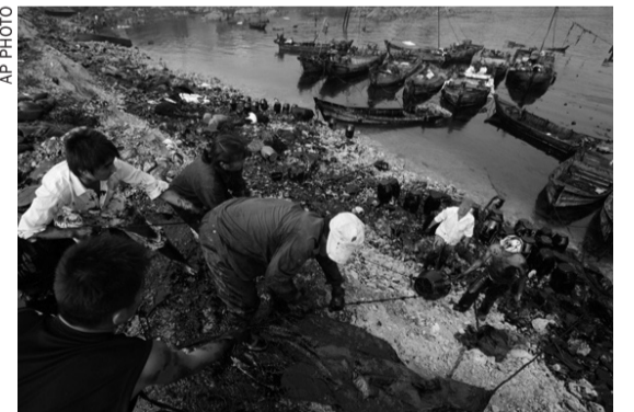
Local fishermen work to clean up oil following an explosion in Xingang port, Dalian, northeastern China

In 2012, ConocoPhillips and CNOOC reached a USD160 million agreement with the Ministry of Agriculture to settle compensation claims related to the spill. ConocoPhillips also said it would help pay for social projects in Bohai Bay and reduce pollutants in the bay.