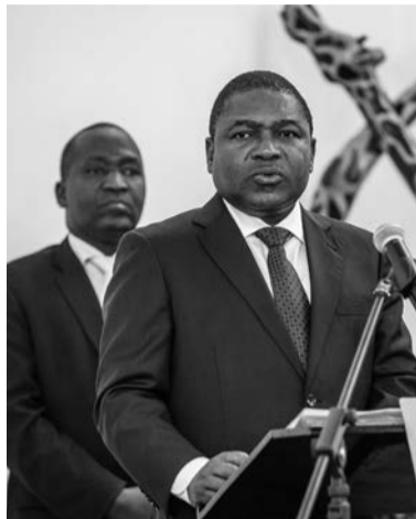
Mozambique's President Filipe Nyusi

Construction of the northern plant of the Cahora Bassa hydroelectric facility is scheduled to