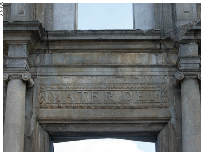
The St. Paul's Church façade, built in 1602-1640, is one of the elements analyzed in the documentary to be aired by National Geographic