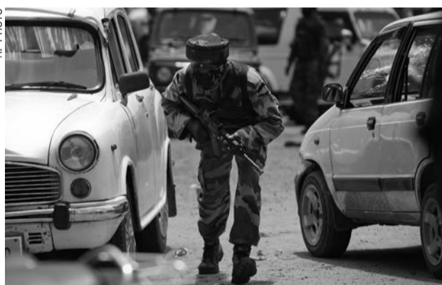
An Indian army soldier takes position during a fight in the town of Dinanagar, in the northern state of Punjab