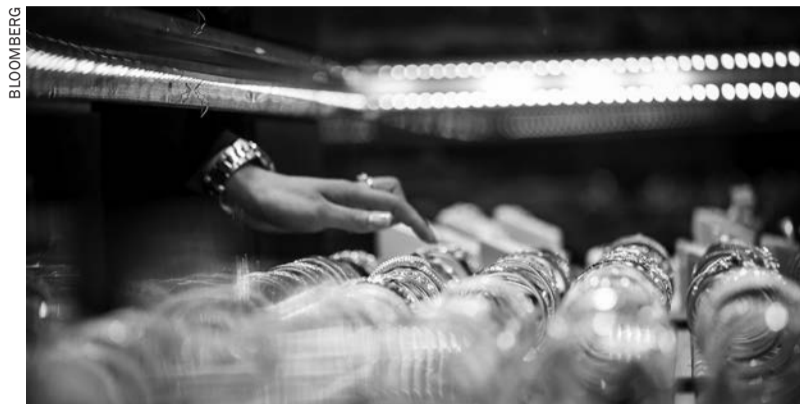
An employee touches gold bangles as they sit in display inside a Chow Tai Fook Jewellery Group Ltd. jewelry store in the Central district of Hong Kong

ry chain's sister company Chow Tai Took Enterprises Ltd. and with property developer Far East Consortium International Ltd. to build the 1,100-room hotel and casino that will open on the shores of the Brisbane river in 2022.