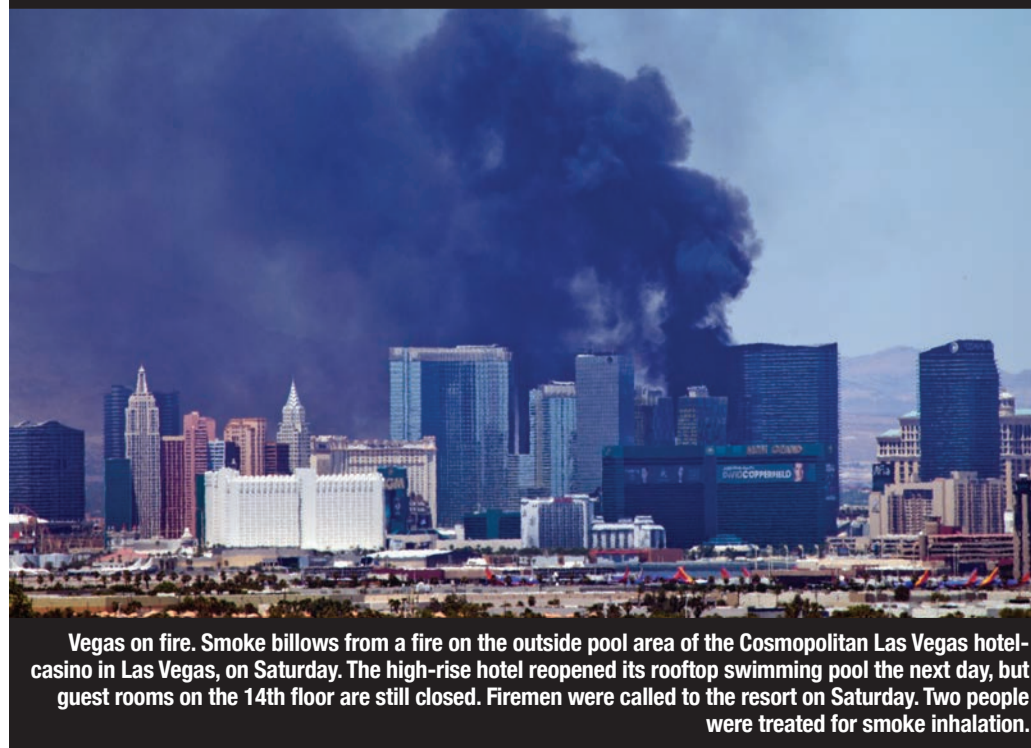
Vegas on fire. Smoke billows from a fire on the outside pool area of the Cosmopolitan Las Vegas hotel-casino in Las Vegas, on Saturday. The high-rise hotel reopened its rooftop swimming pool the next day, but guest rooms on the 14th floor are still closed. Firemen were called to the resort on Saturday. Two people were treated for smoke inhalation.