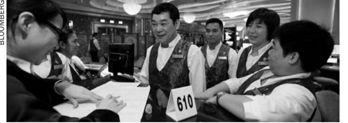
Card dealers receive their table assignments. The gaming sector is by far the largest employer in Macau

T HE unemployment rate for April-June 2015 remained stable at 1.8 percent as in the previous period (March-May 2015), according to the Statistics and Census Service (DSEC). The underemployment rate was recorded at 0.4 percent, up by 0.1 percentage point.