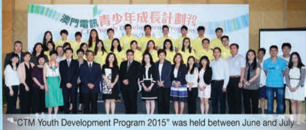
"CTM Youth Development Program 2015" was held between June and July.

"CTM Youth Development Program 2015" was held between June and July. 23 students were divided into four teams and participated in various activities, including work experience in CTM retail shops and customer service management, visit the Macau International Airport and Galaxy Macau™, and involving in volunteer activities. Through a series of activities, students have improved their communications skill and gained an insight of corporate operation.