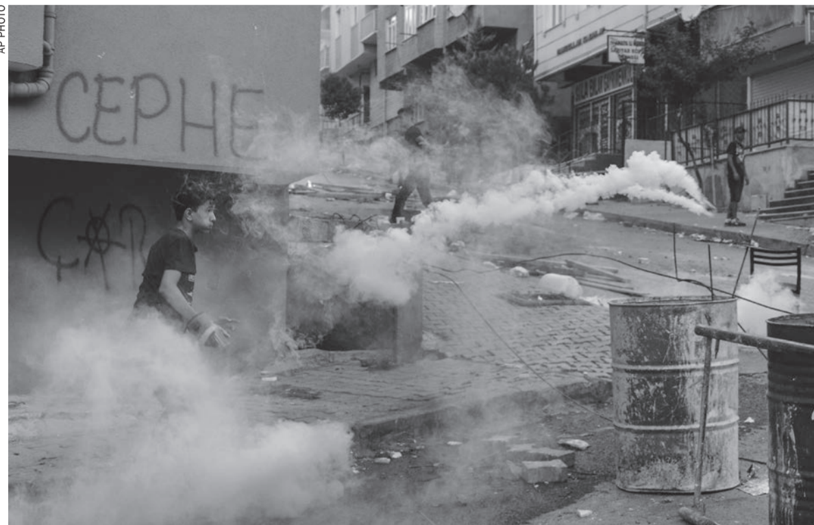
Left-wing protesters try to avoid tear gas and water used by police to disperse them, in Istanbul

A Turkish official said Turkish forces are only targeting the IS