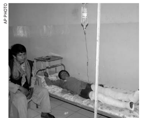
An Afghan wounded teenager lies on a bed in a hospital in Puli Khumri, capital city of Baghlan province, north of Kabul