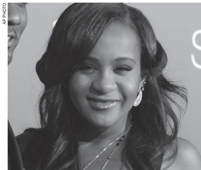
Bobbi Kristina Brown

She identified herself on Twitter as "Daughter of Queen WH," "Entertainer/Actress" with William Morris & Co., and "LAST of a dying breed." She told Oprah Winfrey shortly after her mother's death in 2012