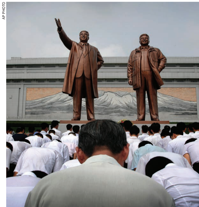
North Koreans bow in front of bronze statues of the late leaders Kim Il Sung and Kim Jong Il at Munsu Hill in Pyongyang

The anniversary is hailed in North Korea as a victory over the U.S., which fought with the South Koreans and U.N. allies against the North's forces,