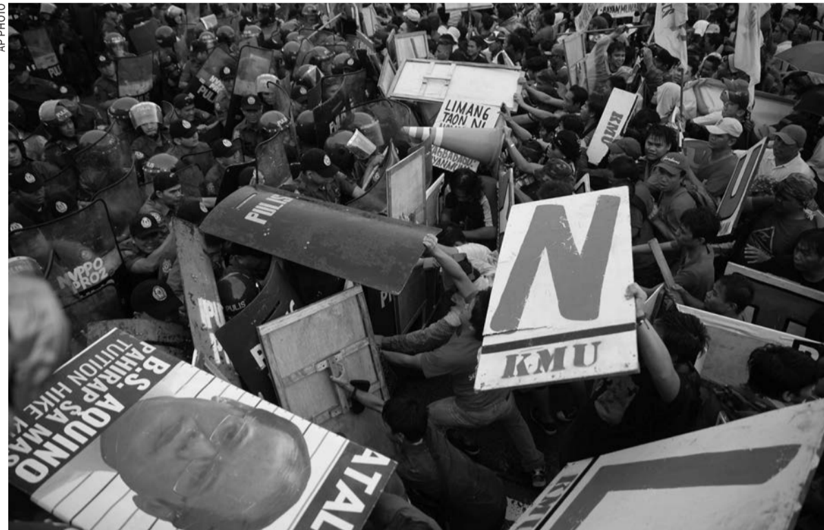
Protesters clash with police as they try to make their way to the House of Representatives ahead of the State of the Nation Address by Philippine President Benigno Aquino III, pictured on a poster, in suburban Quezon city, northeast of Manila

try where about a fourth of its 100 million people remain mired in long-entrenched poverty. Communist and Muslim insurgencies that have raged on and off for more than four decades have combined with natural disasters in the typhoon-prone archipelago and law and order problems to turn governance into a tough and complex dilemma.