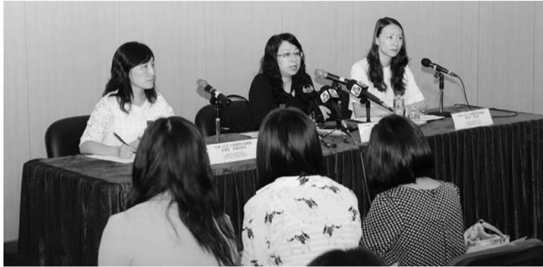
Officials of the Social Welfare Bureau hold a press conference on the experimental babysitting scheme