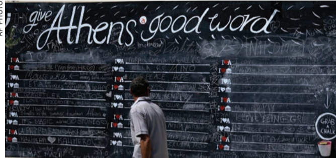
A pedestrian looks at a board where people can write their comments about the Greek capital, displayed on a wall in Athens

Worries that the discussions over Greece's bailout are dragging out have weighed on stock markets across Europe yesterday. The Stoxx 50 index of leading European shares was