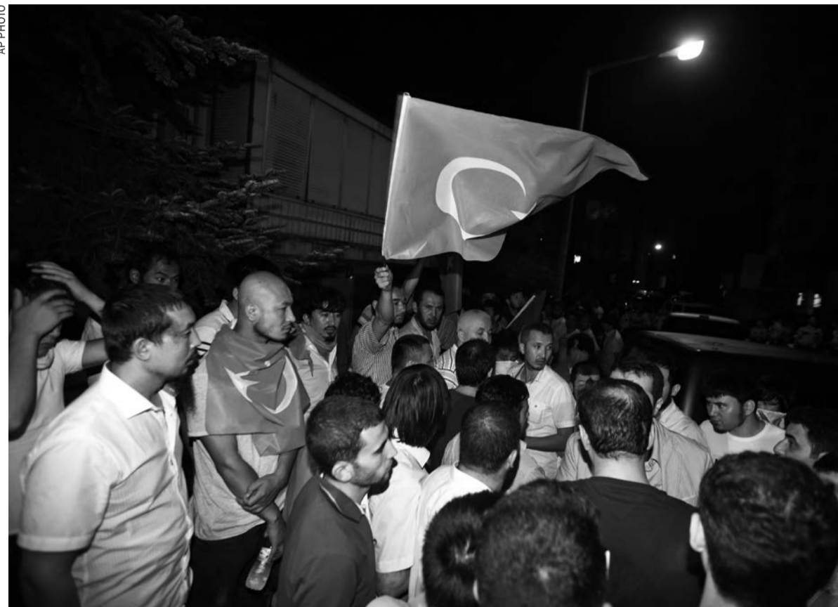
Uighurs living in Turkey and Turkish supporters, some carrying flags of East Turkestan, the term separatist Uighurs and Turks use to refer to the Uighurs homeland in China's Xinjiang region, gather outside the Thai consulate in Istanbul, early Thursday, July 9

based its report on what it said were interviews with some of the group conducted by the