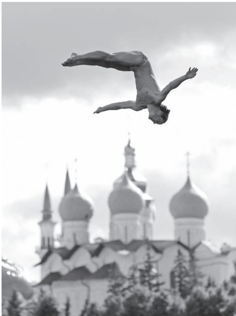
Gary Hunt of Great Britain competes in the Men's 27m High Diving final of the FINA Swimming World Championships 2015 at Kazanska River in Kazan, Russia

Jonathan Paredes of Mexico, who won bronze in 2013, was second on 596.45, while Artyom Silchenko of Russia pleased the home crowd on the