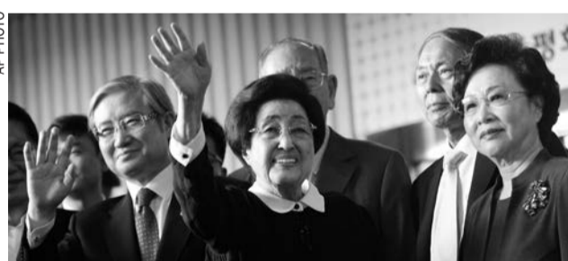
Lee Hee-ho, center, the wife of late former South Korean President Kim Dae-jung, waves as she arrives at Gimpo Airport in Seoul, to leave for North Korea

some South Koreans that Lee Hee-ho's trip could help ease the tensions.