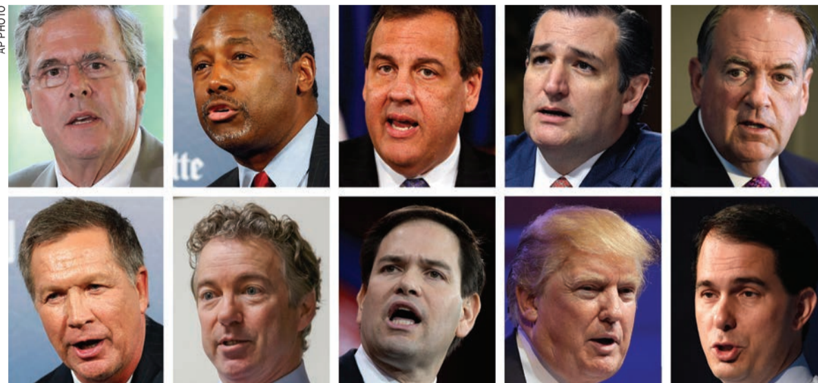
This combination of photos, from top left, shows Republican presidential candidates Jeb Bush, Ben Carson, Chris Christie, Ted Cruz, Mike Huckabee and from bottom left, John Kasich, Rand Paul, Marco Rubio, Donald Trump and Scott Walker

Beyond Trump, those selected among the top 10 — based on recent national polls — include Bush, Wisconsin Gov. Scott Walker, Texas Sen. Ted Cruz, Kentucky Sen. Rand Paul, Flo-