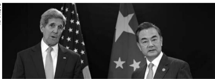
China's Foreign Minister Wang Yi, right, listens while U.S. Secretary of State John Kerry talks before a bilateral meeting at the Putra World Trade Center in Kuala Lumpur

China rejects any U.S. involvement and insists it has the right to continue the recla-