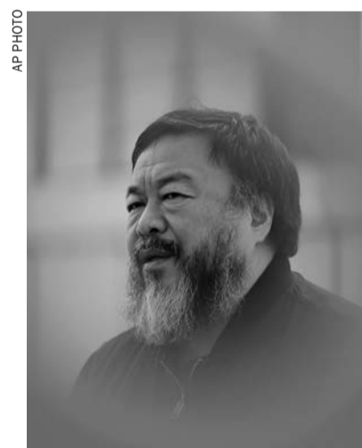
Chinese dissident artist Ai Weiwei

campaign by President Xi Jinping is creating "enormous tension," with authorities keen not to lose control and intervening at the smallest sign of unrest, the Sueddeutsche Zeitung reported. But he added that "this campaign was really necessary."