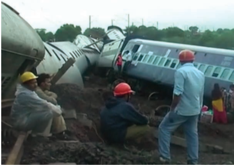
In this image made from video, people gather by two derailed trains in Harda in Madhya Pradesh state

coaches from the Janata Express derailed just before midnight. Although rescue workers soon reached the site, they were slowed by darkness.