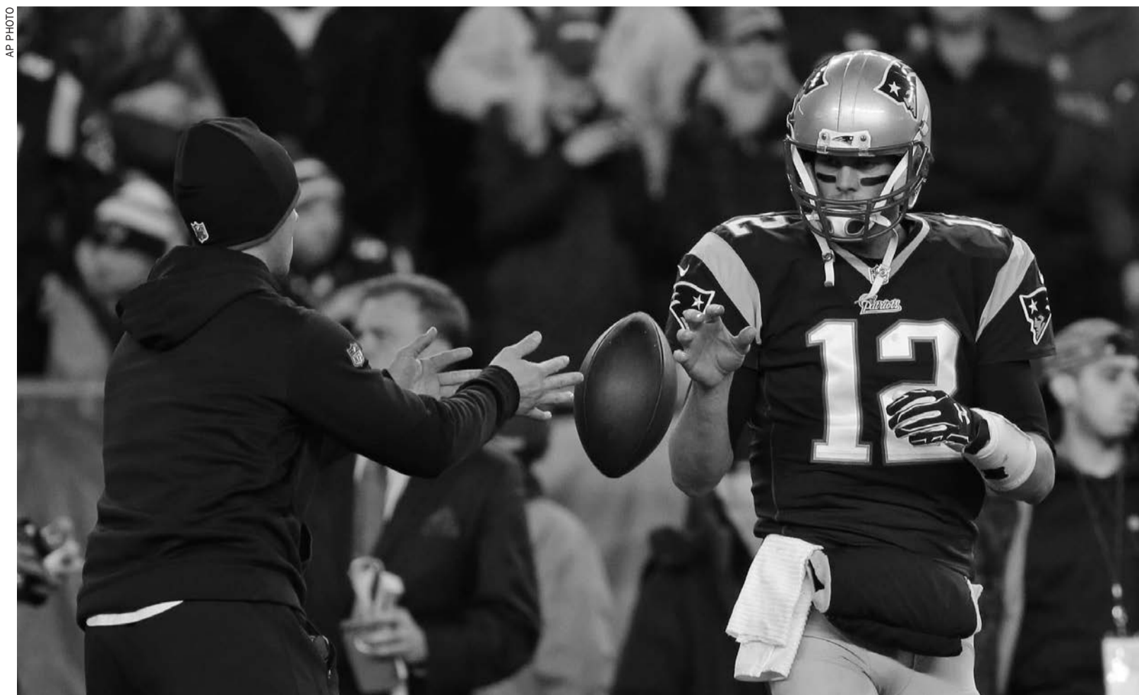
New England Patriots quarterback Tom Brady has a ball tossed to him during warm-ups before the NFL football AFC Championship game against the Indianapolis Colts