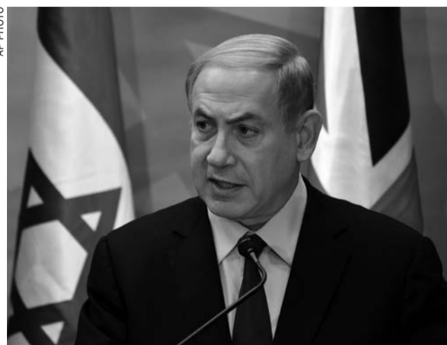
Israeli Prime Minister Benjamin Netanyahu

The back-to-back sales pitches from the leaders came on the eve of a foreign policy address Obama was to deliver as he