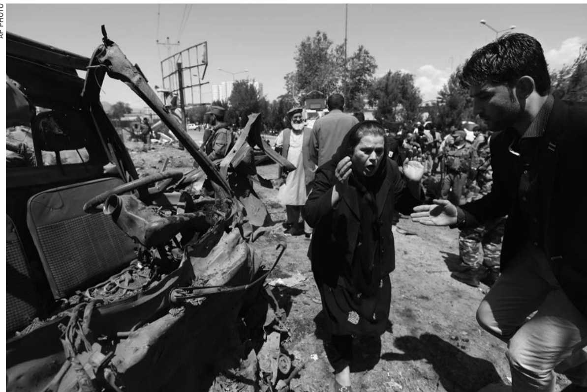
In this Tuesday, June 30, 2015 file photo, an Afghan woman cries out at the site of a suicide attack on a NATO convoy in Kabul

Afghanistan's security forces have been fighting the Taliban alone since the withdrawal of U.S. and international combat troops last year. The Taliban have sought to take advantage by escalating their attacks,