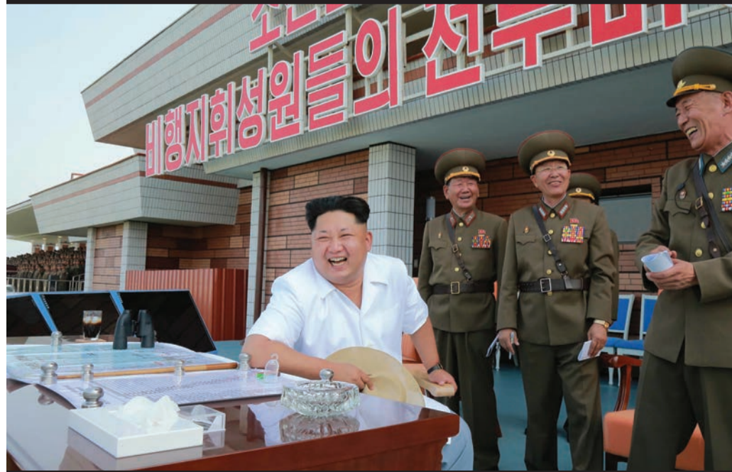
North Korea's leader Kim Jong Un (1st left) attends the "2015 combat aeronautics contest of air commanding officers of the Air and Anti-Air Force of the Korean People's Army (KPA)".