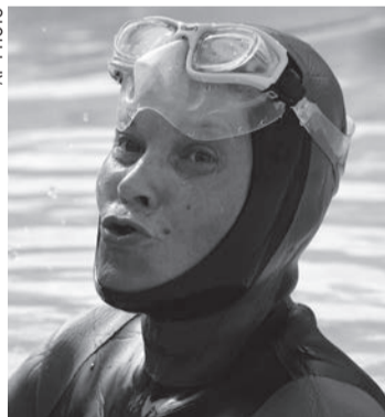
In this Friday, Aug. 26, 2005 file photo, Natalia Molchanova of Russia reacts after she set a new world record, holding her breath underwater for 7 minutes and 16 seconds

Spain's rescue services called off their underwater search for missing free-diving great Natalia Molchanova yesterday after spending more than two days looking for her off the Balearic Islands.