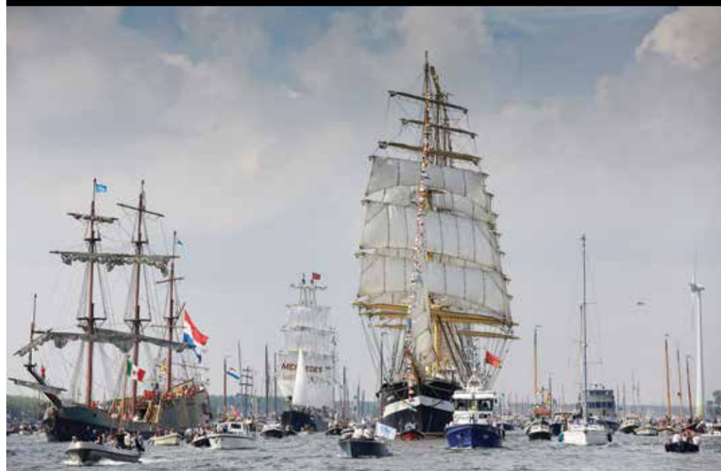
Russian tall ship the Kruzenshtern, center right, arrives in Amsterdam, yesterday, to participate in SAIL Amsterdam 2015, a five-yearly festival celebrating the Dutch capital's maritime history.