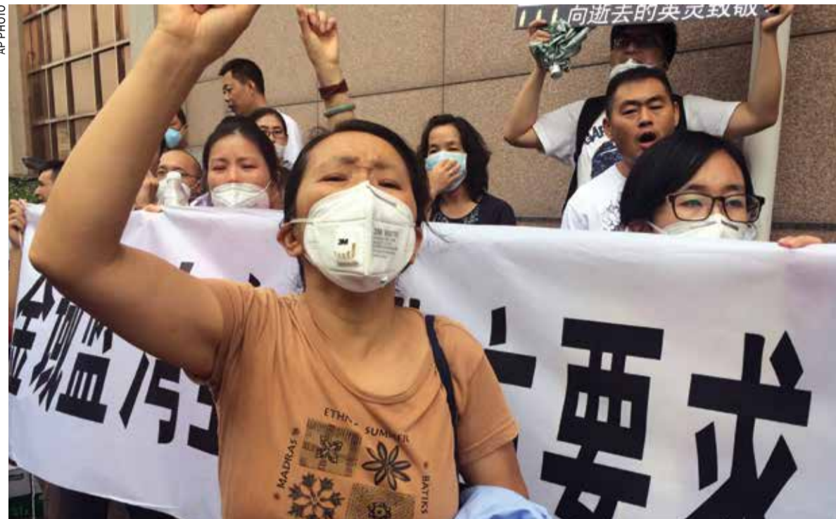
Residents demand compensation for damages to their homes after the explosion at the Tianjin port

Owners of damaged residences continued their daily protests yesterday demanding the government buy back apartments.