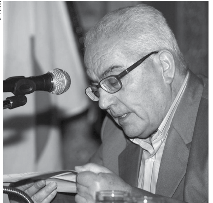
Prominent Syrian antiquities scholar Khaled al-Asaad

Al-Asaad, who held a diploma in history and education from the University of Damascus, wrote many books and scientific texts either individually or in cooperation with other Syrian or foreign archeologists, SANA said. Among his titles are "The Palmyra sculptures," and "Zenobia, the Queen of Palmyra and the Orient."