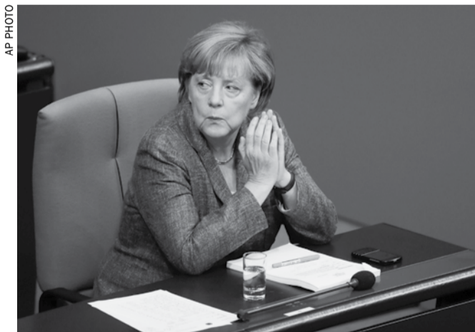
German Chancellor Angela Merkel attends a debate at the German parliament prior to a vote on another bailout package for Greece, in the German Bundestag in Berlin

rence yesterday night to discuss the matter.