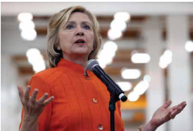
Democratic presidential candidate Hillary Rodham Clinton speaks while touring the Carpenters International Training Center yesterday, in Las Vegas

H ILLARY Rodham Clinton is opposing President Barack Obama's authorization for oil drilling in the Alaska Arctic and his delays on the Keystone XL pipeline, in some of the clearest signs of the Democratic front-runner distancing herself from the president.