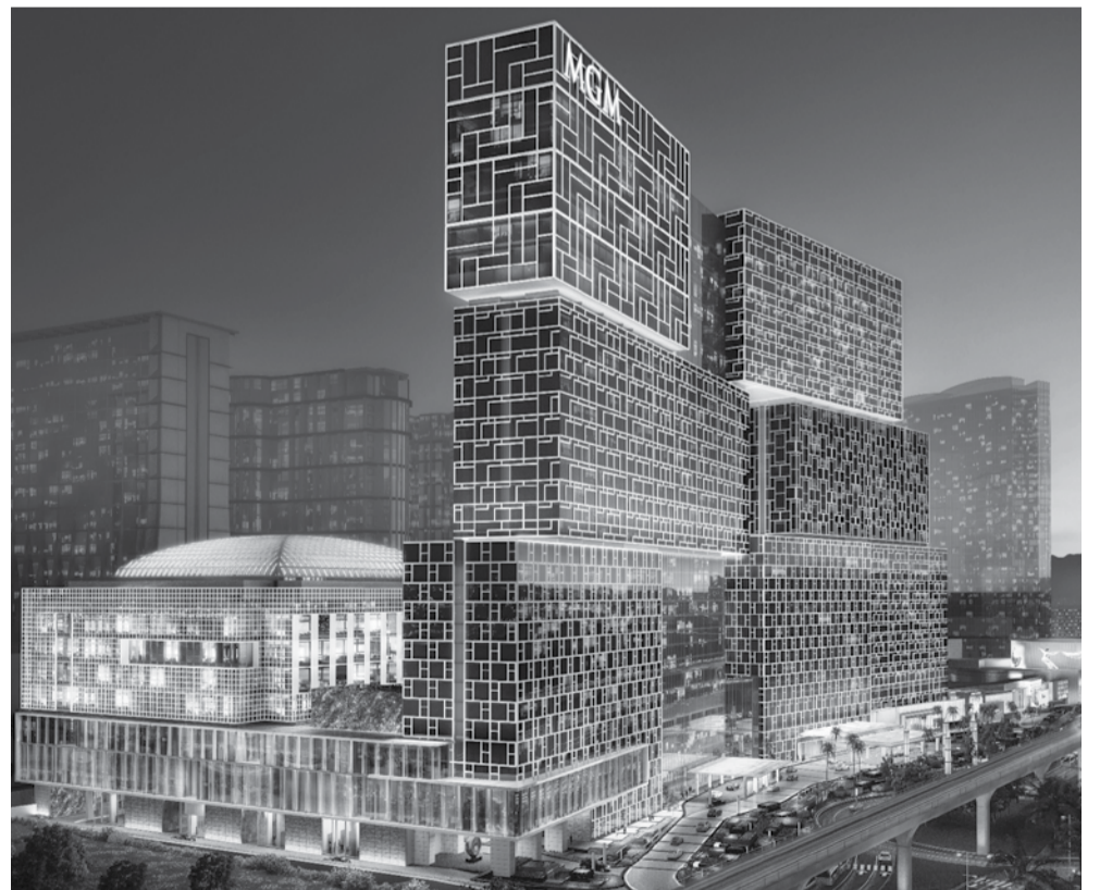
An artist's rendition of MGM Cotai

"There is no point in not being positive and looking to the future," he said, adding that the group's initial target of 500 gaming tables might come true. Staff reporter