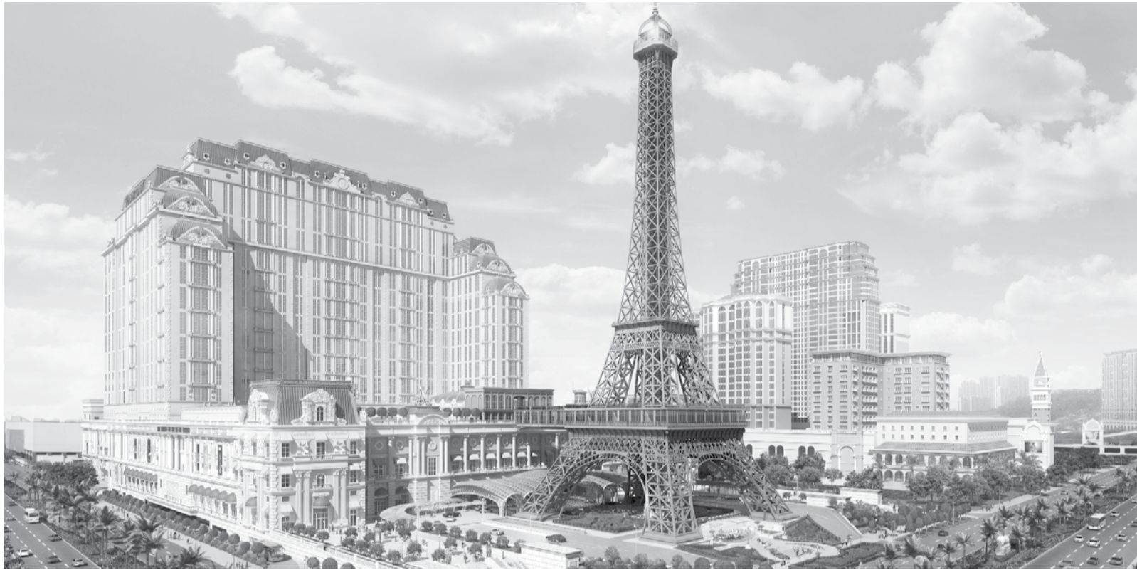
An artist's rendition of the Parisian