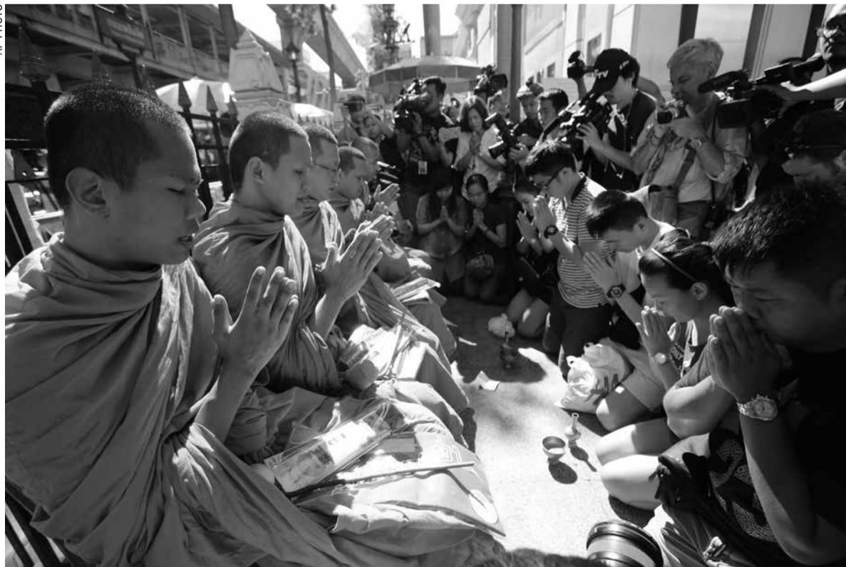
Buddhist monks hold a prayer at the Erawan Shrine at Rajprasong intersection in Bangkok

Bangkok has seen politically charged violence in the past decade; the deadliest, in 2010, killed more than 90 over two months and was centered on the same intersection where Monday's bomb went off. But none of those attacks included a bomb that seemed intended to produce mass casualties.