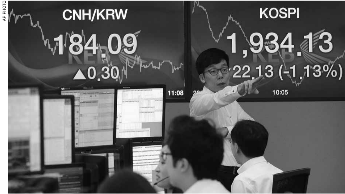
A currency trader gestures at the foreign exchange dealing room of the Korea Exchange Bank headquarters in Seoul, South Korea