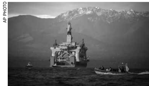
A small boat crosses in front of the Transocean Polar Pioneer, a semi-submersible drilling unit that Royal Dutch Shell leases from Transocean Ltd., as it arrives in Port Angeles, Wash.

A March 18 sale in the far more popular central Gulf of Mexico brought the lowest number of bids since 1986. Officials said low oil prices were the reason. Since then, the price of U.S. crude has dropped