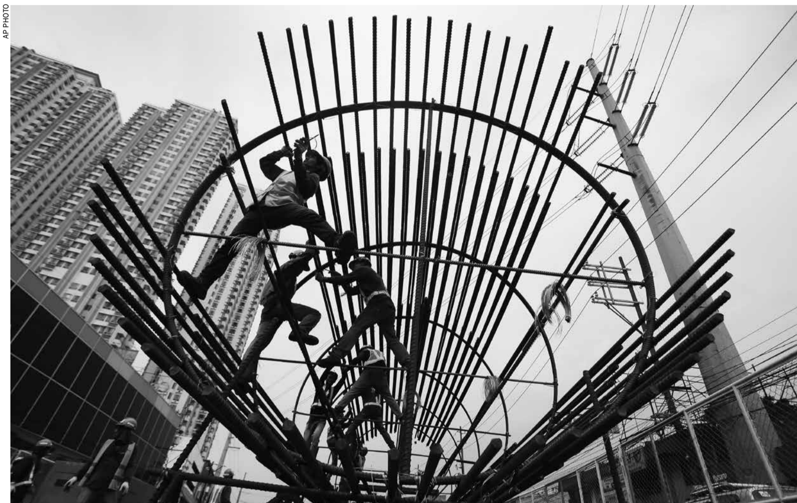
Filipino workers arrange metal rods at a government road project in suburban Quezon City, north of Manila, Philippines