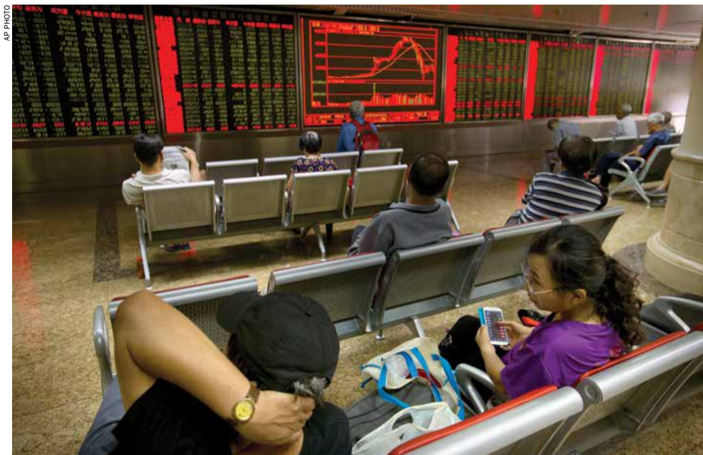
Chinese investors monitor displays of stock information at a brokerage house in Beijing