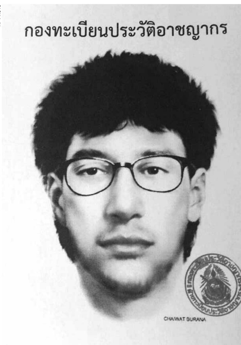
This image released by the Royal Thai Police yesterday shows a detailed sketch of the main suspect in the bombing

security footage appears to show two possible accomplices who are also considered suspects.