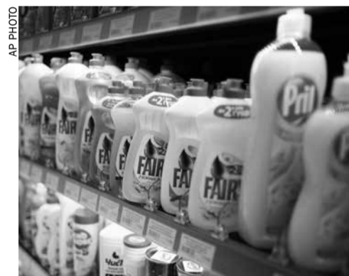
Foreign-branded detergents are seen on the shelves of a hardware store in Moscow

of detergent and washing liquid and most of the producers mentioned by the agency have production facilities in Russia. The companies listed by the consumer protection agency have not immediately reacted to the allegations.