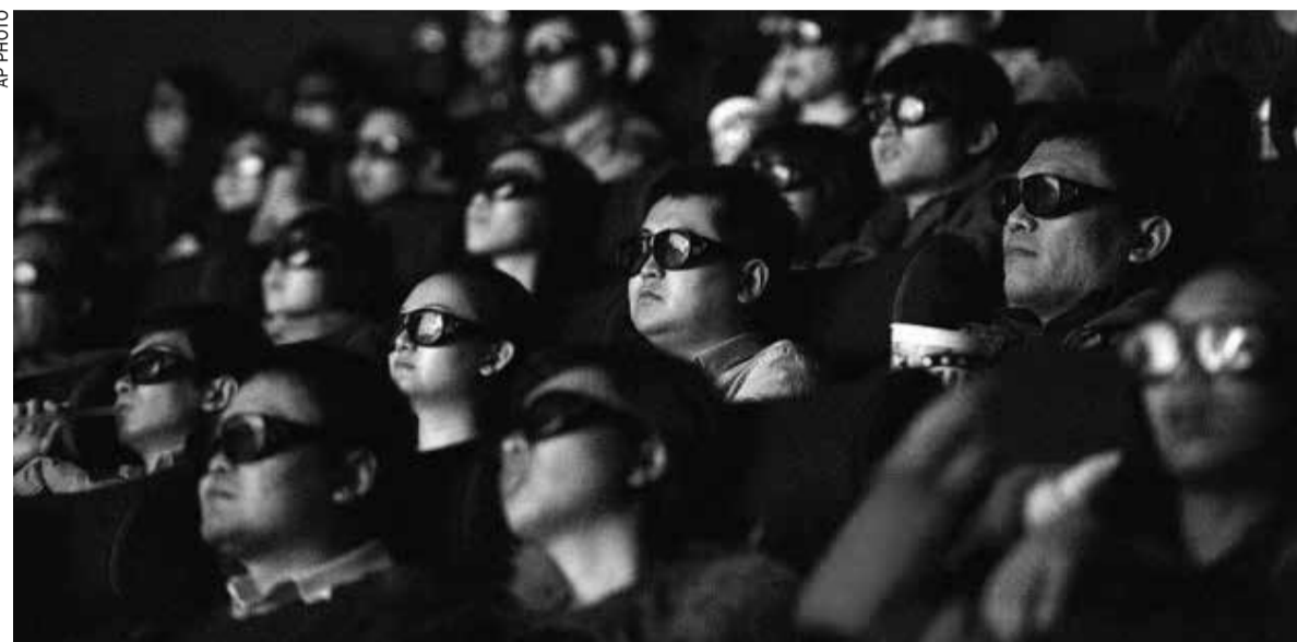
Chinese filmgoers wearing 3D glasses watch a movie at a cinema in Shijiazhuang city, north China's Hebei province

Time Warner Inc.'s Warner Bros. and other Hollywood studios are seeking to expand in a country that is expected to become the world's biggest market for film entertainment, even as its economy is slowing. Last year, box office receipts surged 34 percent to USD4.8 billion, while the U.S./Canada