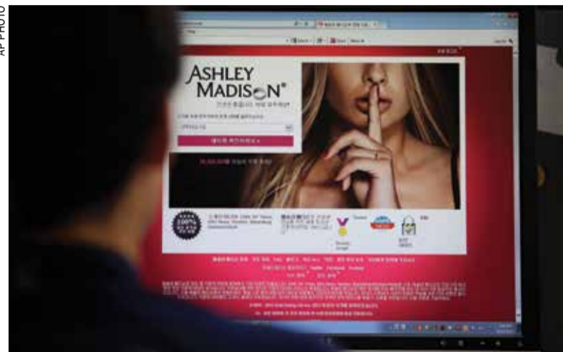
Ashley Madison's Korean website is shown on a computer screen in Seoul

sibility for the break-in had accused the website's owners of deceit and incompetence, and said the company refused to bow to their demands to close the site. The hackers referred to themselves as the Impact Team.