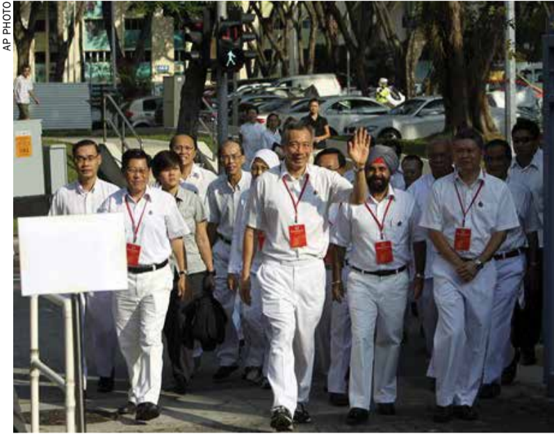
Singapore's Prime Minister and Secretary General of the ruling People's Action Party Lee Hsien Loong, fifth right, arrives with his party members at a polling station on Saturday May 7, 2011 in Singapore

The party usually fields groups led by senior, popular members of Parliament. The system has helped the PAP maintain a commanding majority, even though it received just 60 percent of all votes in