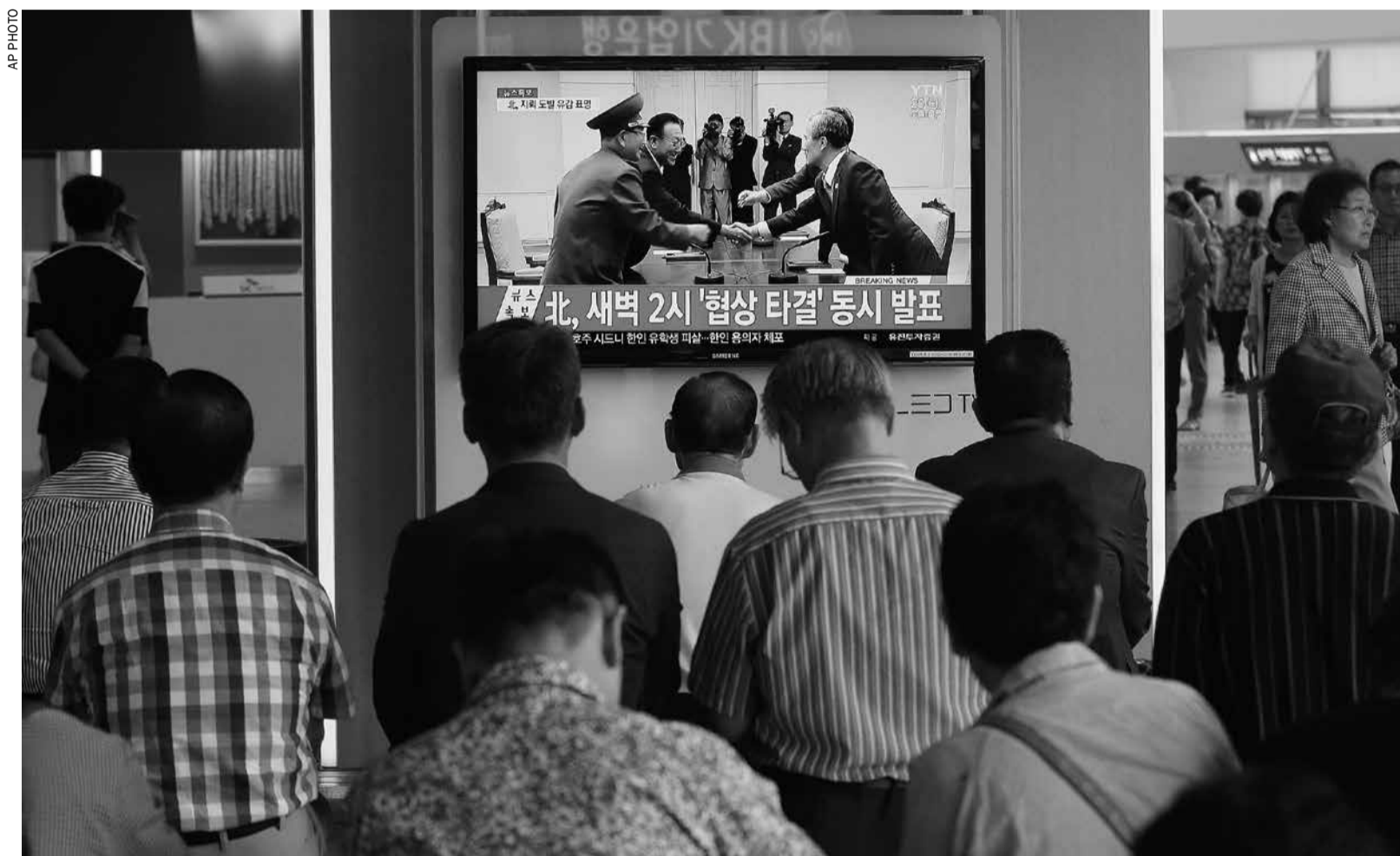
People watch a TV news program reporting that South and North Korea reached an agreement, at the Seoul Railway Station, South Korea

While the declaration was largely a matter of rhetoric — the