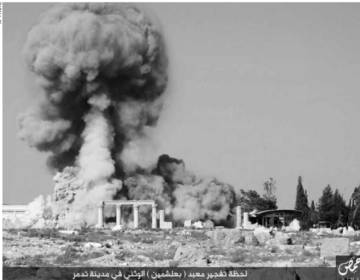
This undated photo released yesterday on a social media site used by Islamic State militants shows smoke from the detonation of the 2,000-year-old temple of Baalshamin in Syria's ancient caravan city of Palmyra