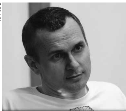
Oleg Sentsov sits behind glass in a cage at a courtroom in Rostov-on-Don