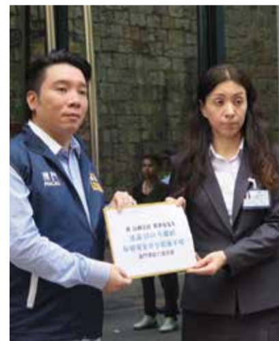
A group member hands over petition to a gov't official