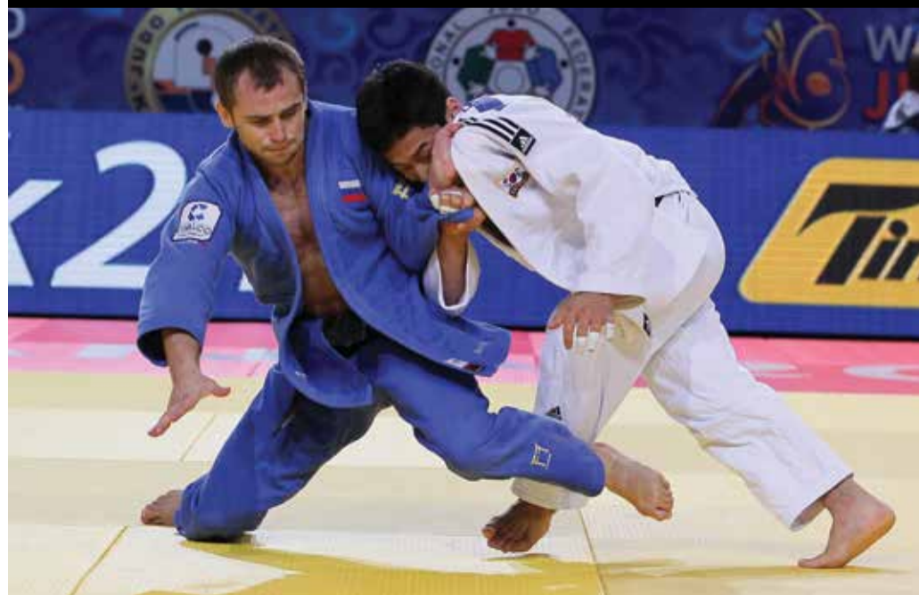
Judo worlds. South Korea's Baul An, right, competes against Russia's Mikhail Pulyaev, in the men's 66 kg final at the World Judo Championships in Astana, Kazakhstan, yesterday. South Korea's Baul An won the gold medal.