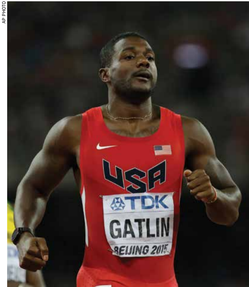
United States' Justin Gatlin

In 2011 and 2012, the Court of Arbitration for Sport delivered a pair of decisions that spiked an International Olympic Committee rule banning anyone who'd served a doping suspension of longer than six months from competing in the next Olympics. Those decisions sparked debate about whether a lifetime ban should be in or-