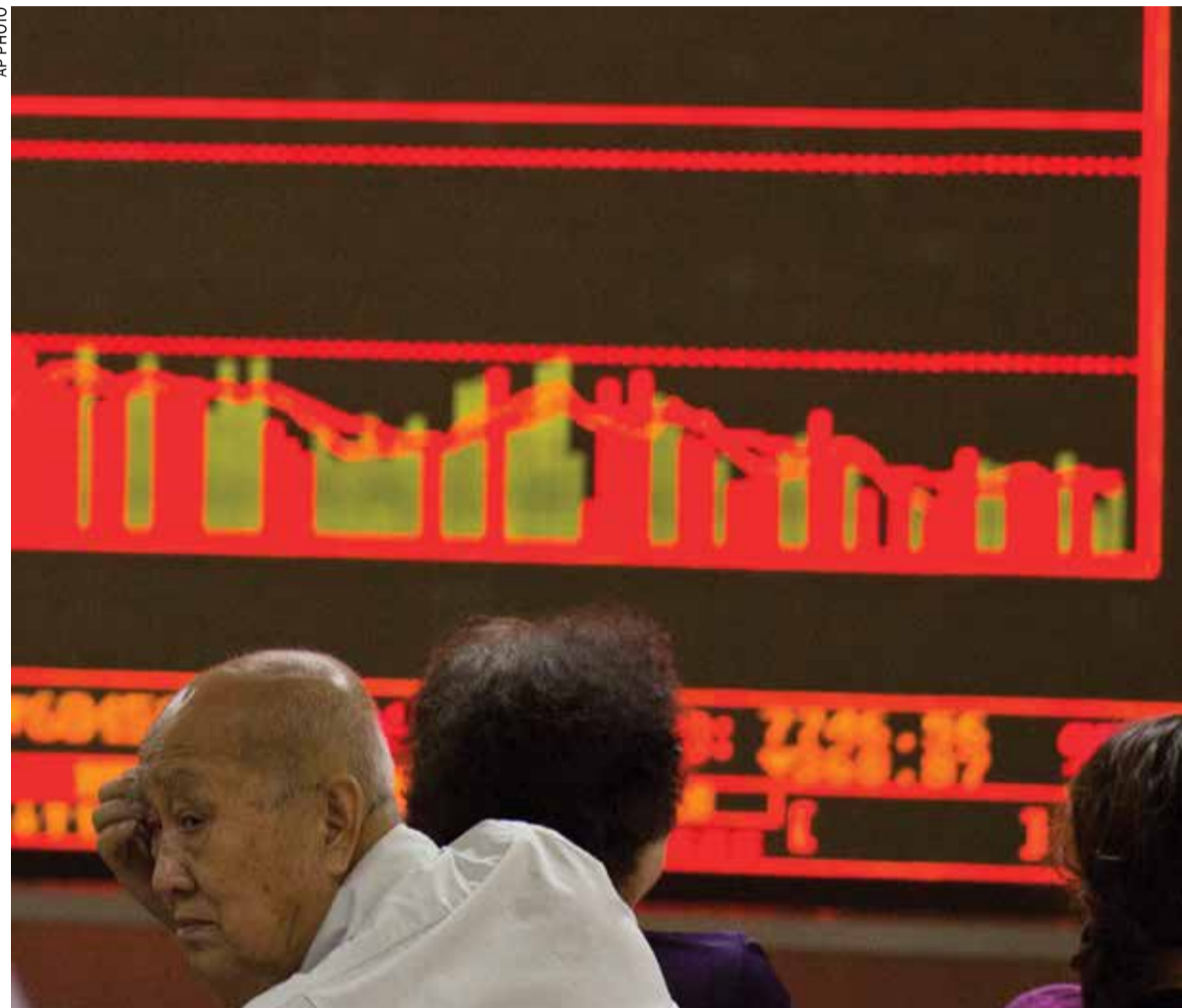
Investors monitor stock prices at a brokerage in Beijing

more than $400 billion to purchase stocks, banned selling by major shareholders and told state-owned companies to buy equities.