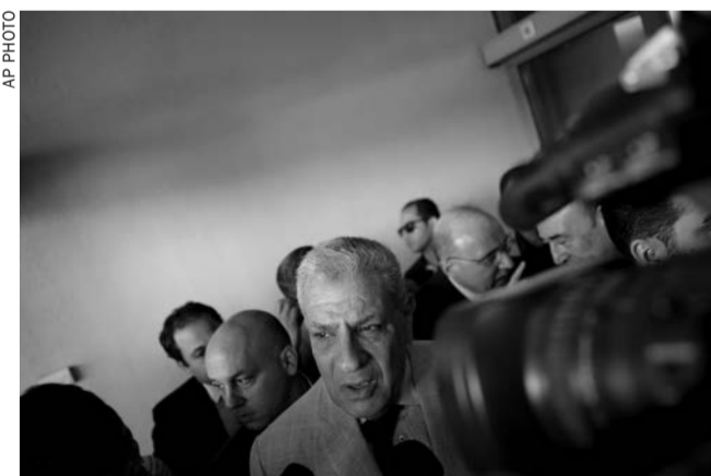
Acting Egyptian Prime Minister Ibrahim Mehleb speaks to journalists after his visit to injured Mexican tourists at the Dar Al Fouad Hospital in Cairo