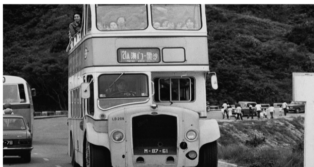
A double-decker bus in Macau, circa 1970

His suggestion, which was made Sunday after a forum exploring bus service quality, attracted favorable comments