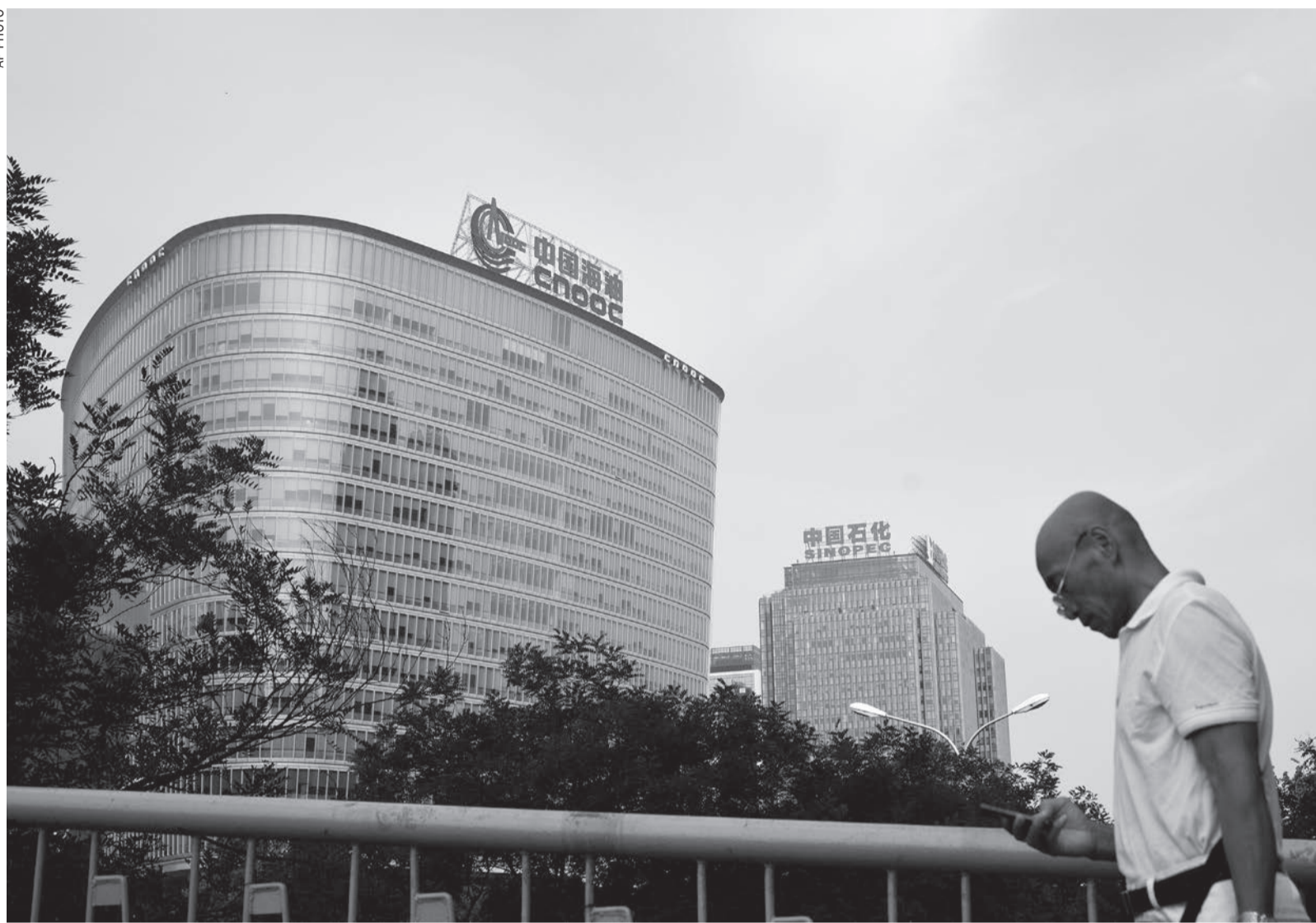
A man checks his mobile phone as he walks by buildings of China's state-owned companies, China National Offshore Oil Corp. (CNOOC), left, and China Petroleum & Chemical Corp. (Sinopec), in Beijing