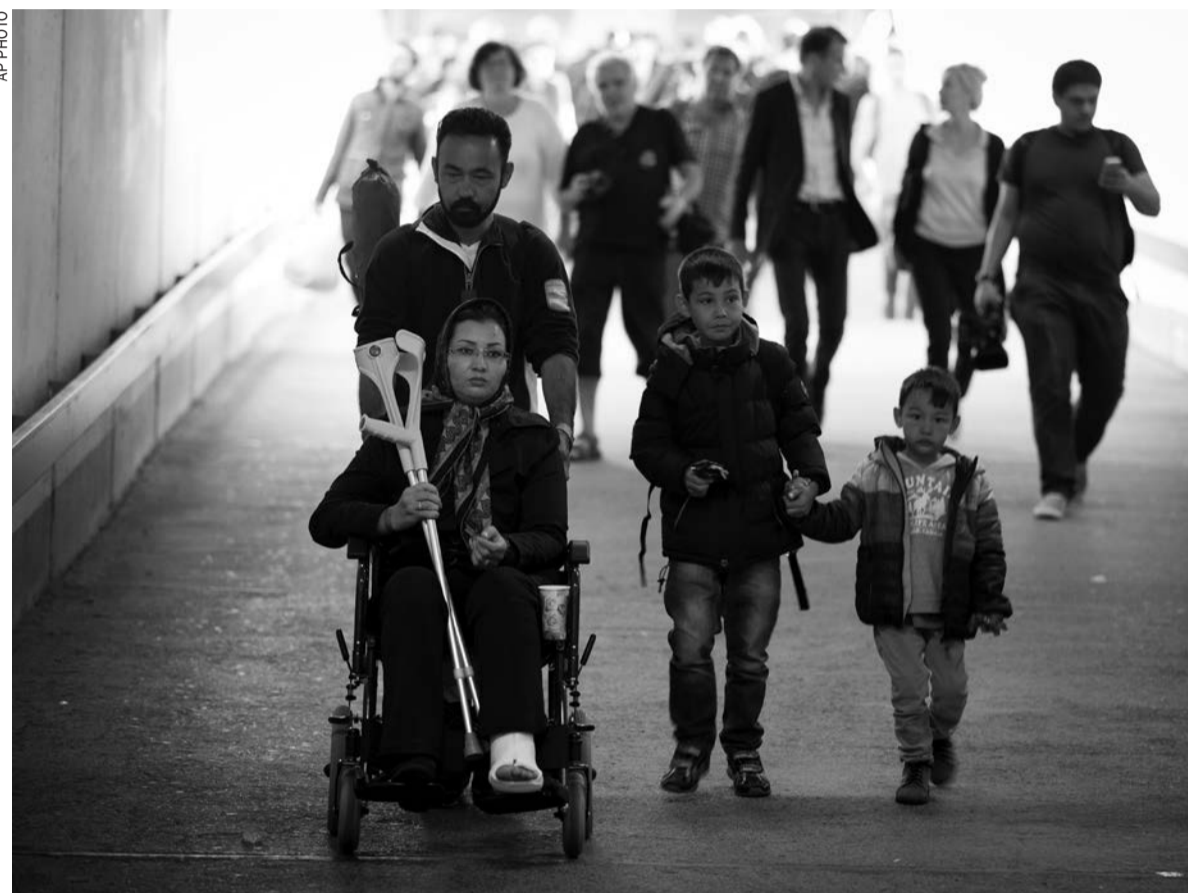
Migrants arrive from Munich at Schoenefeld train station near Berlin

The arrival of around 500,000 migrants so far this year has taken the EU by surprise — and Germany warned yesterday those figures would