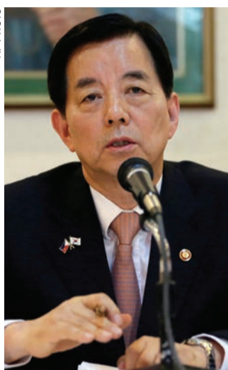
South Korean Defense Minister Han Min-koo

About 50,000 Filipinos live and work in South Korea, and a few are in the North. About a tenth of the Philippines' more than 100 million people have left the poor Southeast Asian nation in search of better