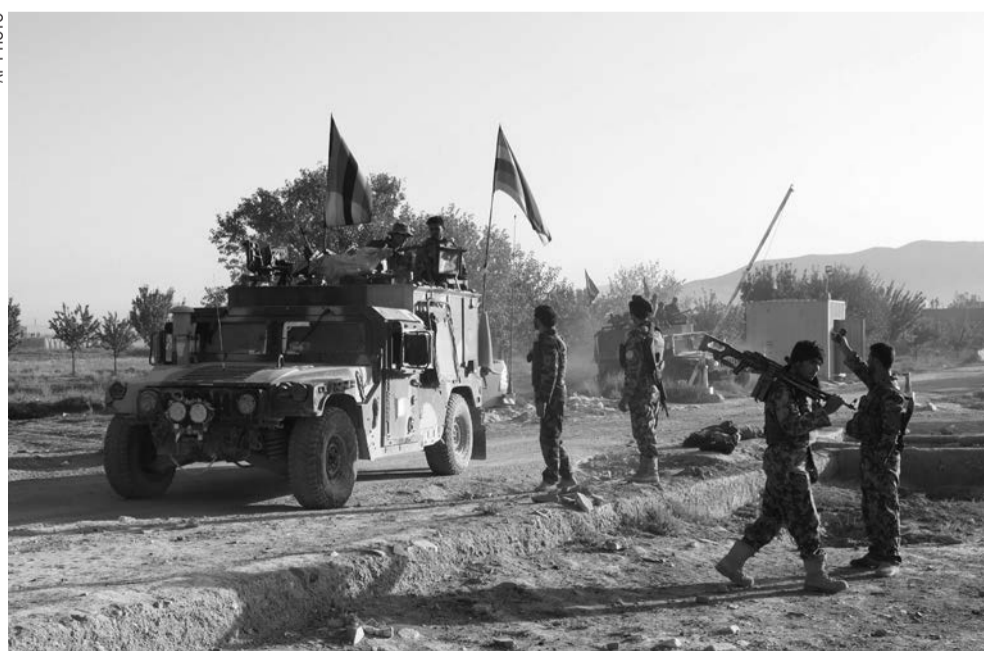
The Afghan national army stands guard near the dead body of a Taliban attacker in front of the main prison building after an attack in Ghazni province

"At least 148 of the escaped inmates are considered to be a serious threat to national security," the Interior Ministry statement said, adding that three of the escaped prisoners have been recaptured so far.