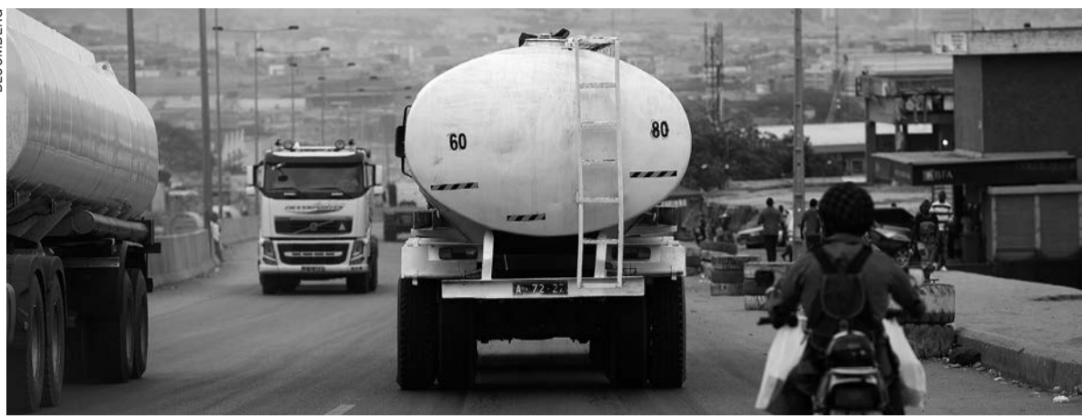
Oil tankers pass along the road towards the capital Luanda, Angola

French bank Société Générale calculations cited by the Portuguese weekly suggest the sale will eventually be made for around 2 billion euros. MDT/Macauhub