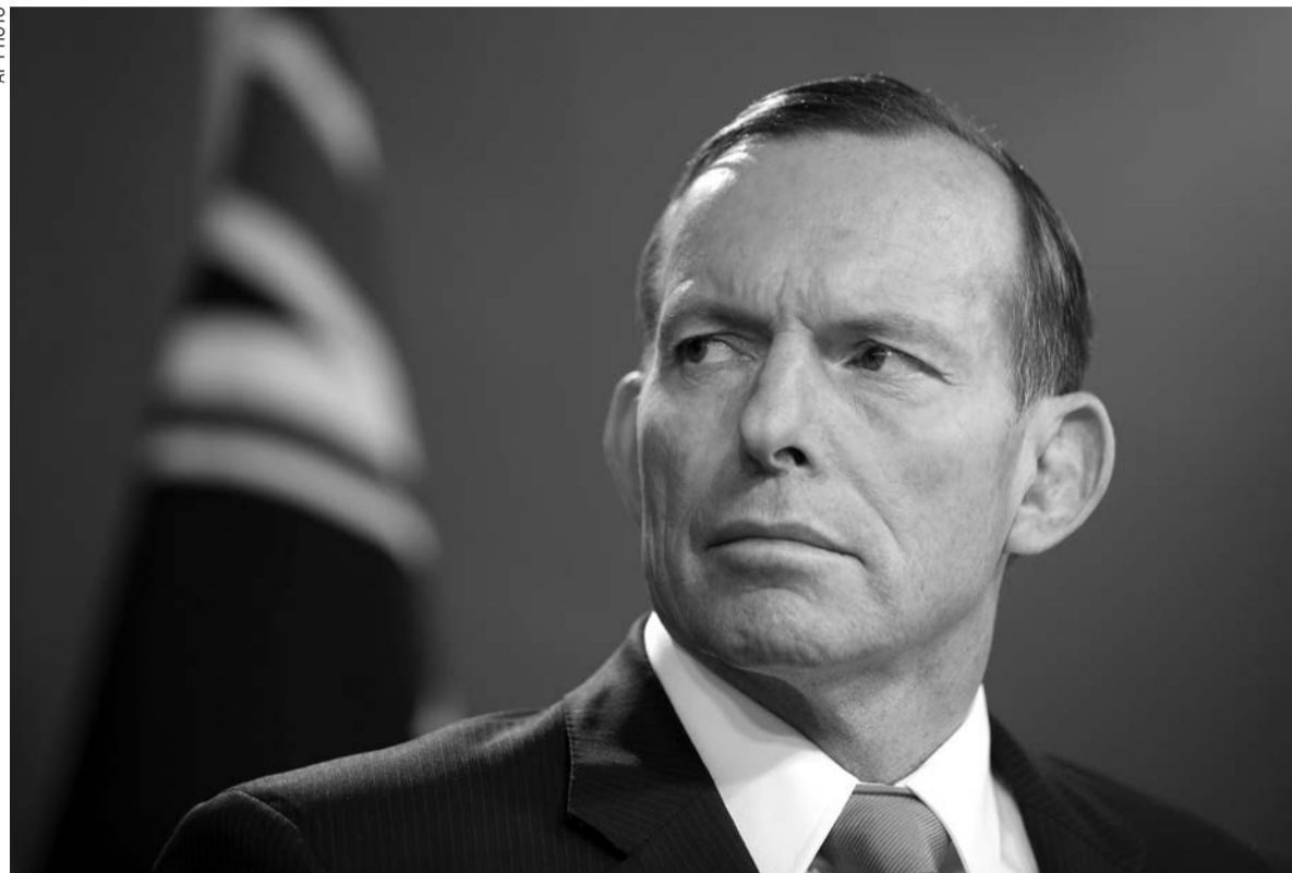
Australian Prime Minister Tony Abbott speaks during a press conference, in Sydney

Mathias Cormann, Defense Minister Kevin Andrews and Employment Minister Eric Abetz among ministers who publicly supported Abbott against the Turnbull challenge.