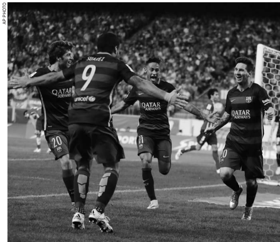
Barcelona's Lionel Messi, right, celebrates with team mates after scoring during a Spanish La Liga soccer match between Atletico Madrid and Barcelona at the Vicente Calderon stadium in Madrid

While City leads the early Premier League table, Chelsea has opened its title defense with three losses in five games. Failure to beat Macabbi Tel Aviv on Wednesday would heighten the sense that Chelsea's slump is more than a blip.