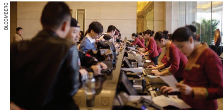
Guests are served at a check-in counter in the Galaxy Macau lobby

H OTEL sector revenues amounted to MOP27.87 billion in 2014, up by 10.2 percent year-on-year, according to an annual survey released by the Statistics and Census Service (DSEC).