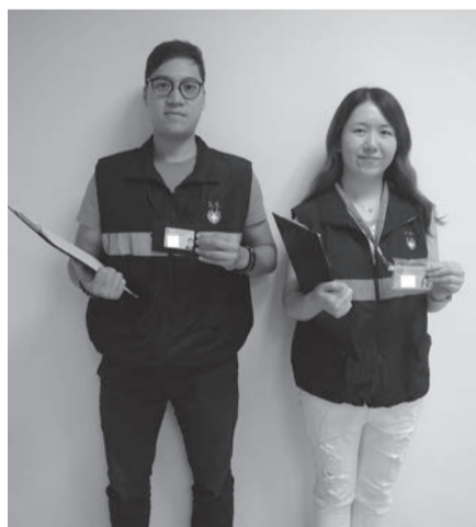
Health Bureau surveyors

In the article titled "Ascott luxury serviced apartments open," published in the Times yesterday (page 2), we incorrectly stated that the property would be officially inaugurated on September 14. Ascott Macau will in fact be inaugurated on Monday, September 21. MDT apologizes for the mistake.