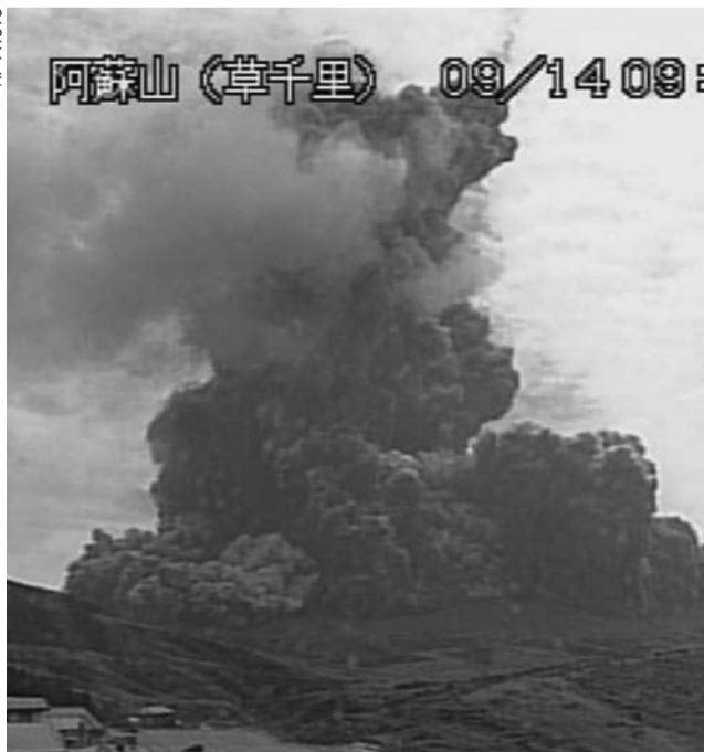
In this image taken from a surveillance camera observed from Kusasenri and released by the Japan Meteorological Agency, a column of black smoke rises from Mount Aso, Kumamoto prefecture

told NHK. "The most important thing is to stay out of the danger zone."