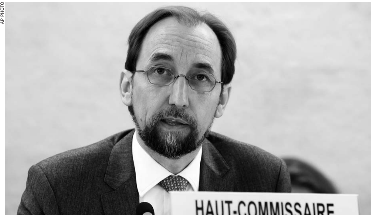
UN High Commissioner for Human Rights, Zeid Raad al-Hussein of Jordan speaks during the opening of the 30th session of the Human Rights Council in Geneva, Switzerland

Several countries, he said, appear to be "engaged in a war on information, in which legitimate critics and journalists are