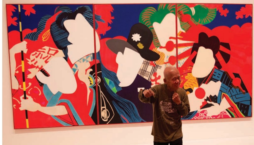
NY-based Japanese artist Ushio Shinohara, known for his performance boxing stroke style of painting, punches the air as he poses for photographs in front of his painting "Doll Festival" at the press launch of "The EY Exhibition: The World Goes Pop" at the Tate Modern gallery in London, yesterday. The exhibition opens to the public from Sept 17 to Jan 24.