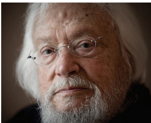
Painter Júlio Pomar

Jointly organized by the Cultural Affairs Bureau and Albergue SCM, the exhibition showcases the different phases of Pomar's artistic career. Thirty-one works by the artist and his contemporaries will be displayed, including famous oil paintings