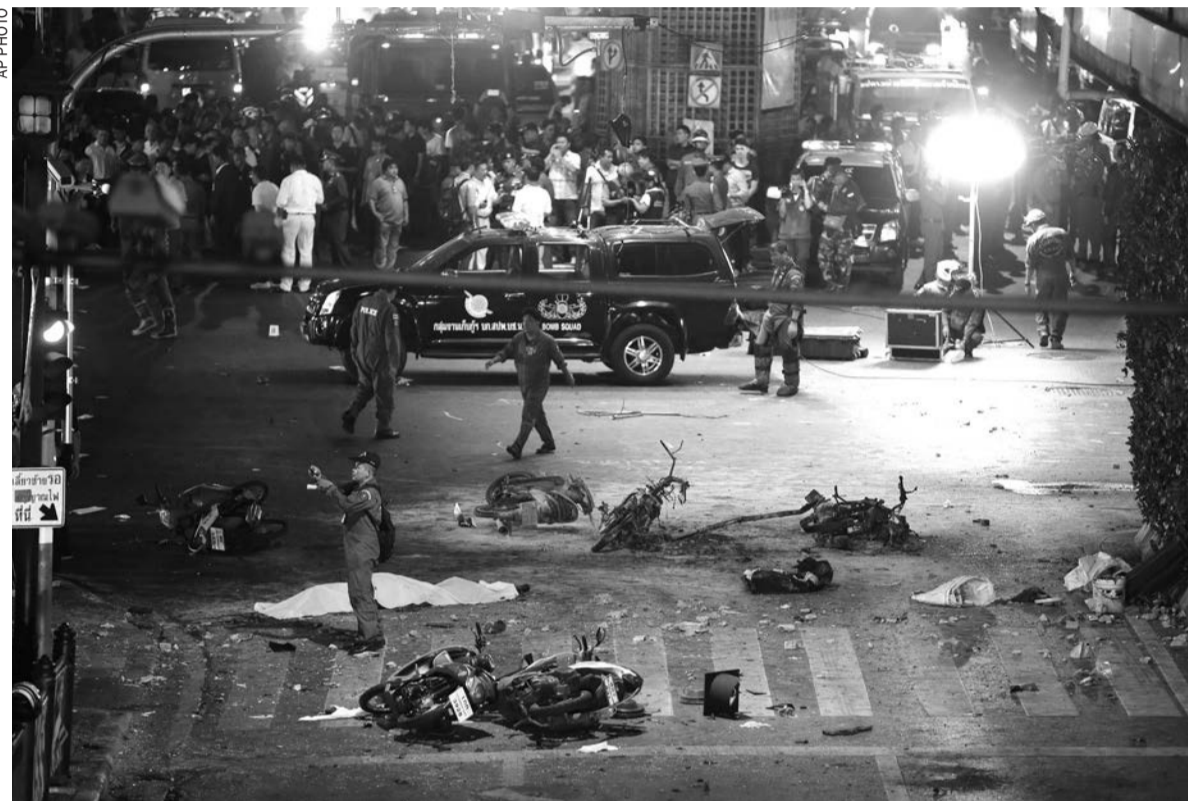
In this Aug. 17 file photo, a policeman photographs debris from an explosion in central Bangkok, Thailand

After weeks of demurring, Thailand has suggested that those behind the blast may have been from a gang invol-