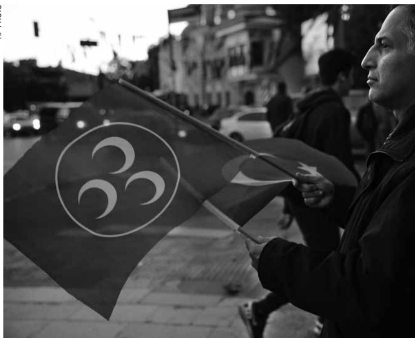
A supporter of Turkey's opposition Nationalist Action Party, (MHP), waves his party and nation's flags, in Istanbul

Turkey is a key U.S. ally in the fight against Islamic State and, since it hosts more Syrian refugees than any other nation in the world, a crucial player in efforts to end the