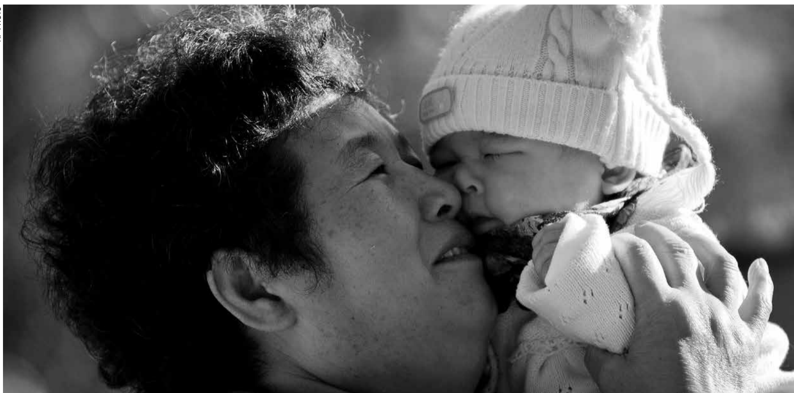
A Chinese woman plays with her grandchild at the Ritan Park in Beijing