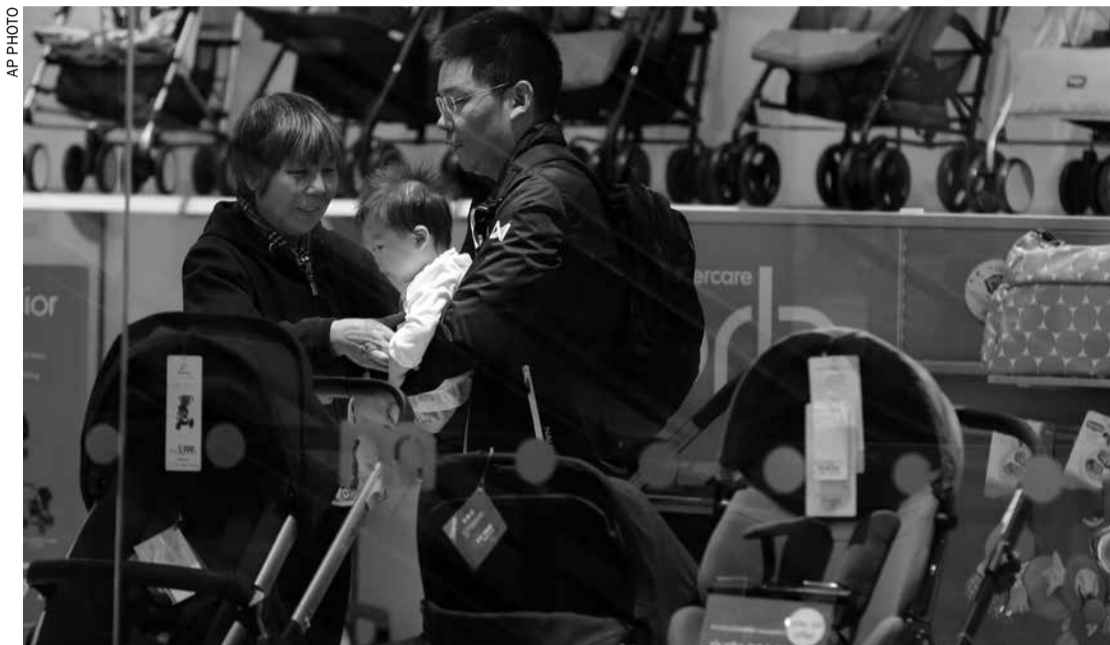
A man passes his child to his mother as they shop for baby stroller at a shopping mall in Beijing

The Credit Suisse report said that with the annual cost of raising a child estimated at 40,000 yuan (USD6,330), the extra births would translate into an extra 120-240 billion yuan ($19-38 billion) in consumer spending a year, or 4-6 percent of China's total retail sales.