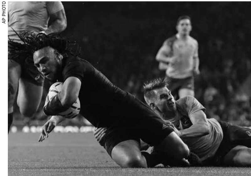
New Zealand's Ma'a Nonu scores a try during the Rugby World Cup final

"The relentless desire to be better, keep improving and add to the legacy of the All Blacks