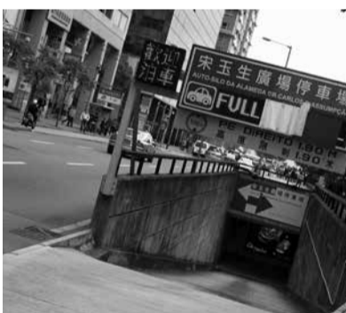
Street parking lot.

This initial phase will affect 11 parking lots located in the Central and NAPE areas: Nam Van (Pak Wu), Garden of Arts, Pak Lok (Ferry Terminal), Alameda Dr. Carlos d'Assumpcao, Pak Lek, Pak Leng, Pak Tou (ZAPE 15), Friendship Square, Ferreira do Amaral Square, Ho Yin Garden and the Malacca