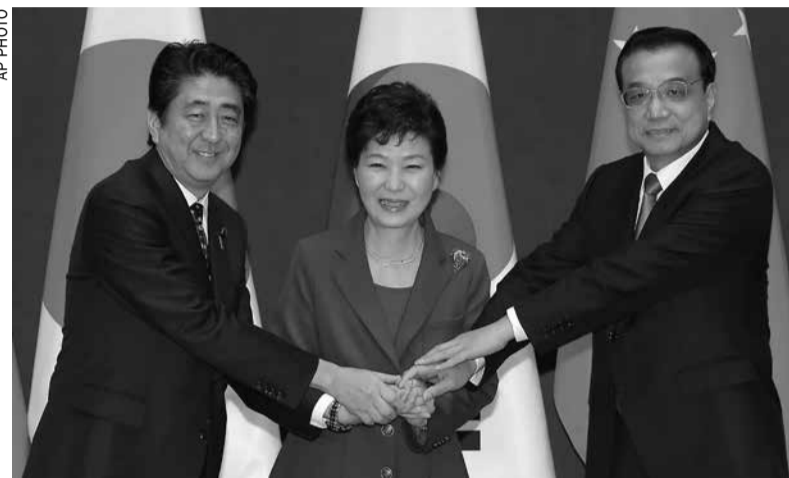
South Korean President Park Geun-hye, center, poses with Japanese Prime Minister Shinzo Abe, left, and Chinese Premier Li Keqiang, in Seoul

The countries also pledged to hold a leaders' summit every year and push to deepen their economic cooperation by accelerating free trade negotiations among themselves. They also