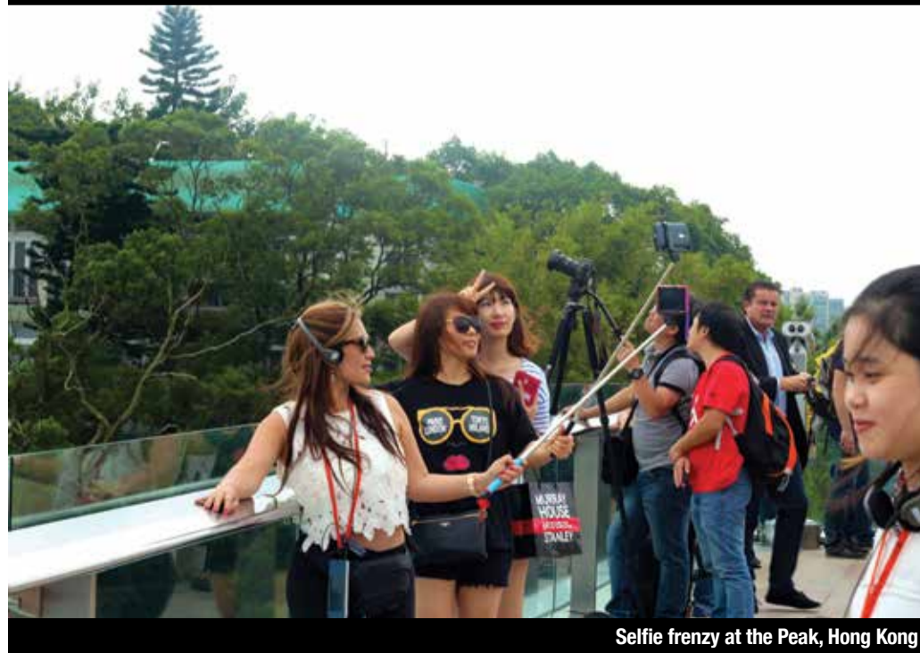
Selfie frenzy at the Peak, Hong Kong