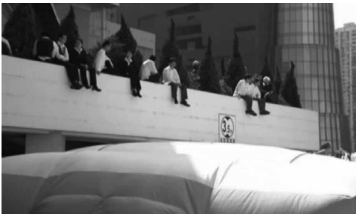
The protesting hotel staff climbed atop the edge of the property's balcony. The Fire Services Bureau installed a pneumatic cushion to prevent them from getting injured if they jumped

weeks. On October 18, some 30 employees from various departments, protested about unpaid wages. Some of the protesters accused their employer of "deliberately withholding payment," and claimed that they have had their pay refused for as long as eight months.