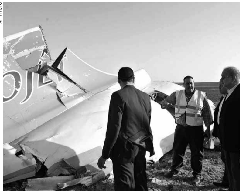
In this photo released by the Prime Minister's office, Sherif Ismail, right, looks at the remains of a crashed passenger jet in Hassana, Egypt on Saturday

The Egyptian Cabinet said yesterday that 163 bodies have so far been recovered and sent to morgues in Cairo. AP