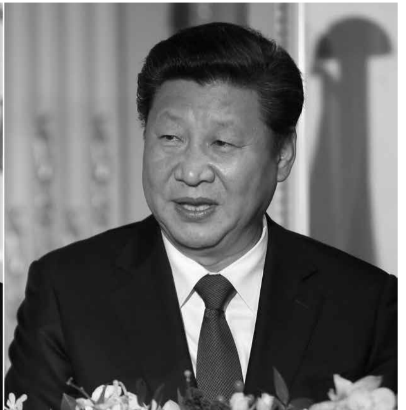
Taiwan's President Ma Ying-jeou, left, and China's President Xi Jinping

signed 23 deals covering mainly trade, transit and investment, binding Taiwan closer to its top trading partner and the world's second-largest economy.