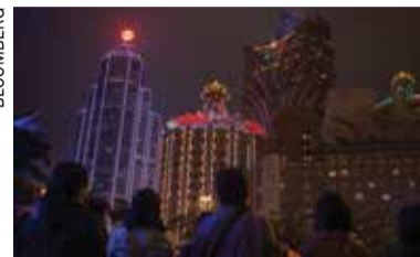
Pedestrians walk in front of the Bank of China building, left, and the Casino Grand Lisboa in Macau

MACAU has been ranked 11th for financial secrecy in an index published by the international NGO group, Tax Justice Network (TJN). According to the index, the operations of the territory's financial system are "exceptionally secretive," with the MSAR marked as secretive in 70 percent of the 15 indicators measured.