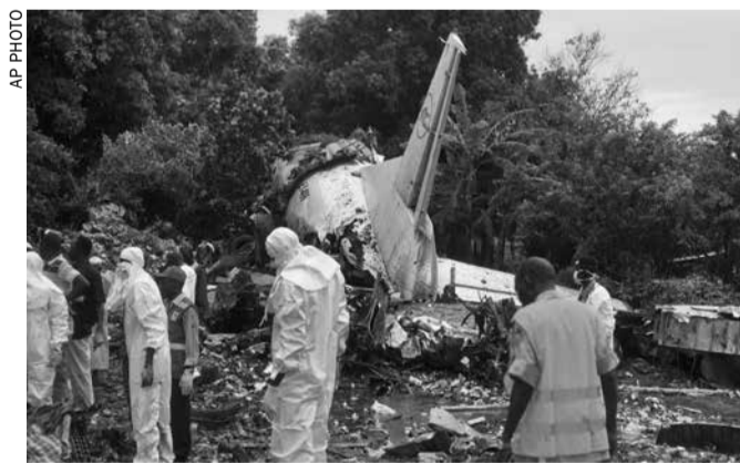
Responders pick through the wreckage of a cargo plane that crashed in the capital Juba

Romanians had also called for the resignation of Oprea over the on-duty death of a police motorcyclist, who died after he hit a hole on Oct. 20. He was in a motorcade easing a route in Bucharest for Oprea. AP