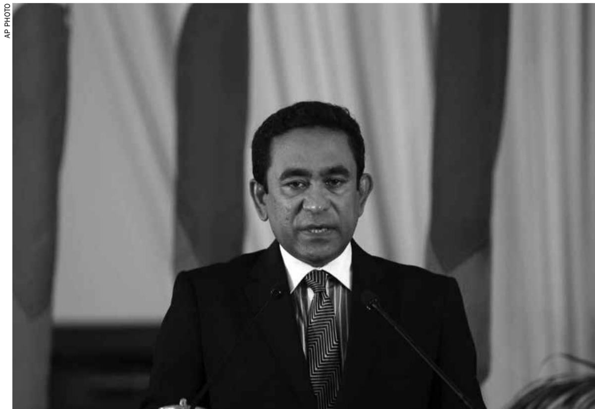
Maldives' President Yameen Abdul Gayoom

The declaration effectively thwarts plans by the main opposition Maldivian Democratic Party to hold a mass rally