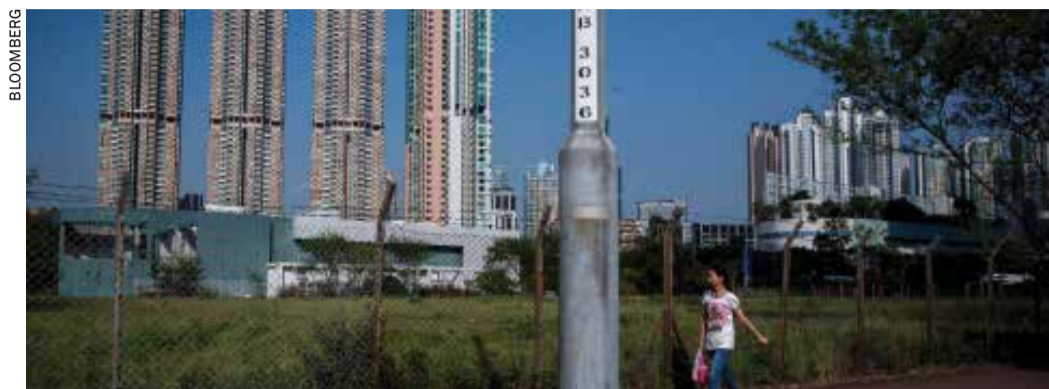
A pedestrian walks past residential buildings in the Tai Kok Tsui district of Hong Kong

An estimated 2.7 million households, about 18 percent of the population, are affected by the drought, according to the ministry of water and sanitation. The ministry declared the KwaZulu-Natal and Free State provinces as disaster areas and warned that rural communities in two more provinces face water shortages. South Africa's capital, Pretoria, also implemented water restrictions.