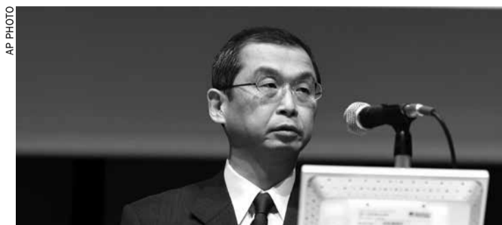
Japanese air bag maker Takata Corp. CEO Shigehisa Takada speaks at a press conference in Tokyo