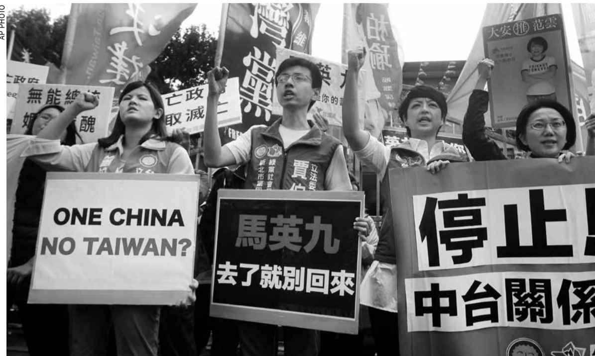
Opposition protesters shout slogans with placards opposing the planned meeting of Taiwan’s President Ma Ying-jeou with his China counterpart Xi Jinping in Taipei

Among Taiwan’s 23.5 million people, sentiment for unification with China is declining. Surveys show significant ma-