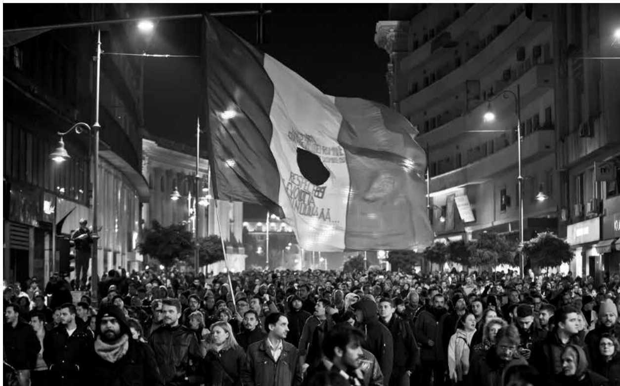
Romanians protest in Bucharest on Tuesday