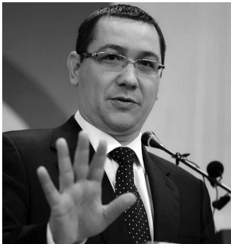
Prime Minister Victor Ponta