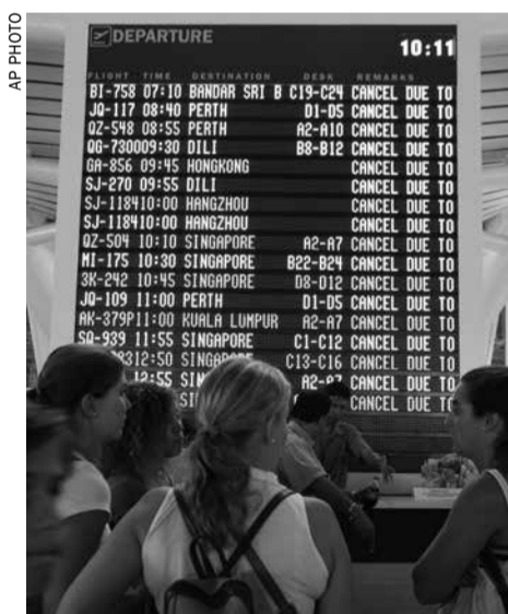
Passengers wait to check the status of their flights at Bali's airport

At Bali's airport, many travelers complained about a lack of informa-