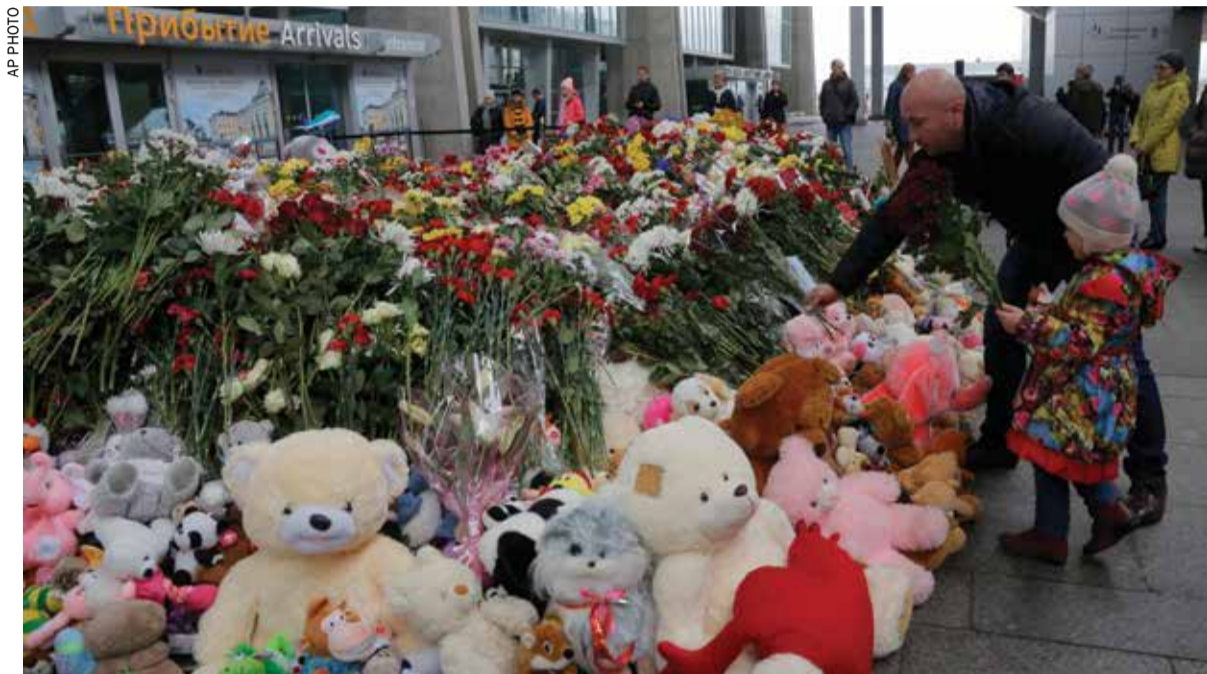
A man and his daughter put flowers and a toy at an entrance of Pulkovo airport outside St. Petersburg, Russia