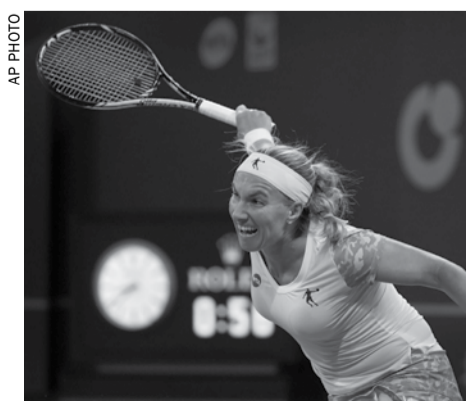
Svetlana Kuznetsova of Russia

In yesterday's other singles match, third-seeded Karolina Pliskova beat Jankovic 6-4, 3-6, 6-2. Pliskova will next meet Sara Errani in her final round robin match today in nearby Zhuhai. AP