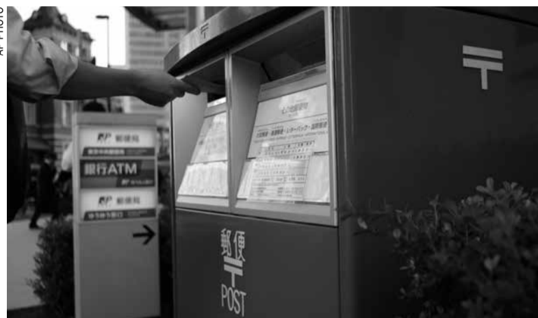
A man mails a letter into a mailbox in front of a post office in Tokyo

"Through privatization, we can play a role in revitalizing the Japanese economy," Japan Post president Taizo Nishimuro told reporters after ringing a