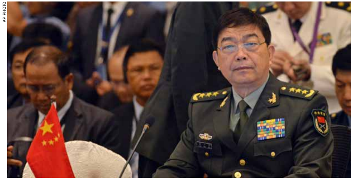
China's Defense Minister Chang Wanquan, right, sits before the start of the ASEAN Defense Ministers' Meeting Plus in Kuala Lumpur

Singapore Defense Minister Ng Eng Hen said that the dispute over the joint declaration