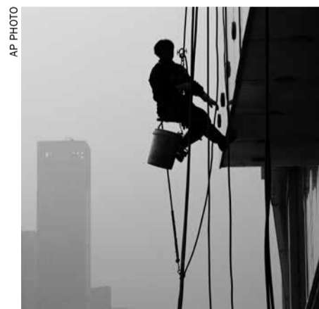
A worker is silhouetted as he cleans a window at a shopping mall in Beijing

China shares gained after a survey found that the country’s service industries strengthened last month. The Caixin/Markit purchasing managers index for October rose to