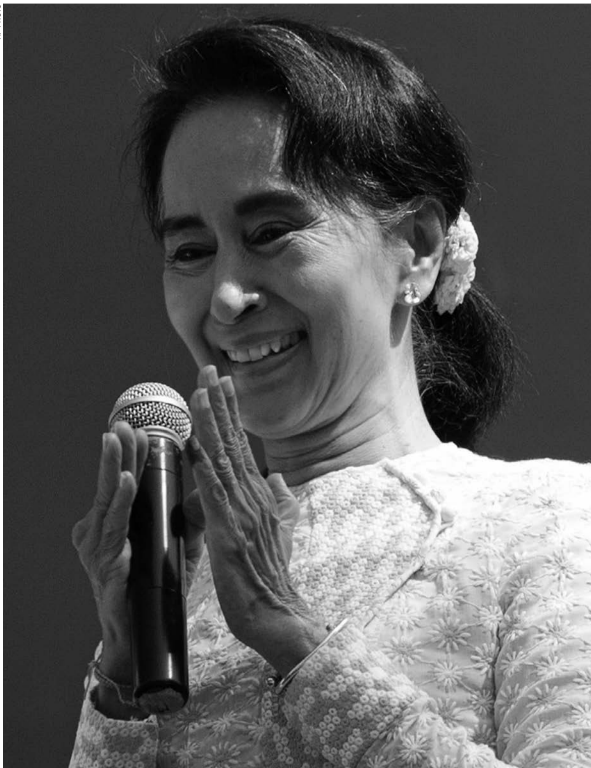
Leader of Myanmar's National League for Democracy party, Aung San Suu Kyi delivers a speech from a balcony of the NLD headquarters in Yangon

pected to finish with the largest number of seats in Parliament.