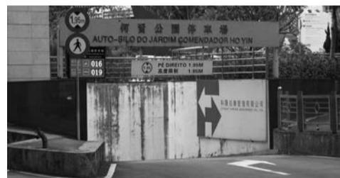
Comendador Ho Yin Garden car park

"We also need time to probe the incident thoroughly to see if it also requires criminal punishment," Lam Hin San said, pledging to transfer the case to related law enforcing departments if found criminally related.