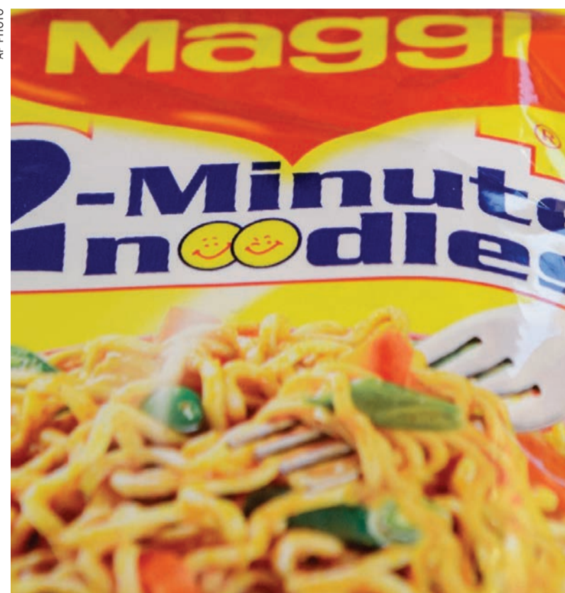
A packet of Maggi instant noodles is displayed

In June, India's Health Ministry ordered the removal of Maggi noodles from stores after tests by several states found high levels of lead. This was after the country's food safety regulator found that the noodles were "unsafe and hazardous" for consumption due to the presence of lead beyond