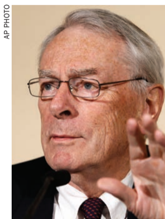
Canadian Richard Pound, Chairman of WADA's (World Anti-Doping Agency)

Pound said the doping could be called state-sponsored.