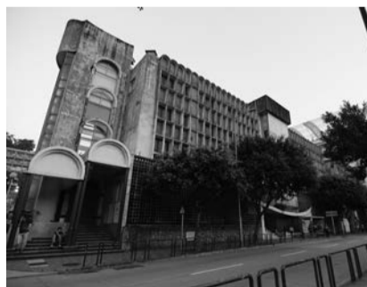
The former Hotel Estoril