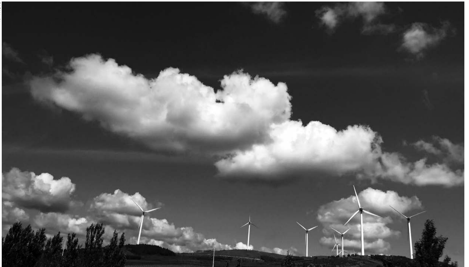
Wind turbines are built on a hill along a highway near Jiamusi, in northeastern China's Heilongjiang

on consumer spending and technology instead of trade and energy-hungry heavy industry.