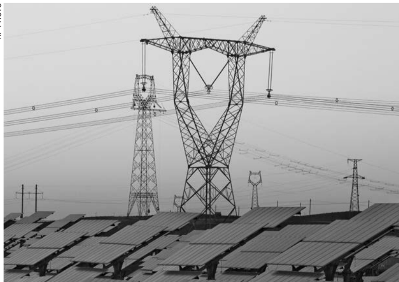
Solar panels are seen near the power grid in northwestern China's Ningxia Hui autonomous region