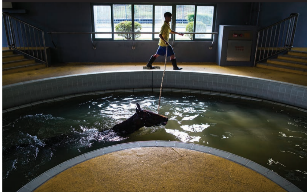
An employee guides a horse as it swims in an equine swimming pool at the Sha Tin Racecourse, operated by Hong Kong Jockey Club, in Hong Kong, on Wednesday, Oct. 28. The HK Jockey Club is the city's sole provider of horse racing, football betting and lotteries.