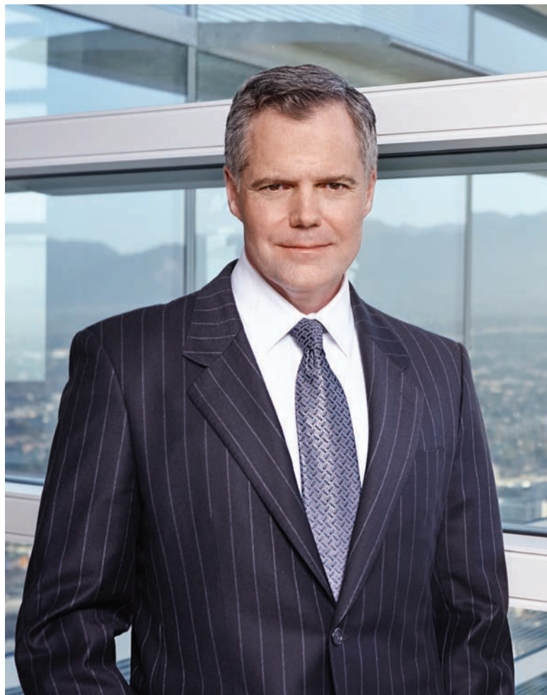
Jim Murren, CEO MGM Resorts

MDT - There's been a lot of talk and criticism about the balance of non-gaming and gaming. The government has put forward a plan that it clearly wants to have more non-gaming, diversification they call it: from Lawrence Ho who says there's no money in non-gaming to Steve Wynn who blasted the government for