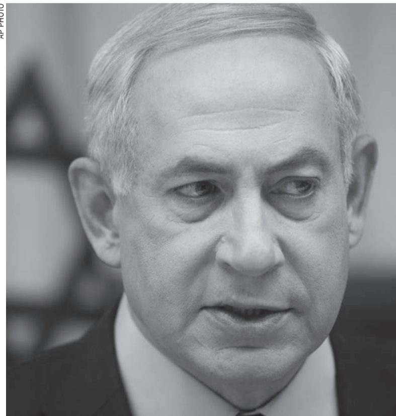
Israel's Prime Minister Benjamin Netanyahu

Netanyahu views Iran's nuclear program as an existential