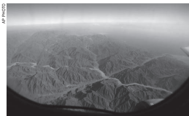
The mountains of south Sinai are viewed from the window during a flight to Cairo from Sharm el-Sheik, Egypt

"We need to ring the alarm bells, there's a significant increase in the level of risk," said Rizvan Kurbanov, a member of parliament for Dagestan, a North Caucasus region