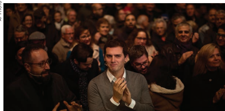
Ciudadanos party leader Albert Rivera applauds during an election campaign rally in Barcelona

That sort of combination could lead to a government that would try to roll back highly unpopular