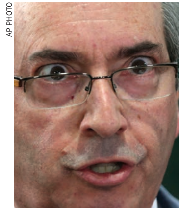
Brazil's Speaker Eduardo Cunha

B RASIL'S attorney general is investigating allegations that bribes were paid to a powerful lawmaker to help secure contracts for the building of venues and other works for next year's Olympics in Rio de Janeiro.