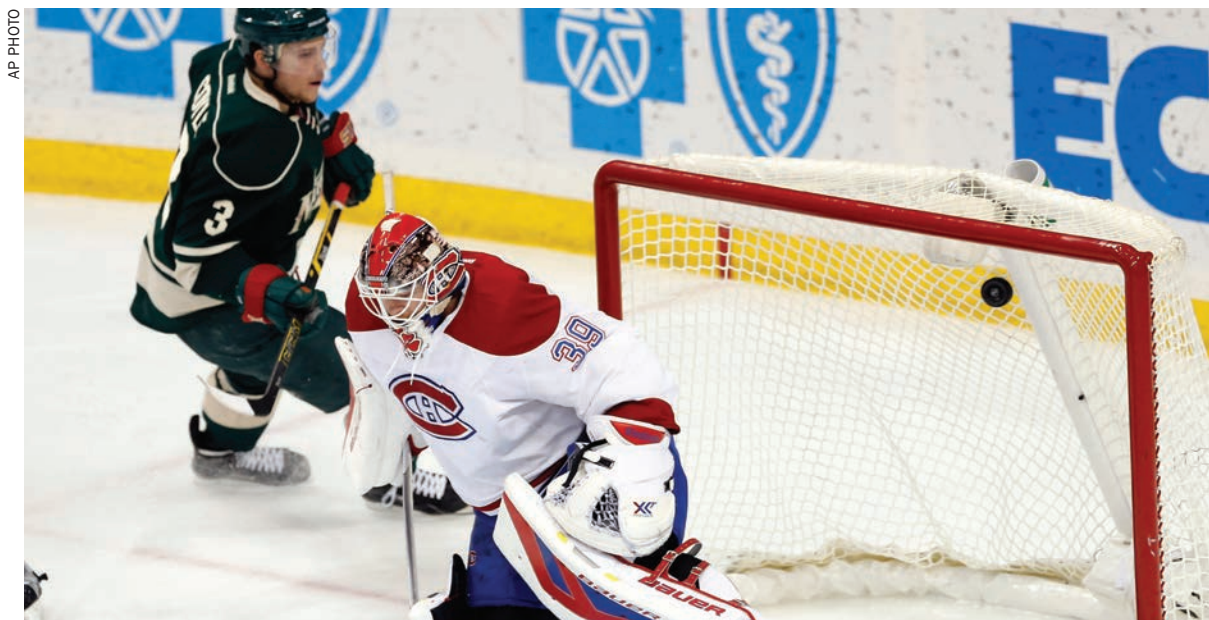
Montreal Canadiens goalie Mike Condon gives up a goal by Minnesota Wild's Charlie Coyle, left