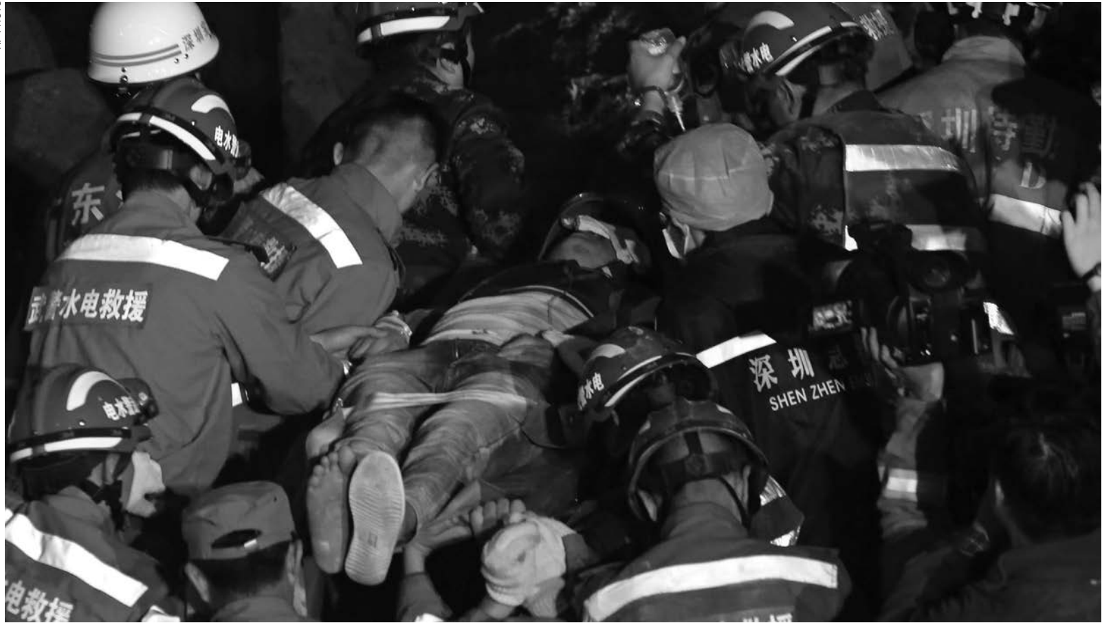
A survivor is rescued at the site of landslide at an industrial park in Shenzhen

sources has said a steep man-made mountain of dirt, cement chunks and other construction waste had been piled up against a 100-meter (330-foot)-high hill over the past two years.