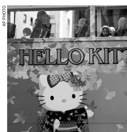
People ride on a sightseeing bus painted with a Hello Kitty character in Tokyo

Kids' technology maker VTech reported a data breach that exposed the personal information of 6.4 million children around the world as well as 4.9 million parent accounts they were connected to.