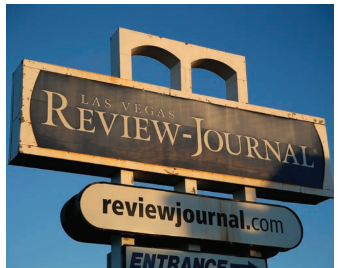
A sign for the Las Vegas Review-Journal is seen in Las Vegas

New Media Investment bought the newspaper in February from longtime former owner Stephens Media LLC for $102.5 million.