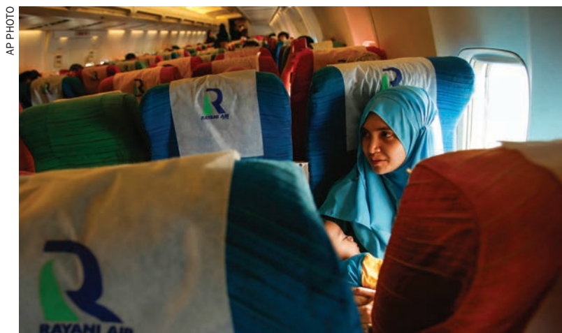
A Muslim woman passenger comforts her baby on board the Rayani Air after departure from Kuala Lumpur International Airport 2 in Sepang

The idea for Rayani Air grew out of much-publicized complaints by conservative Muslims who believed that two ma-