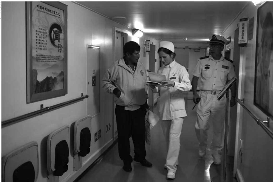
A nurse, talks with a patient in Chinese naval hospital ship in the port of Callao, Peru