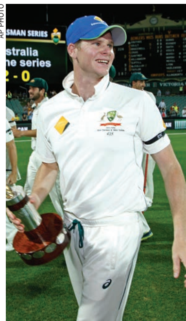
Australian captain Steve Smith

During the voting period from Sept. 18, 2014 to Sept. 13, Smith was the leading run-scorer in tests with 1,734 runs in 25 innings at an average of 82.57, including seven centuries.