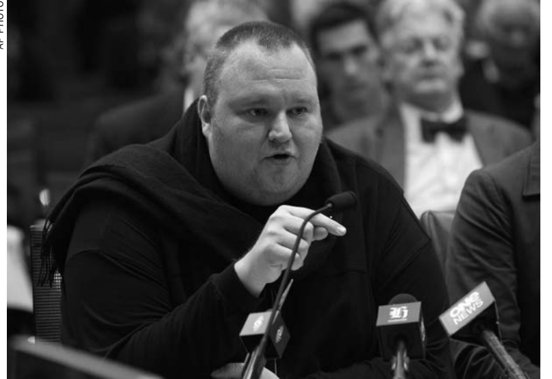
Internet entrepreneur Kim Dotcom

Born in Germany as Kim Schmitz, Dotcom has long enjoyed